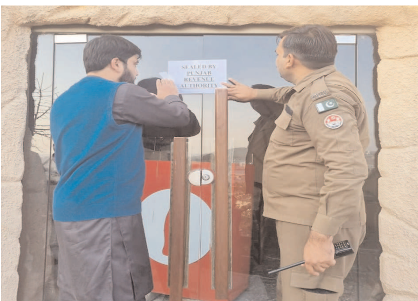
RAWALPINDI: Punjab Revenue Authority seals restaurant in Rawalpindi Phase-7 over non-payment of taxes.

Islamabad capital police is utilizing all available resources to facilitate the general public adding that the parents are also requested not to allow their underage children to drive bikes or cars till age of maturity, CTO maintained. The Chief Traffic Officer said that issuing traffic violation tickets is not as a punitive measure but the purpose is to ensure a safe road environment in the Capital and secure the lives of the people.