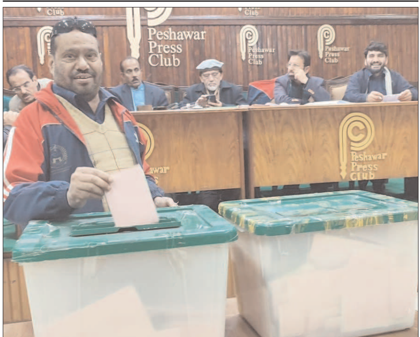
PESHAWAR: A voter casting his vote during Press Club elections.

Under five years plan back-lock cases are deciding on priority bases while 72% cases are concluded in half time of strategy to end the burden. In 2020 back-lock stand at two lac 19 thousand and 754 while now reduced to 47 thousand 299 which is 72% of the total pendency across Khyber Pakhtunkhwa.