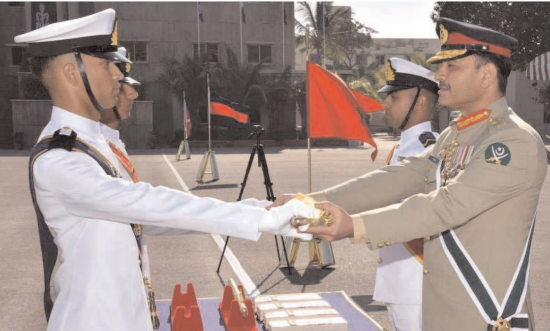
KARACHI: Commissioning Parade of 118th Midshipmen and 26th Short Service Commission held at Pakistan Naval Academy, COAS General Syed Asim Munir chief guest on occasion.

He also prayed for the freedom of Palestine and Indian Illegally Occupied Jammu and Kashmir. Paying tribute to the bereaved families of Shuhada, the prime minister expressed condolences and prayed for the high ranks of the departed souls.