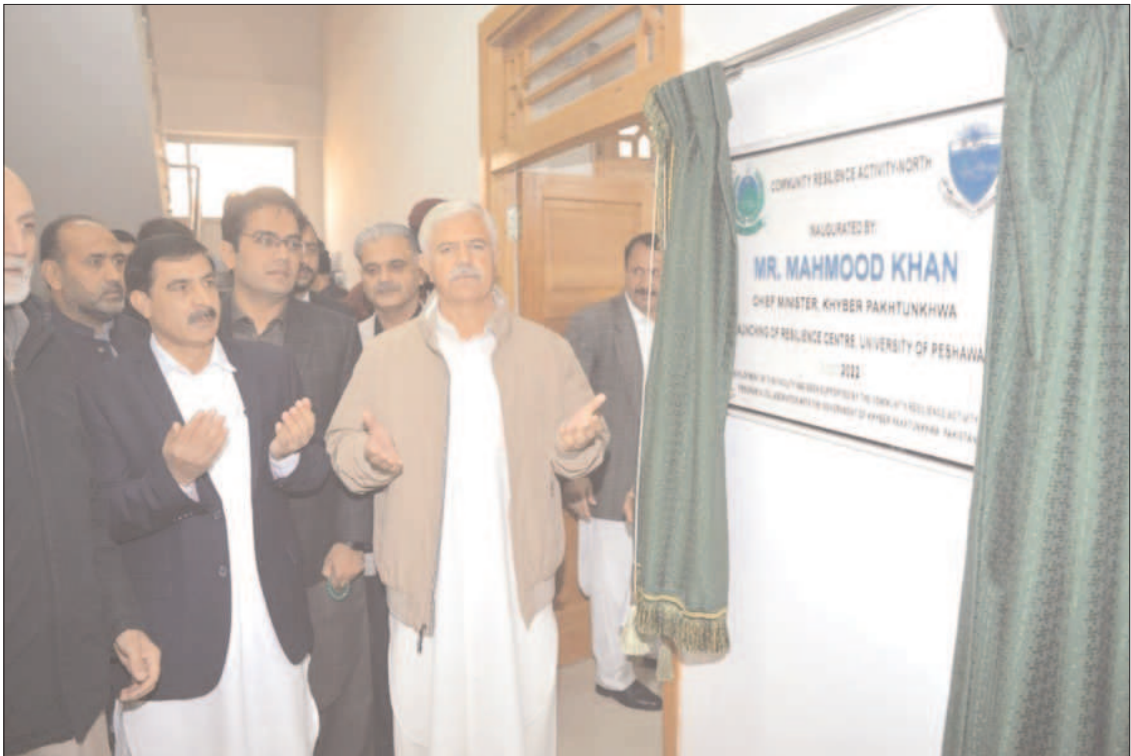
PESHAWAR: Chief Minister Khyber Pakhtunkhwa inaugurating Resilience Centre in University of Peshawar.