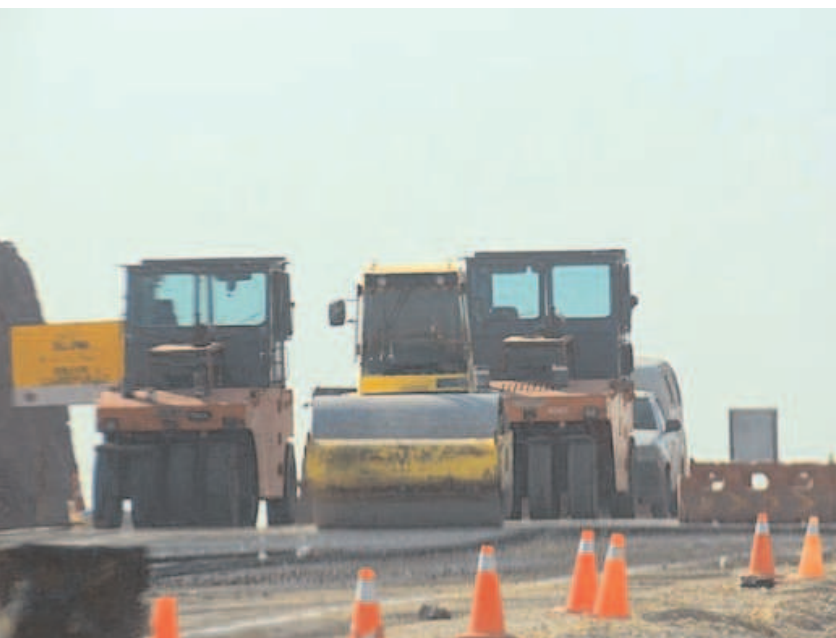
ISLAMABAD: Construction work of Margalla Road being carried out during development work.

She said it was time for the world to ensure that the Kashmiris get their long-denied right to self-determination, which was the only viable and agreed solution to the decades-long dispute.