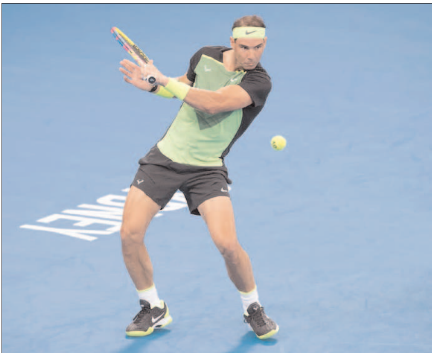
SYDNEY: Rafael Nadal of Spain competes against Cameron Norrie of Britain during day three of the 2023 United Cup.

"One thing is that our academies are not working for last eight months, it is important that we keep them running for our domestic and under-19 performers. I will try to start a camp there for all such youngsters," the chief selector added. He said Babar Azam is backbone of Pakistan team and selection committee is there to support him so that he can get more stronger in field. "I really his decision to give a target to New Zealand in the first Test," he added.