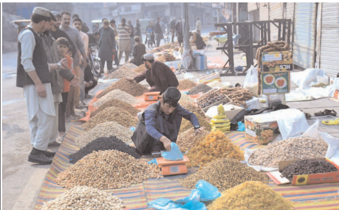
LAHORE: People purchasing dry fruits from roadside vendor.

He said that previously, foreign investors mostly poured money into the sectors which did not pose a risk to their profit margins due to rupee depreciation such as the power sector. It is hoped that Pakistan's economy will now gain growth momentum, which should encourage foreign investors to invest in new projects, he added.