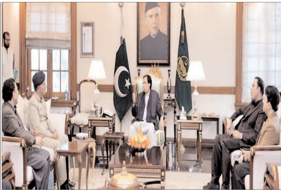
LAHORE: Chairman NDMA calls on Punjab CM Pervaiz Elahi.

LAHORE (APP): At least 10 people were killed while 1062 sustained injuries in 1011 road traffic accidents in Punjab during last 24 hours. Out of the total injured, 568 people were seriously injured who were shifted to different hospitals, whereas, 494 minor injured victims were treated at the incident site by rescue medical teams, said a spokesman for Rescue 1122 here on Saturday.