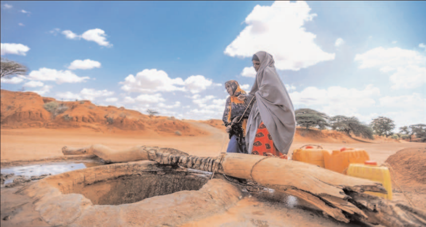
People in Mandera county, northwestern Kenya, struggle to find water for their animals during a severe drought.