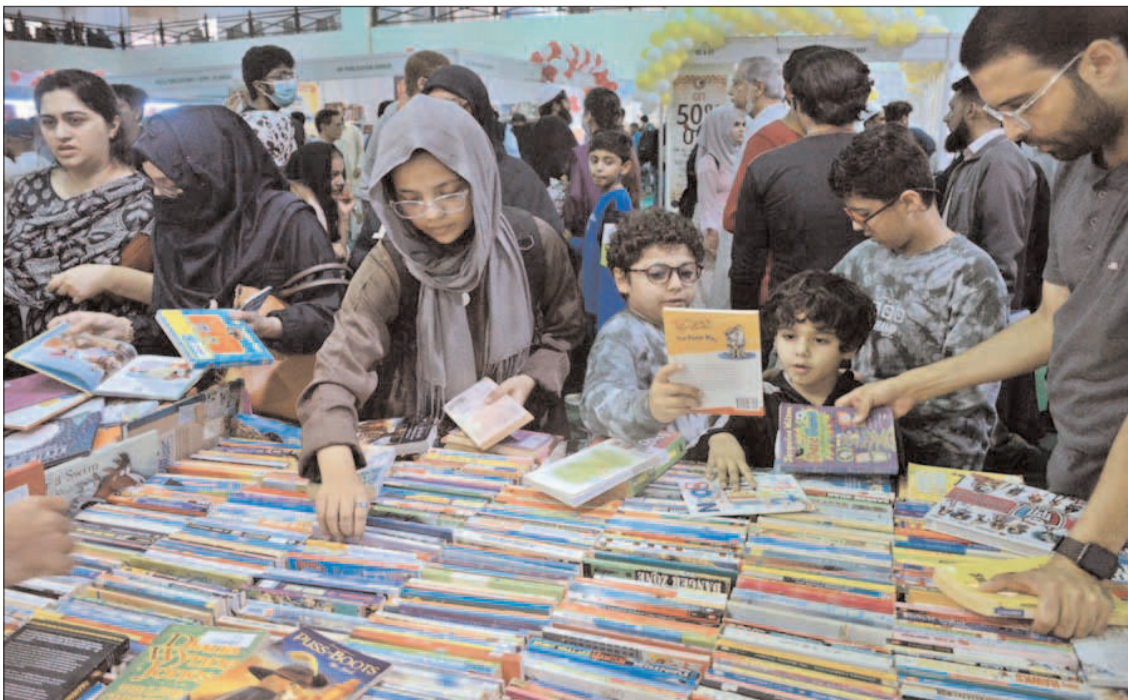
KARACHI: Families are busy in buying books of their interests from stalls in 17th Karachi International Book Fair organized by Pakistan publishers and booksellers association at Expo center.

Havoc has been wrought by collapsing bridges, falling roofs and walls that cave-in because it is not able to withstand the influx and magnitude of the gushing water that carries in it all forms of materials from stones, woods to heavy metals," she expounded.