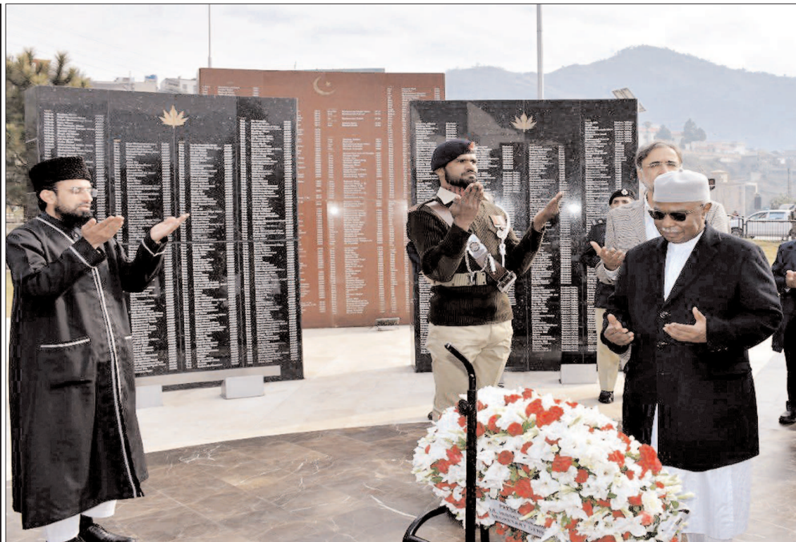
MUZAFFARABAD: OIC Secretary General Hussain Ibrahim offering dua after laying floral wreath at Yaadgar e Shuhada during his visit to Azad Kashmir.

Megrahi was jailed for life but was released on compassionate grounds by the Scottish government in 2009 after being diagnosed with cancer.