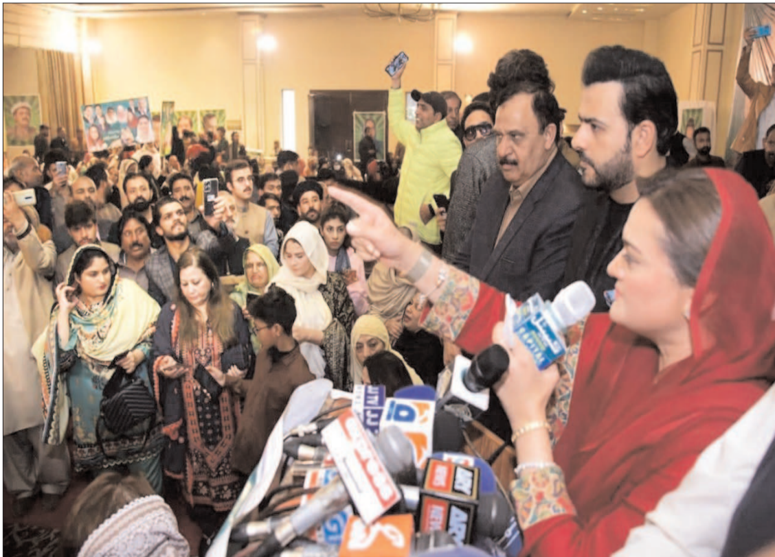
RAWALPINDI: Minister for Information and Broadcasting Marriyum Aurangzeb addressing PML-N's workers convention.

Despite Modi's government sanctions and curbs on freedom of expression, several Indian columnists were valiantly criticizing the Indian government and its terrible policies against Kashmiri people to suppress their voice but he would not succeed in the nefarious motives.