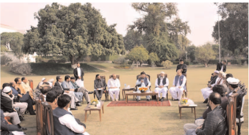
PESHAWAR: Delegation of Kohat Chamber of Commerce and Industry meeting Governor Khyber Pakhtunkhwa Mahmood Khan Haji Ghulam Ali.

The problems highlighted included the deteriorating water quality of the river and the decrease in river flow due to dams.