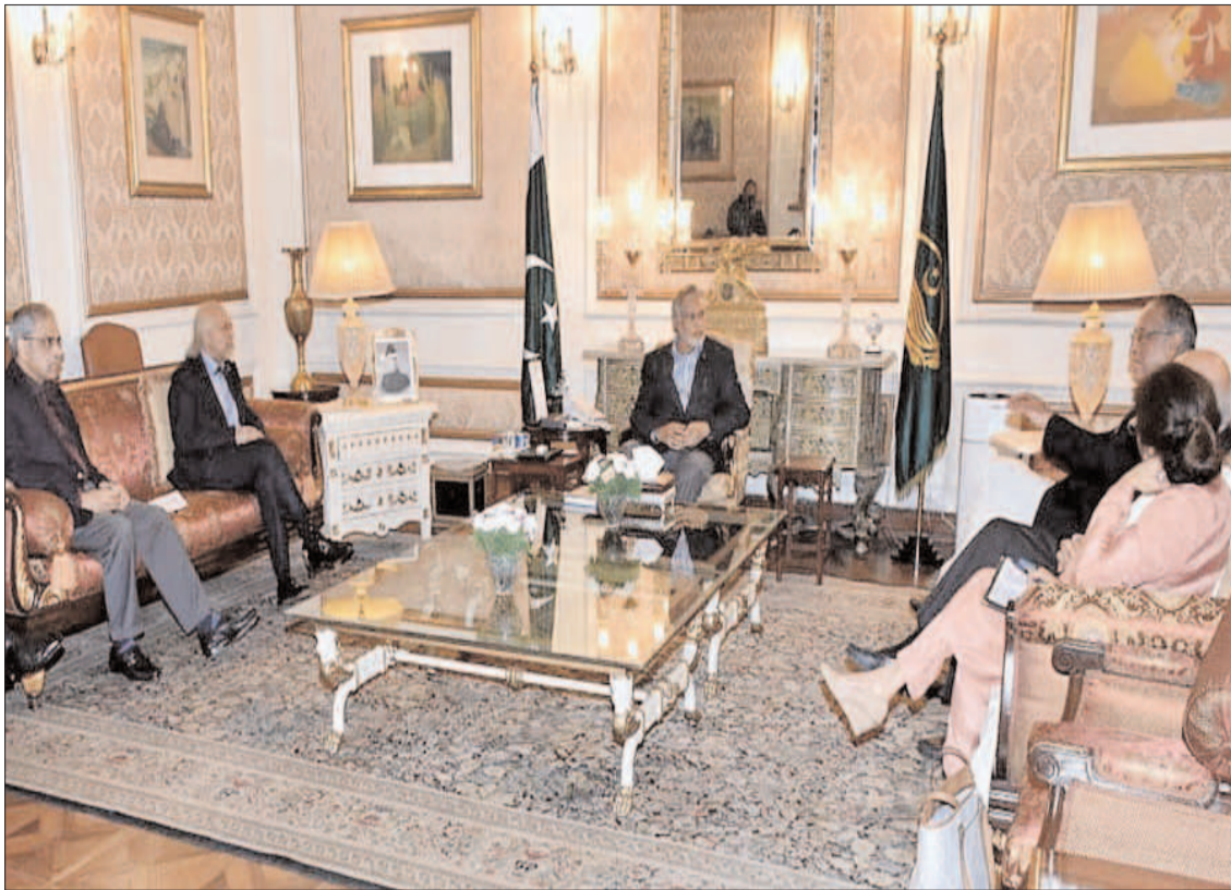
LAHORE: Finance Minister Ishaq Dar is meeting with Economists based in Lahore.

In response to a question, Farazur Rahman said that due to the increase in the value of the dollar, the effects of inflation have affected all sectors and commodities, similarly, books have also become expensive and are becoming out of the reach of the common man.