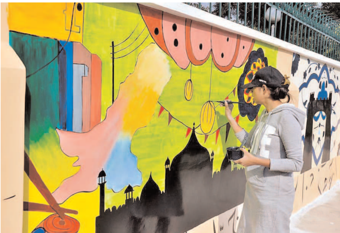
ISLAMABAD: A painter busy in paintings on walls for the beautification of the Federal Capital.

RAWALPINDI (APP): Anti-Narcotics Force (ANF) Pakistan while conducting ten counter-narcotics operations throughout the country seized over 21kg of drugs and arrested nine accused including a woman, said an ANF Headquarters spokesman here on Sunday. He informed in an operation here near Ayub Park, two drug pushers were arrested and ANF recovered 2.4 kg charas. ANF and ASF in a joint operation at Multan Airport recovered 1.9 kg charras from the possession of a passenger resident of Khyber going to Abu Dhabi. He informed that ANF recovered over 7.5 kg of liquid Ice drug from the trolley bag of a passenger resident of Mardan going to Jeddah at Karachi International Airport. In the fourth operation, a raid was conducted near Quetta Saniab road and ANF seized four kg charas and 700 grams of crystal heroin from the possession of a proclaimed offender accused resident of Quetta who was also wanted in another case. ANF arrested two accused from Shaheen Chowk near old airport Rawalpindi and recovered four kg Ice drug. In an operation, 22 grams of Ice drug was recovered from a parcel being sent to Australia, and intercepted at a private courier company in Islamabad. 42 heroin-filled capsules were recovered from the possession of a female passenger resident of Sahiwal, going to Colombo at Lahore International Airport. ANF in an operation at Bacha Khan International Airport Peshawar seized seven charras-filled capsules and netted an accused resident of Bannu.