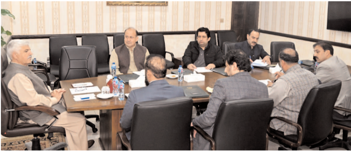
PESHAWAR: Chief Minister Khyber Pakhtunkhwa Mahmood Khan chairing a meeting regarding development projects in different sectors.