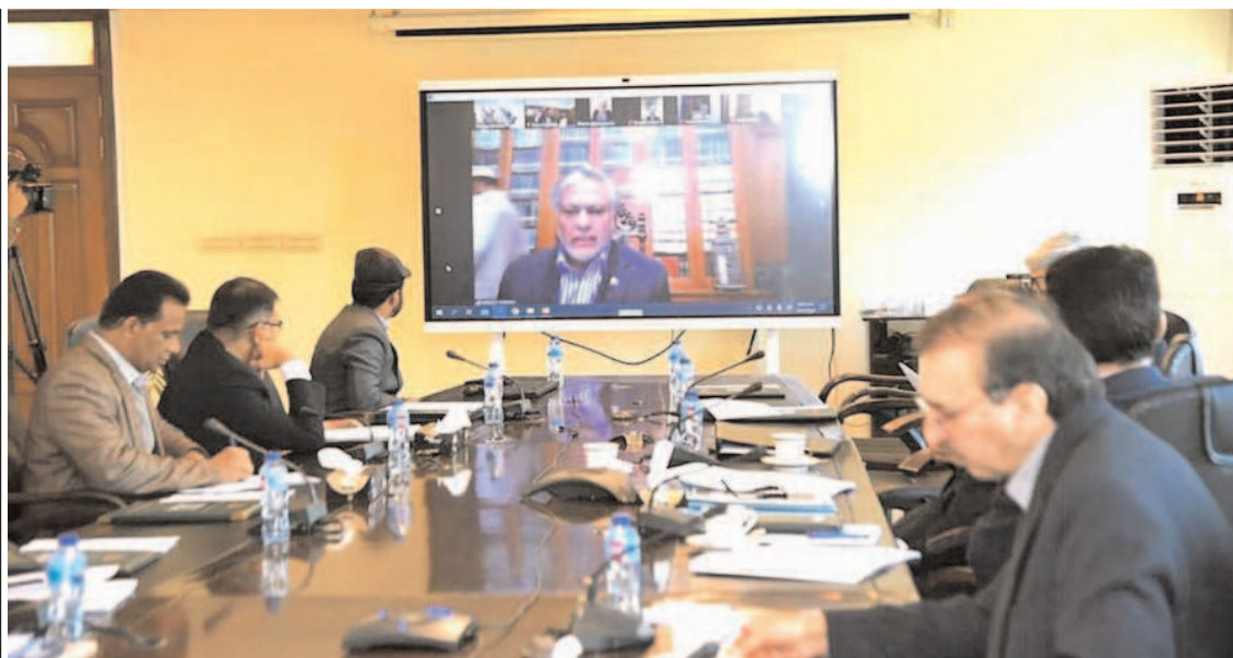
ISLAMABAD: Federal Minister for Finance and Revenue Senator Mohammad Ishaq Dar presiding over meeting of Economic Coordination Committee of Cabinet virtually through zoon.

Regarding the interaction between Pakistani and Chinese SEZs, the chairman concluded that they are contemplating arranging roadshows, conferences, and single-product exhibitions in China to impart first-hand knowledge about the special incentives given to SEZs in Punjab coupled with a peaceful and harmonious environment.