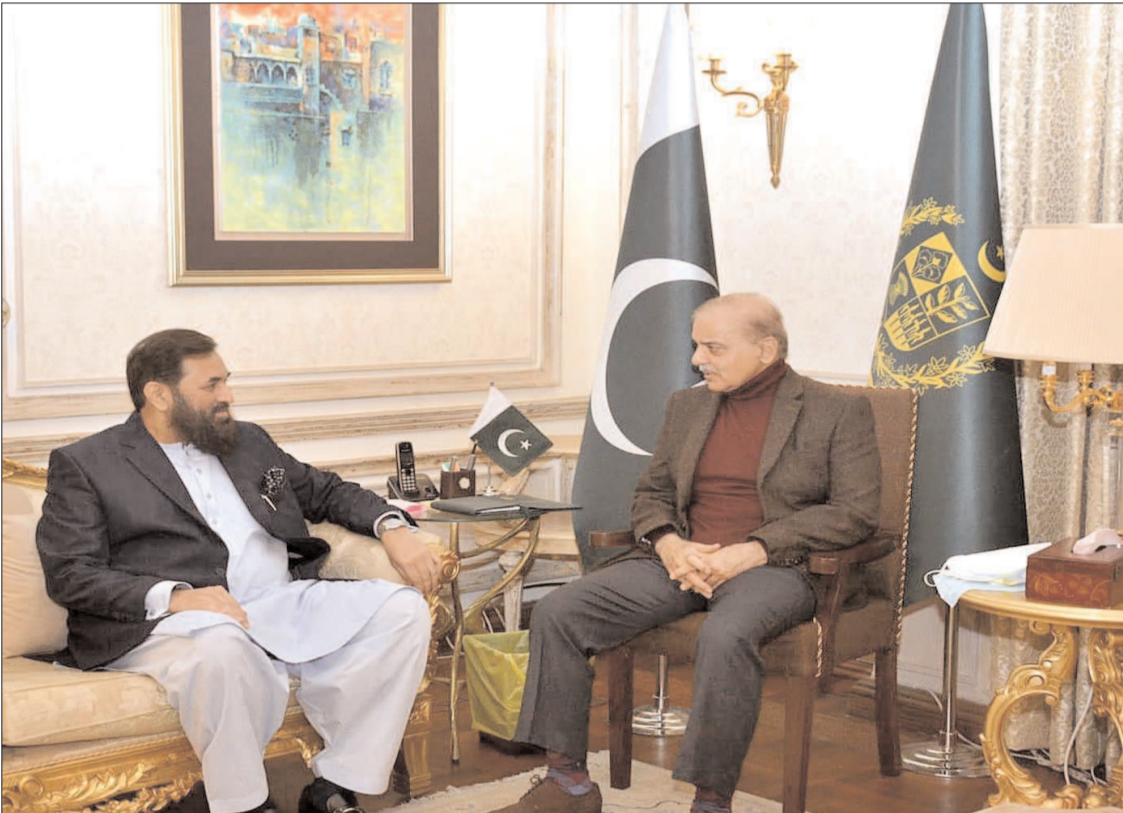
LAHORE: Governor Punjab Baligh ur Rehman calls on Prime Minister Muhammad Shehbaz Sharif.

While Levies Balochistan officials said that the Afghan Taliban made a target of the civilian area of Pakistan in which many innocent people were killed and injured badly. The Levies Balochistan officials said the Afghan Taliban hit the Pakistani residential area with mortar shells.