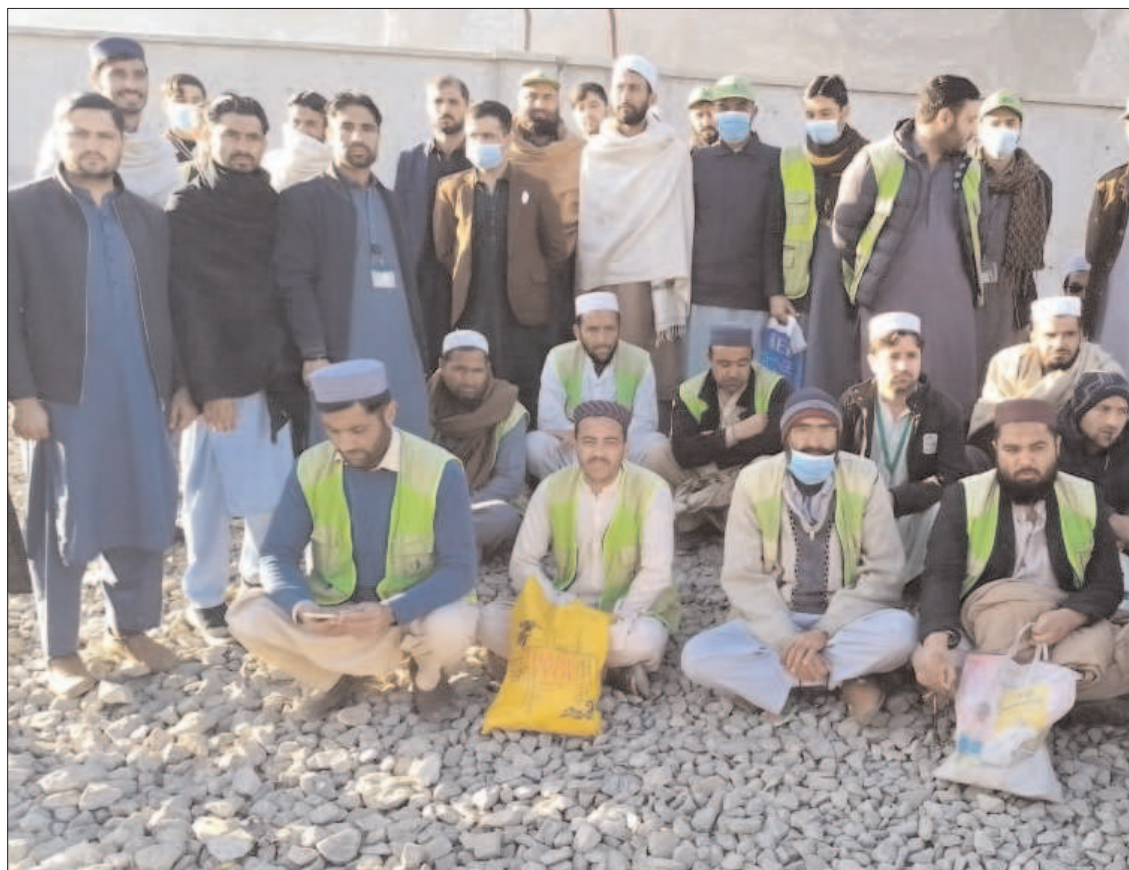
LANDI KOTAL: Polio workers sitting during a protest for acceptance of their demands.

CEO said that establishment of Insaf Afternoon Schools was revolutionary and laudable steps of the Punjab government for promoting education in the province. He said that with opening of Insaf Afternoon Schools in the province, enrolment of children in government school was increased significantly.