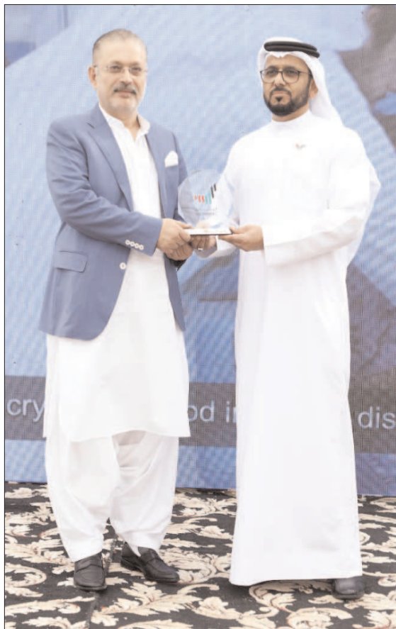
across the province. The minister thanked the UAE government and especially the consul general H.E

Speaking at the event, Provincial Information Minister Sharjeel Inam Memon praised the efforts of Afzaal Thalassaemia Foundation and added that the foundation is serving patients suffering from diseases like thalassaemia