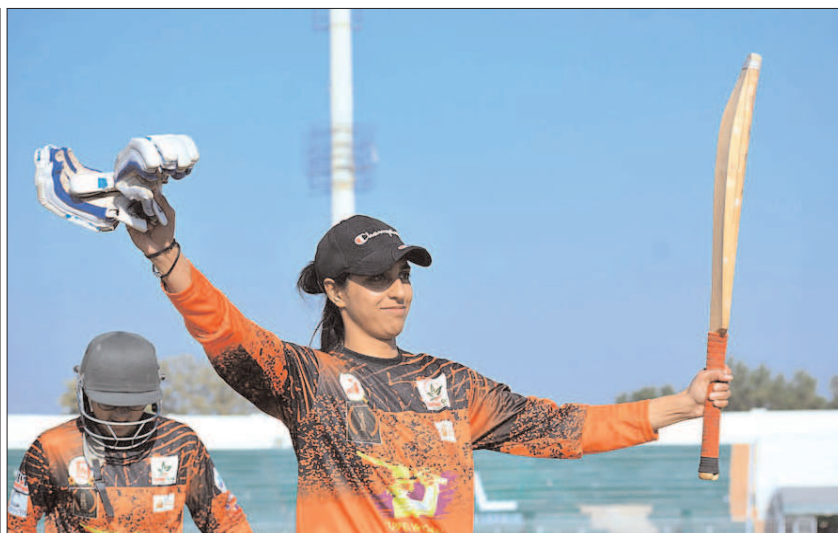
FAISALABAD: Players in action during final cricket match between Lahore Women Cricket Club & Faisalabad City Women Cricket teams during T-20 Super Women Cricket Taakara at Iqbal Stadium.

In the Punjab Derby, Central Punjab captain Aamer Yamin's economical spell of bowling led his side to a 25-run win Southern Punjab in a low-scoring match. Opting to bat first, Central Punjab were dismissed for 153 in the 35th over, with opening batter Mohammad Faizan top-scoring with 40 off 51 balls, which included five fours and one six. Zafar Gohar,