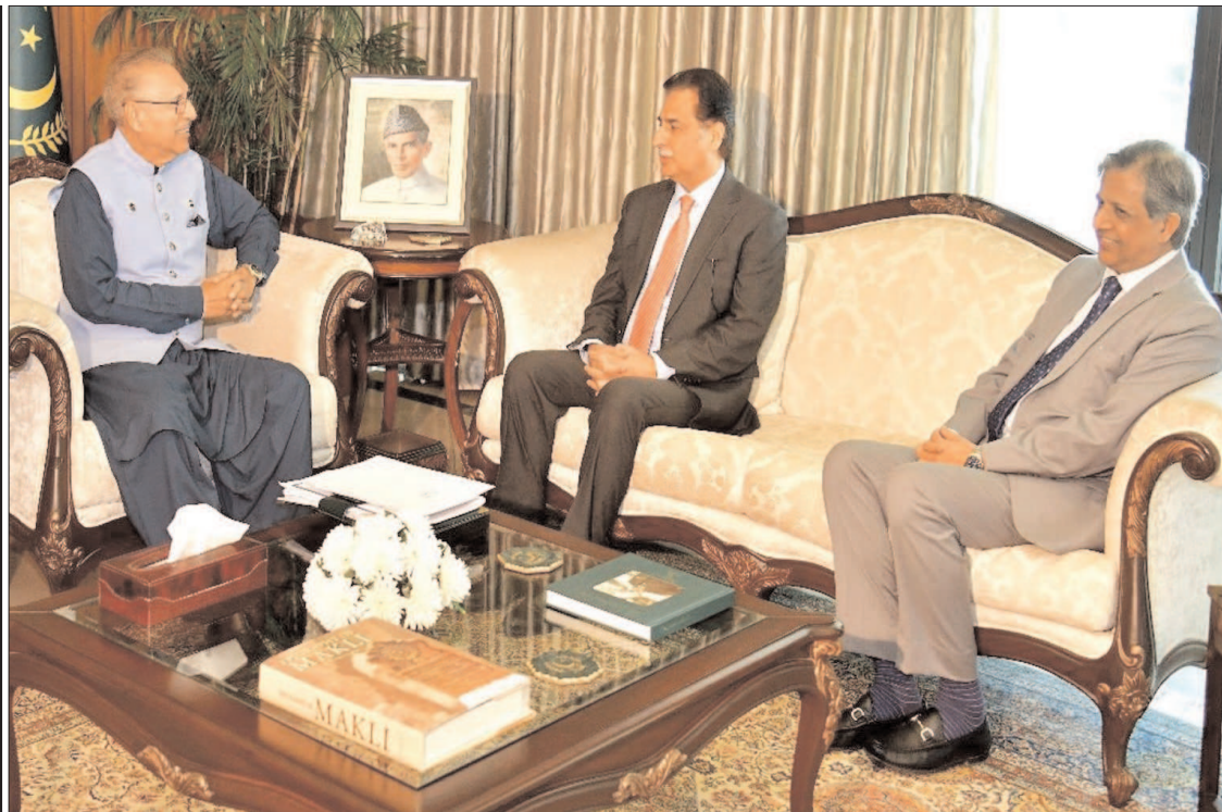
ISLAMABAD: Federal Minister for Economic Affairs, Sardar Ayaz Sadiq and Federal Minister for Law, Senator Azam Nazeer Tarar called on President Dr. Arif Alvi, at Aiwan-e-Sadr.

“The ambassadors are telling me that they do not have money. The chief justice should order to place the names of those who got their cases removed on the Exit Control List (ECL),” he demanded. “Corruption came to the fore even before the inauguration of Sukkur Motorway. They can cut as many ribbons as they want, they have got 15 days [only],” he maintained. While addressing the ceremony, Rashid also expressed his determination to build more educational institutions and an IT university in Rawalpindi.