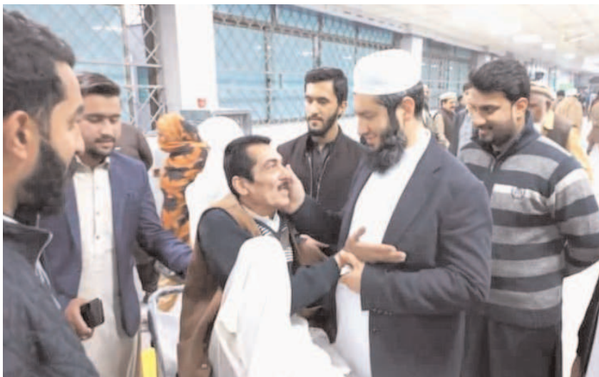
PESHAWAR: Mayor Haji Zubair Ali talking with a patient during his visit to Lady Reading Hospital.