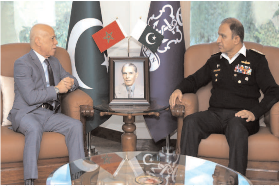
ISLAMABAD: Ambassador of Morocco to Pakistan H.E Mr Mohamed Karmoune calls on Chief of the Naval Staff Admiral Muhammad Amjad Khan Niazi at Naval headquarters.

ISLAMABAD (APP): Islamabad Capital Police arranged a workshop for students of Bahria College Naval Anchorage to acquaint them with road safety tips and better awareness about traffic rules. More than 350 students attended the workshop and the efforts of the force in ensuring a safe road environment in the city were highlighted. The Education Wing of Islamabad Capital Police informed the students how special measures are being taken to curb various traffic violations in the city and also informed them about traffic rules and regulations. It was informed that educational teams of police visit various organizations as this exercise is helpful in providing a disciplined traffic system to the masses. It was told that personnel of the force has not only helped to establish a disciplined traffic system in the Capital but also reduced the ratio of accidents. They were briefed about the history of the traffic police force, its targets, and achievements. Students were told about safety measures while walking along the road, road crossing codes, causes of accidents and how to protect oneself, defensive driving and its requirements, practice to prevent risky situations on road, planning for a long journey, positioning car or lane discipline, right of way on junctions and road markings, safe overtaking, traffic sign boards and traffic light signals and perils of using a mobile phone and not fastening seat belts while driving.