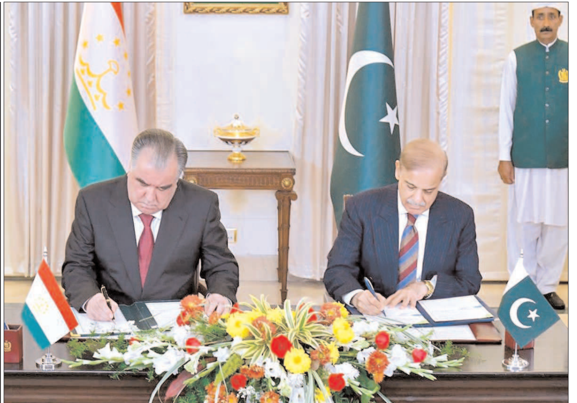
ISLAMABAD: Prime Minister Muhammad Shehbaz Sharif and President of Tajikistan Emomali Rahmon sign Joint Communiqué of the visit of Tajik President to Pakistan.

President Rahmon further said that both countries shared commonalities which served to further strengthen these ties.