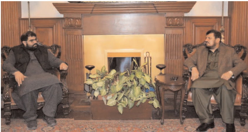
PESHAWAR: Provincial president of ANP Aimal Wali Khan meeting with Governor Khyber Pakhtunkhwa Haji Ghulam Ali at Governor's House.

about projects from the forum of District Development Advisory Committee (DDAC). The chairman of the committee issued directives for ensuring timely recruitments in educational institutions and directed for furnishing details regarding objections of the members of the committee relating to Government Post-Graduate College, Takht Nusrati (Karak) and Government High School, Sarmast Mira Khel in the upcoming meeting of the panel.