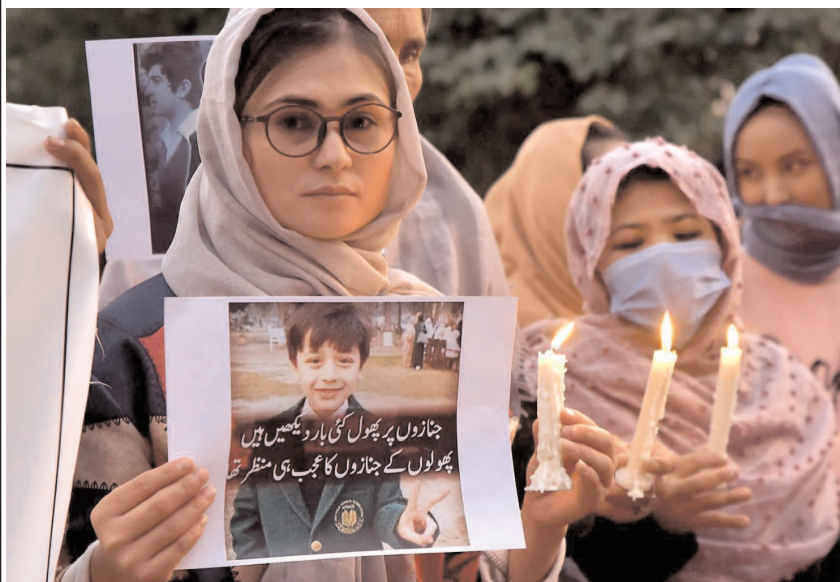
ISLAMABAD: Civil society members lighting candles in remembrance of martyrs of Army Public School Peshawar incident.