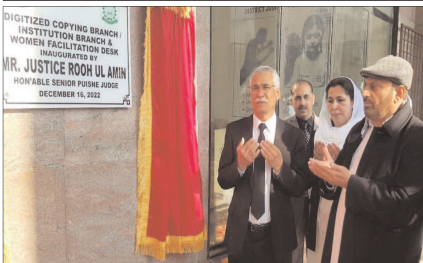
CHARSADDA: Justice Peshawar High Court, Justice Roohul Amin inaugurating Women Facilitation Desk at Judicial Complex.

The pilot in TMA Bahrain was started with 100 households and is now expanded to 4,000 households. The SNG team is assisting the administration of Haripur in planning to replicate the same successful model in TMA Haripur. The Deputy Commissioner thanked the SNG Programme, for choosing Haripur district for orientation about this pilot project. He also assured all possible support from his office.