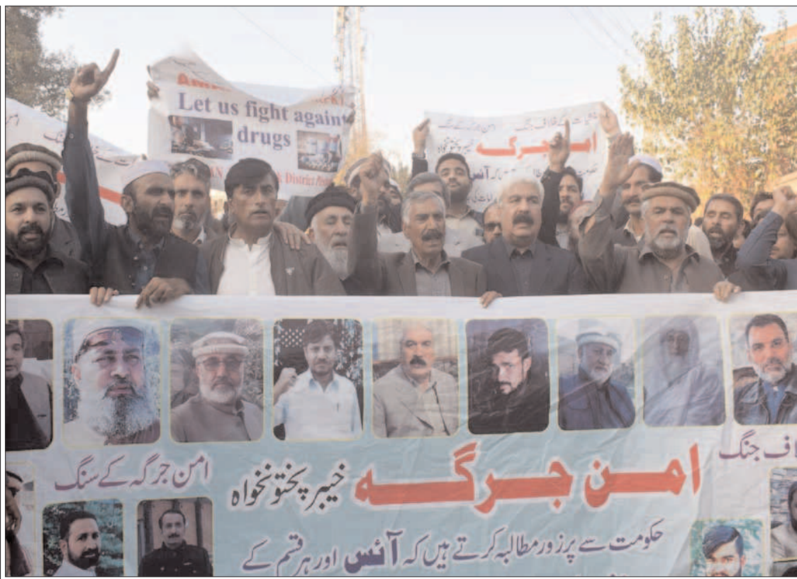
PESHAWAR: Activists of Aman Jirga holding banner during a protest against use of drugs.