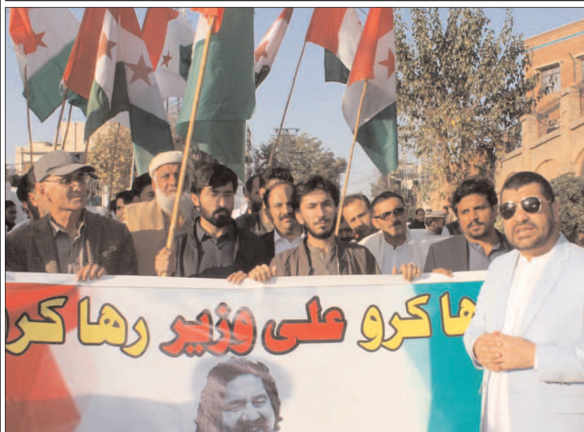
PESHAWAR: Activists of Pukhtunkhwa Milli Awami Party holding a protest for acceptance of their demands.

lic about prevention of seasonal diseases. The residents of the area thanked the District Administration and Frontier Corps North and said that, by organizing free medical camps in various areas of the tribal districts, the people are getting basic health facilities easily and they don't have to go to other areas for treatment.