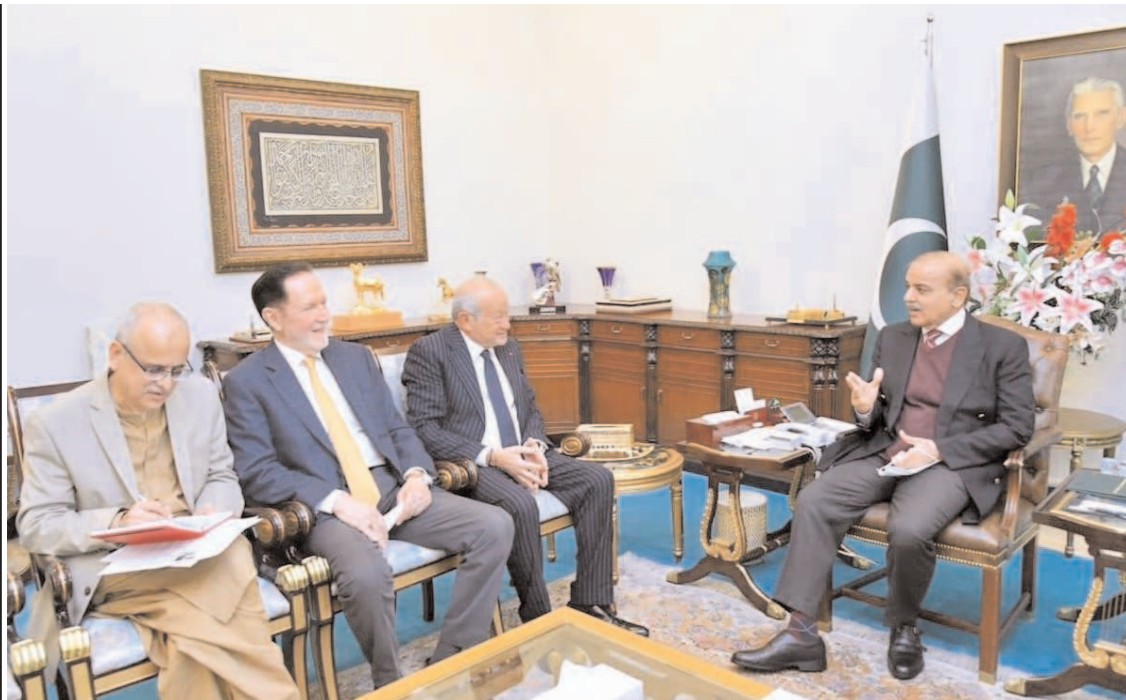
ISLAMABAD: Businessman from Egypt Naguib Sawiris meeting with Prime Minister Muhammad Shehbaz Sharif.

The business group of Naguib Sawiris has made successful investments in telecommunication and real estate sectors in Pakistan.