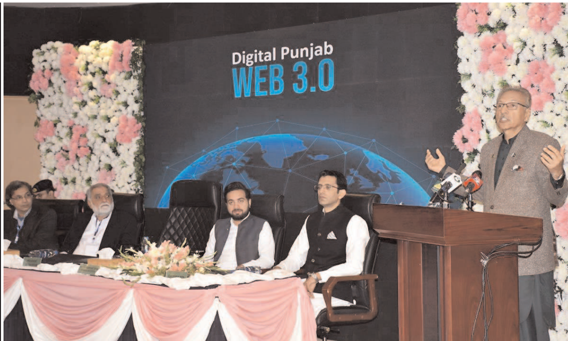
LAHORE: President Dr. Arif Alvi addressing launching ceremony of Digital Punjab Web 3.0 organized by Punjab Information Technology Board.