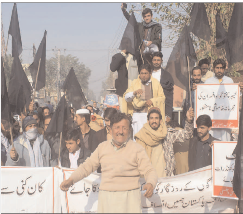
PESHAWAR: Residents of Mian Essa Nandark Jalaibai holding a protest in favour of their demands.