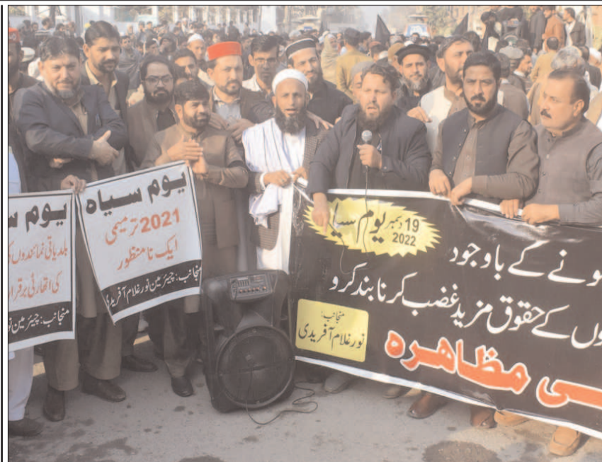
PESHAWAR: Local government representatives holding a protest for acceptance of their demands.