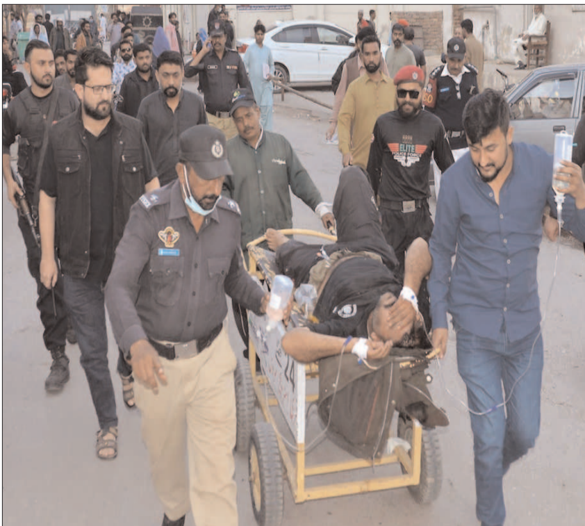
HYDERABAD: Injured policeman being shifted to ward in hospital after firing by unknown culprits.

The Jirga said that the overseas had to travel to Peshawar to get their medical certificate. It demanded the government to set up a medical center at Timergara so that the overseas could get their certificate easily. It also demanded the establishment of an 'Etemad' office at Timergara for biometric services for all types of visas. The jirga also demanded appropriate measures for ensuring the ownership rights before finalizing the land settlement in the area. It said the government should work on the alternate route of Chakdara-Gilgit motorway via Chitral under the China Pakistan Economic Corridor (CPEC) project.