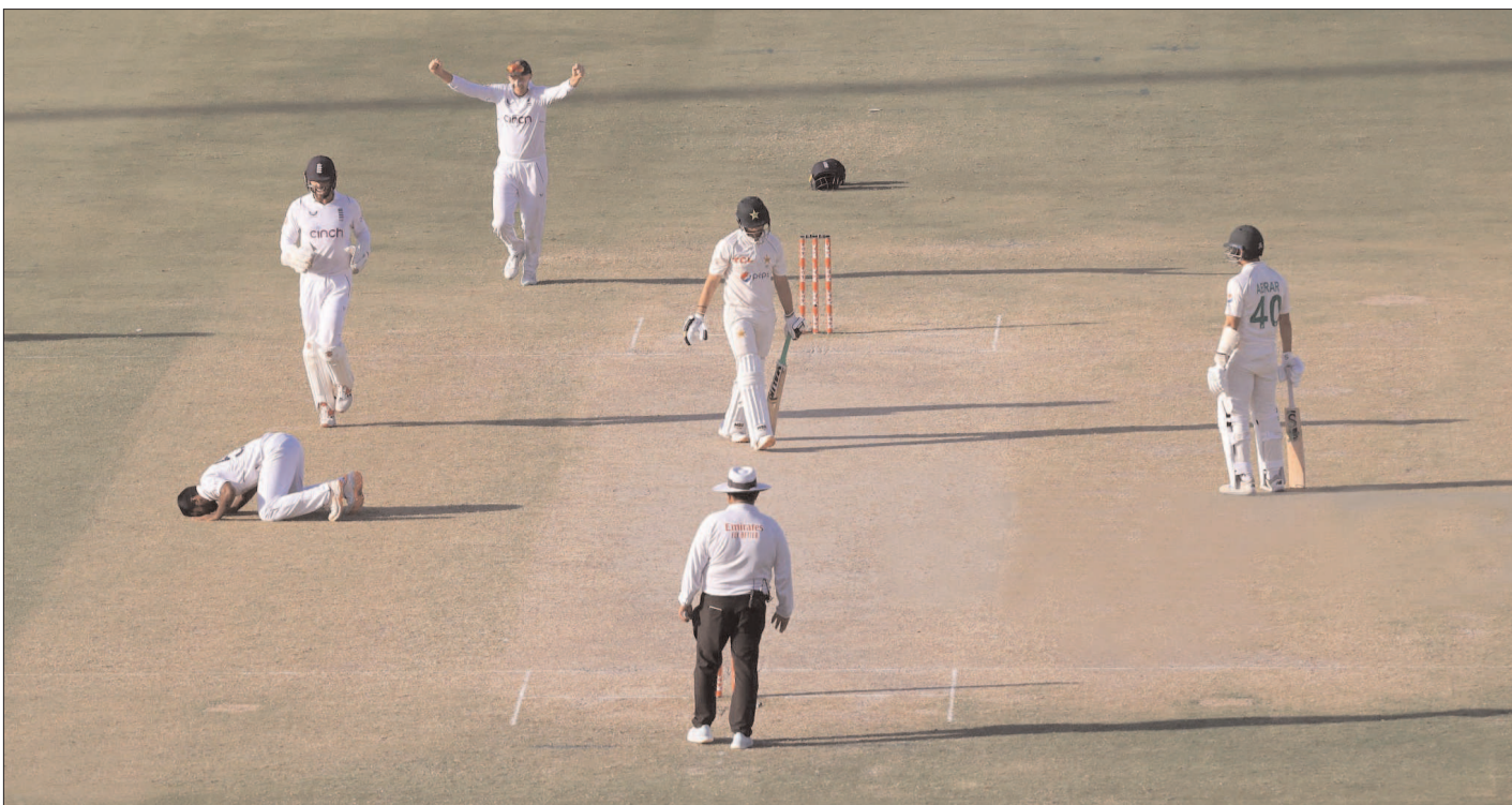
KARACHI: Rehan Ahmed of England celebrates the wicket of Agha Salman of Pakistan, after becoming the youngest debutant in men's Test history to take a five-for during day three of the Third Test.