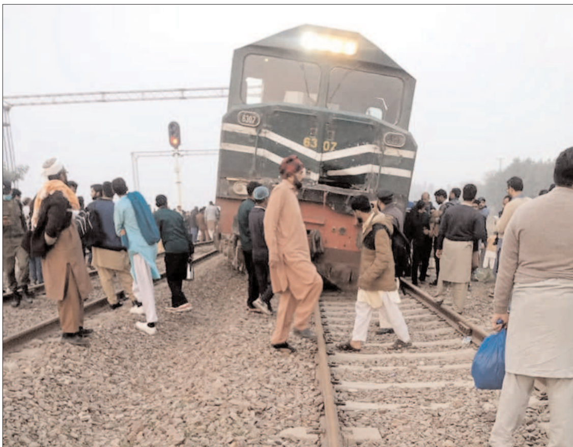
LAHORE: Pak Business Express Derailed At Jia Bagga Railway station near Lahore.

He further said that Gilgit-Baltistan has very beautiful tourist resorts in the world which are the center of attention of foreign tourists.