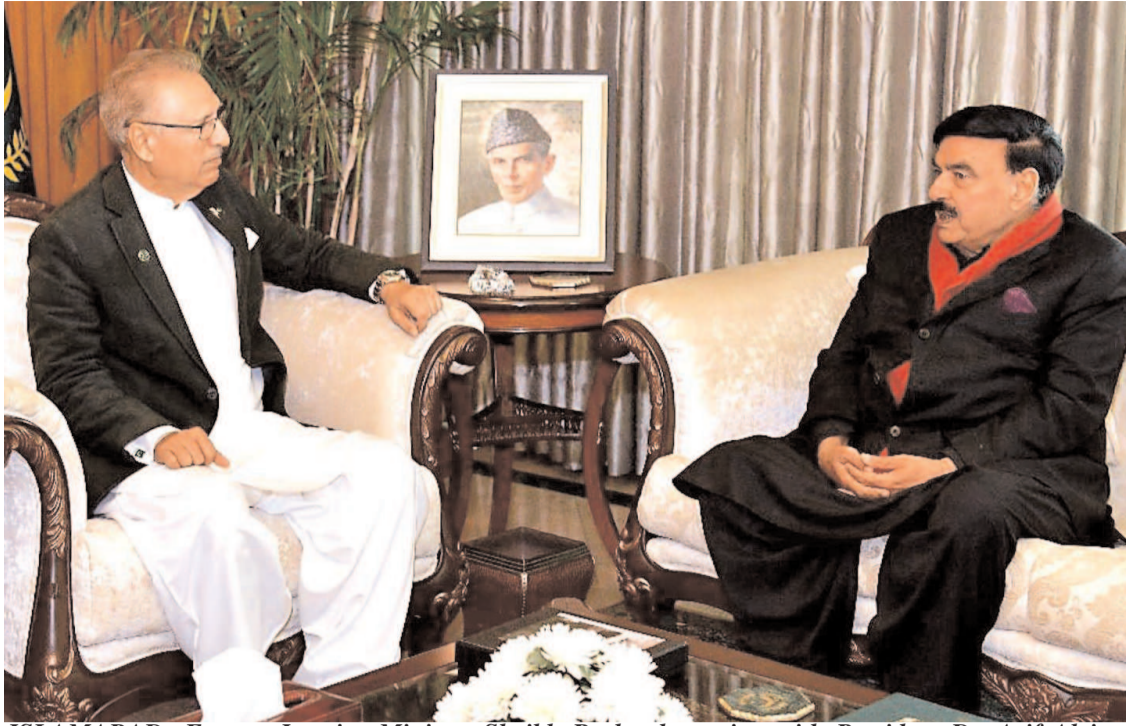
ISLAMABAD: Former Interior Minister Sheikh Rasheed meeting with President Dr. Arif Alvi at Aiwan-e-Sadr.

Apart from working on traditional economic diplomacy, the ambassador-designate should also look for new avenues of cooperation, especially start-ups, he said.