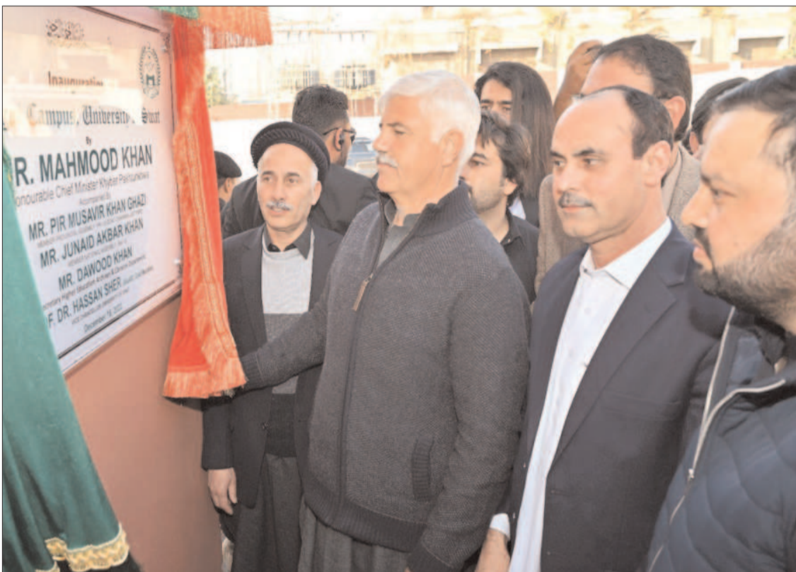
MALAKAND: Chief Minister Khyber Pakhtunkhwa Mahmood Khan inaugurating Dargai Campus, University of Swat.