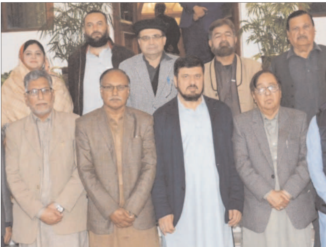
PESHAWAR: Cabinet of Abbasin Column Writers Association in a group photo with Governor Khyber Pakhtunkhwa Haji Ghulam Ali.