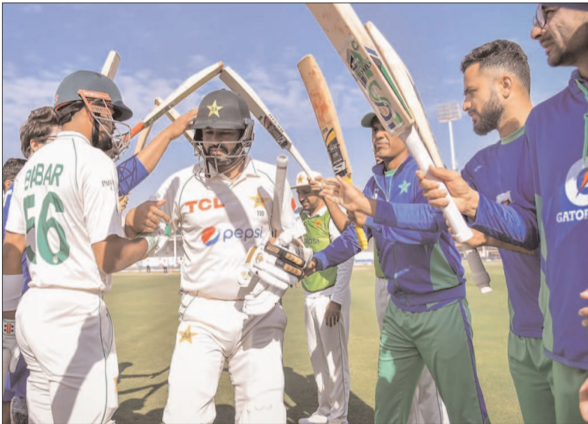
KARACHI: Azhar Ali walked off to a guard of honour from his team-mates.

The England players clapped as Azhar trudged back to the dressing room, while Pakistan's players raised their bats at the boundary for a ceremonial guard of honour. Among the handful of spectators were Azhar's wife and three sons.