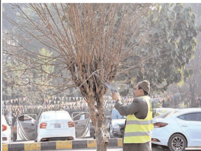
ISLAMABAD: ISLAMABAD: A CDA staffer cuts the tree branches at Aabpara.

Furthermore, the administration also sealed three illegal petrol-selling agencies; one illegal LPG filling station, and arrested one person for violation.