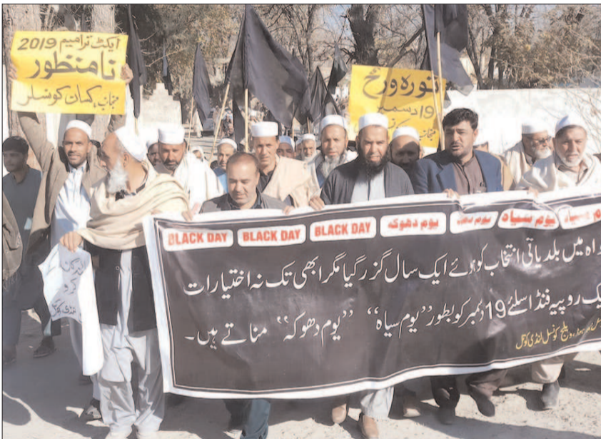
LANDI KOTAL: Councilors holding a protest rally in favour of their demands at Tehsil compound.

said the government would soon resume work on the development projects pertaining to roads, sewerage, water supply and other schemes. He claimed that the PPP's government always provided employment to the people. The minister said the PPP's Chairman had directed the CM Sindh to provide employment to the people against the thousands of vacant jobs.