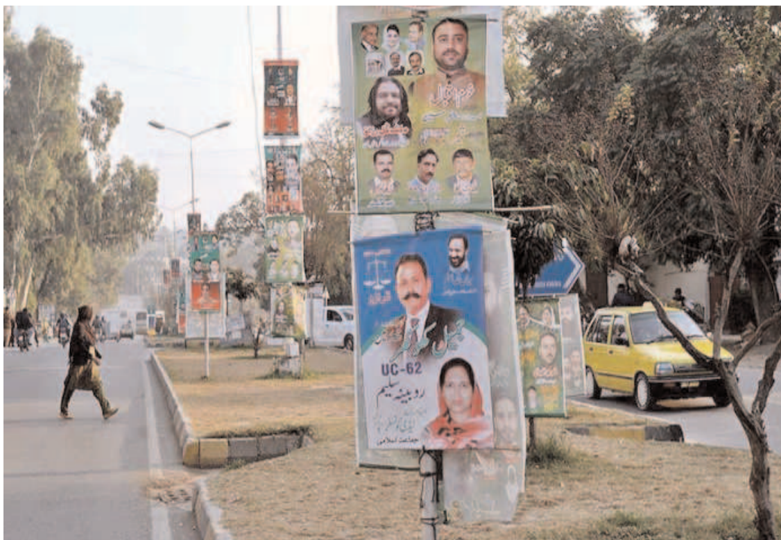
ISLAMABAD: Banners of political parties seen hanging in UC-2 constituency in connection with the local Government election coming ahead, located on G-7 area.