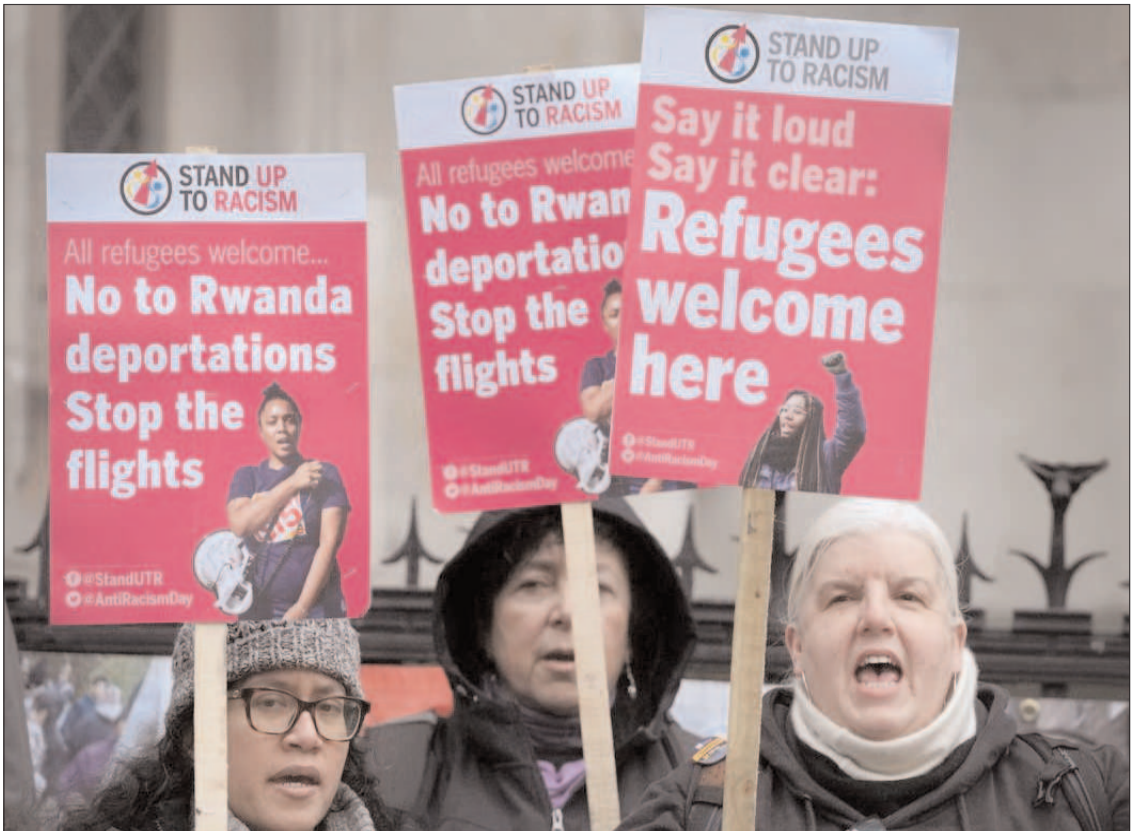
LONDON: Stand Up To Racism campaigners holding banners outside the High Court.