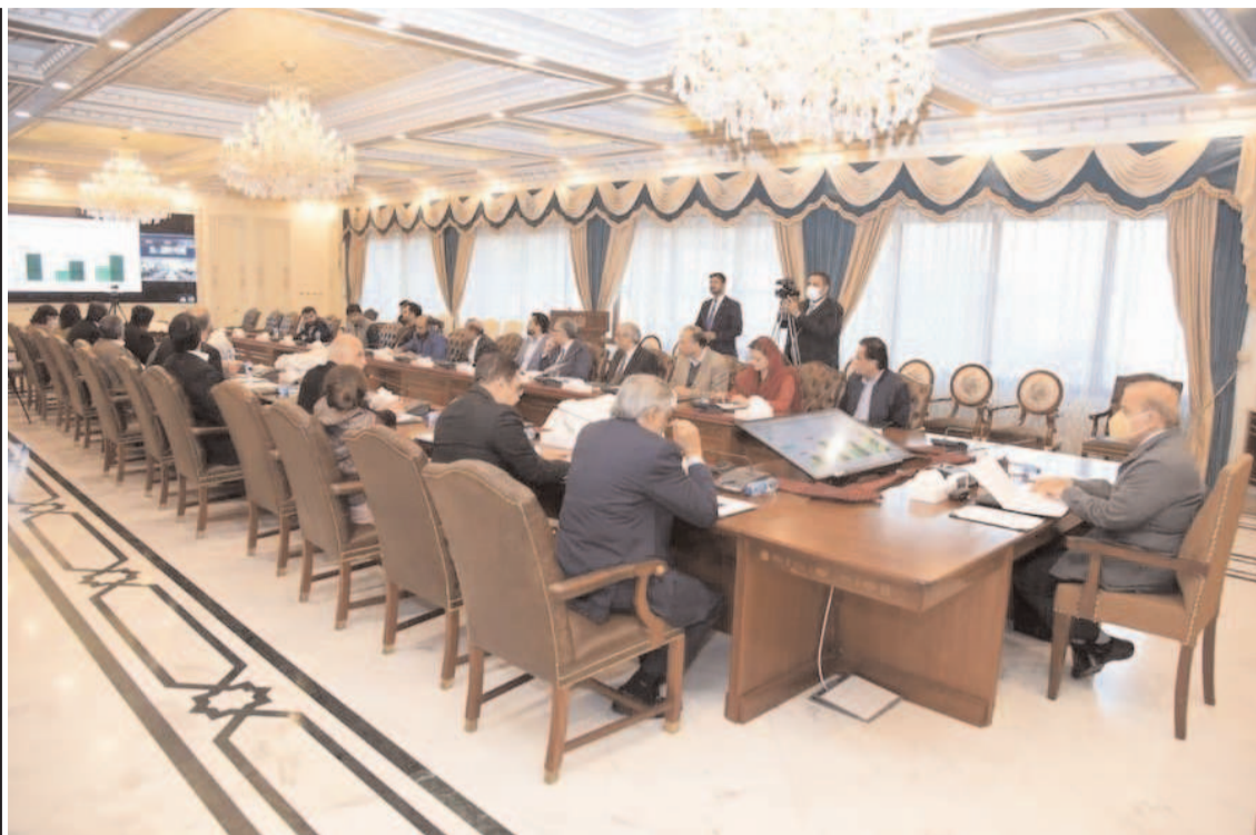
ISLAMABAD: Prime Minister Muhammad Shehbaz Sharif chairs a meeting to devise a strategy on reduction of circular debt in Energy Sector.

The LHC had suspended the operation of the call-up notice issued to PTI chairman Imran Khan by the FIA in the cipher audio leak scandal.