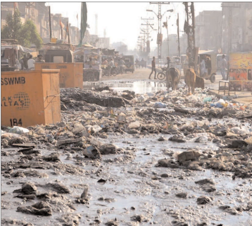
HYDERABAD: Sewerage water accumulated on main road of Latifabad, creating problems for commuters.