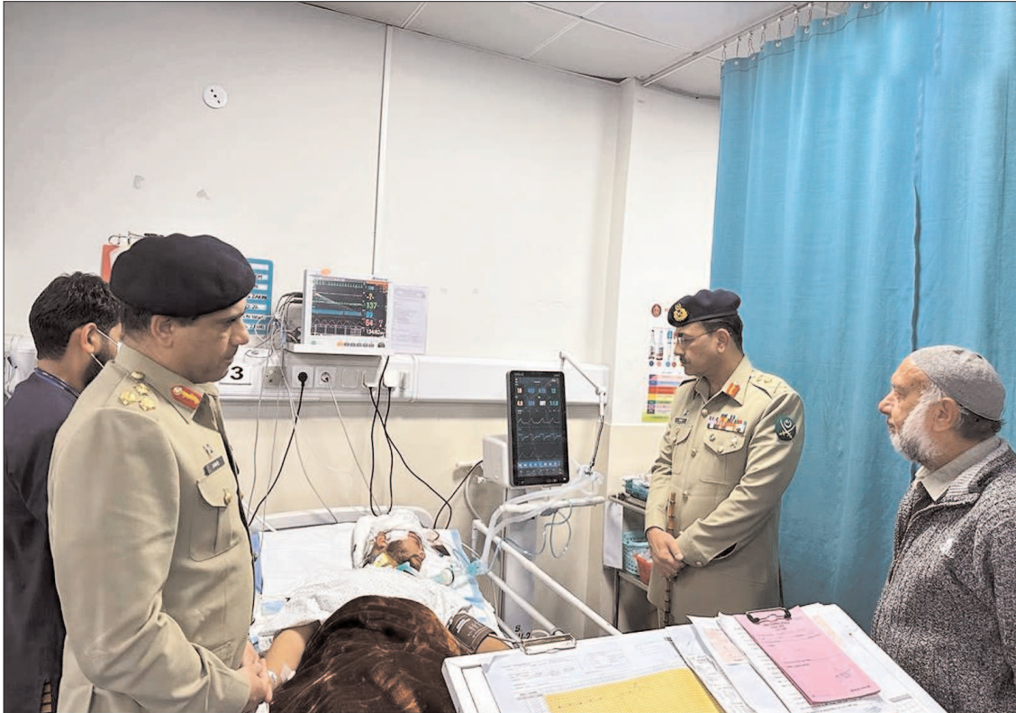
RAWALPINDI: General Syed Asim Munir, Chief of Army Staff (COAS) visited CMH Rawalpindi on Wednesday.

their high spirit and morale and lauded their professionalism during operation against terrorists.