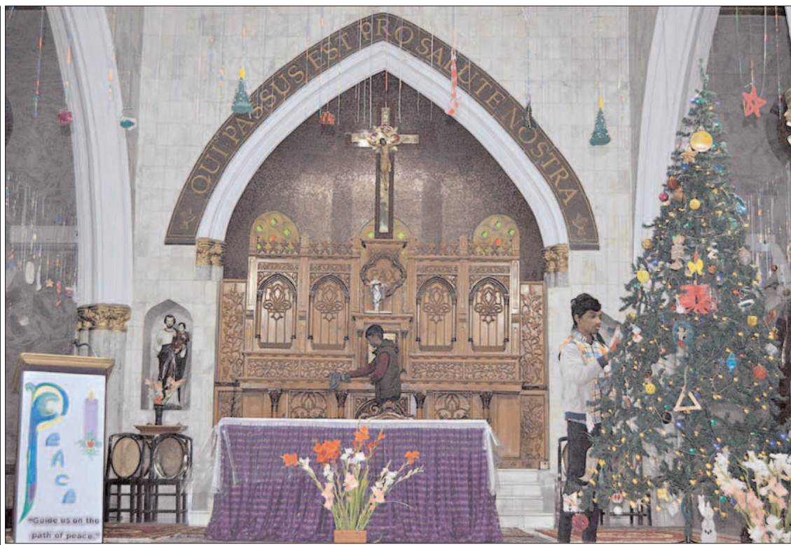
LAHORE: People from Christian community are decorating the Anthony Church for upcoming Christmas.

The chief minister approved the procurement of 300,000 of wheat from the PASSCO.