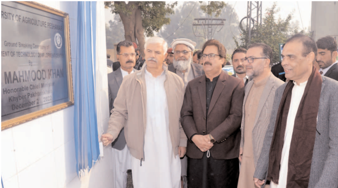
PESHAWAR: Chief Minister Khyber Pakhtunkhwa Mahmood Khan unveiling plaque to formally perform groundbreaking of Technology Development Center at University of Agriculture.

He warned stern action for those not paying charges for clean drinking water and their connection would be disconnected.