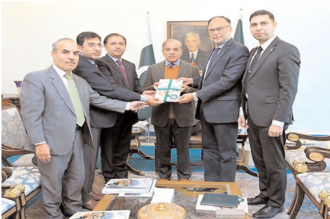
ISLAMABAD: Federal Minister for Planning, Development and Special Initiatives, Mr. Ahsan Iqbal presenting a copy of Resilient, Recovery, Rehabilitation and Reconstruction (4RF) Report to Prime Minister Shehbaz Sharif.