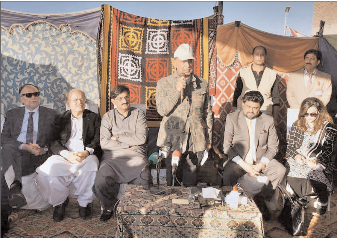
KHAIRPUR: Prime Minister Muhammad Shehbaz Sharif talks to the flood affectees of District Khairpur in Kot Diji.

Prime Minister Shehbaz was given a briefing on the ongoing rehabilitation and reconstruction projects being carried out in the flood-affected areas. It was highlighted that the areas be restored in line with the feasibility study following a rainfall of 2011-12 that outlined the natural water courses. It was emphasized that most of the flood-hit areas had been de-watered, with electricity fully restored.