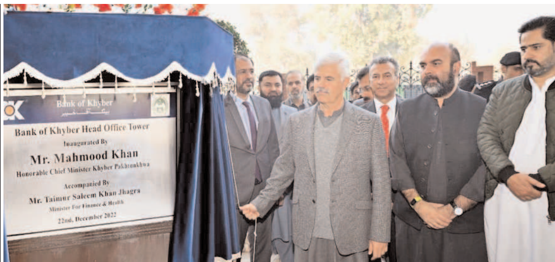
PESHAWAR: Chief Minister Khyber Pakhtunkhwa Mahmood Khan inaugurating newly established Head Office Tower of Bank of Khyber.

The price of gold in the international market increased by $7 to $1815 compared to its sale at $1,808, the association reported.