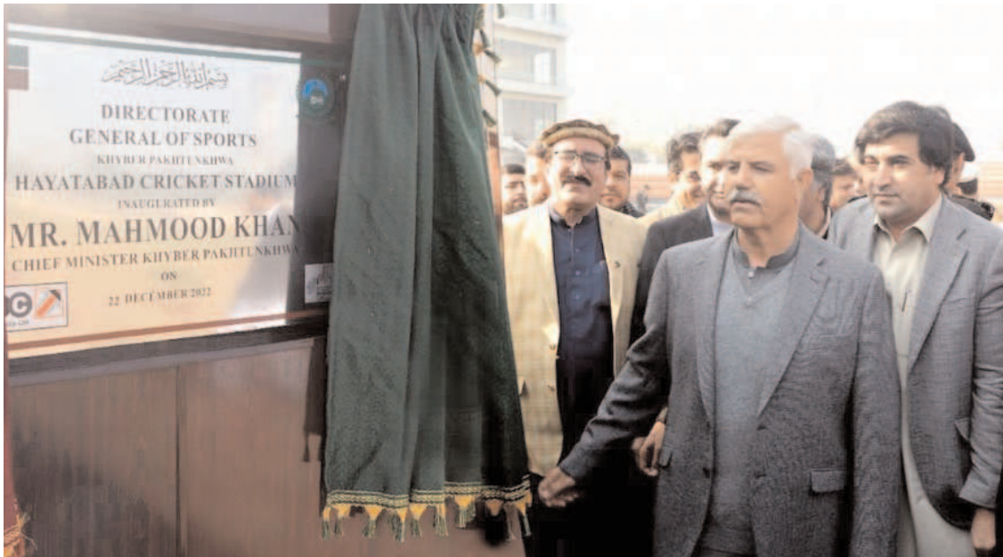
PESHAWAR: Chief Minister Khyber Pakhtunkhwa Mahmood Khan inaugurating cricket stadium at Hayatabad Sports Complex.