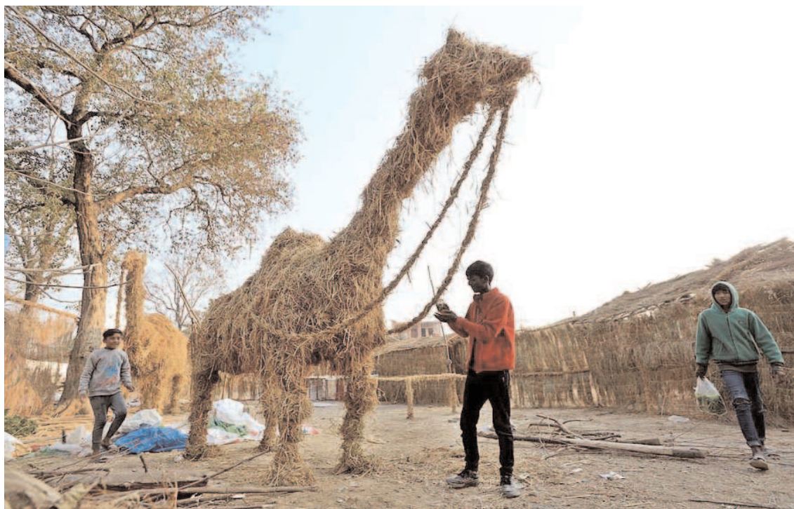
ISLAMABAD: Christian youngsters busy in decoration for upcoming Christmas and New Year celebrations at G-7.

Furthermore, ICT teams also carried out an anti-encroachment operation at a fruit and vegetable market, where they detained 3 offenders, impounded 6 carts that were obstructing the main double road, and recovered 23 kg of plastic bags.