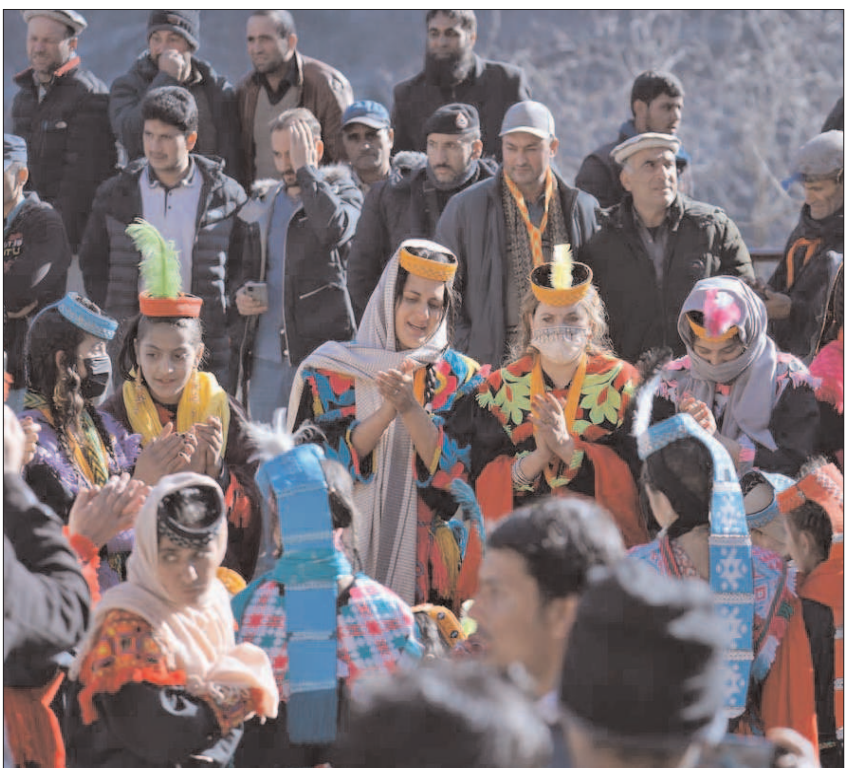
CHITRAL: Locals enjoying during Chamos Festival in Kalash.