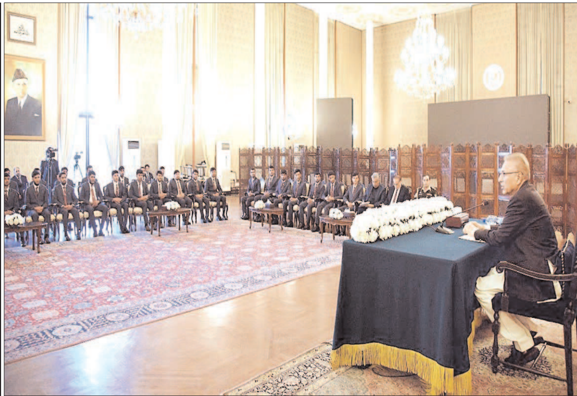
ISLAMABAD: President Dr. Arif Alvi talking to the cadets of the Cadet College, Kohlu, Balochistan who came to Aiwan-e-Sadr on an educational visit.

The president appreciated the Cadet Colleges of Pakistan for producing quality graduates, who after graduating, were serving the Pakistan Armed Forces and in other fields as physicians, engineers and businessmen. The Cadet College, Kohlu was announced in 2006 and the first batch of Cadets was inducted in 2016 that passed out in 2022. At present total strength of cadets is 298 with 34 faculty members.