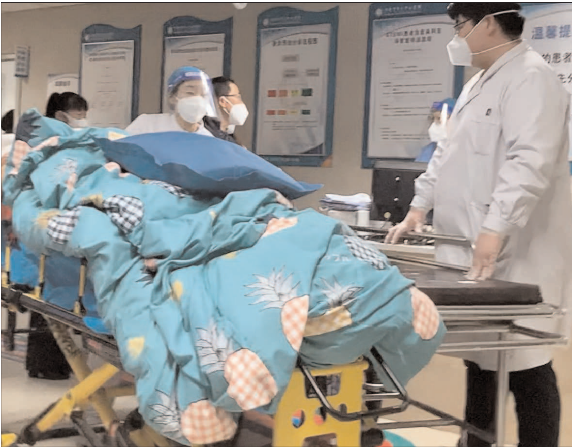
ZHUOZHOU: A patient is turned away from the emergency room due to full capacity at the Baoding No. 2 Central Hospital in northern China's Hebei province.

The government earlier this week asked India's states to keep a lookout for any new variants of the coronavirus and urged people to wear masks in crowded areas, citing an increase in COVID-19 cases in China and other parts of the globe. With more than 44 million COVID cases to date, India has reported the most in the world behind the United States. However, its number of confirmed infections has fallen sharply in the past few months.