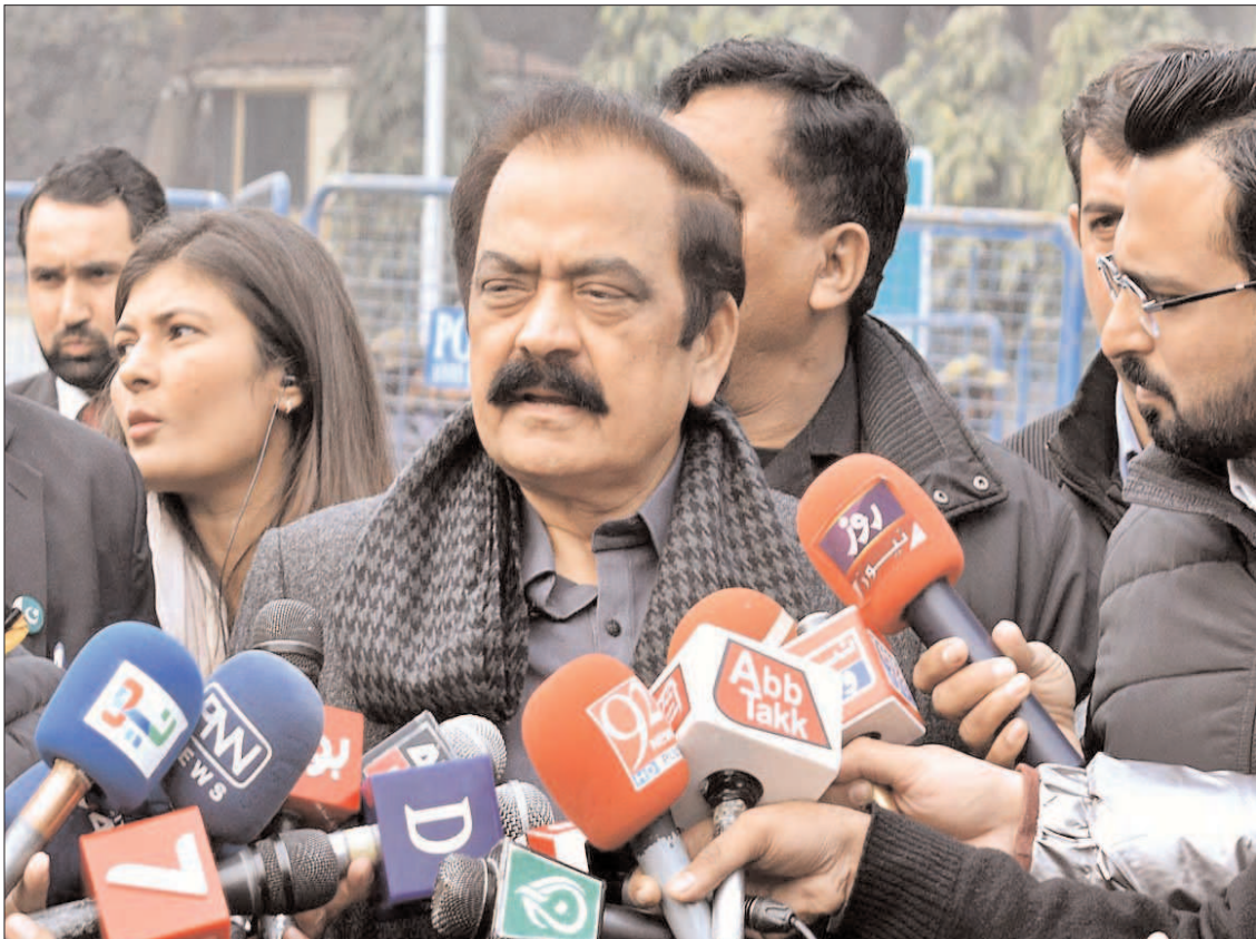
LAHORE: Interior Minister Rana Sanaullah talking to the media outside the Governor House.

INF(P)# 7101/22, The Frontier Post Peshawar, Date: 23-12-22