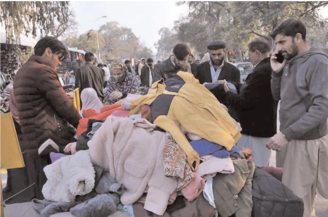
ISLAMABAD: People selecting secondhand overcoats at a roadside stall.

During July-November, this year, exports of different food commodities was $1.927 billion as compared to $1.947 billion in the same period of last year, whereas food commodities valuing $4.080 billion were imported as against the imports of $4.015 billion of the same period, last year.