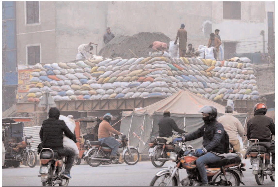
LAHORE: Construction work is going on Sumanabad Underpass.