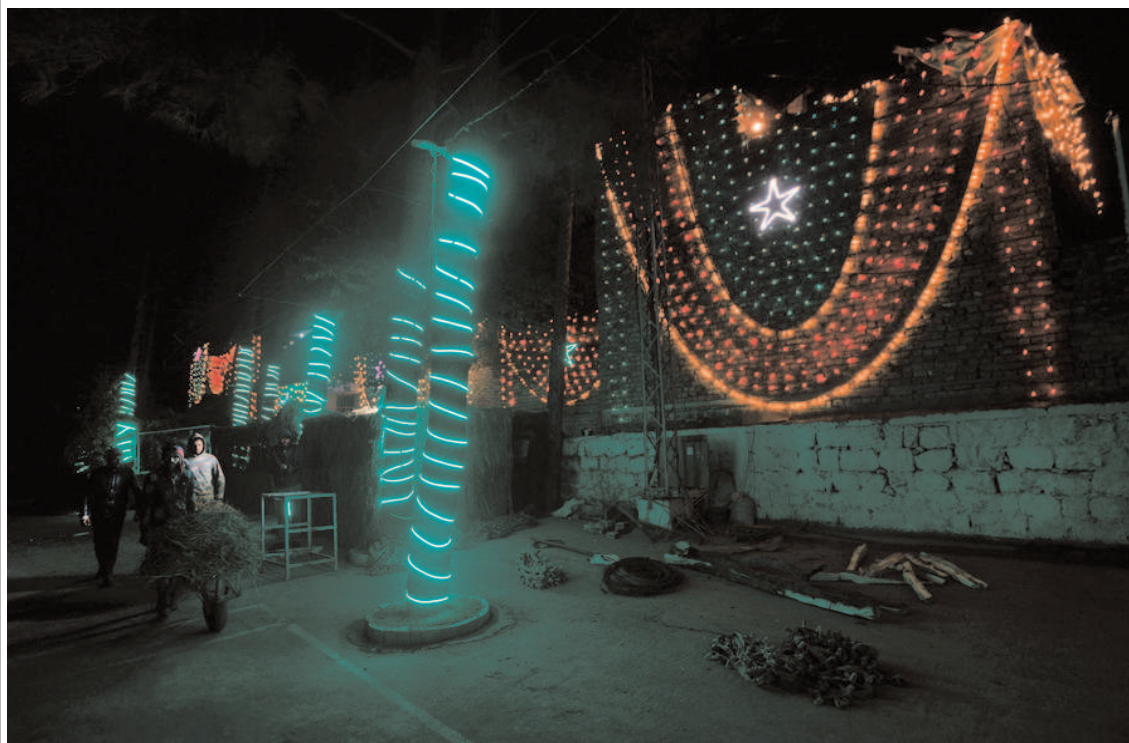
ISLAMABAD: A street is illuminated with colorful lights ahead of Christmas celebrations at 100 quarters.

He said that a conference is a must-attend event for anyone looking to succeed in the digital economy to connect, learn, and grow with other amazing women. He underlined that the panel discussions will provide solutions in exclusive sessions, adding the event will allow the participants to network with the right people.