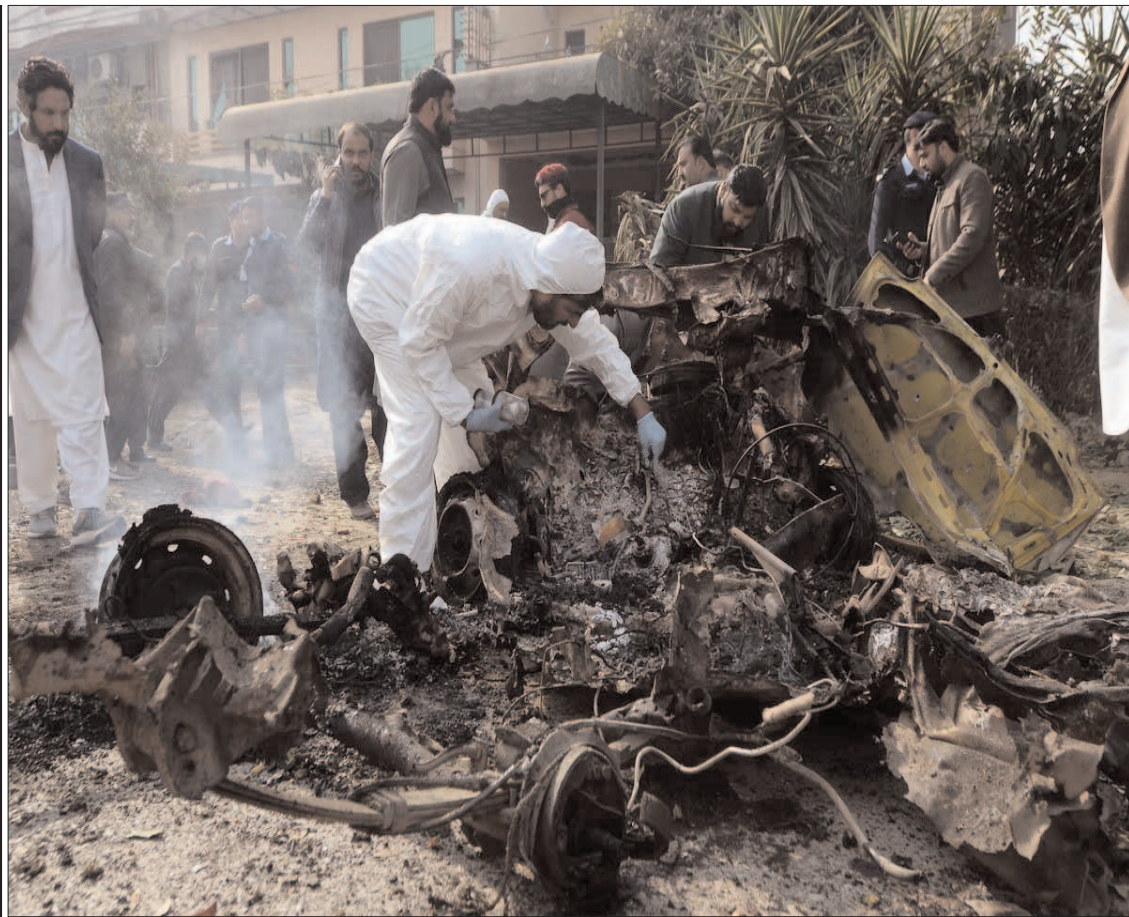
ISLAMABAD: The shattered remains of a vehicle blown up by an alleged terrorist in the Residential Sector of I-10/4 Islamabad, at a police check post.