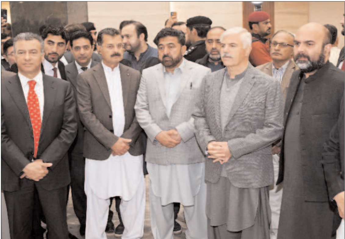
PESHAWAR: Chief Minister Khyber Pakhtunkhwa Mahmood Khan being briefed on the second phase of 'Insaf Rozgar Scheme' for newly merged districts.