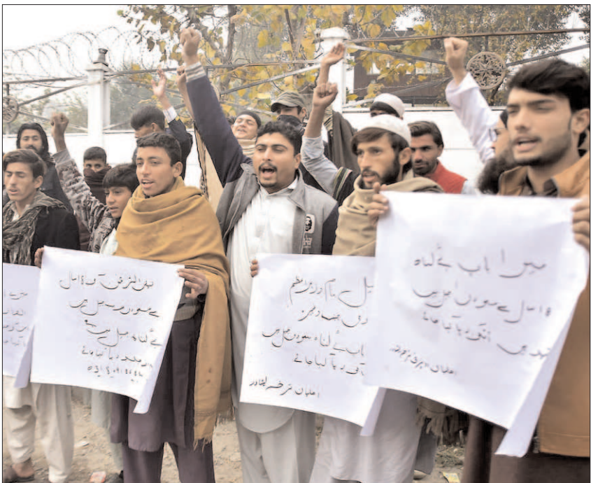
PESHAWAR: Resident of Adezai chanting slogans during a protest in favour of their demands.