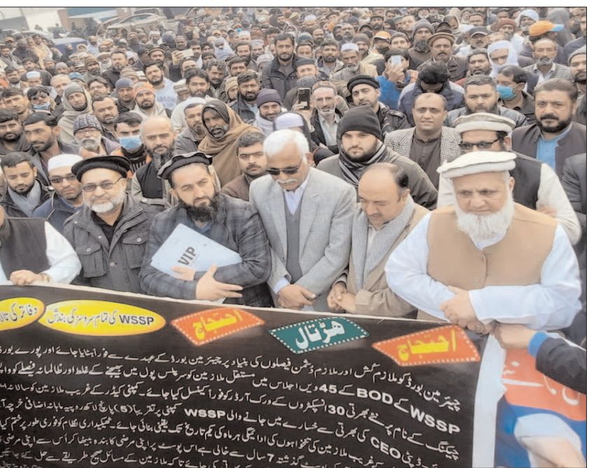
PESHAWAR: Activists of All Municipal Workers Union WSSP holding a protest for acceptance of their demands.

11604 FIRs were registered over the lack of filing tenancy rent form and 1196 FIRs were registered against hotels for lack of guests' verification. Similarly, 120459 suspects were arrested during 79940 snap checkings across the province and 15786 numbers of various weapons and 433786 cartridges were also recovered from them. The provincial police have also made breakthrough in operation against narcotics through Narcotics Eradication Teams (NETs) have carried out successful operations against narcotics sellers and recovered 903.645 kilograms of ice drug, 1279.431 kilograms of heroin, 18841.834 kilograms of hashish, 1381.3 kilograms opium and 12883.52 litres of liquor.