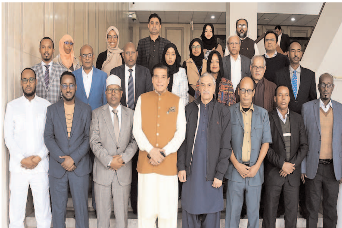
ISLAMABAD: Speaker National Assembly Raja Perviz Ashraf in a group photo with Somali delegation led by Minister of Interior Federal Affairs and Reconciliation Mr. Ahmed Moallim Fiqi Ahmed at Parliament House.

ISLAMABAD (APP): The National Institute of Folk and Traditional Heritage (Lok Virsa) celebrated Christmas in a befitting manner here Friday at Shakarparian. A day-long Christmas festival was organized which featured special attractions like congregation of Christian community, Christmas cake-cutting ceremony, the erection of a Christmas tree, an exhibition of artisans-at-work with master artisans in different specialized craft fields, folk songs, folk dances, video documentaries on Christmas and performances by traditional drummers (Dholis). Lok Virsa complex remained the center of Christmas celebrations throughout the day. A prestigious opening ceremony was held at the Pakistan National Heritage Museum which was attended by the Christian community and local audience. Pakistan National Council of the Arts (PNCA), Saint Thomas Church, Blue Area and U.P. Church, F-7/4 collaborated with Lok Virsa for Christmas celebrations.