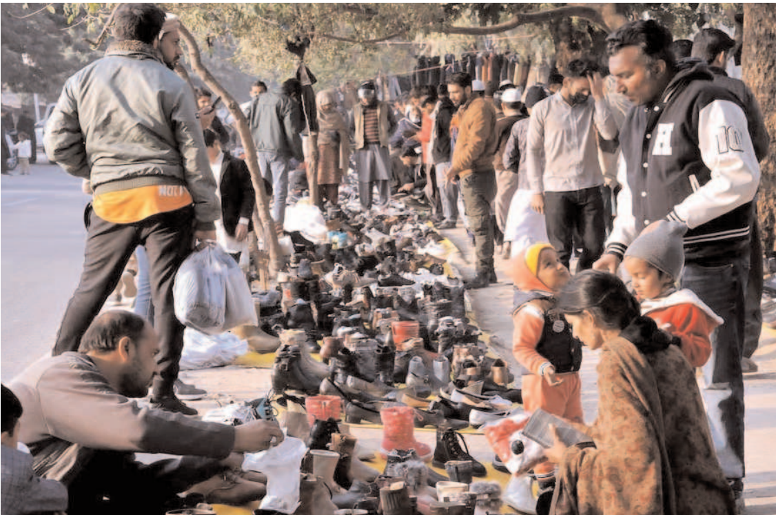
ISLAMABAD: People purchasing secondhand shoes at a roadside stall.

He said, there was also a need to have connectivity through rail, road, and air besides cooperating in tapping the potential of natural resources and precious metals.