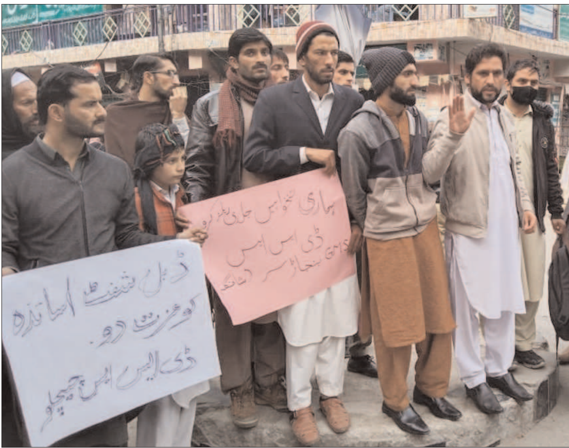
SHANGLA: Second shift teachers holding protest for release of their salaries.