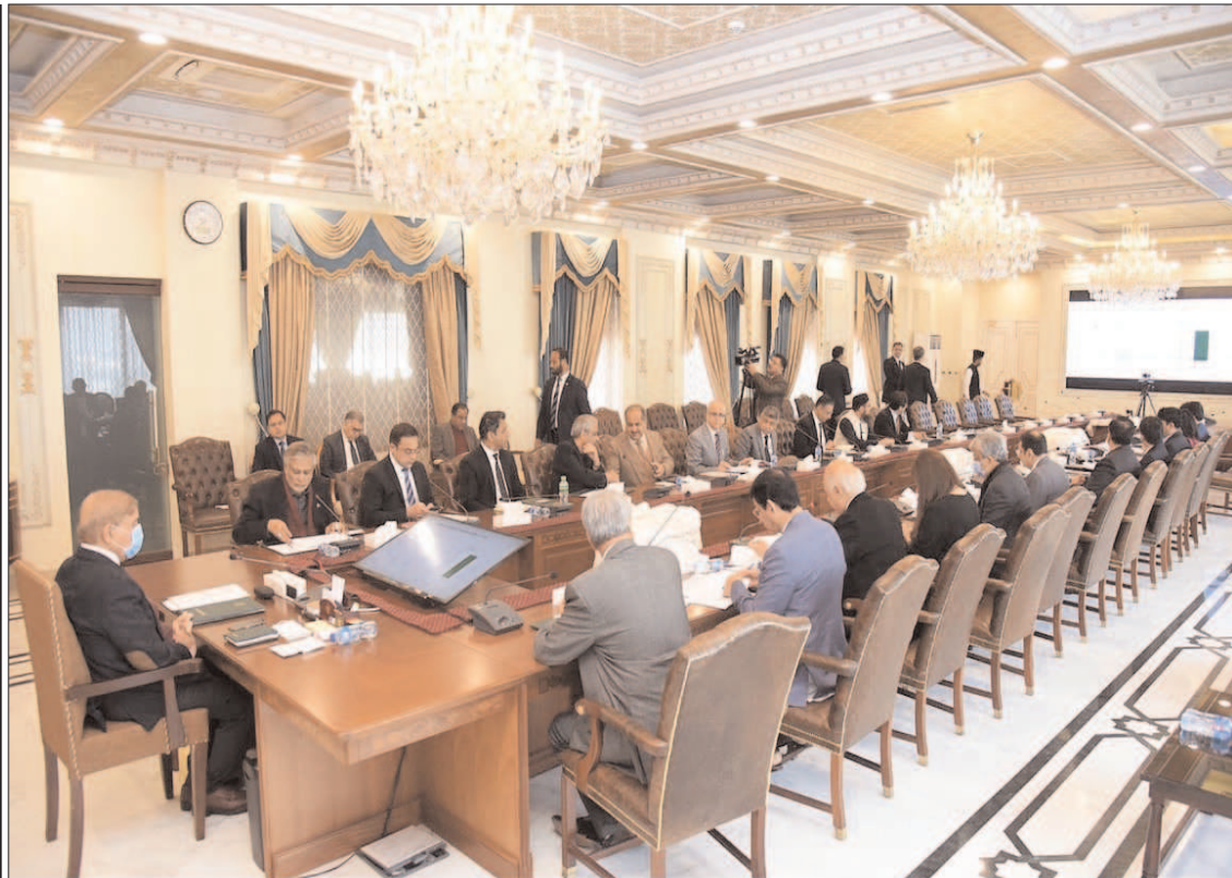
ISLAMABAD: Prime Minister Muhammad Shehbaz Sharif chairs a meeting on Information Technology Exports.