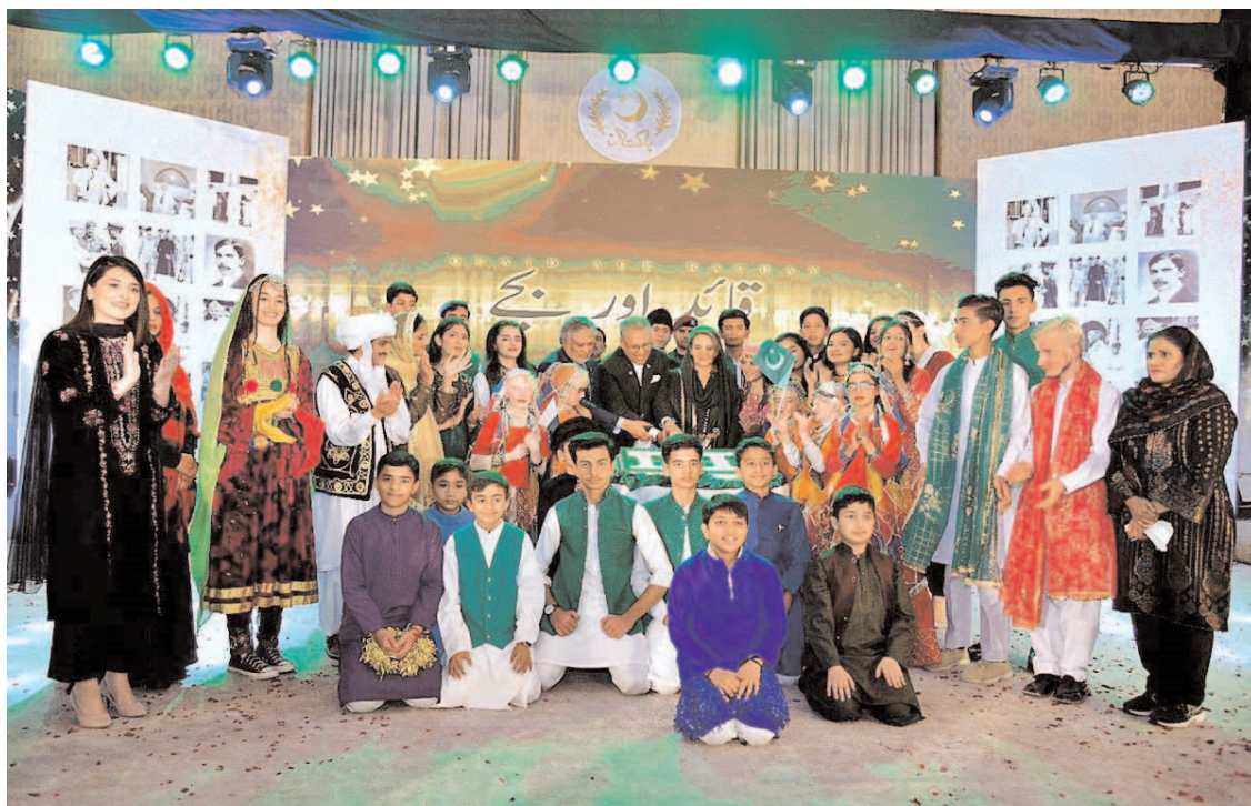
ISLAMABAD: President Dr Arif Alvi along with the Federal Minister for Finance and Revenue Senator Muhammad Ishaq Dar, First Lady Begum Samina Arif Alvi and children cutting cake on Quaid-e-Azam Muhammad Ali Jinnah's 146 birth anniversary at Aiwan-e-Sadr.