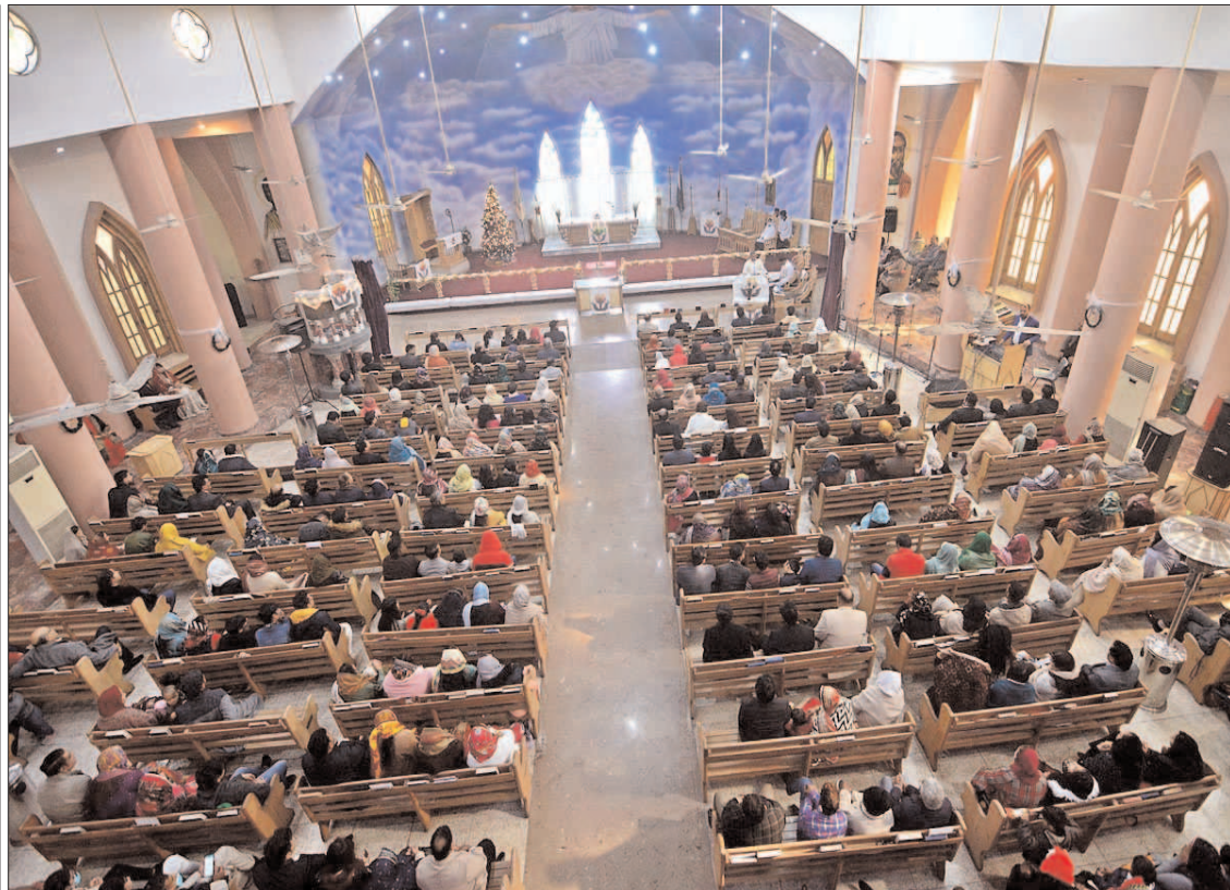
LAHORE: People from Christian community performing their religious rituals during special service on Christmas Day at St Peter's Church.