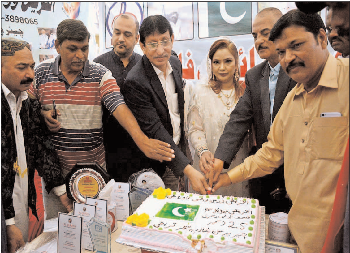
KARACHI: Federal Minister for Information Technology (IT) Syed Aminul Haque cutting cake celebrating the 146th birth anniversary of Quaid-e-Azam Mohammed Ali Jinnah.

Despite the claims of PEPD, the ground situation feels worrisome and there is dire need of concrete measures to fight out this menace to secure human health and overall environmental conditions.