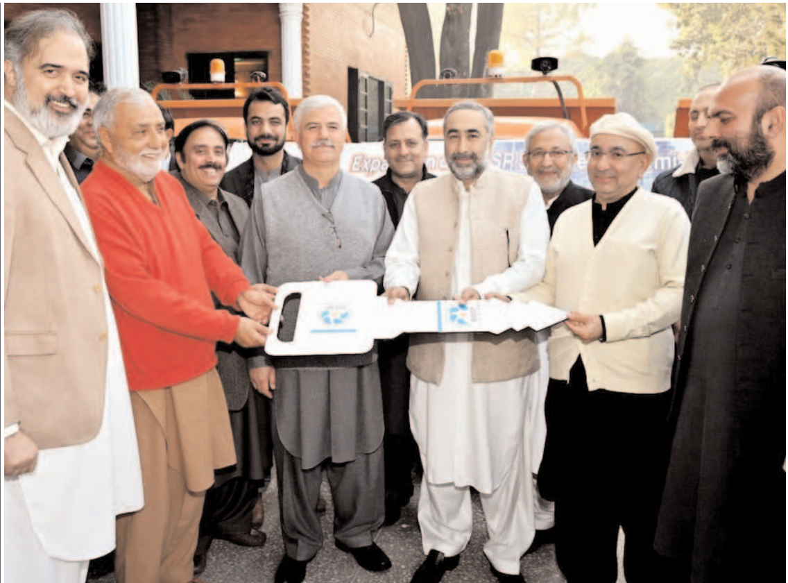
PESHAWAR: Chief Minister Khyber Pakhtunkhwa Mahmood Khan handing over newly purchased Solid Waste Machinery to Water and Sanitation Services Peshawar.

PESHAWAR (APP): The Governor Khyber Pakhtunkhwa Haji Ghulam Ali on Sunday urged general public to play their participatory role for the development and prosperity by following the guiding principles of the Quaid-e-Azam Mohammad Ali Jinnah of unity, faith and discipline. In a message issued here on the occasion of Quaid's Day, Governor Khyber Pakhtunkhwa said that we have to serve with dedication in all sections to make our country prosperous. To ensure security and prosperity, the unshakable consensus and unity in our ranks should be made more fruitful; he added that we have to pledge to make every kind of sacrifice for the development and security of the motherland.