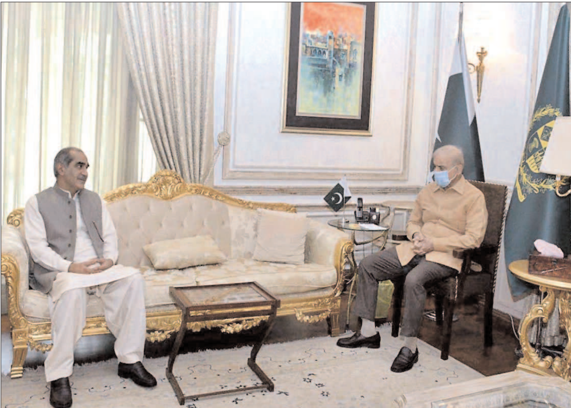
LAHORE: Federal Minister for Railways and Aviation Khawaja Saad Rafique calls on Prime Minister Muhammad Shehbaz Sharif.

"Security forces remain determined to challenge their nefarious designs, even at the cost of blood and lives. The sanitization Operation continues in the area to apprehend perpetrators," the ISPR said.