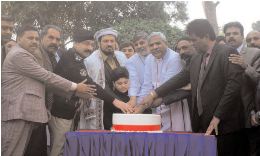
PESHAWAR: Governor Khyber Pakhtunkhwa Haji Ghulam Ali with Christian community members cutting cake on Christmas day.

separate homeland for Muslims had moved the people of K-P (then known as NWFP). They had decorated their homes, bazaars, and towns with Muslim League flags inscribed with different slogans of Pakistan and Quaid e Azam Zindabad to welcome their beloved leader. It was the love of people of K-P with Quaid Azam that Muslim League had won more than 50 seats in this province and after that nobody could stop independence movement of Pakistan from here. He said that Quaid e Azam was a great symbol of independence and democracy who strongly believed in power of the masses, rule of law, equality and supremacy of constitution and that was the major reasons that he had created Pakistan after a short time of seven years following adaptation of historic Pakistan Resolution at Lahore on March 23, 1940. The college's clock tower, which now becomes the pride symbol of Peshawar, has for long figured on the back of Rs 1000 currency note.