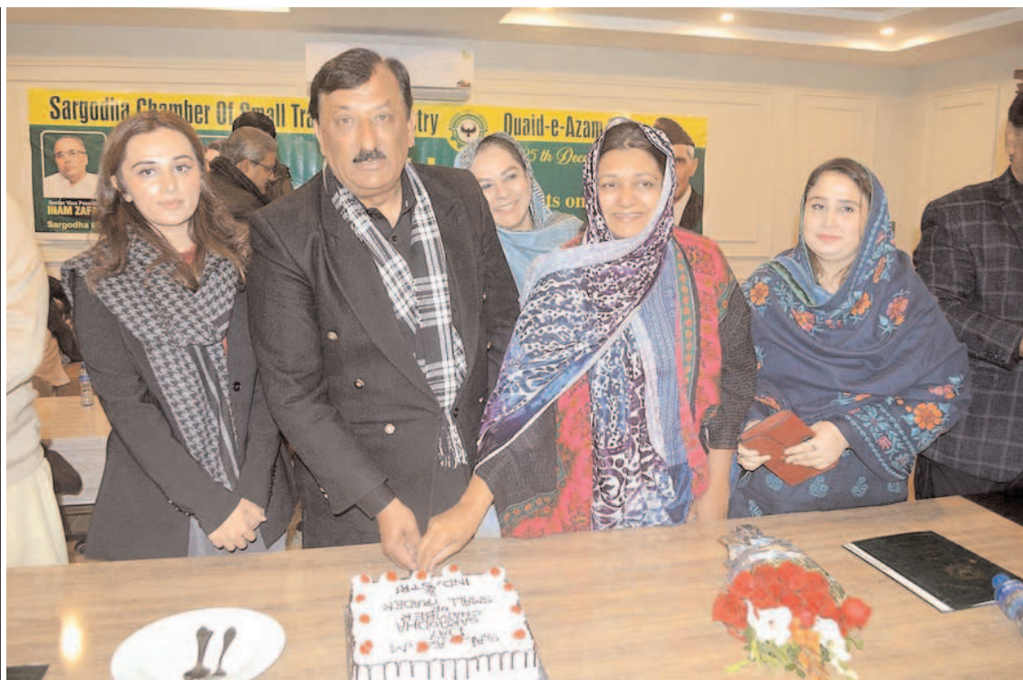
SARGODHA: State Minister for Industries and Production Tasneem Ahmed Qureshi with members of Sargodha Chamber of Small Traders and Industries cutting cake to celebrate birthday of Quid-e-Azam.

However, he said that the PIDE emphasizes that its Charter of Economy must not be mistaken for a policy document, rather it is meant to set the direction for future policy frameworks. PIDE enunciated that the Charter should be considered as a live document, open to changes and improvement. The Institute looks forward to any consultation, feedback or dialogue in this regard.