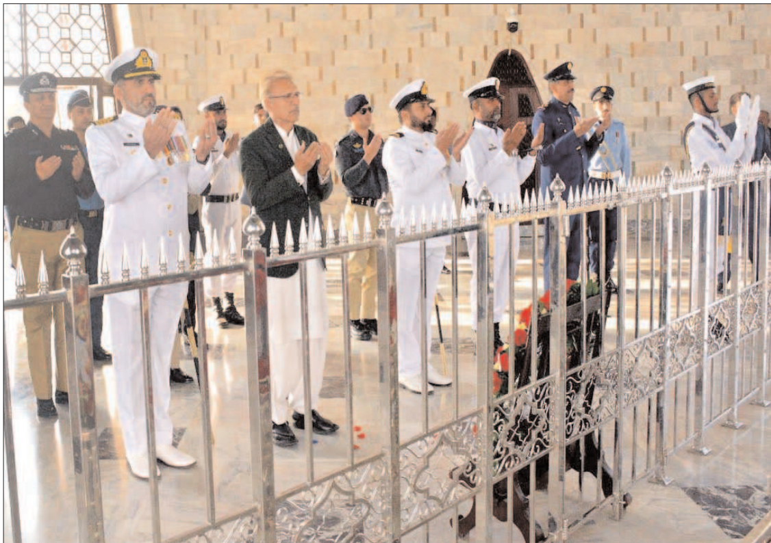
KARACHI: President Dr Arif Alvi offering Fateha at the mausoleum of Quaid e Azam.

Earlier, the children paid tribute to Quaid-e-Azam through speeches and shed light on different aspects of Quaid-e-Azam's life and his love for youth and children. Children with disabilities and students from different schools of Islamabad gave cultural performances and performed medleys highlighting the cultural diversity of the country and paid rich tribute to the Founding Father of the nation.