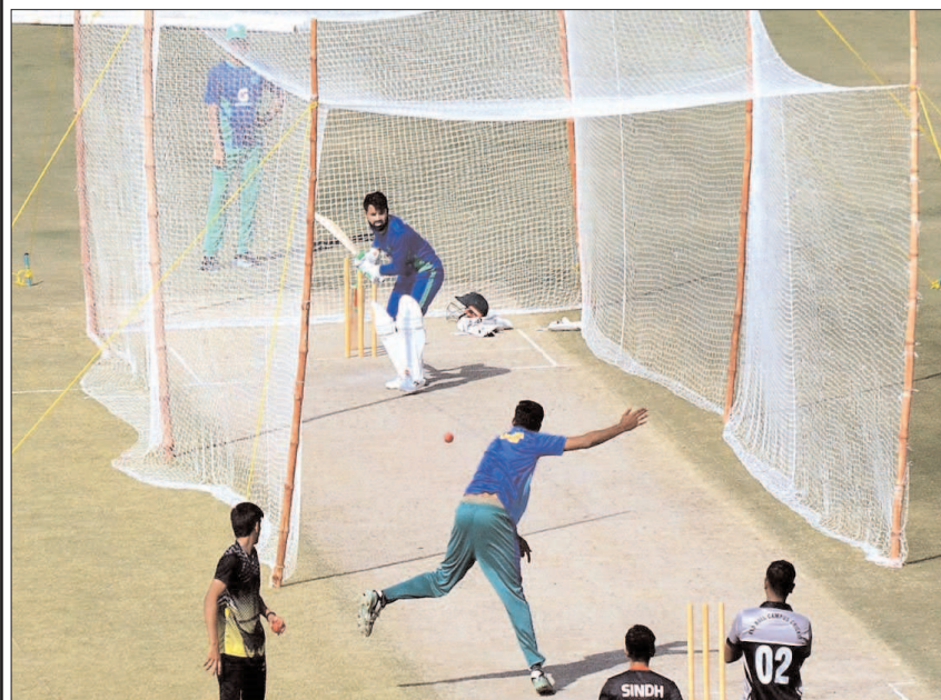
KARACHI: Pakistan Cricket Team during net in Practice Session ahead of the first Test Match at the National Stadium.

South Africa squad: Dean Elgar (capt), Temba Bavuma, Gerald Coetzee, Theunis de Bruyn, Sarel Erwee, Simon Harmer, Marco Jansen, Heinrich Klaasen, Keshav Maharaj, Lungi Ngidi, Anrich Nortje, Kagiso Rabada, Rassie van der Dussen, Kyle Verreynne, Lizaad Williams, Khaya Zondo