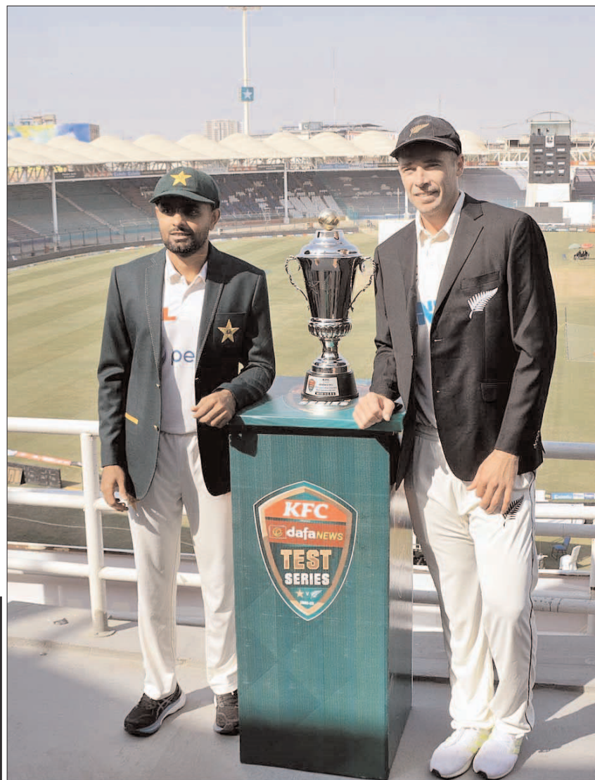
KARACHI: Pakistan Cricket Team captain Babar Azam and New Zealand's captain Tim Southee posing for photograph after unveiling Test Series Trophy ahead of first Cricket Test match at the National Stadium.

Rock-solid Pujara was named player of the series, with the Sussex star making 222 runs in the series.