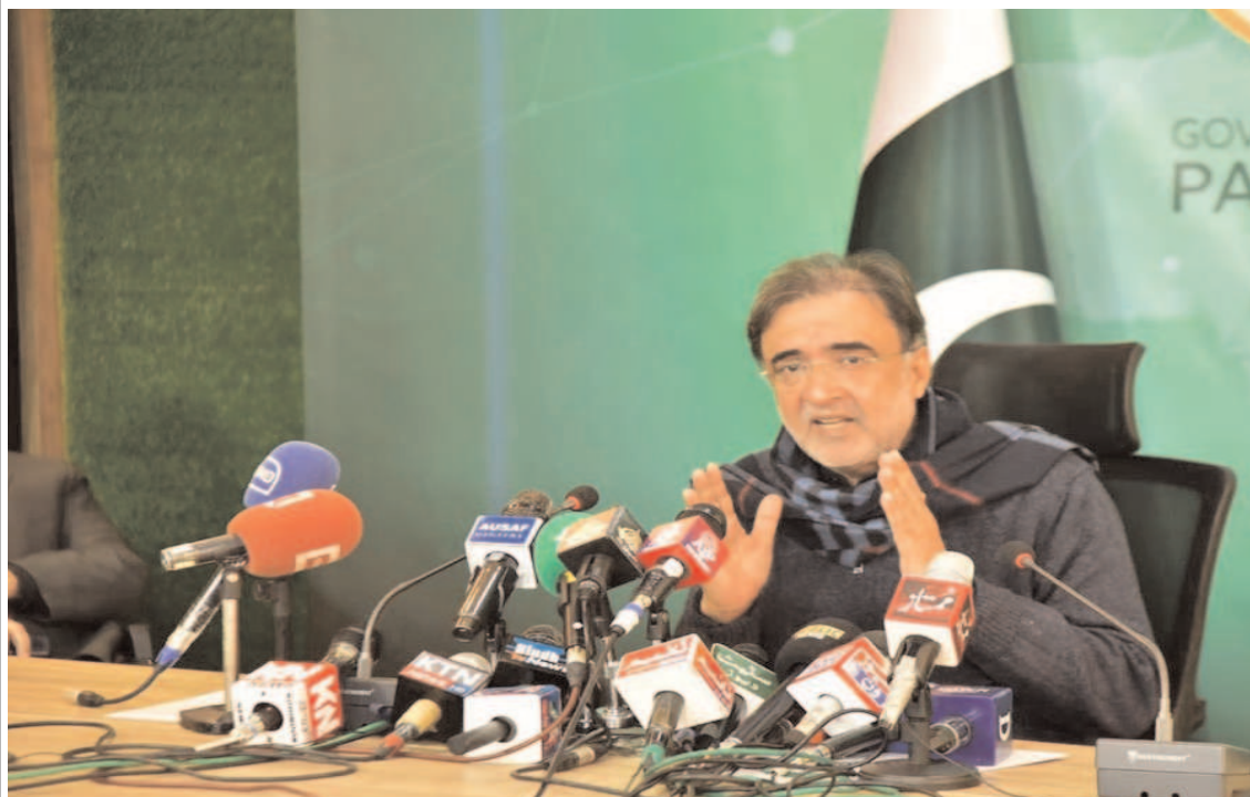
ISLAMABAD: Advisor to the Prime Minister on Kashmir Affairs and Gilgit Baltistan Qamar Zaman Kaira addressing a press conference.

The mission through which Pakistan will touch the heights of development. Pakistan will be economically, socially and socially strong. Chairman of Pakistan People's Party Bilawal Bhutto Zardari is moving forward with this mission. Let us make this determination that we have to make Pakistan a developed and progressive country, she said.