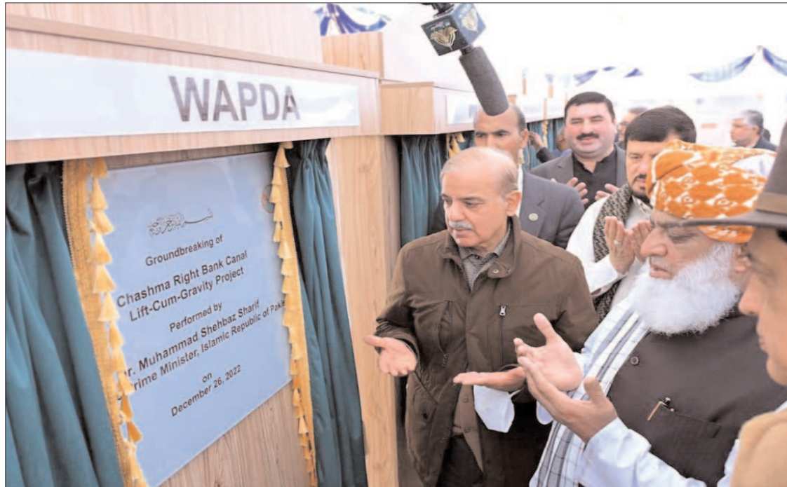
DERA ISMAIL KHAN: Prime Minister Muhammad Shehbaz Sharif laying foundation stone of development projects for Southern Districts of Khyber Pakhtunkhwa.

KYIV (AFP/APP): Ukraine on Monday called for Russia to be removed from the United Nations, where Moscow can veto any resolution as a permanent member of the Security Council. "Ukraine calls on the member states of the UN... to deprive the Russian Federation of its status as a permanent member of the UN Security Council and to exclude it from the UN as a whole," the foreign ministry said in a statement.