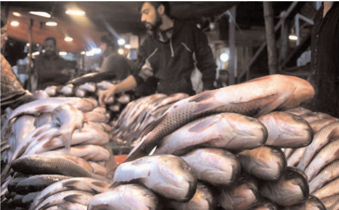
LAHORE: A vendor displaying fishes at outside Delhi Gate as demand increased due to cold weather.