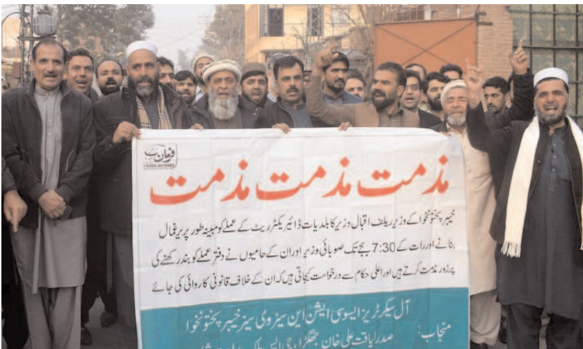
PESHAWAR: Members of All Secretaries Association NCs KP chanting slogans during a protest for their rights.

He stated that this convocation is not a farewell ceremony, but it is a day of recognition of the success and achievements of students of IMSciences.