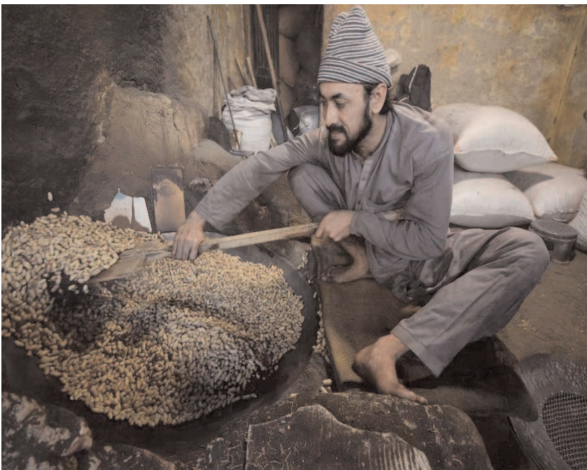
PESHAWAR: Laborer roasting peanuts at his workplace at Firdoos area.

He said, "KMU education is being imparted in various fields from Diploma and Bachelor to MPhil, Master, and PhD levels and now with the approval of FCPS training in four disciplines, KMU has achieved another milestone which is a great honor and contentment for its family."