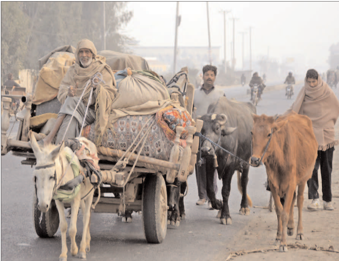
FAISALABAD: A gypsy man riding donkey cart as carrying his belongings on his way at Sumandri road during chill weather.