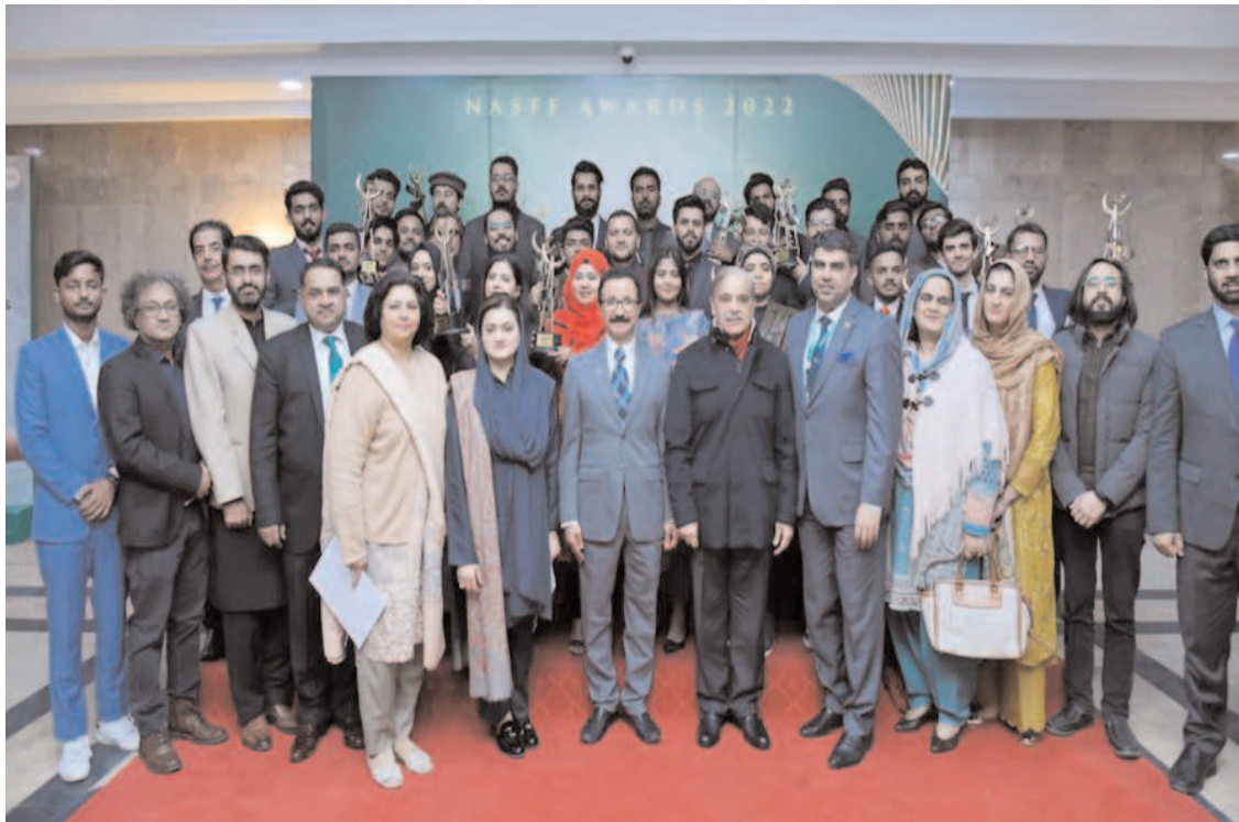
ISLAMABAD: Prime Minister Muhammad Shehbaz Sharif in a group photo with the award winners of National Amateur Short Film Festival (NASFF) 2022 in Islamabad.