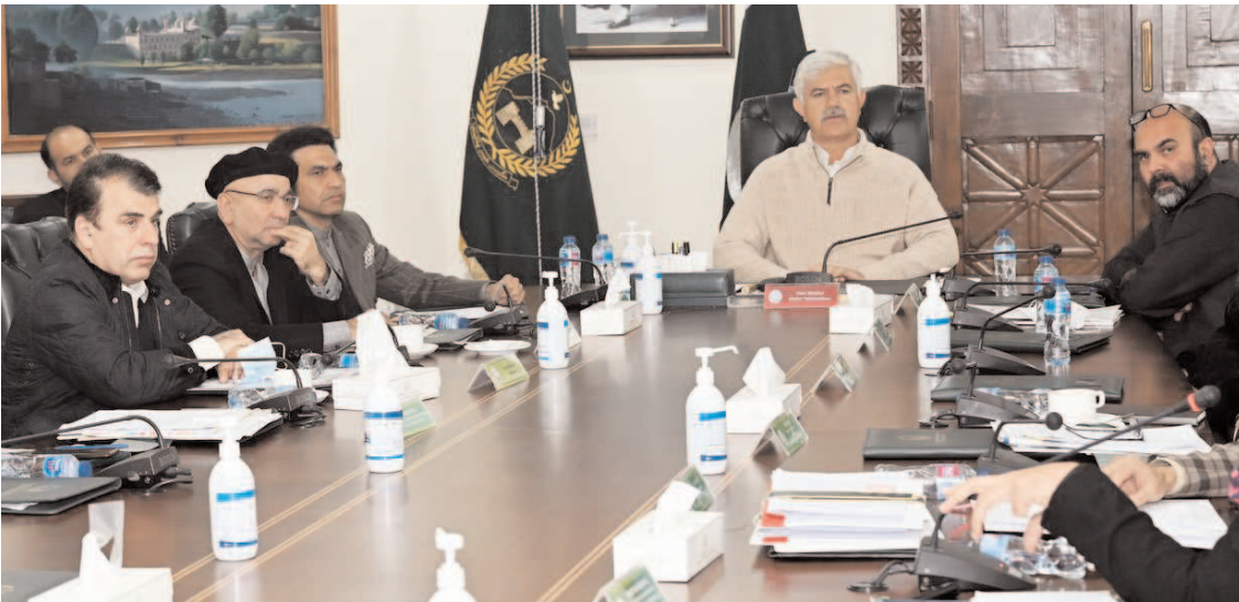
PESHAWAR: Chief Minister Khyber Pakhtunkhwa Mahmood Khan chairing 10th meeting of Peshawar Development Authority Board.