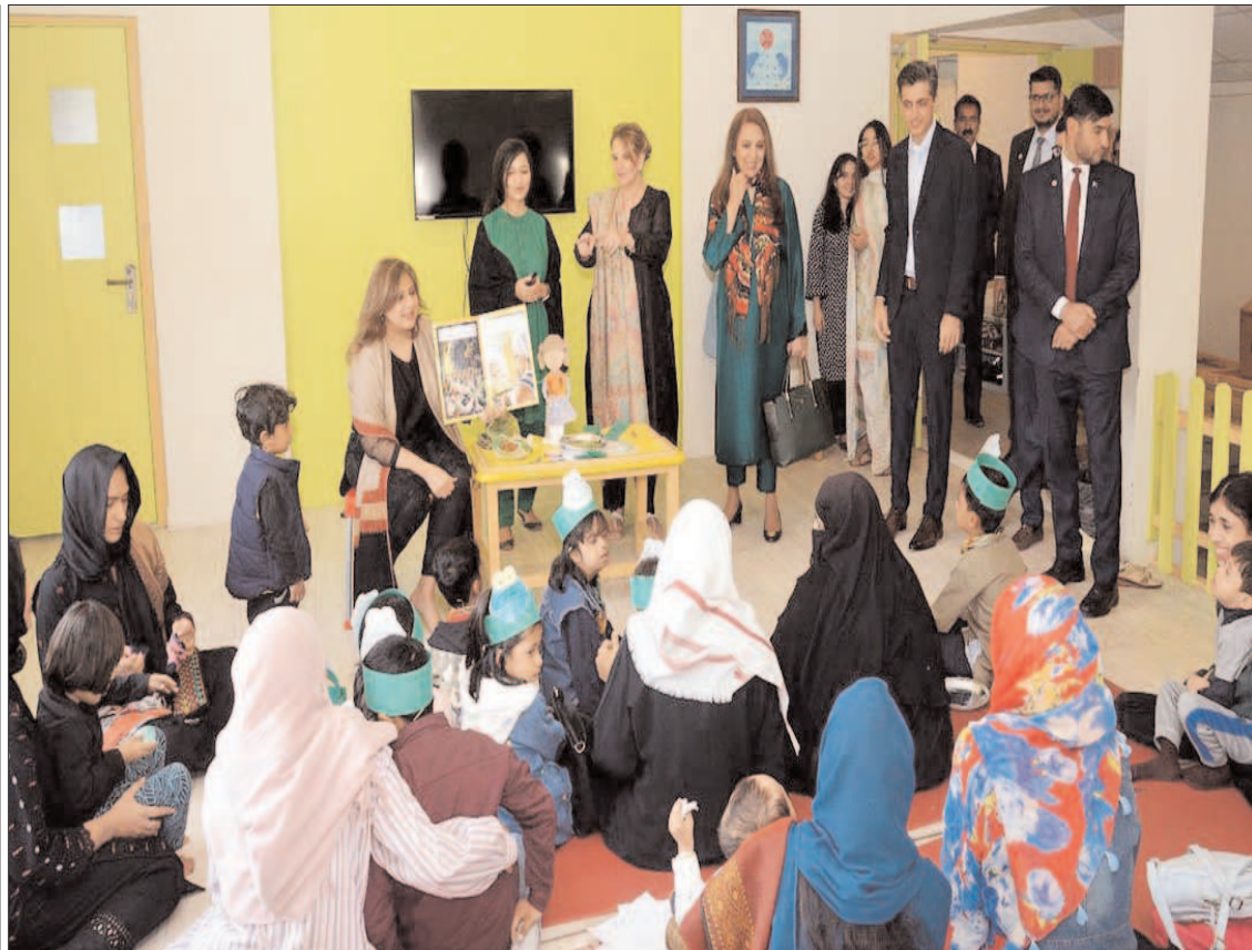
KARACHI: First Lady Begum Samina Arif Alvi during her visit to KDSP Learning Center.