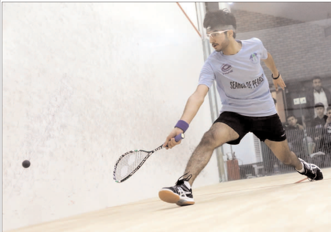
ISLAMABAD: A view of squash match during the PSF-National Squash Championship 2022 at Mushaf Squash Complex.