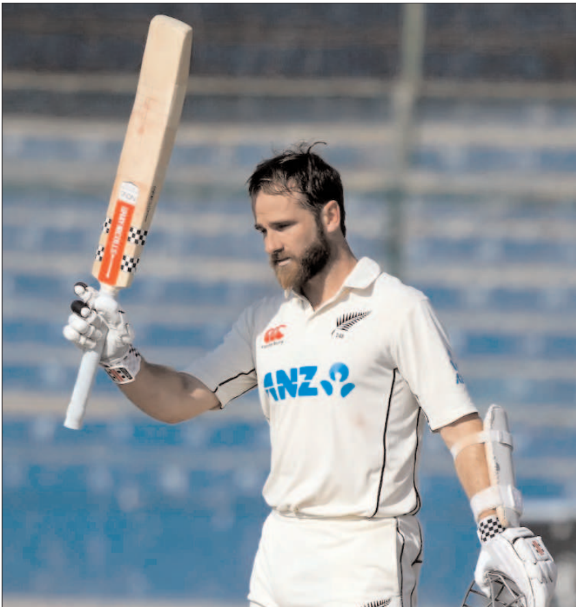
KARACHI: New Zealand's Kane Williamson celebrates after scoring 200 runs during the fourth day of first test cricket match.

63 – also against Pakistan in 2014 – while Southee and Neil Wagner followed without scoring. Williamson was on 186 when last man Ajaz Patel walked in but went into the 190s with a straight six over the head of Abrar before eventually reaching his second double hundred against Pakistan in a 395-ball knock. It was Williamson's first international score of over 100 in almost two years since he made 238 against Pakistan at Christchurch in January 2021. Williamson fully capitalized on two stumping chances early in his innings and also twice successfully overturned onfield lbw rulings against him through television referrals as Pakistan rued the missed opportunities. Sodhi batted with a lot of patience and hit three boundaries against seamer Mir Hamza on the off side of the wicket after Pakistan took the third new ball. Hamza, also making a comeback after playing his only previous test against Australia in 2018, could have had his first wicket in the penultimate over before the break but Pakistan didn't appeal as the TV replays suggested he got a thin outside edge of Sodhi's bat. New Zealand's lead was 24 when Nauman came close to dismissing Williamson on 116 in his second over of the day. But Williamson quickly went for a successful television referral against umpire Aleem Dar's lbw ruling after he missed a full-length delivery down the legside and the TV replays suggested the ball had pitched outside the off stump.