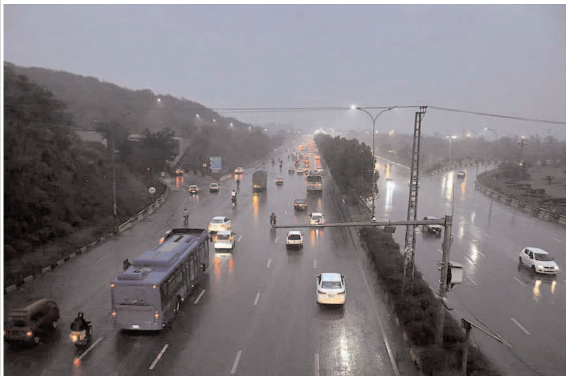
ISLAMABAD: Mercury rapidly drops due to light rain followed in the twin cities.

foreigners who have overstayed for more than one year may be put into the blacklist category, barring their entry to Pakistan in the future. The NADRA received online applications till December 29, 2022. The penalty charges would be imposed on those overstaying in the country after the date of January 01, 2023.