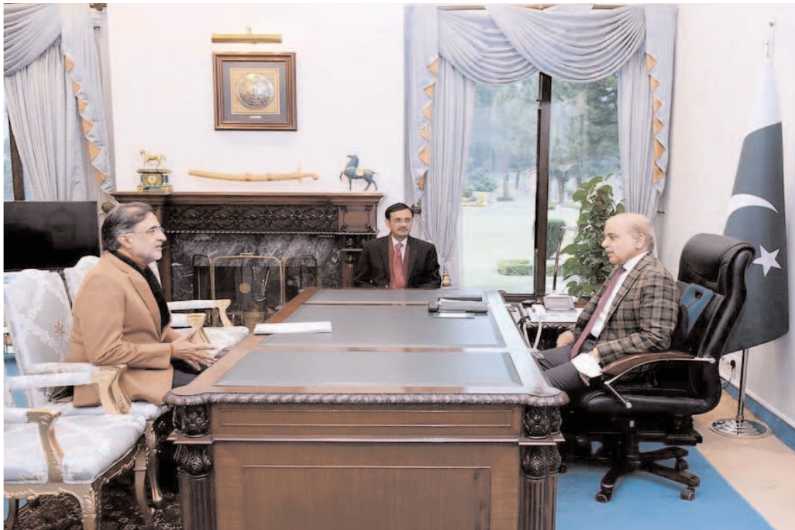
ISLAMABAD: Adviser to the Prime Minister on Kashmir and Gilgit Baltistan Affairs, Qamar Zaman Kaira calls on Prime Minister Muhammad Shehbaz Sharif.