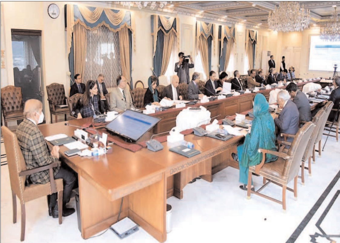
ISLAMABAD: Prime Minister Muhammad Shehbaz Sharif chairs a review meeting regarding Resilient Pakistan Conference to be held next month in Geneva, Switzerland.

The matters relating to the ministry and the overall political situation in the country came under discussion.