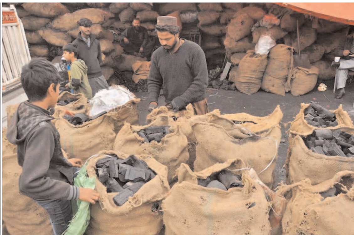
ISLAMABAD: A vendor selling coal during winter season at his roadside setup.

The price of gold in the international market increased by $04 and was sold at $1,807 against its sale at $1,803, the association reported.