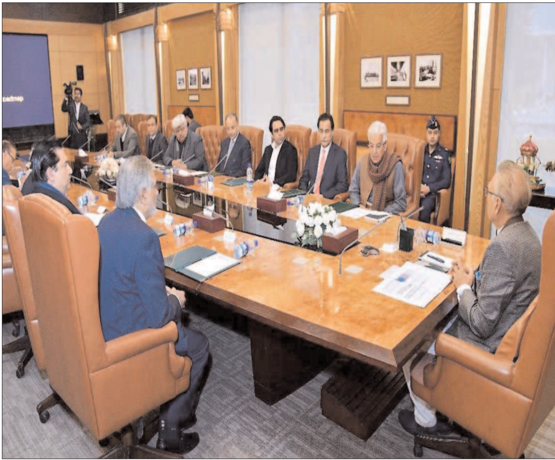
ISLAMABAD: President Dr. Arif Alvi chairing a meeting on energy conservation, at Aiwan-e-Sadr.