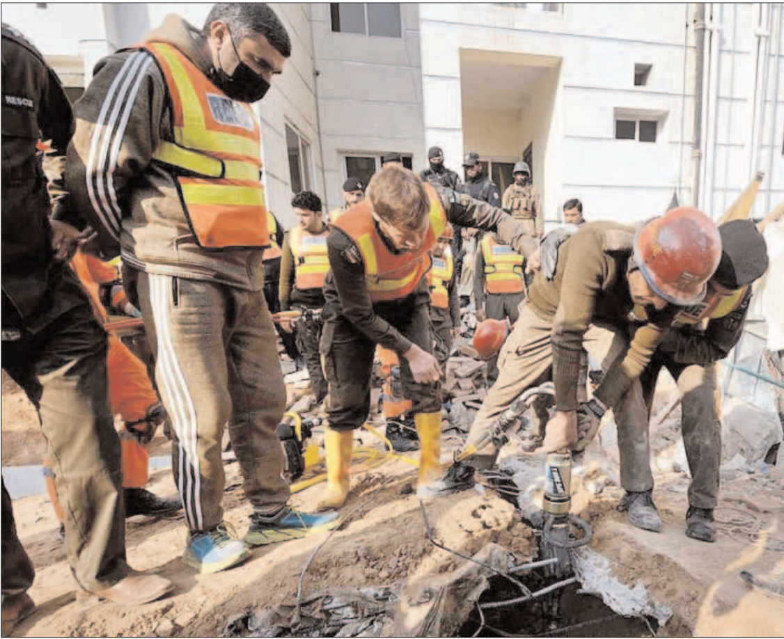
PESHAWAR: Rescue 1122 workers busy in rescue work on the spot after yesterday's bomb blast in Police Lines. (Another picture on City page)