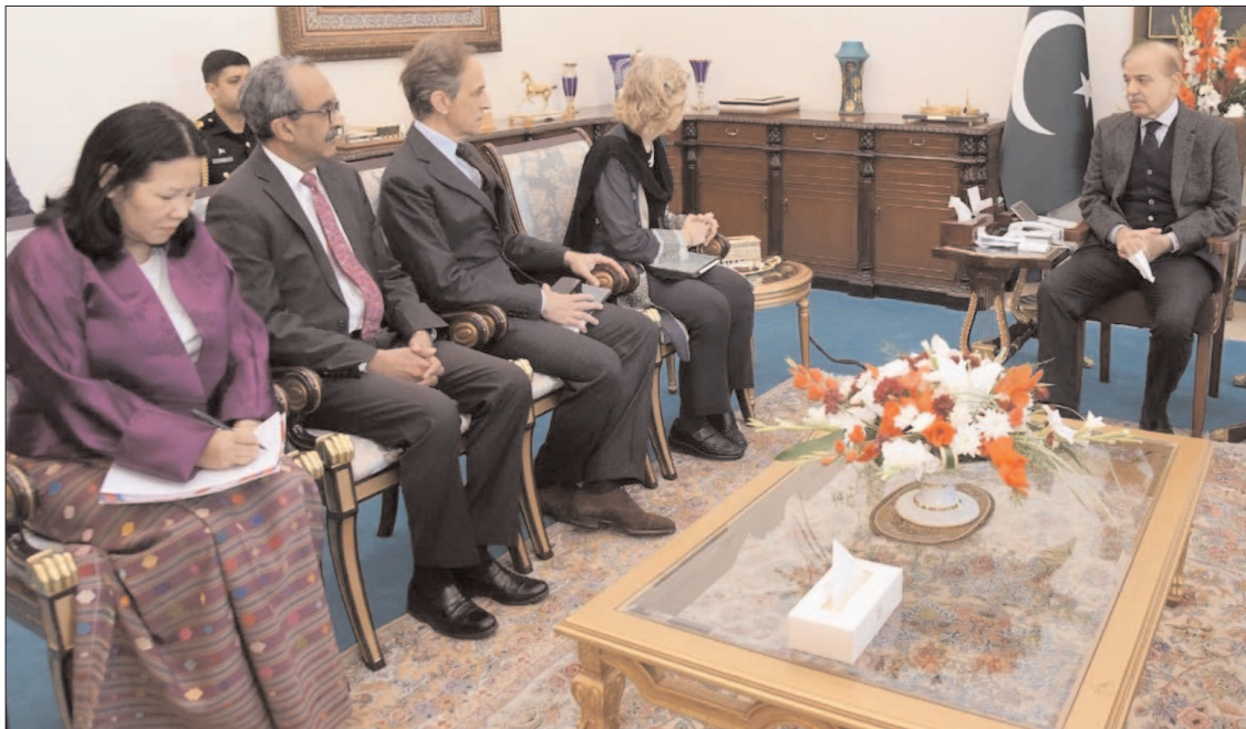
ISLAMABAD: Ms. Inger Andersen, Executive Director of United Nations Environment Programme, called on Prime Minister Shehbaz Sharif.

The police summoned the person residing in the house who gave the undertaking to vacate the house. Afterwards, a suit was filed in court that the house was purchased in 2008 based on a forged agreement dated 02.07.2008. The complainant approached FOSPAAH for the vacation of the house that passed the orders in the complainant's favour. The orders were then challenged by the accused person by filing a representation with the president, which was rejected.