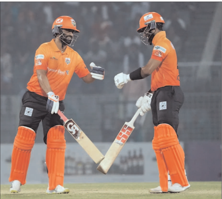
SYLHET: Tamim Iqbal and Shai Hope put on 184 runs for the second wicket.

President PHF approved the prohibition orders, under which the former manager national hockey team will not be able to take part in any activity.