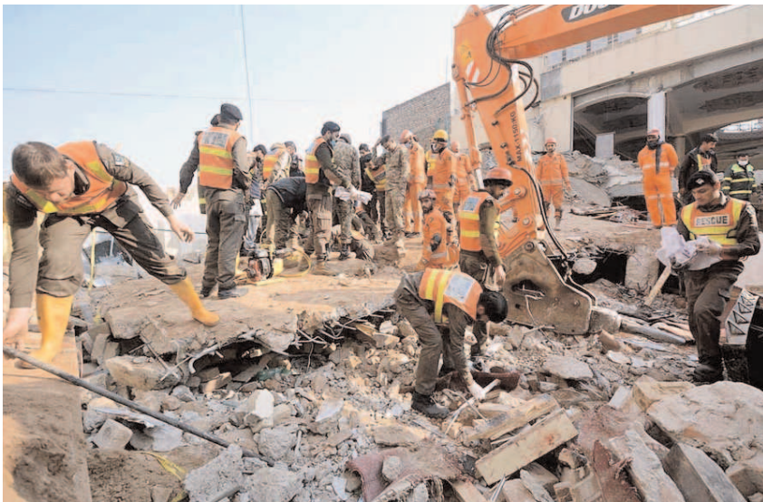
PESHAWAR: Rescue 1122 workers busy in rescue work on spot after Monday's bomb blast in Police Line.

The Civil Aviation Authority (CAA) appreciated the act of honesty of the employee and the valuable items were returned to their owner.