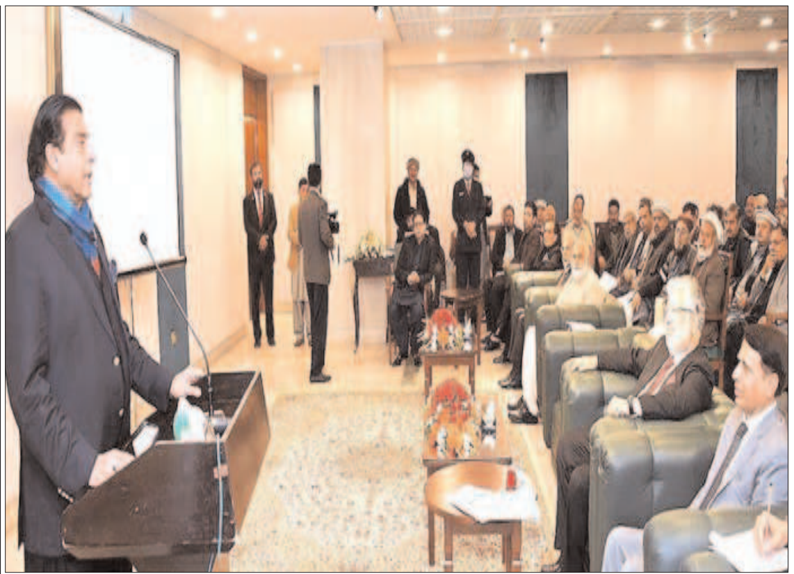
ISLAMABAD: Speaker National Assembly Raja Pervaiz Ashraf addressing the notables of his constituency regarding establishment of Sub-Campus of university of Punjab, Gujar Khan at Parliament House.

It is pertinent to mention here that the IRU was formed in September 2016 with the intent of creating a running community that supports and encourages a healthy and active lifestyle through group events and participation.