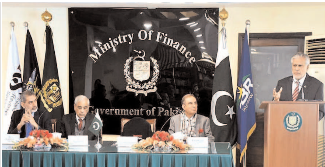
ISLAMABAD: Finance Minister Senator Mohammad Ishaq Dar addressing agreement signing ceremony of launching Pilot project of Digitization/Dematerialization on NSCs through CDC.

The price of gold in the international market decreased by US$22 to US$ 1,902 as compared to its sale at US$1,924 on the last trading day, the association reported.