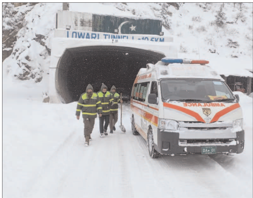
LOWER DIR: Police officials help an ambulance driver to pass on snow covered road near Lowari Tunnel on Thursday.