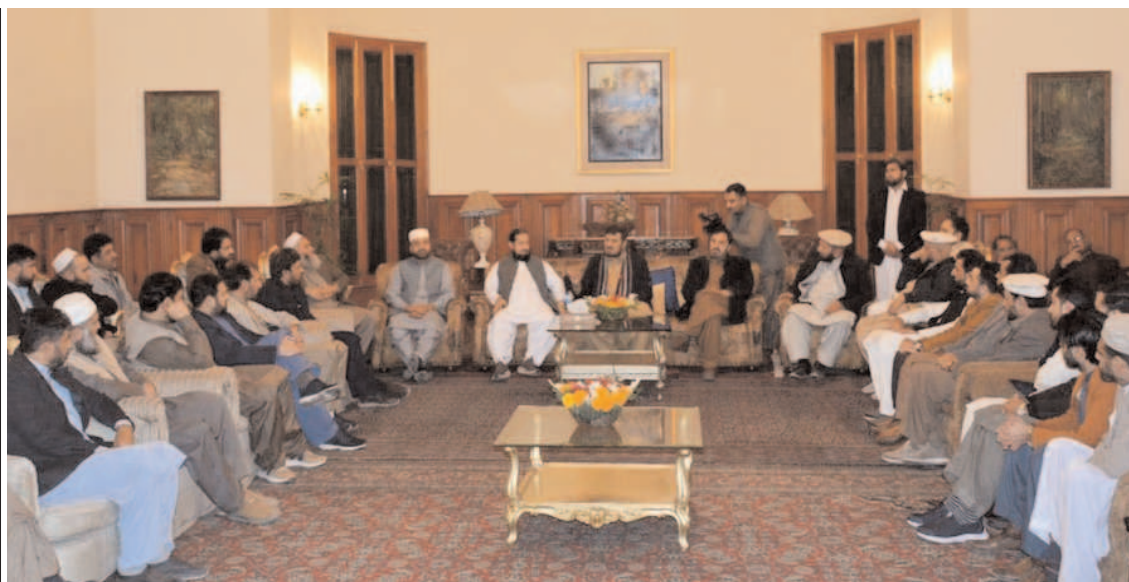
PESHAWAR: Delegation of trader union of Shafi Market meeting with Governor Khyber Pakhtunkhwa Haji Ghulam Ali.

The SECP has also started a dedicated WhatsApp facility for receiving queries. During December 2022, responses were sent to around 1,382 WhatsApp queries of local and foreign investors pertaining to name availability and incorporation; with 96 per cent satisfaction rate.