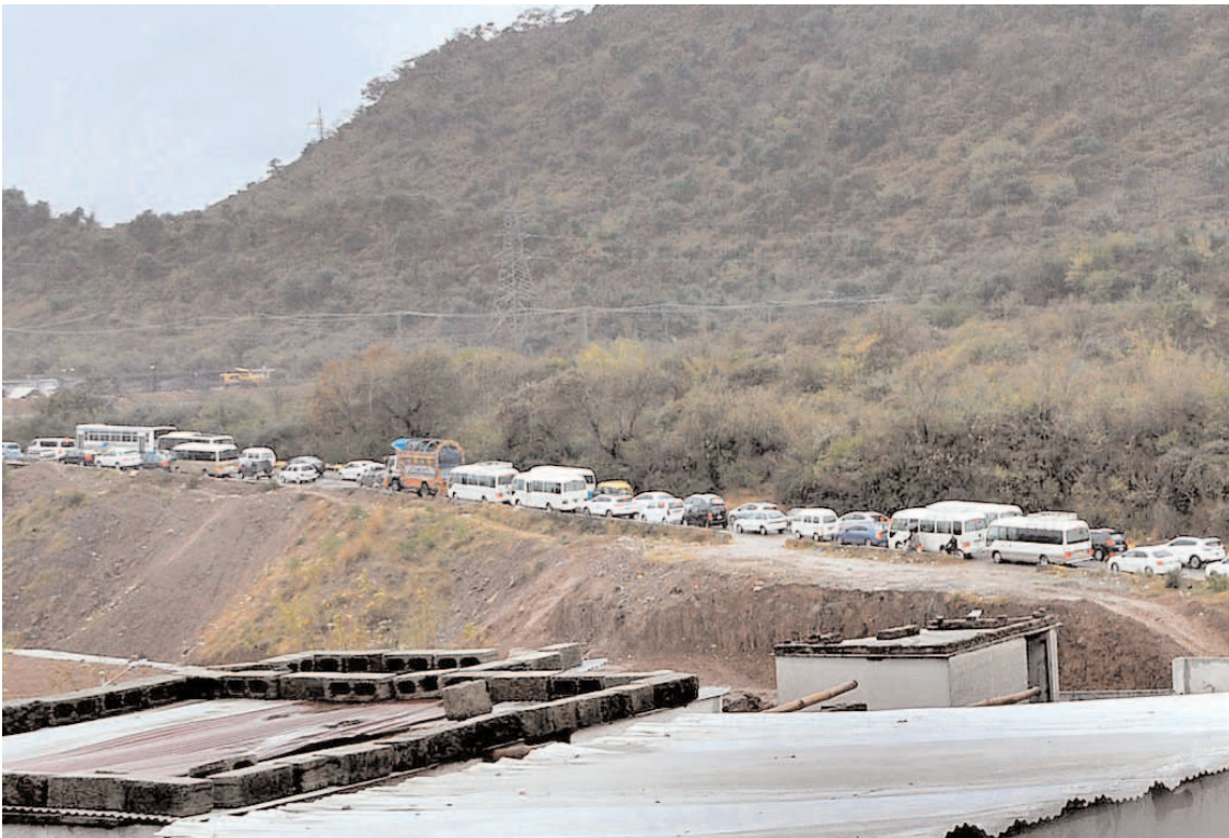
ISLAMABAD: Massive traffic came from Murree jammed due to construction of Bhara Kaho Bypass.