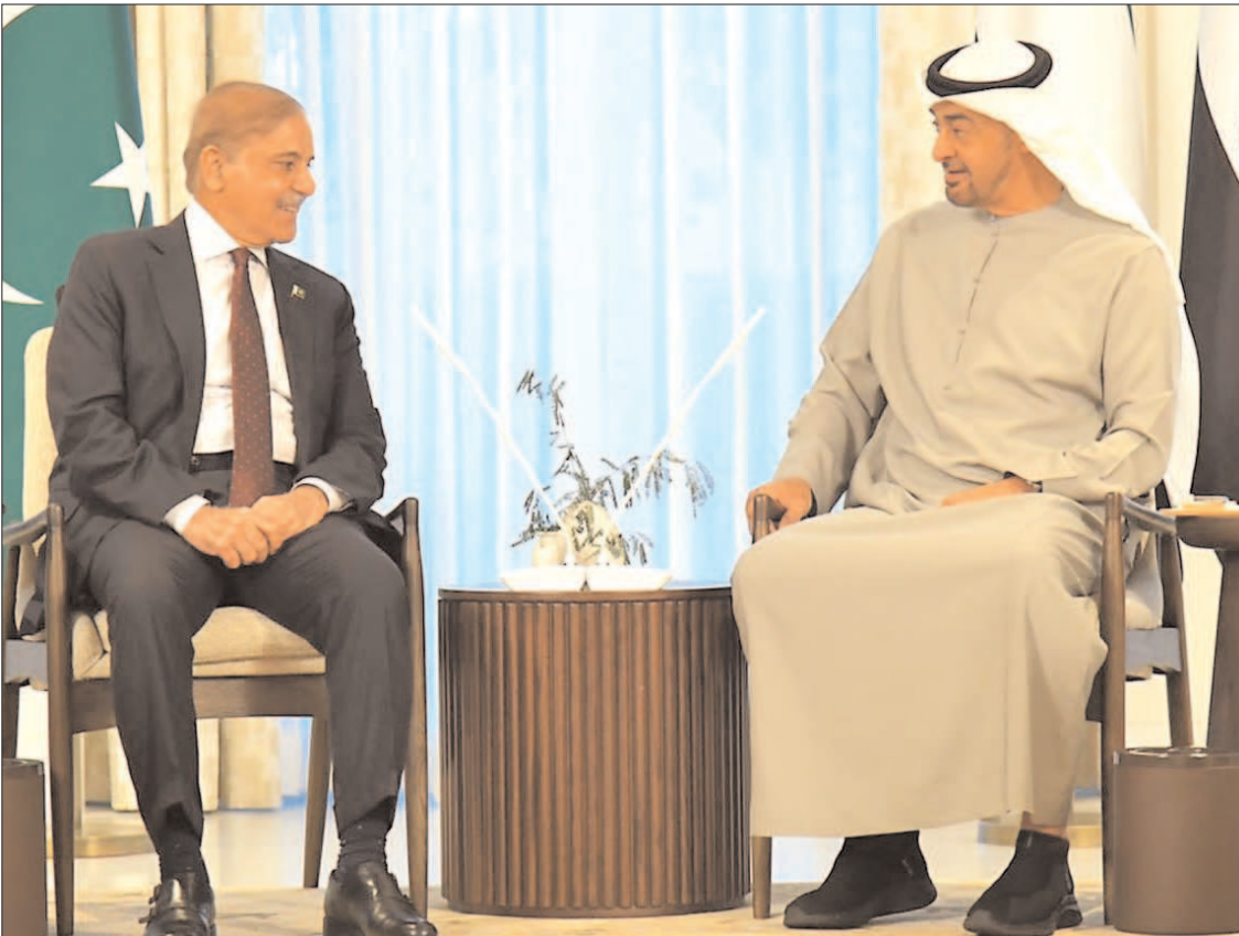
ABU DHABI: Prime Minister Shehbaz Sharif meeting with UAE President Sheikh Mohammed bin Zayed Al Nahyan.

All the programmes were aimed at helping the country achieve its sustainable development goals and build a prosperous future," he added. For his part, SFD CEO said that the agreement emphasised the Kingdom of Saudi Arabia's commitment to continue supporting the brotherly Islamic Republic of Pakistan. Islamabad's efforts to shore up the country's forex reserves with the help of Saudi Arabia — amid a worsening currency crisis — have started paying off as Riyadh is considering 'beefing up' its deposit in the State Bank of Pakistan (SBP) from $3 billion to $5 billion. According to Saudi media, Crown Prince Mohammad Bin Salman earlier this week directed his financial officials to study increasing the Pakistan deposit by $2 billion.