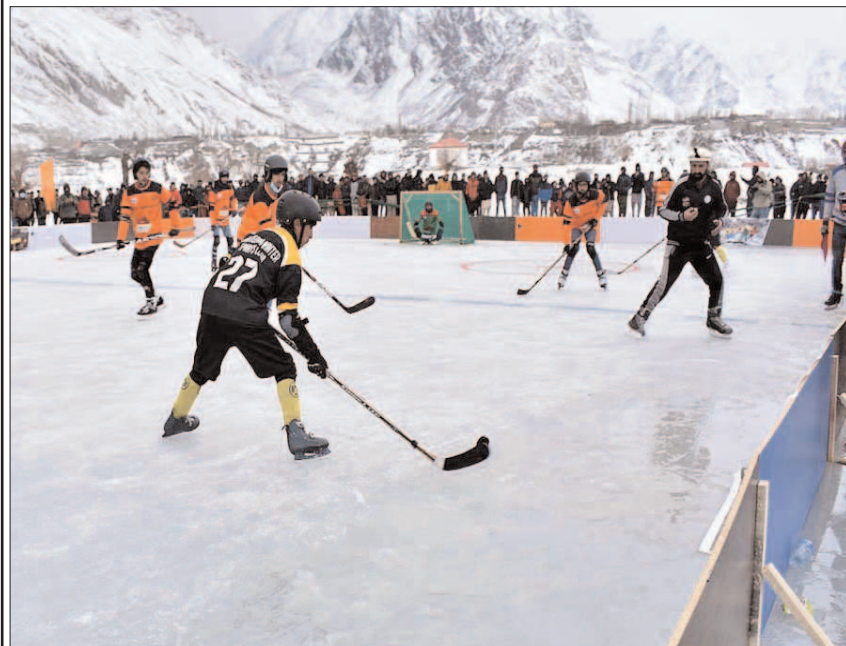
SKARDU: Player struggling to get hold on ball during the Balistan KGUN Festival 2023 Ice Hockey final match between Skardu Anchan and K2.