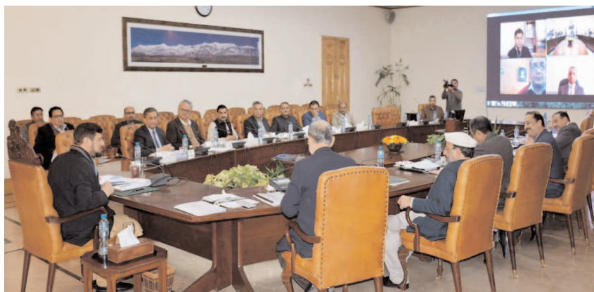
PESHAWAR: Governor Khyber Pakhtunkhwa Haji Ghulam Ali presiding over 32th BOG meeting of IM Sciences at Governor's House.

He further stated that people's trust has immensely increased resulting in a dramatic increase in the registration of complaints and complaints worth over Rs.3 billion were addressed by this office during the last year, otherwise these cases would have added burden to the civil courts. He said that Government expenditure per complainant in disposing of complaint through Wafaqi Mohtasib construes negligible amount, thus it the most cost-effective way of providing relief to the common man.