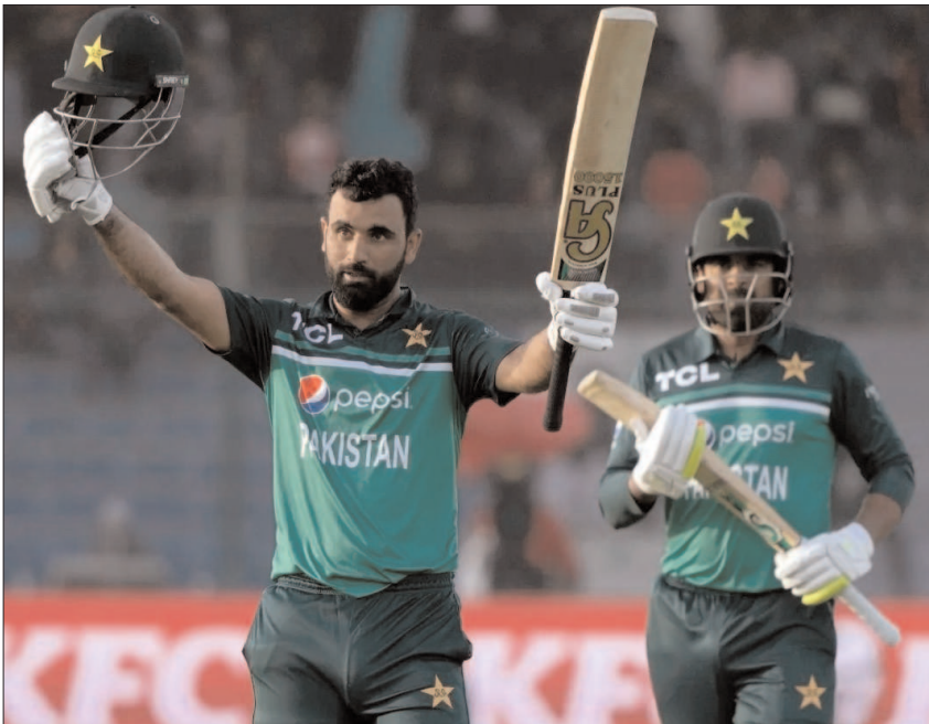
KARACHI: Fakhar Zaman celebrates his 8th ODI hundred.

"We want to focus on ourselves. We want to improve regarding the last games that we played. We want to be more competitive, and more consistent in our performances, to allow ourselves to win games."