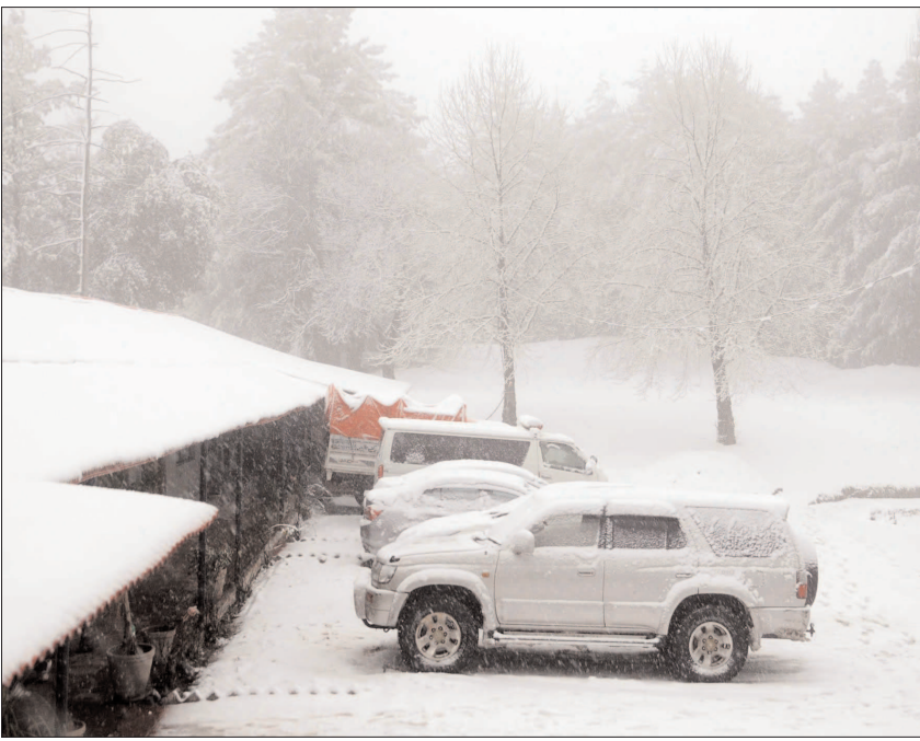
MURREE: A view of vehicles and trees covered with snow after heavy snowfall.