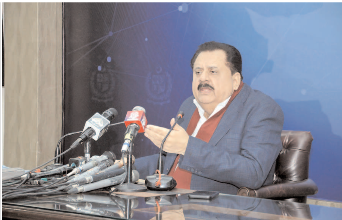
ISLAMABAD: Tariq Bashir Cheema, Federal Minister for National Food Security & Research addressing an important press conference at PID media center.

He said that last year wheat support price was fixed at Rs 2,200 and this year it was proposed to be fixed at Rs 3,000 per 40 kg, adding that the governments of Punjab, Balochistan and Khyber Pakhtunkhwa suggested fixing the support price at Rs 3,000 per 40 kg. However, Sindh has fixed the support price at Rs 4,000. In response to a question, he said that only certified soybeans have been released and no genetically modified organisms (GMOs) soybeans have been released.