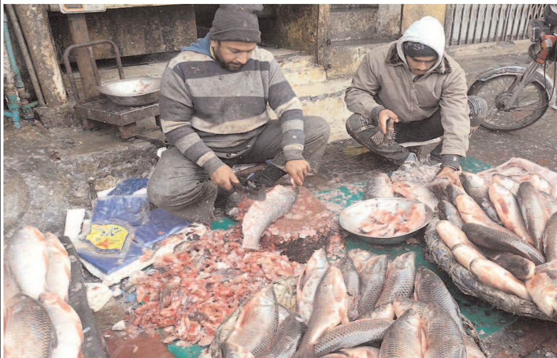
LAHORE: Vendors are cleaning and cutting fishes at their workplace.

The sale of Qingqi three-wheelers also showed a decrease of 51.56 per cent, by going down from 7,187 units to 3,481 units whereas the sale of United three-wheelers decreased to 770 units from the sale of 1,624 units, the data revealed.