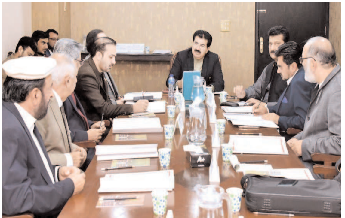
ISLAMABAD: Chairman Senate, Muhammad Sadiq Sanjrani presiding over a Senate house business advisory committee meeting at Parliament House in Federal Capital.

In the same context, Social Media platforms offer verification of accounts owned and operated by public figures, so as prevent misuse of their credential by miscreants. Sharing details of blocked sites, he said 104 fake links of daily-motion were blocked from out of 107; 2,105 links of Facebook from out of 3,214; 113 links of Instagram from out of 140; 1,401 links of others from out of 2,663 links of which the complaints were received; 46 links of Tik Tok were blocked from out of 50; 2,227 links of Twitter from out of 8,413; 422 links of YouTube from out of 857 were blocked.