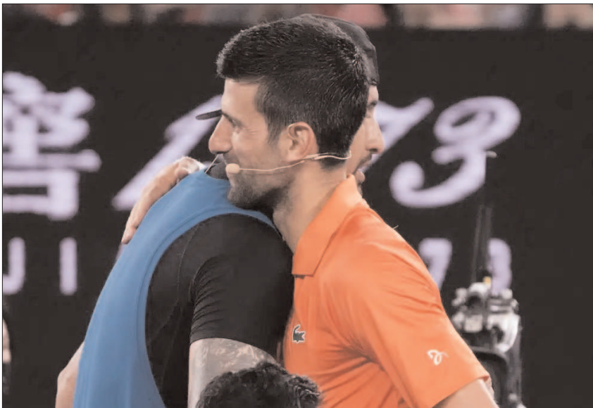
MELBOURNE: Nick Kyrgios, left, and Novak Djokovic embrace following an exhibition match on Rod Laver Arena ahead of the Australian Open tennis c'ship.

In his Test career, Akram took 414 wickets in 104 matches, a Pakistani record, at an average of 23.62 and scored 2,898 runs, at an average of 22.64. In One-Day Internationals (ODIs), Akram took 502 wickets in 356 appearances, at an average of 23.52 and scored 3,717 runs, at an average of 16.52.