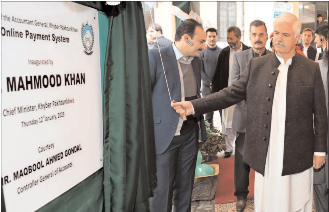
PESHAWAR: Chief Minister of Khyber Pakhtunkhwa Mahmood Khan inaugurating online payment system at Accountant General Complex.