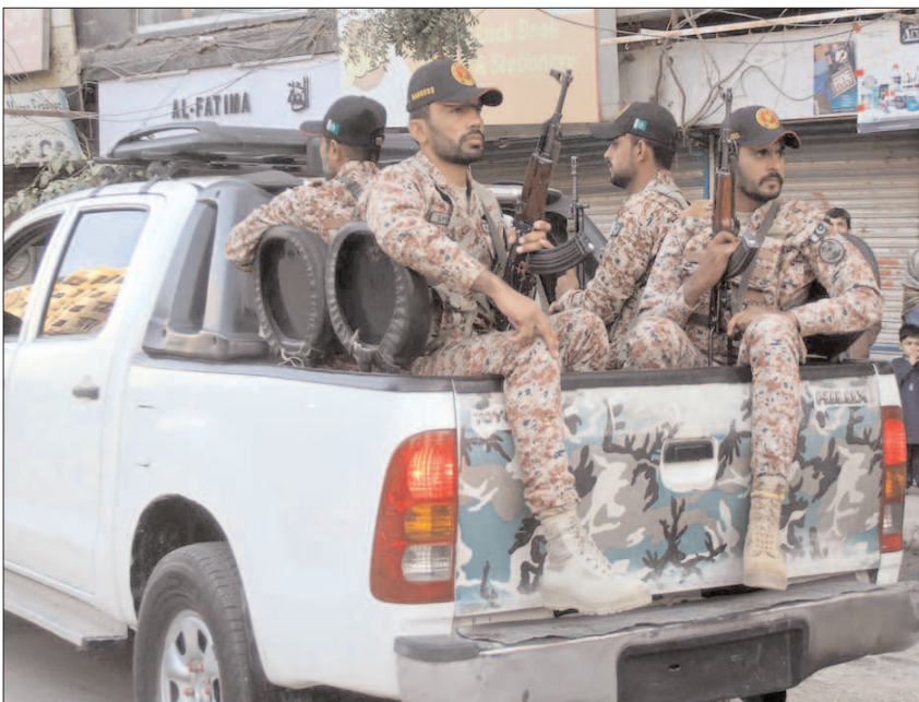
HYDERABAD: Rangers patrolling in the city to ensure law and order situation.

This he claimed that while talking to journalists in his office. He said that all the nine flour mills of Dir Lower are open, wheat is being supplied to all the flour mills according to the government quota, there is no crisis of flour and wheat in Dir Lower and abundant flour is available in every corner of the district. The quota of flour has been increased and 8820 bags of flour are being provided at discounted rates in Lower Lower and the discounted flour is being distributed in a very clear and transparent manner through 265 dealers appointed by the district administration. He said that flour hoarding and smuggling will not be allowed in Lower Lower.