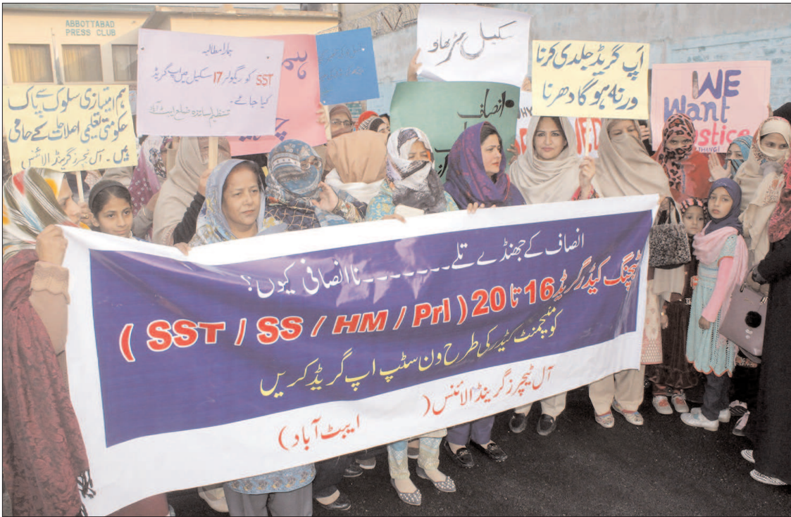
ABBOTTABAD: Teachers of government schools holding a protest in favour of their demands.

QUETTA (APP): Balochistan government's Spokesperson Farah Azeem Shah on Friday said that protection of the rights of fishermen was the responsibility of the government and necessary steps have been taken saying that the future of Balochistan was linked with development of Gwadar. The first right on Gwadar belongs to the locals here, she added. The spokesman of the provincial government said that for any economic development and acceleration of economic activities, the establishment of law and order and the enforcement of rule of law were very important.