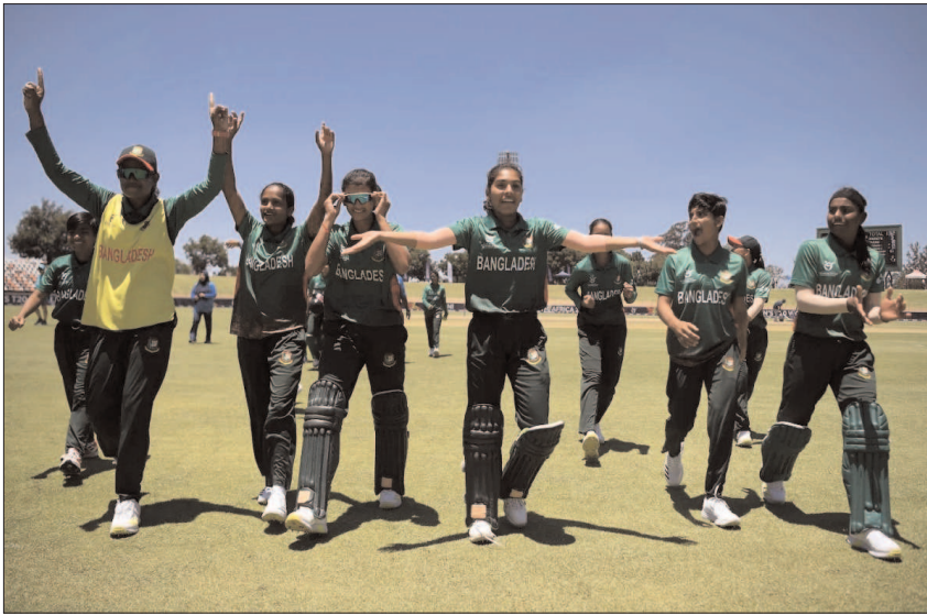
BENONI: Players of Bangladesh celebrate following the ICC Women's U19 T20 World Cup 2023 match between Australia and Bangladesh.

Since arriving in Australia, Djokovic has frequently mentioned that he doesn't hold a grudge over being kicked out of the country in 2022 for failing to follow its coronavirus rules — which have since been relaxed — and said Saturday: "Probably, if I'm not able to move on, I wouldn't be here."