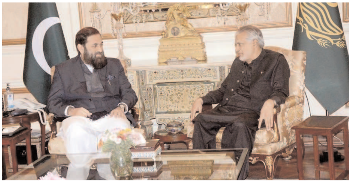
LAHORE: Federal Finance Minister Muhammad Ishaq Dar meeting with Punjab Governor Muhammad Baligh-ur-Rehman at Governor's House.

On this occasion, Federal Finance Minister Ishaq Dar said that there would be further improvement in the economy in the coming days. He said that such economic challenges had never been witnessed before in the history of the country, but despite this, the coalition government under the leadership of Prime Minister Shehbaz Sharif was using all its abilities to bring economic stability in the country.