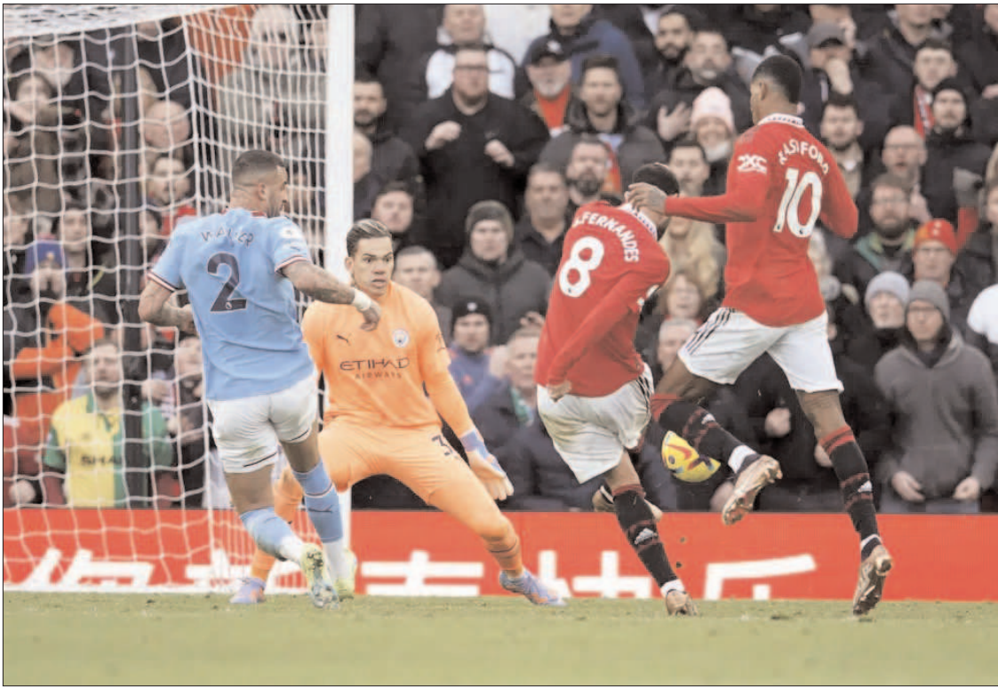
MANCHESTER: Manchester United's Bruno Fernandes scores his side's first goal during the English Premier League soccer match between Manchester United and Manchester City.

RIYADH (AFP): Real Madrid striker Karim Benzema says he has put his World Cup disappointment behind him and is focused on the future, starting with Sunday's Spanish Super Cup final. The 35-year-old forward dropped out of the France squad injured shortly before their first match, and retired from international duty in December. Ballon d'Or winner Benzema had been excited to feature after missing France's victory in 2018 because of his involvement in a blackmail scandal over a sex-type involving his former teammate Mathieu Valbuena. The forward returned from his thigh problem for Madrid at the end of December and has been finding his best form ahead of the final against rivals Barcelona. "What happened is over now, the important thing is tomorrow's game," Benzema told a news conference on Saturday. "I am feeling well in my head and my body, the rest is in the past. It was complicated but it's over." Some accused Benzema of reserving himself for the World Cup as he missed several games for Madrid in the run up to the tournament in Qatar.