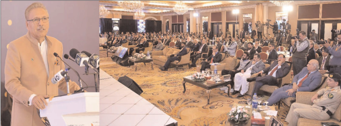
ISLAMABAD: President Dr. Arif Alvi addressing the 4th Financial Crime Summit.