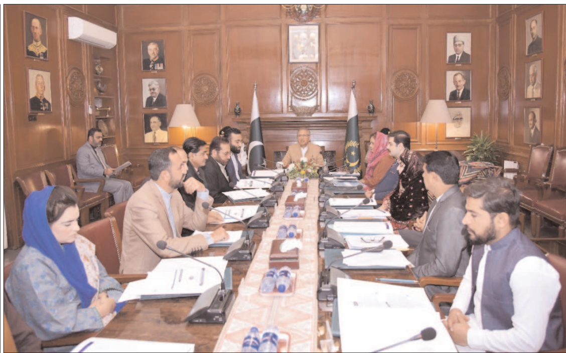
KARACHI: A delegation of Young Nurses Association called on President Dr Arif Alvi, at Governor House.

The candidates will be given 29 to 30 days to run the election campaign. Considering such a timeline, it is possible that the ECP may conduct the polls between March 1-April 10.