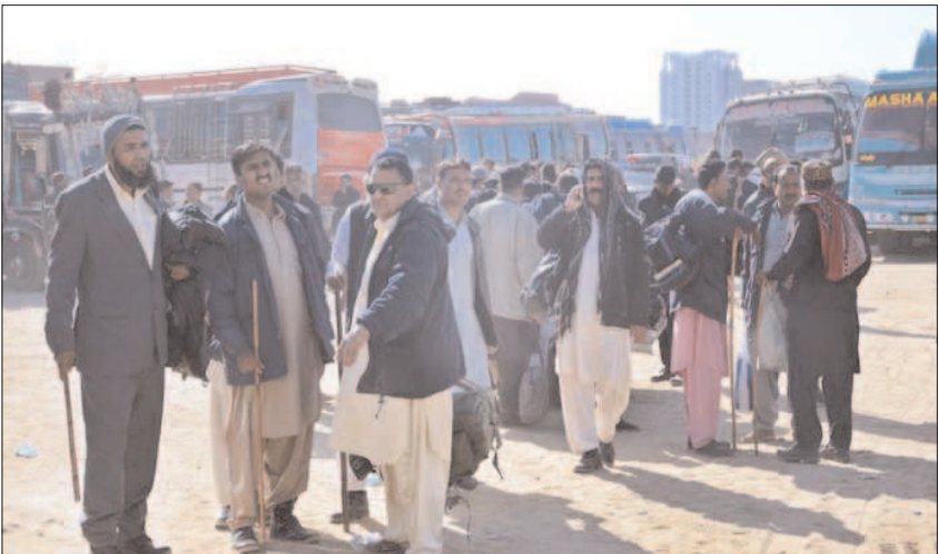
KARACHI: Policemen waiting for moving to their destination, who have come from interior Sindh to perform their duties in the Local Government elections, scheduled to be held on 15th January.