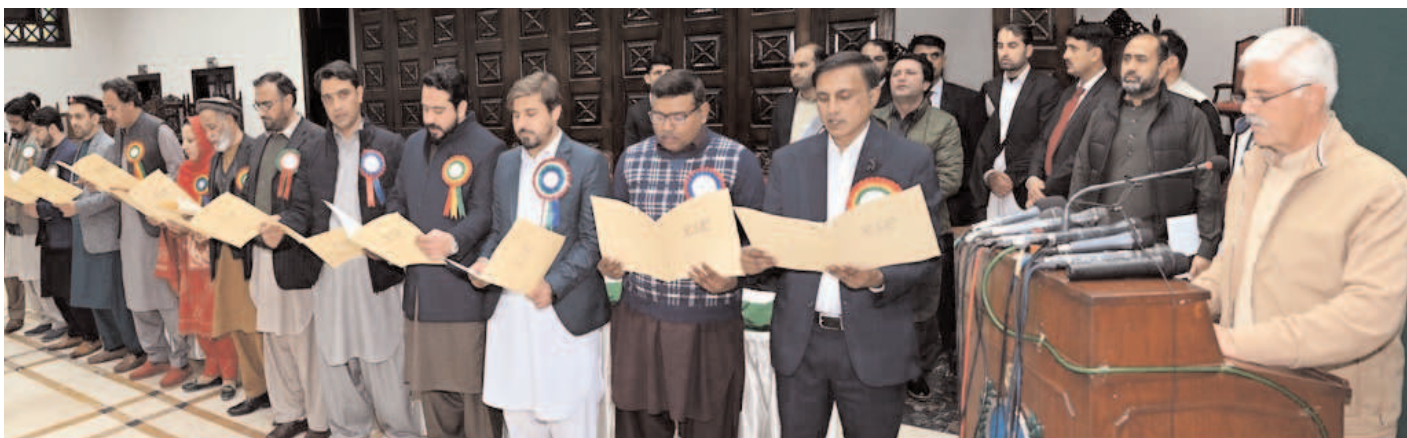
PESHAWAR: Chief Minister Khyber Pakhtunkhwa Mahmood Khan administering oath to newly elected cabinet and governing body of Peshawar Press Club.

The IGP hoped that the valiant officers and Jawans of the police force will come out victorious in the ongoing war against terror and vowed that every sacrifices would be offered for eliminating terrorism and maintain durable peace in the province.