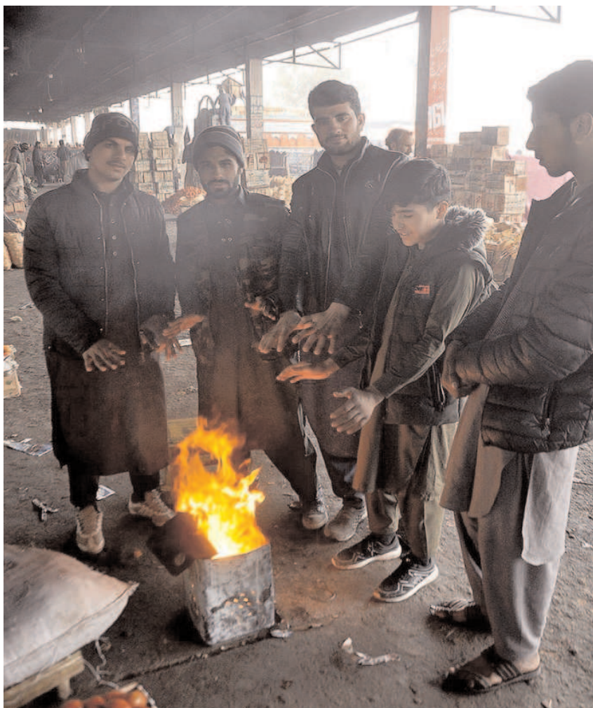
ISLAMABAD: People standing around fire, warming themselves as the temperature dropped in Federal Capital.

He said the Food Department Rawalpindi and district police on the directives of Deputy Commissioner (DC) Rawalpindi were strictly monitoring all the exit points of the city to foil wheat and flour smuggling bids.