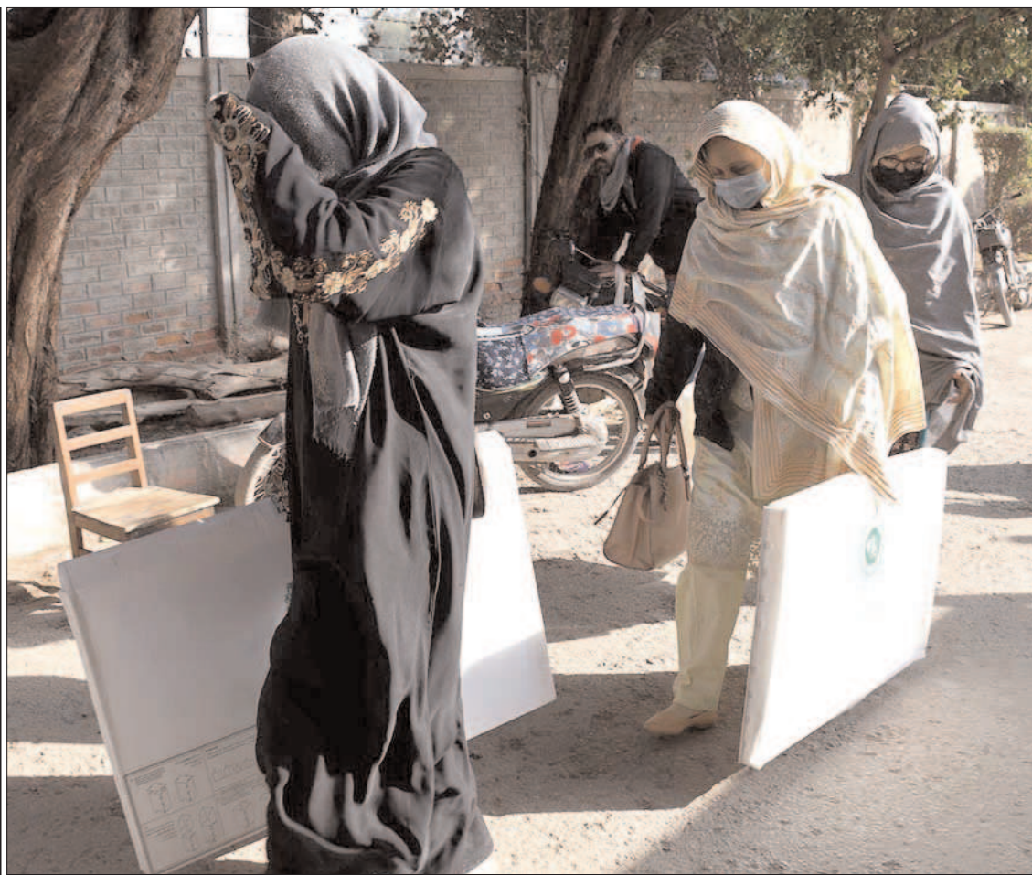
HYDERABAD: Polling staffer carrying boxes and other items for today's local bodies election.

QAP demands accurate census: The founding leader of Qabail Awami Party (QAP) Azam Khan Mehsum demanded that to ensure transparent and fair census to assure equal distribution of resources among different regions, on Saturday. QAP leader added that unfortunately, instead of paying attention to the problems of the erstwhile Fata, special attention was paid to looting the resources of former FATA.