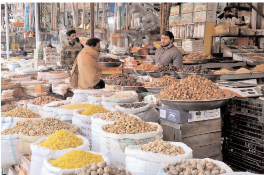
ISLAMABAD: Shopkeeper sells dry fruits at Karachi Company market.

The Model Y Performance version, formerly priced at nearly $70,000, now starts at just under $57,000.