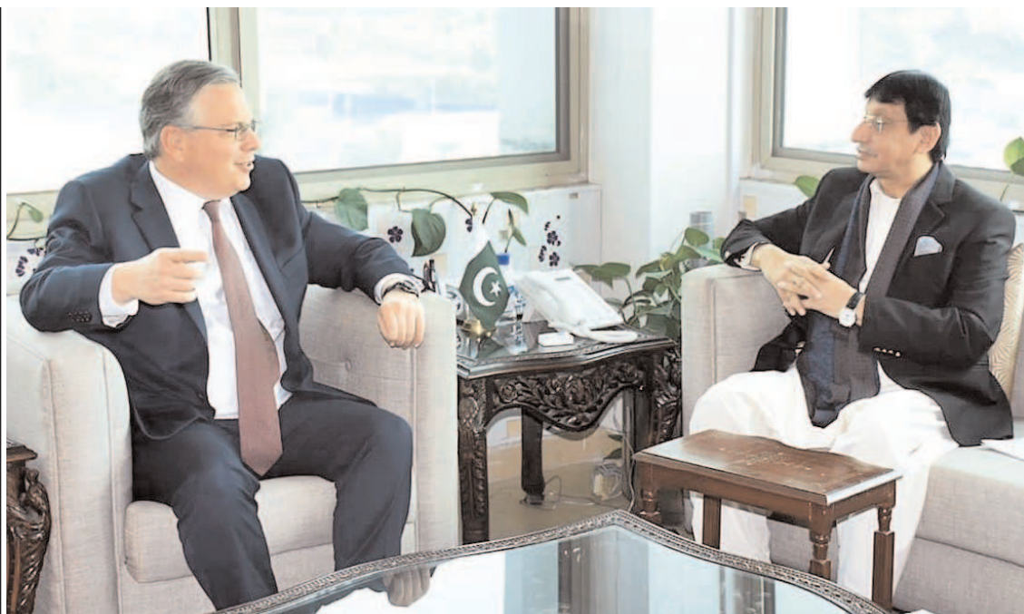
ISLAMABAD: US Ambassador to Pakistan Donald Blome meeting with Federal Minister for IT and Telecommunication Syed Amin Ul Haque.

Moving forward, grant support of KRN to position enterprises for listing will open avenues for equity and debt, she said adding the listed companies would be elevated to an exclusive league within the SME segment that have demonstrated institutional maturity and ambition and prospects for growth."