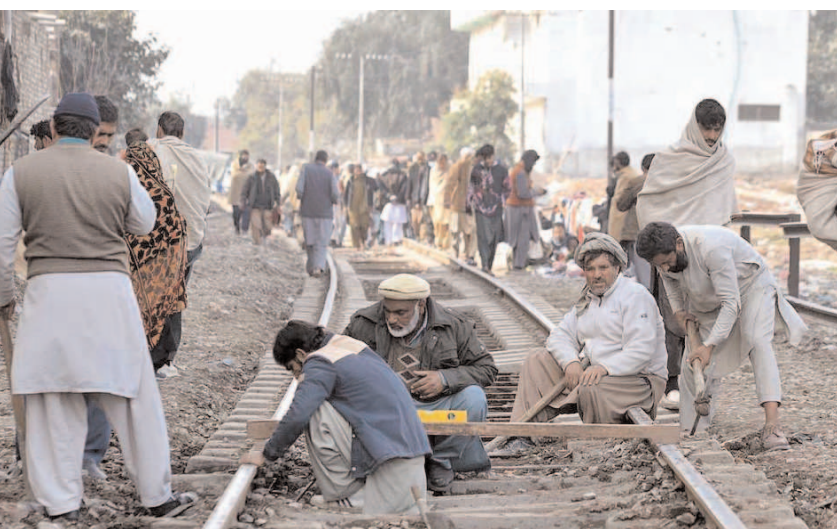
PESHAWAR: Labourers repairing railway tracks at Faqirabad area during maintenance work.