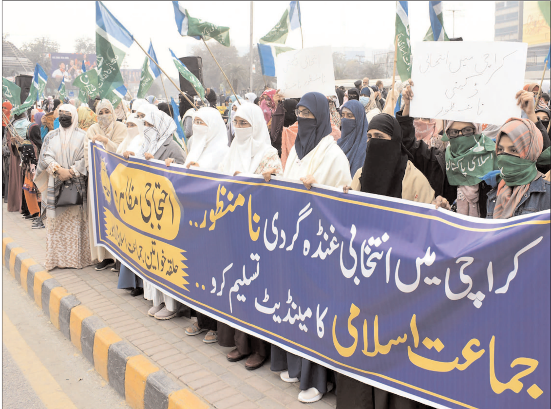
LAHORE: Women activists of Jamat-e-Islami holding a protest in favour of their demands at Liberty Chowk.