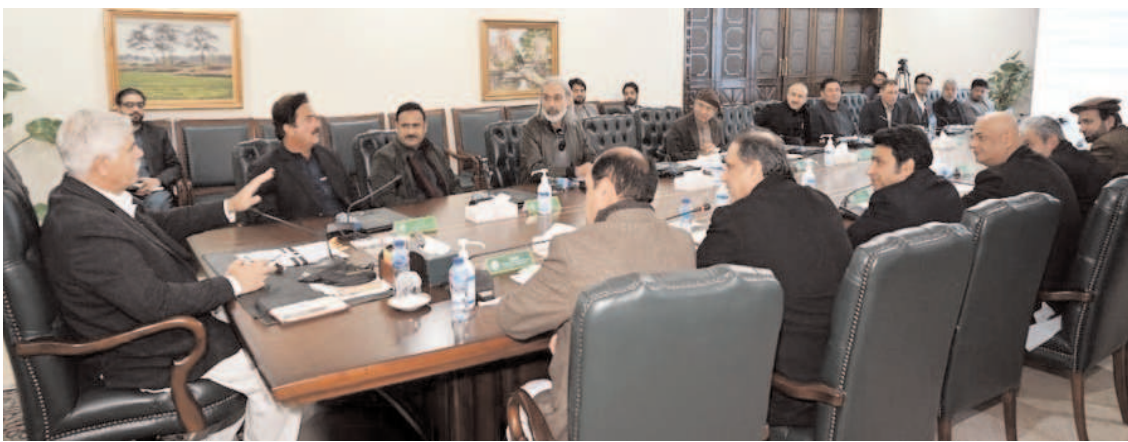
PESHAWAR: Chief Minister Khyber Pakhtunkhwa Mahmood Khan chairing 2nd meeting of Land Use and Building Control Council.