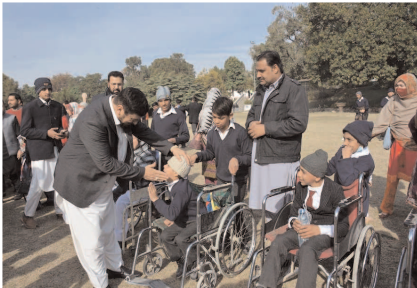
PESHAWAR: Governor Khyber Pakhtunkhwa Haji Ghulam Ali greeting with special children at Governor's House.

quality time to the visiting children. The Governor presented gifts to the children and assured them that the Governor House would always welcome them if they wanted to visit again.