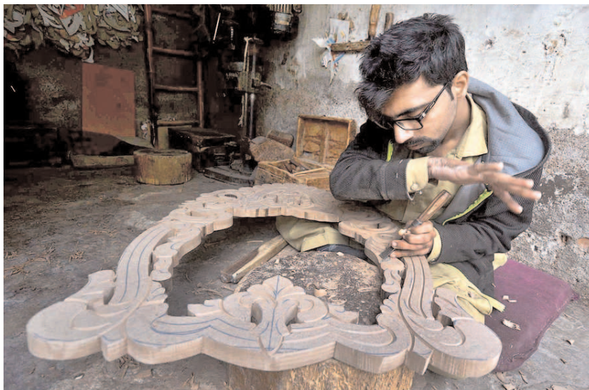
PESHAWAR: Carpenter busy in making designs on wood at his workplace.

Likewise, the power supply will remain suspended from 132 KV Mardan 3 Grid Station on 19th January from 10 a.m. to 4 p.m. resultantly consumers of 11 KVUET, Mardan, Ring Road, Muslim Abad and Shamshi Road feeders will face inconvenience.