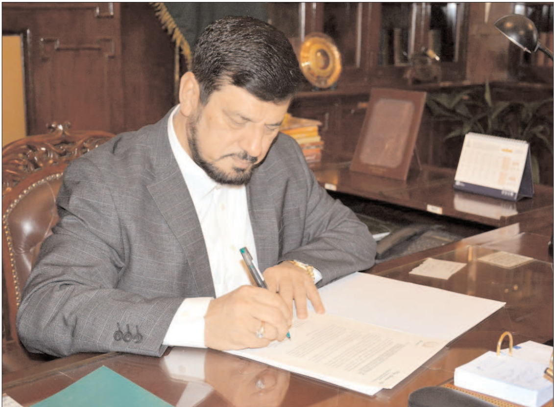
PESHAWAR: Governor of Khyber Pakhtunkhwa Haji Ghulam Ali signing the summary of dissolution of provincial assembly.

Vol. XXXIX No. 03 Regd. No. 241 JAMADI-US-SANNI 26 1444 -- THURSDAY, JANUARY 19 2023 PESHAWAR EDITION 12 PAGES Price. 20