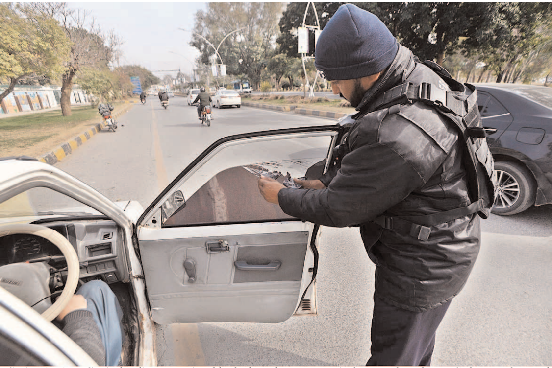
ISLAMABAD: Capital police removing black sheet from a car window at Khayaban-e-Suhrawardy Road.

All cases have been registered at respective ANF Police Stations under CNS Act 1997 (Amended 2022) while further investigations are under process.