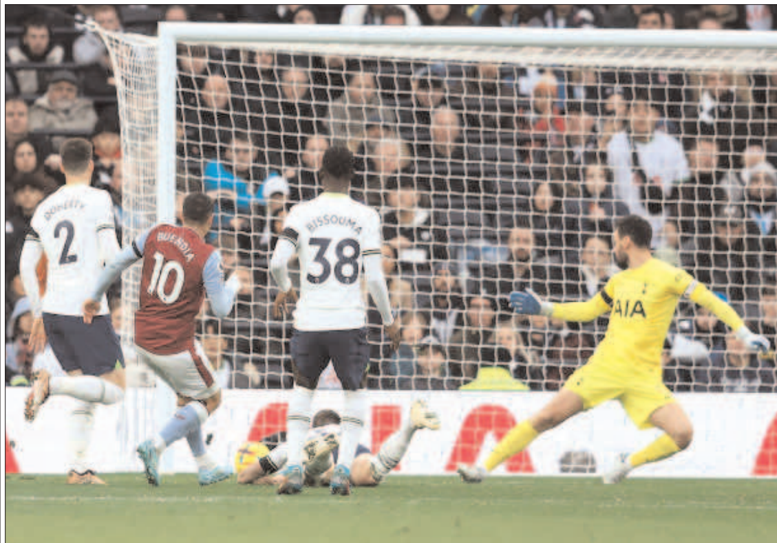
LONDON: Emiliano Buendia of Aston Villa scores the opening goal during the Premier League match between Tottenham Hotspur and Aston Villa at Tottenham Hotspur Stadium.

In 2022, Bangladesh U19 also visited Pakistan, former Pakistan captain Azhar Ali announced his retirement from international cricket, Lahore Qalandars won their maiden HBL Pakistan Super League title in front of home fans at the Gaddafi Stadium, Sindh clinched the National T20 silverware, Northern lifted the Quaid-e-Azam Trophy, while AH Kardar and Younis Khan were inducted into the PCB Hall of Fame.