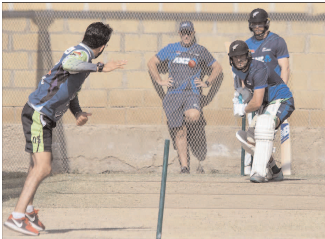
KARACHI: New Zealand's players attend a practice session at the National Stadium Karachi.

The Ceremony was attended by various civil and military dignitaries including officers, organisers, sponsors, golfers and media fraternity.