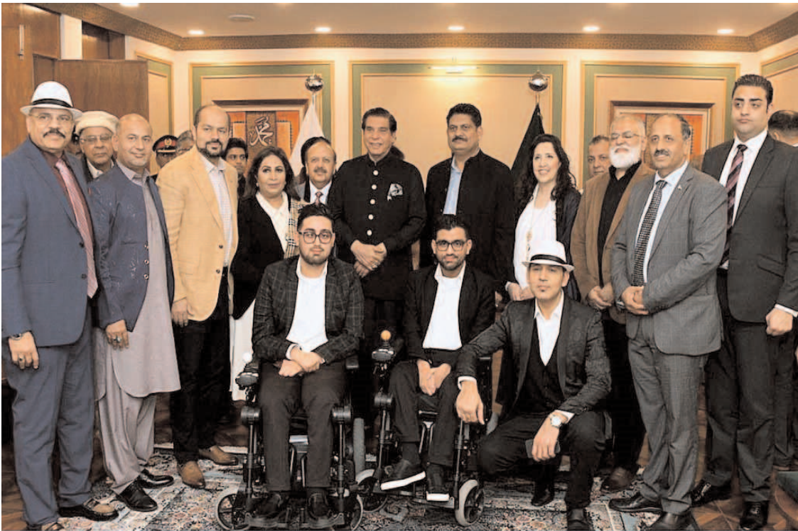
ISLAMABAD: Speaker National Assembly Raja Perviz Ashraf in a group photo with UK/USA Humanitarian Delegation for Pakistan Led by Lord Qurban Hussain Member of House of Lords at Parliament House.

ISLAMABAD (APP): Renowned Actor and former Director General of Pakistan National Council of the Arts (PNCA) Tauqeer Nasir has called cultural departments for promoting art and culture abroad to project a soft image of the country. "Cultural centers should be established in New York and London as Pakistan has a great historical and cultural heritage that needs promotion at the international level," he said while talking to APP in an interview. He lamented that we are not giving due importance to our art and culture which is negligence that results in intolerance and extremism. Tauqeer Nasir who was also awarded Sitara-e-Intiaz for acting during the current year said that 22 years ago, he got Tamgha Intiaz while he got the award in the year 2000. Now he was awarded the second highest award Sitara Intiaz. He said that he worked for 40 years and served Pakistan drama with great dedication to promote Pakistan art and cultural values.