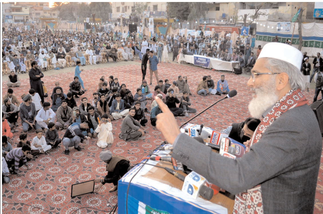
HYDERABAD: Ameer Jamat-e-Islami Siraj ul Haq addressing to "Baldyati Convention" at Bagh-e-Mustafa Ground.

Police rushed to the site and started an investigation into the matter.