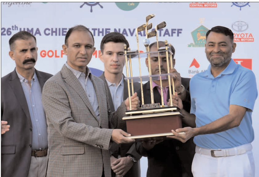
KARACHI: Chief of the Naval Staff Admiral Muhammad Amjad Khan Niazi giving away trophy to the winner of 26th CNS Open Golf Championship.

"We are deliberating upon preparing a pitch that may help bowlers and batsmen alike," Afridi said. "We cannot become a top team by playing on this type of wickets. The wickets on which we've been playing are not good for our bowlers." The two-test series will be followed by three ODIs — also at Karachi — from Jan. 9-13.