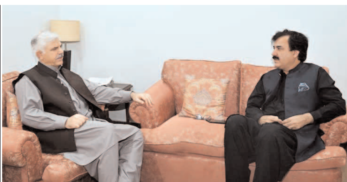
PESHAWAR: Chief Minister Khyber Pakhtunkhwa Mahmood Khan talking to Provincial Minister for Labour Shoukat Yousafzai.

Saif expressed hope that the newly elected cabinet would work for the welfare of the journalist community.