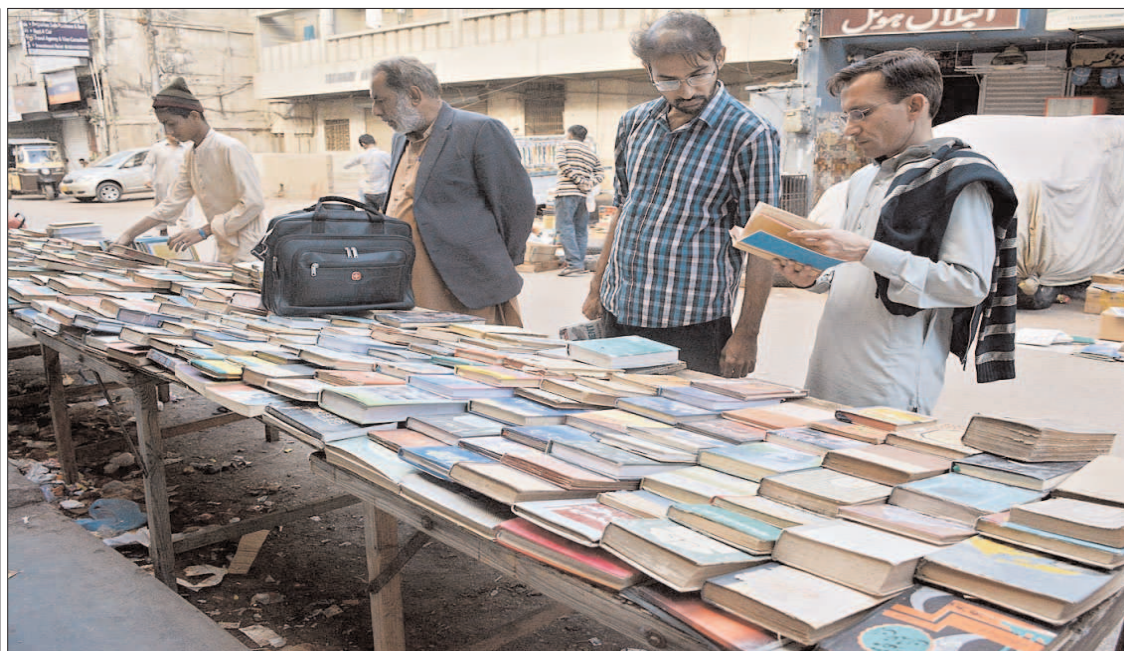
KARACHI: People purchasing old books at a roadside stall.

prompt relief to the consumers in their genuine grievances. It was agreed that focal persons in BS-20 will be designated on behalf of the Federal Secretary Petroleum and top management of SNGPL & SSGCL within one week to coordinate with Wafaqi Mohtasib Advisors and remove bottlenecks, where necessary. The