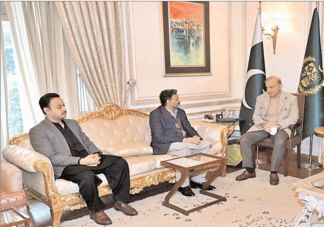
LAHORE: Member of the Punjab Assembly Chaudhary Ashraf Ali Ansari calls on Prime Minister Muhammad Shehbaz Sharif.

Foreign Minister Bilawal said in the year 2023, they aimed to improve bilateral and multilateral ties at all regional and global fora and organizations and would pursue the agenda of economic diplomacy.