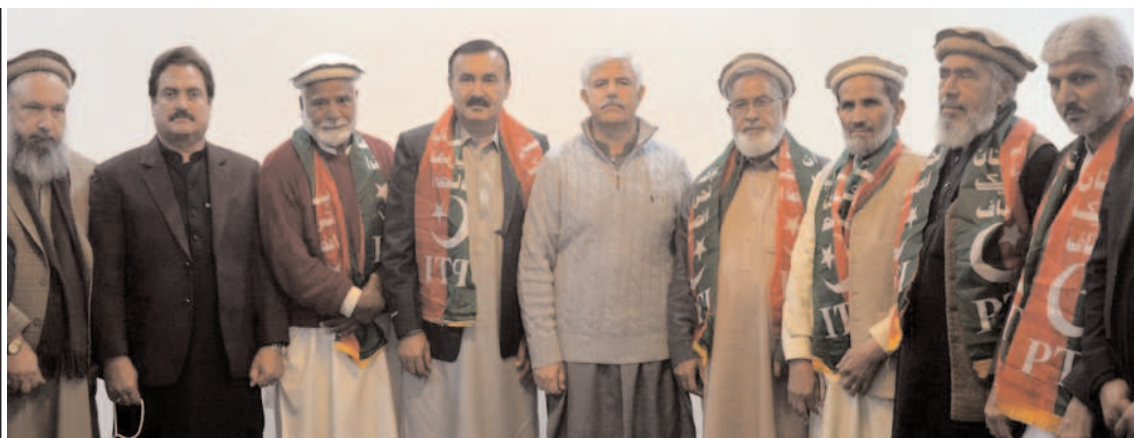
PESHAWAR: Chief Minister Khyber Pakhtunkhwa Mahmood Khan with a delegation of Pakistan Tehreek-e-Insaf from District Dir.