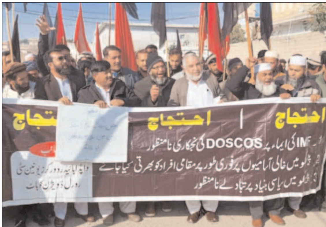
KOHAT: Activists of WAPDA Hydro Union holding a protest rally for acceptance of their demands.

The Commissioner directed the officers of different departments and consultants to ensure use of quality material in execution development projects and timely completion of public welfare projects so that people could get benefits of expenditures billion of rupees on the projects by the government. He said that Rs. 10 billion were being spent of establishment of DHQ hospital for providing better healthcare to people at local level, Rs. 6 billion on establishment of University of Hafizabad to ensure giving higher educational facilities to the students of the area, Rs. 10 billion on construction of road from Kot Sarwar Motorway Interchange to Gujranwala for providing the best communicational facilities to thousands commuters belongs to Hafizabad, Gujranwala and other districts of the Punjab whereas Rs. 8.25 billion also being spent to complete road from Hafizabad to Head Khaki for providing shortest link to district Hafizabad with divisional headquarter Gujrat.