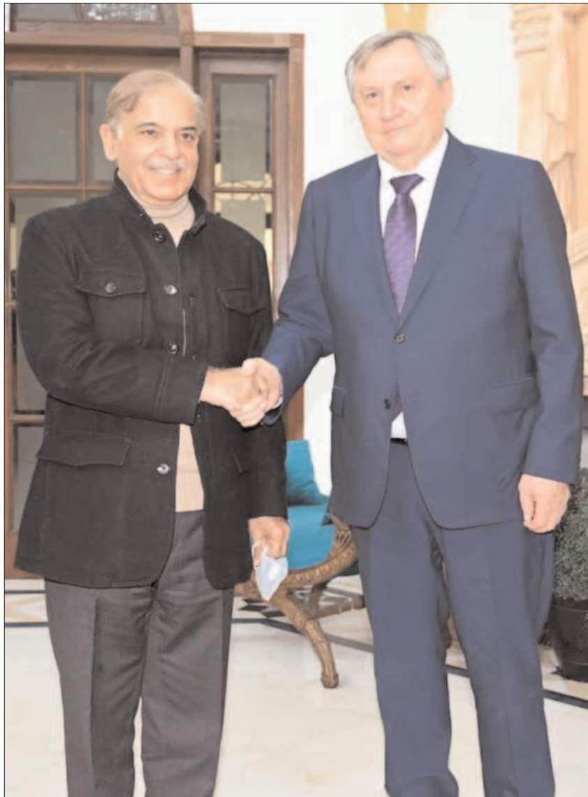
LAHORE: Russian Energy Minister Nikolay Shulginov shaking hands with Prime Minister Shehbaz Sharif, ahead of their meeting.

He said that the staff works under the supervision of the ECP during the elections, adding that they want the PPP and JI to work together. "Maintaining law and order in the city is everyone's responsibility and we have to try not to increase the tension among the political workers."