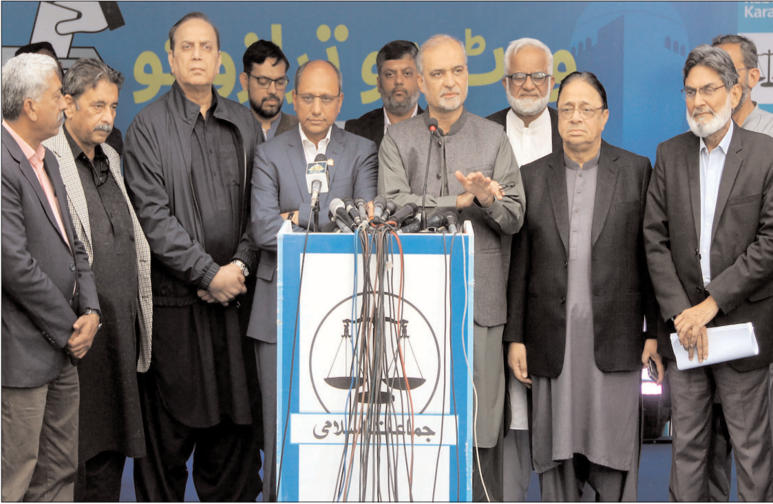
KARACHI: Leader of Jamaat-e-Islami Hafiz Naeem Ur Rehman addressing a press conference along with leader of Pakistan Peoples Party Saeed Ghani after the meeting.

During meeting of Senator Dr. Shahzad Waseem with Chairman PTI held at his Zaman Park Lahore residence, prevailing political situation of the country and the parliamentary affairs came under discussion. Leader of the Opposition briefed Imran Khan about issues relating Upper House of the Parliament and party chief gave important instructions to Senator Dr. Shahzad Waseem about the parliamentary affairs.