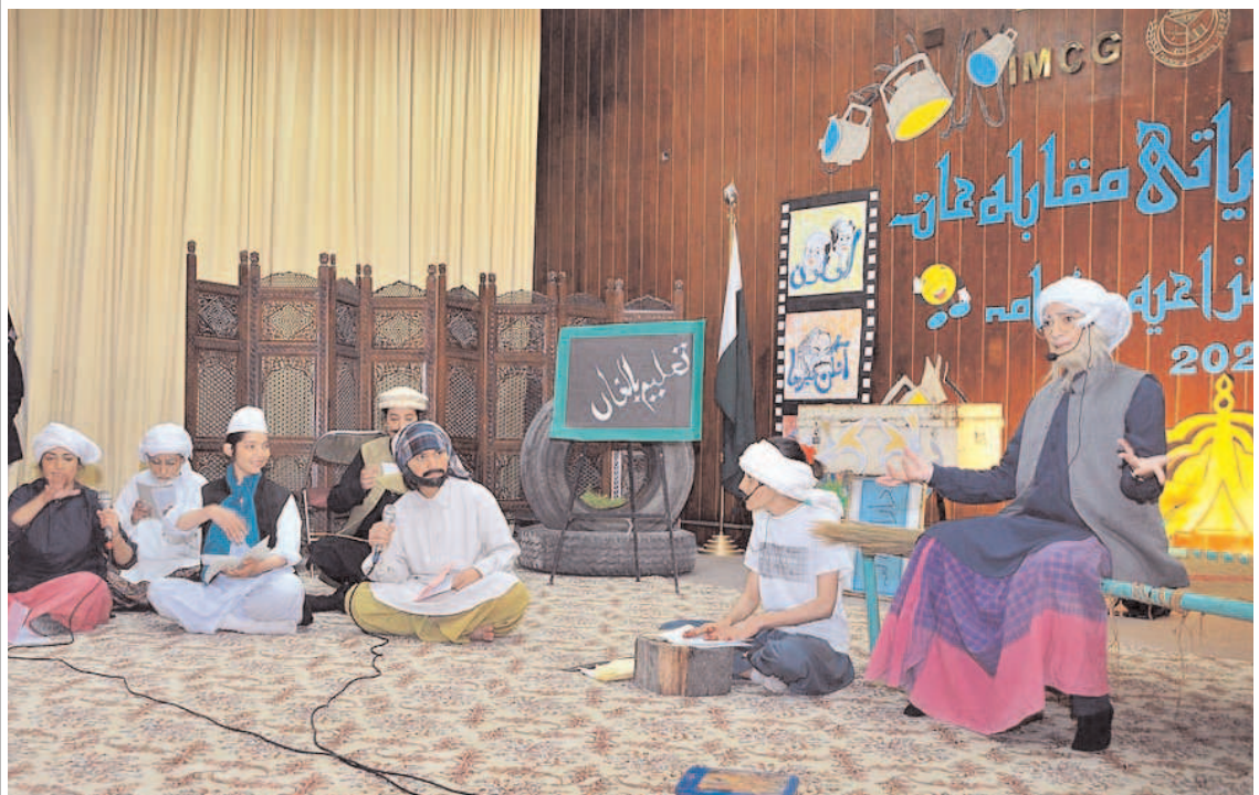
ISLAMABAD: Students are performing in comedy drama competition at Islamabad Model College for girls F6/2 held in connection with intercollegiate ceremony.

The beneficiary women and transgenders of Islamabad, Punjab, Sindh and Balochistan have started receiving this money from Payment Centers or Biometric ATMs designated by Habib Bank; while in Khyber Pakhtunkhwa, Azad Jammu and Kashmir and Gilgit-Baltistan, the amount is being disbursed through Payment Centers or Biometric ATMs of Bank Al-Falah.