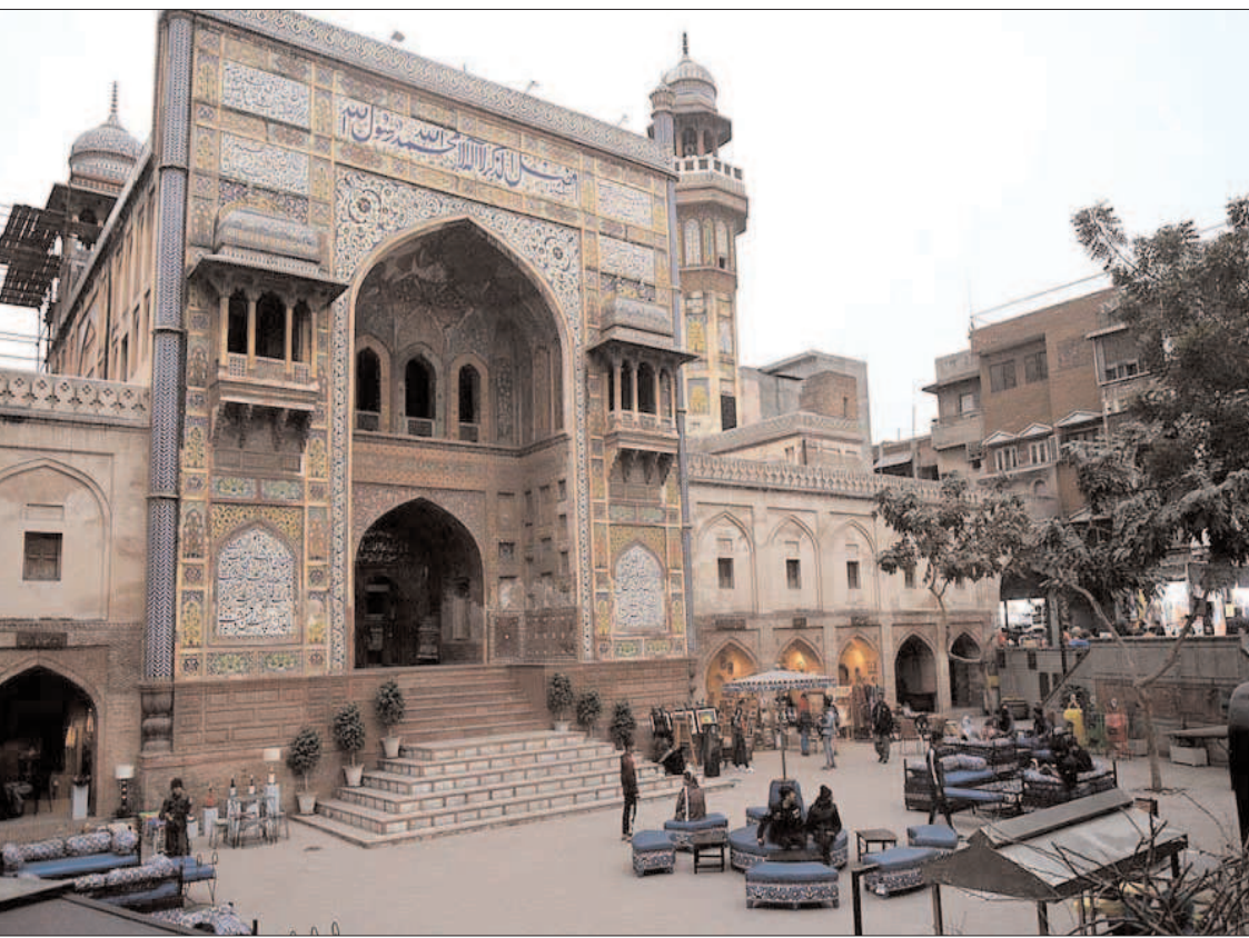
LAHORE: A beautiful view of outside the entrance gate of Masjid Wazir Khan at walled city.

their commanding role with more diligence and leave no stone unturned in selfless service of citizens and protection of their life and property. He said that according to the guidelines of smart and community policing, all available resources should be utilized for providing services to the citizens and eradicating crimes. The IG Punjab directed that by promoting public-centric and modern policing, immediate relief should be provided to the citizens in need and an environment of safety should be established by strengthening the positive image of police.