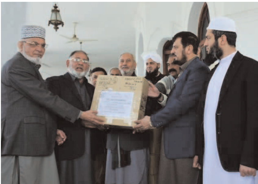
PESHAWAR: Governor Khyber Pakhtunkhwa Haji Ghulam Ali presenting aid to welfare hospital officials.

On this occasion, other speakers while stressing the importance of cooperation among the manufacturers' farmers and other organizations said that farms are playing a crucial role in the development of the livestock sector and standing beside the department for meeting food requirements of the people.