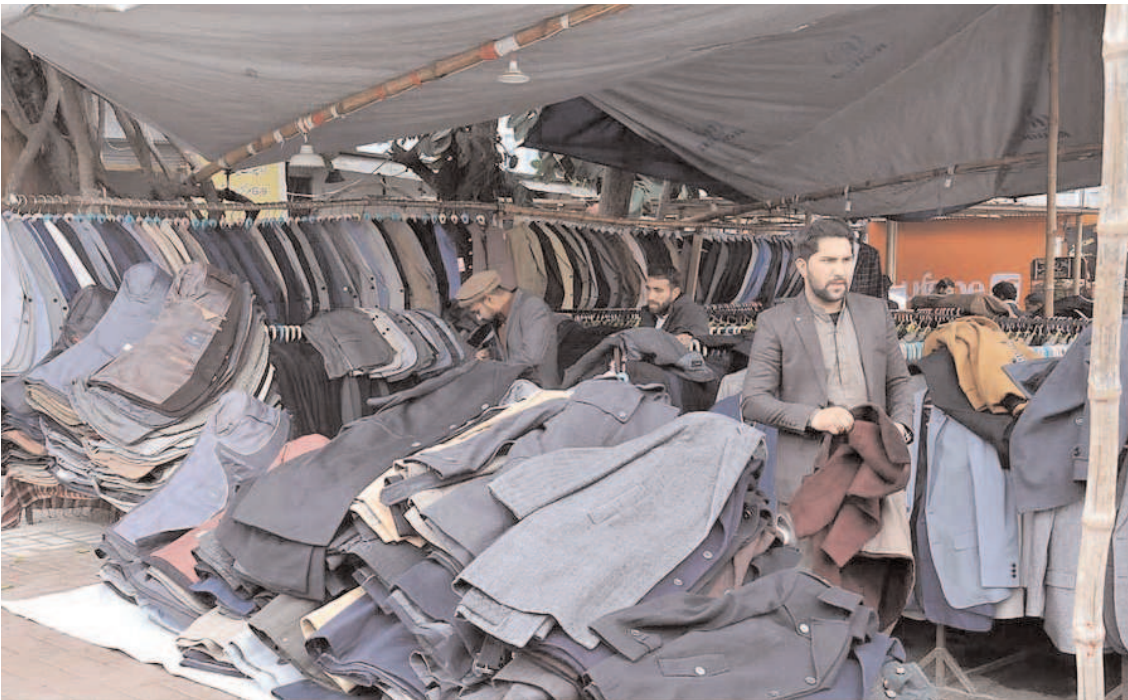
ISLAMABAD: People purchasing second hand clothes at Karachi Company.

Gold prices up by Rs 1,150 to Rs 189,300 per tola The per tola price of 24 karat gold witnessed an increase of Rs 1,150 on Tuesday and was traded at Rs189,300 against sale at Rs188,150 the last trading day. The price of 10 grams of 24 karat gold also increased by Rs 986 to Rs 162,294 against Rs161,308, whereas that of 10 grams of 22 karat increased to Rs148,770 from Rs147,866, All Sindh Sarafa Jewellers Association reported. The price of one tola and ten gram silver remained constant at Rs 2,100 and Rs 1,800.41 respectively. The price of gold in the international market increased by US$14 to US$ 1,938 as compared to its sale at US$1,924 on the last trading day, the association reported.