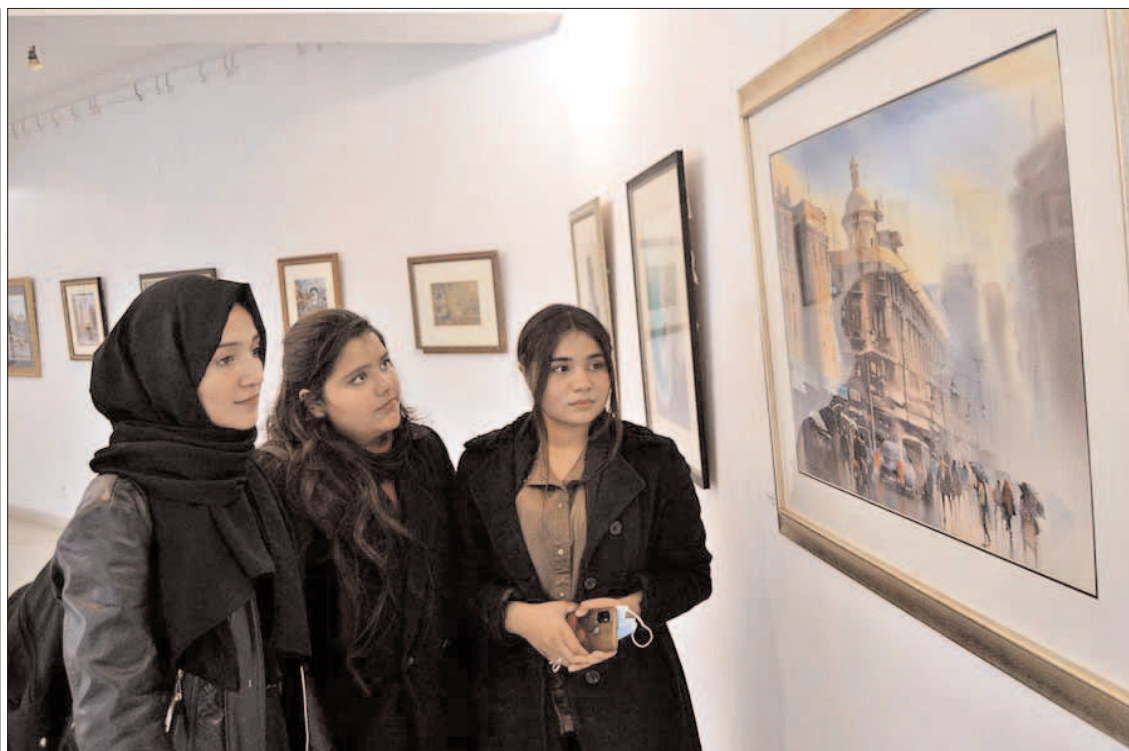
LAHORE: Students of Arts viewing artwork on the World Watercolor Day & IWS 11th Anniversary organized by the Lahore Arts Council at Alhamra.

Illegal shops were demolished in F-Block near the park, whereas eight illegal shops and properties at Main Boulevard LDA Avenue-I were sealed.