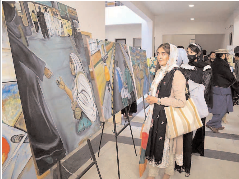
PESHAWAR: Visitors taking keen interest in paintings during Art Exhibition organized by Dosti Welfare Organization at UOP.

The lowest temperatures recorded in the province were -10°C in Tirah valley of Khyber and -06°C in Malam Jabba and Kalam.