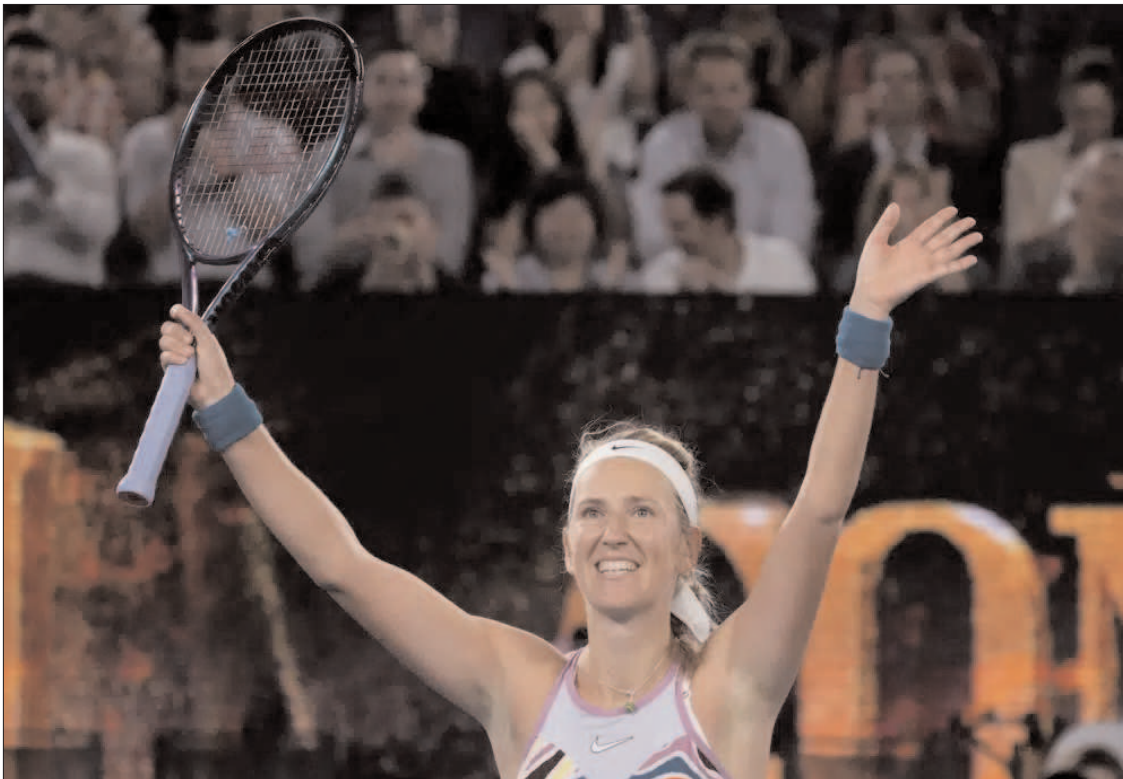
MELBOURNE: Victoria Azarenka of Belarus waves after defeating Jessica Pegula of the U.S. in their quarterfinal match at the Australian Open tennis championship.

INDORE (Agencies): Skipper Rohit Sharma and Shubman Gill hit attacking centuries to help India sweep the one-day international series against New Zealand with a 90-run victory in the third match on Tuesday. Rohit (101) and Gill (112) put on 212 for the opening wicket in Indore to guide the hosts to 385-9 after being invited to bat first in Indore. In reply, Devon Conway's 138 was in vain as India bowled out New Zealand for 295 in 41.2 overs for their second successive 3-0 white-wash and go top of the ODI rankings. Rohit, who recorded his first ODI century since January 2020, and Gill stood out in the highest opening partnership by any team against the Kiwis in the 50-over format, surpassing the 201-run stand of Virender Sehwag and Gautam Gambhir in 2009.