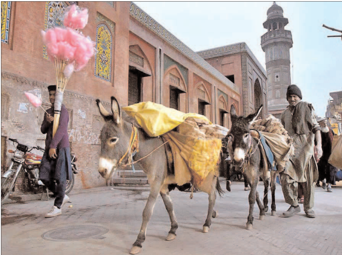
LAHORE: A labourer on the way along with donkey loaded with bricks at inside the Kashmiri Bazar.

It was informed during the meeting that applications of more than 1 lakh 74 thousand people have been approved while about 1 lakh 20 thousand vehicle numbers have also been sold under the system till date. On this occasion, PITB Chairman Faisal Yousuf said that the system has also been linked to e-Pay Punjab for the payment of fees while the department has so far collected more than Rs. 550 million in revenue.