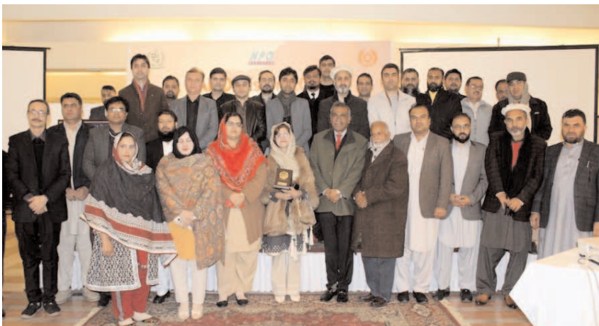
PESHAWAR: A view of participants of "Innovations For Higher Productivity & Quality" workshop organized by National Productivity Organization.

It was told in the meeting that steps should be taken to celebrate smoking and drug addiction in all educational institutions and students should be told that addiction is a curse and health should be valued.