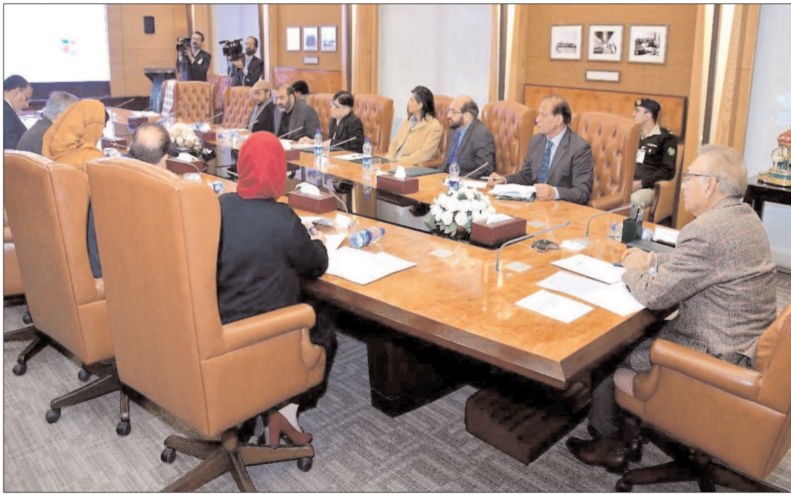
ISLAMABAD: President Dr. Arif Alvi chairing a follow-up meeting on mental health, at Aiwan-e-Sadr.

During the meetings, the overall political situation in the country as well as matters of their relevant constituencies were discussed.