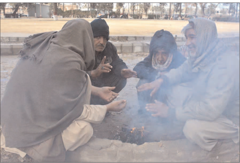
QUETTA: People sitting around burning woods to warm themselves during chill weather.

Meanwhile social and political activists threatened to launch a protest campaign against the Sindh government if it failed to recover the abducted youth from the Kacha dacoits within a week. They also warned to hold hostage the Sindhis living in parts of the Khyber Pakhtunkhwa if the matter was not taken seriously.