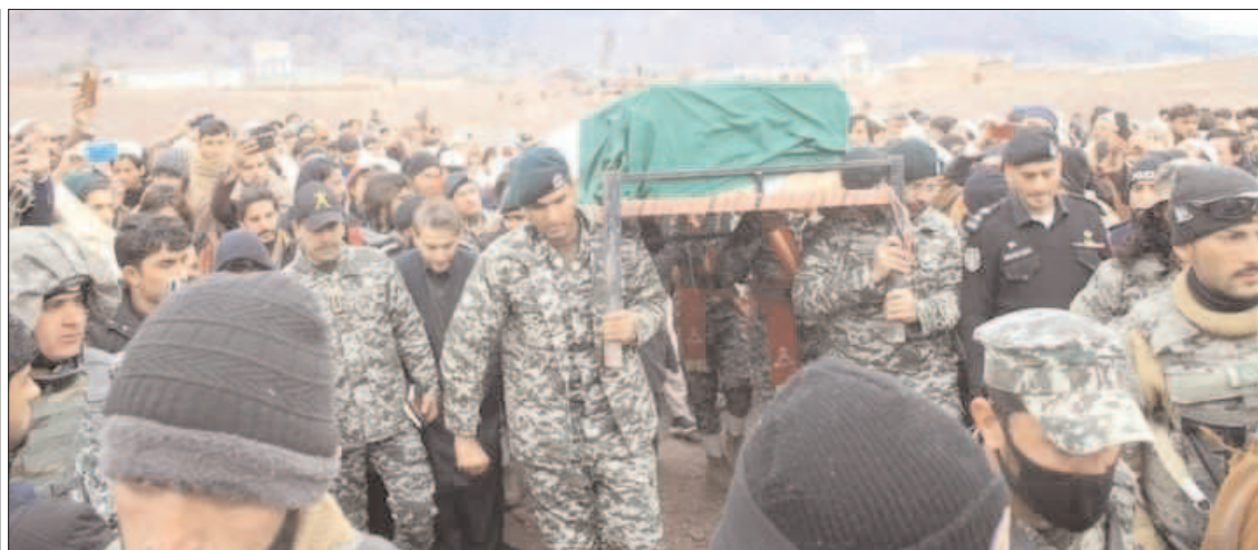
BARA: Officials carrying the coffin of martyred army man for burial, who embraced Shahadat after IED explosion in Jani Khel area of Bannu.