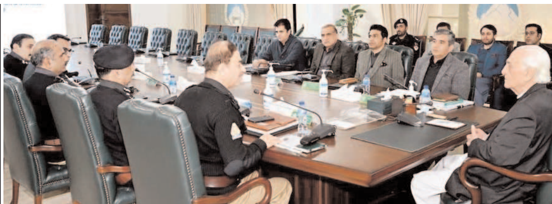
PESHAWAR: Caretaker Chief Minister Khyber Pakhtunkhwa Muhammad Azam Khan chairing a meeting regarding law and order situation in province.

The power supply will remain suspended from 220KV Oghi-Mansehra Transmission Line on 25th January from 9 a.m. to 5 p.m. resultantly consumers of 132 KV Oghi and Battal 11 KV feeders will face inconvenience.