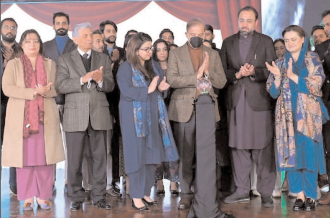
ISLAMABAD: Prime Minister Shehbaz Sharif inaugurating the PM Youth Loan Scheme for Business and Agriculture.

The court had indicted all the accused in the case. They pleaded not guilty and opted to contest the charges. Subsequently, the court directed the NAB prosecution to furnish evidence to back up the charges against them. Former PM Abbasi is accused of awarding an LNG Terminal-I contract to a firm at Port Qasim Karachi, at exorbitant rates.