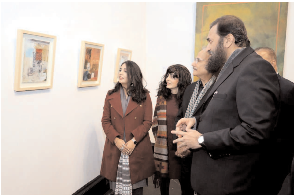
LAHORE: Governor Punjab Muhammad Balighur Rehman attending annual degree show at National College of Arts Lahore.

the constitution neither will be done. In the future, all matters will be handled according to the constitution and law. Meanwhile, Punjab Governor Muhammad Balighur Rehman strongly condemned the desecration of the Holy Quran in Sweden, saying: "I strongly condemn the despicable act of desecration of Holy Quran in Sweden. Desecration of the Holy Quran is a deplorable act. The incident has hurt the religious sentiments of Muslims around the world under the guise of freedom of expression."