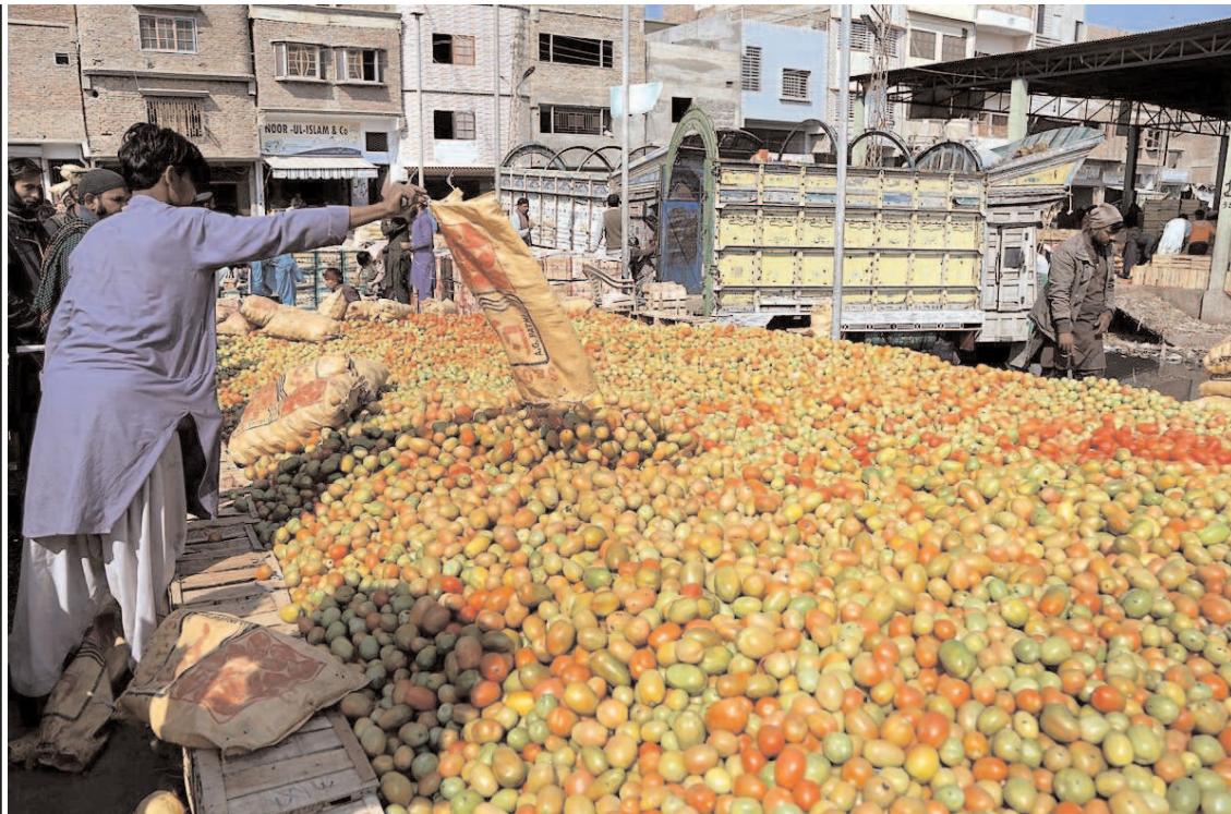
HYDERABAD: Vegetable traders unloading tomatoes from delivery trucks for trading at vegetable market.

The price of gold in the international market decreased by US$3 to US$ 1,924 as compared to its sale at US$1,927 on the last trading day, the association reported.