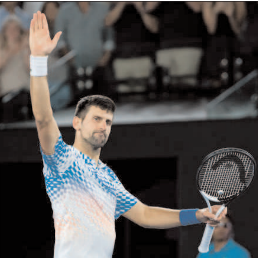
MELBOURNE: Novak Djokovic celebrates after winning in the Quarterfinal singles match against Andrey Rublev during day ten of the 2023 Australian Open.