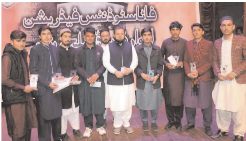
PESHAWAR: Position holders of FATA Students Federation's Award Culture Show with representative of Al-Hamid Minerals.

Soon after receiving information, the area police reached the crime scene and shifted the dead and injured to the hospital. Police also collected evidence from the site of the incident and started a search operation to nab the involved accused.