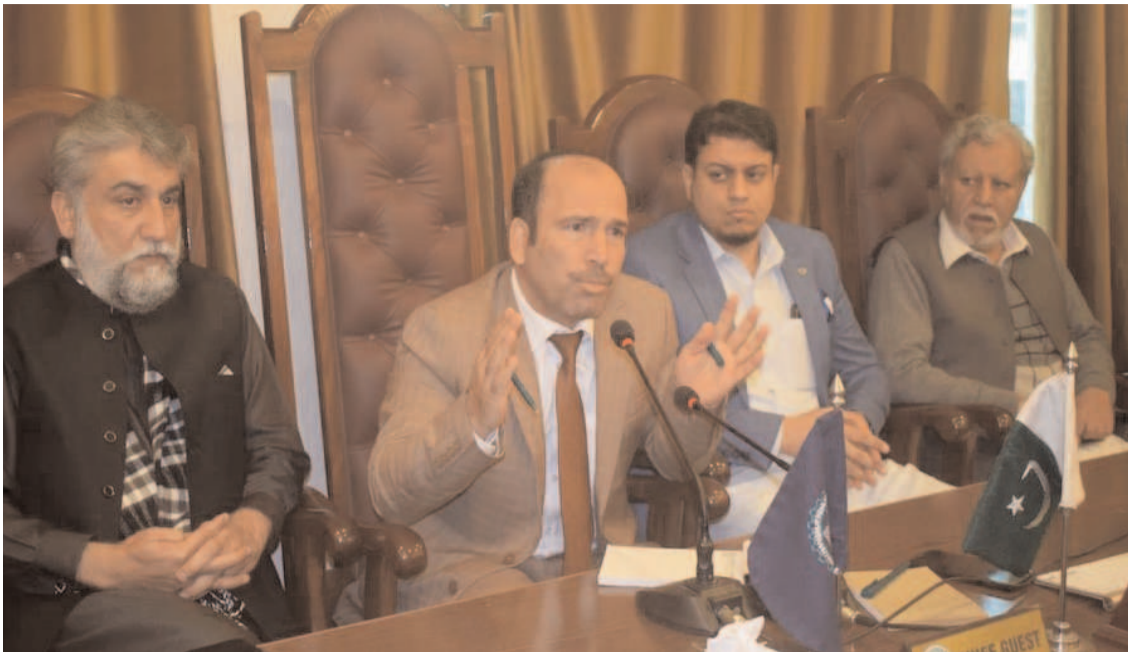
PESHAWAR: Ambassador of Turkey addressing businessmen at Chamber of Small Traders and Industry during his visit to Chamber.