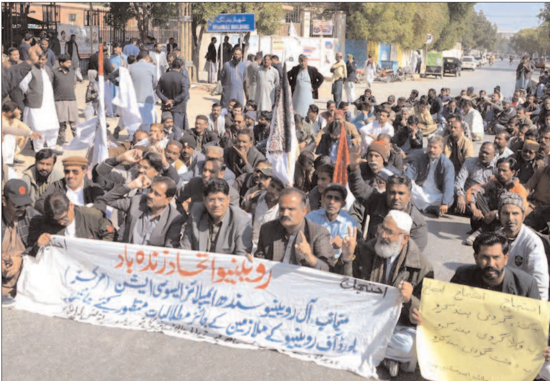
HYDERABAD: Workers of All Revenue Sindh Employees Association holding a protest against lawyers.

GUJRANWALA (INP): The prisoners during ransack in District Jail Gujrat set ablaze property worth millions of rupees and pelted stones at police. Nine people were injured in the clashes. The prisoners of District Jail Gujrat set on fire the jail hospital, cereals godown, water filtration plants and other property rendering millions of losses. The prisoners also clashed with police and jail staff during ransack. Nine people including police officials, jail staffers and four prisoners were injured in brawl.