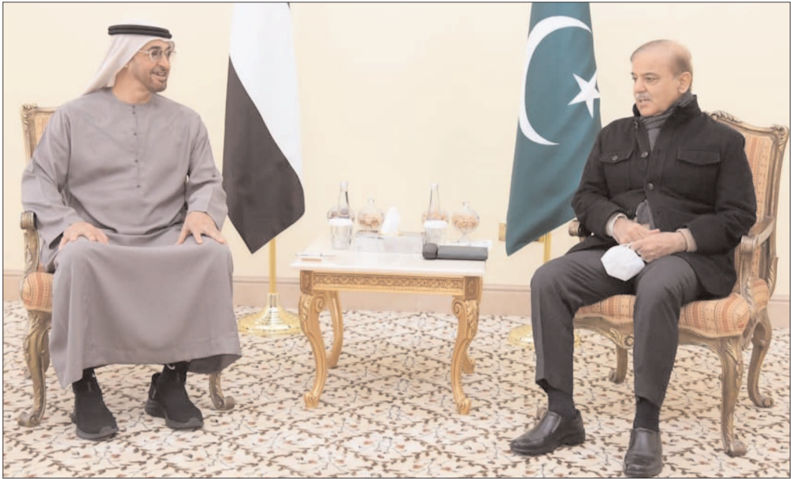
RAHIM YAR KHAN: Prime Minister Shahbaz Sharif called on with President of United Arab Emirate Mohammed Bin Zayed Al-Nahyan at Chandana Airport.

Vol. XXXIX No. 10 Regd. No. 241 RAJAB 03 1444 -- THURSDAY, JANUARY 26 2023 PESHAWAR EDITION 12 PAGES Price. 20