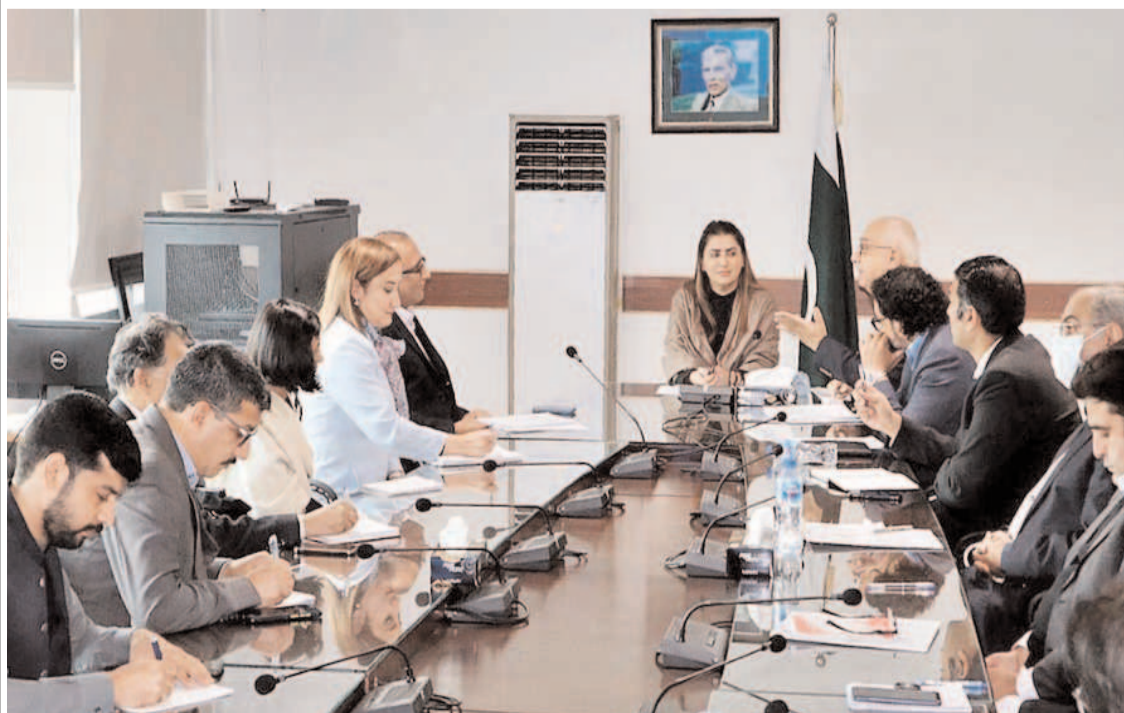
ISLAMABAD: Ms. Shazia Marri, Federal Minister, and Chairperson BISP, chairs a meeting with a World Bank delegation.

Times Higher Education (THE) is the company behind the world's most influential university ranking, with almost five decades of experience as a source of analysis and insight into higher education. Its ranking has been the gold standard for global, research-intensive universities for 15 years and spans the world with over 25 million annual users.