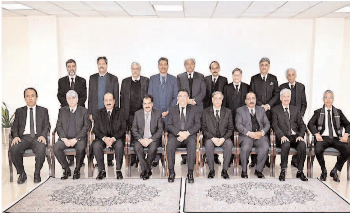
ISLAMABAD: A group photo 20-member delegation of Pakistan Bar Council (PBC) comprising the newly elected Vice Chairman of the PBC and the Chairman Executive Committee PBC along with the former Vice Chairman (PBC) called upon the Hon'ble Chief Justice of Pakistan Mr. Justice Umar Ata Bandial at the Supreme Court of Pakistan. Discussions were held upon wide ranging matters of mutual interest.