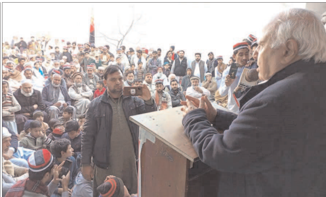
CHARSADDA: Chairman of Qaumi Watan Party Aftab Ahmad Khan Sherpao addressing a public gathering in UC Mirza Dhare.

He also inspected weight of flour bags, price and record of mills. He also contacted flour distribution outlets and inquired about availability of staple item. He warned strict action against flour mills and dealers who failed to compile record and said that overpricing of flour would not be tolerated. He also directed food department to check record of dealers and flour mills daily without any discrimination.