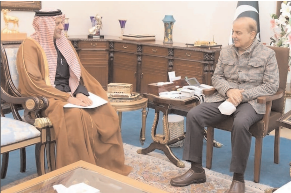
ISLAMABAD: Ambassador of Qatar in Pakistan, Sheikh Saoud bin Abdulrahman Al-Thani called on Prime Minister Shehbaz Sharif.

It also emphasized Sweden and Netherlands for firm lawful action against those who desecrated the Holy Quran. It also proposed the government contact, coordinate and cooperate among the members of the Organization of Islamic Cooperation to take a unified position on this issue which is central to the core beliefs of all Muslims. The Senate further asked to take up this highly important and urgent issue before the upcoming session of the United Nations Human Rights Council, which is meeting in Geneva next week.