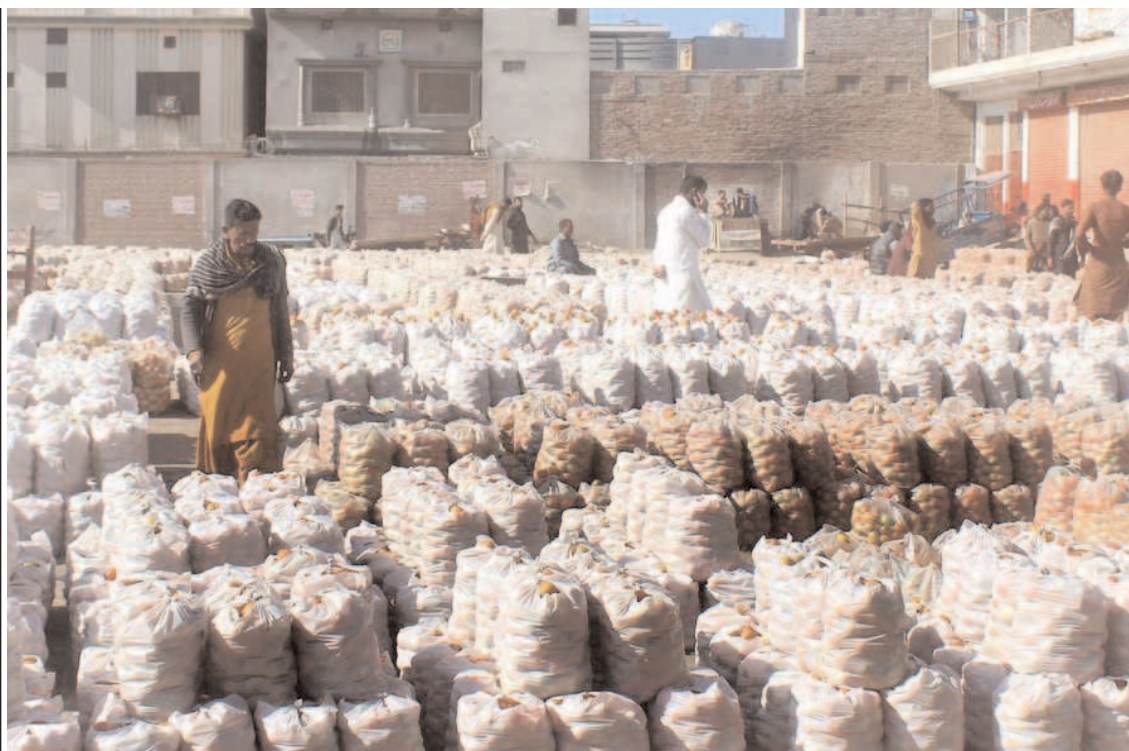
MULTAN: Vegetable traders displaying bags of tomatoes and waiting for sellers at fruit market.

Executive members of the SCCI also spoke on the occasion and suggested a number of proposals for enhancing the mutual trade between Pakistan and Türkiye.