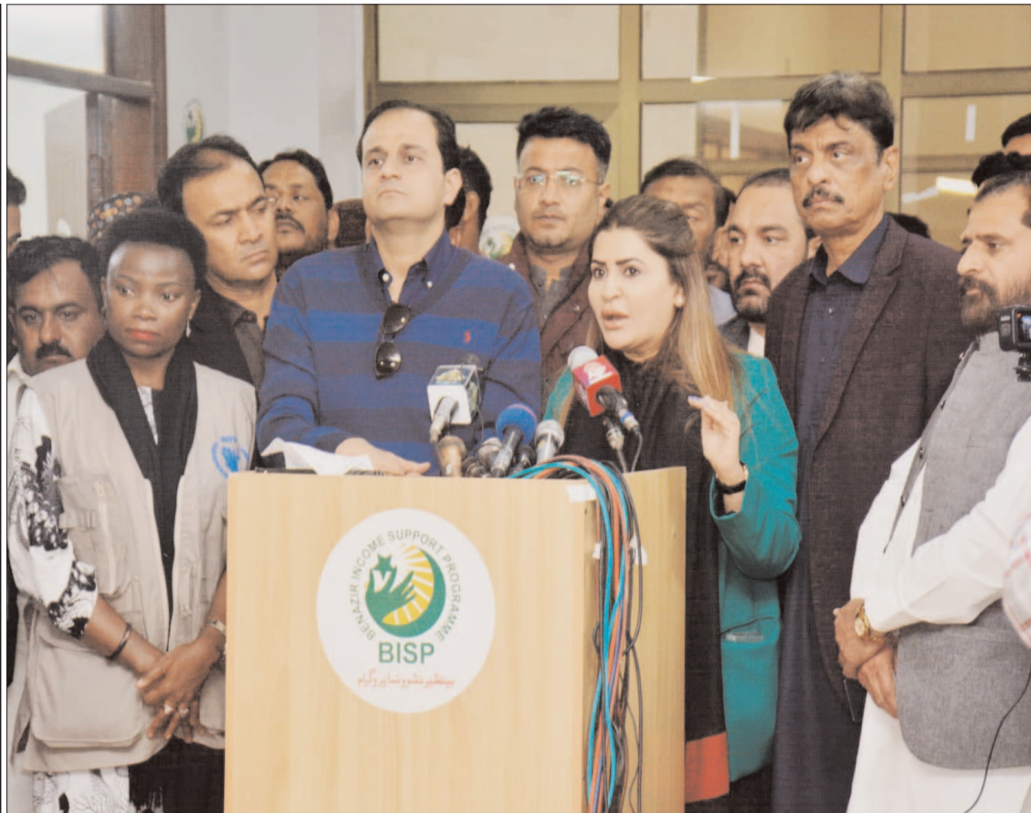
KARACHI: Federal Minister for Poverty Alleviation and Social Safety Shazia Marri talking to media persons after inaugurating the 'Benazir Nashonuma Centre'.