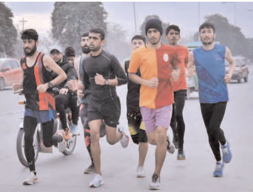
ISLAMABAD: Youngsters running at Islamabad expressway.

He said that the Food Department Rawalpindi and district police, on the directives of Deputy Commissioner (DC) Rawalpindi, were strictly monitoring all the exit points of Rawalpindi district to foil wheat and flour smuggling bids.