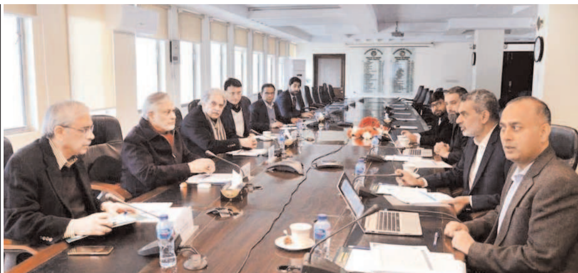
ISLAMABAD: Federal Minister for Finance and Revenue Senator Mohammad Ishaq Dar chairing a meeting on role of Pakistan Development Fund and State Owned Enterprise at Finance Division.