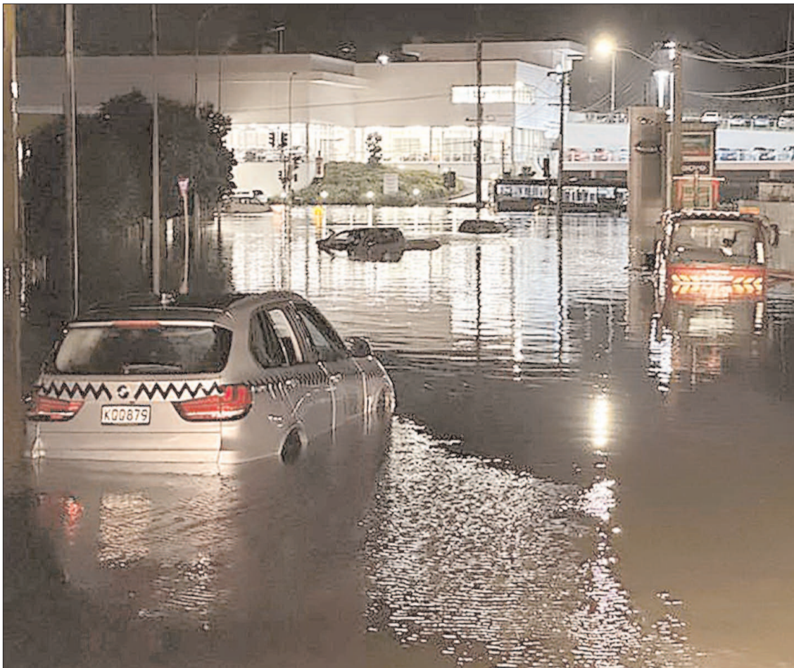
WELLINGTON: Vehicles on the way after heavy floods in New Zealand.