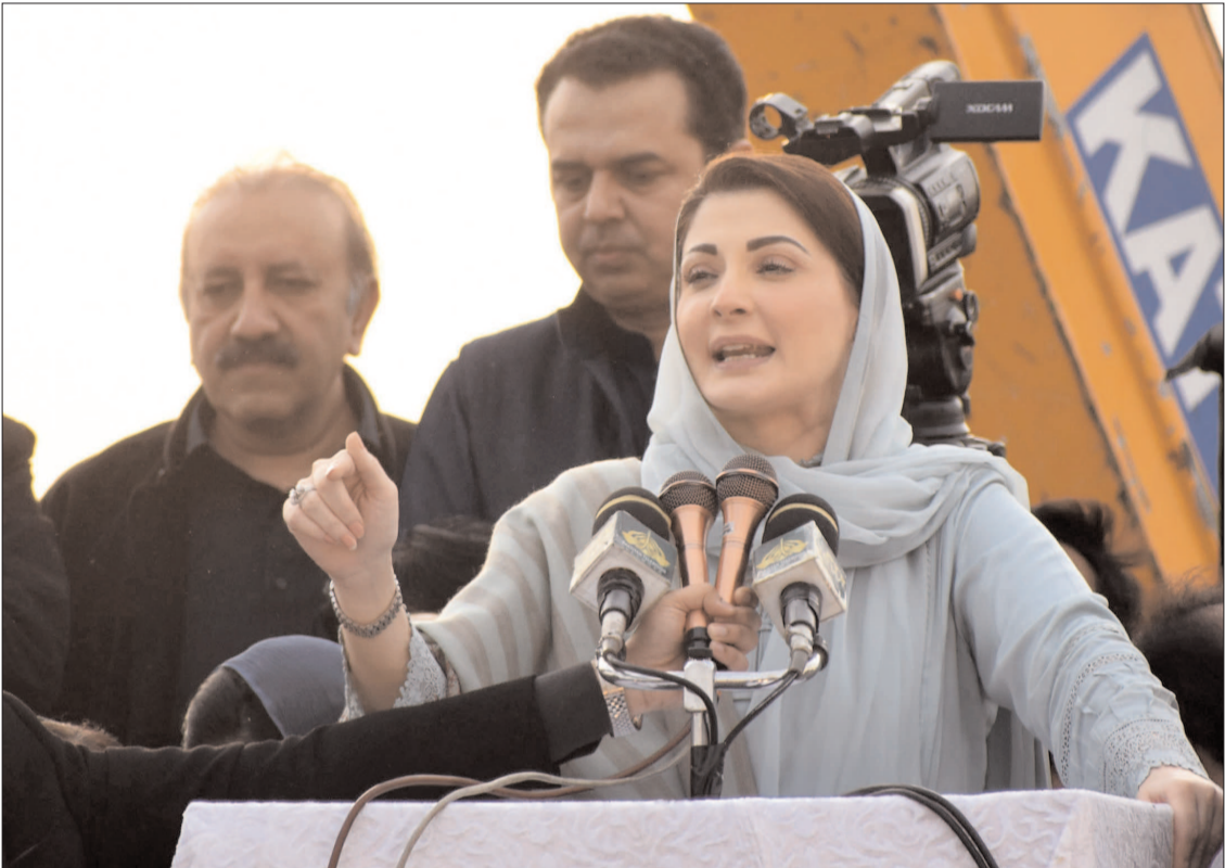
LAHORE: Senior Vice President and Chief Organizer of PML-N Maryam Nawaz Sharif addressing to supporters after arriving from London.