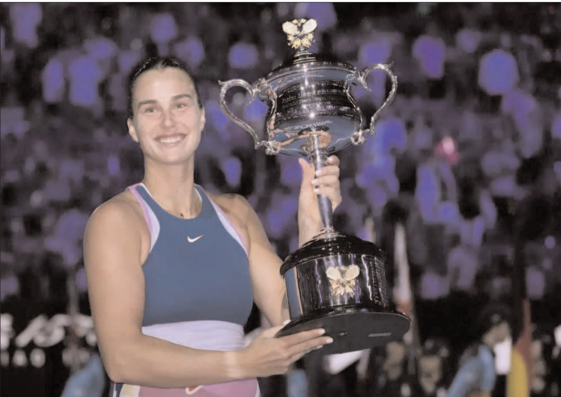
MELBOURNE: Aryna Sabalenka of Belarus holds the Daphne Akhurst Memorial Trophy after defeating Elena Rybakina of Kazakhstan in the women's singles final at the Australian Open tennis championship.

LONDON (Agencies): Paul Pogba is available for Juventus' Serie A fixture with Monza after recovering from a long-term knee injury, coach Massimiliano Allegri said on Saturday. France midfielder Pogba is yet to play a match for Juventus since returning from Manchester United last summer, injuring the meniscus in his right knee in July and missing out on the World Cup. He initially elected not to go under the knife in a bid to make the Qatar tournament but despite later changing his mind he didn't recover in time to play for Les Bleus who lost their crown as world champions in a thrilling final with Argentina. Pogba will be in the Dutchman squad alongside Madsen Vlahovic who comes back from a groin injury which has kept the Serbia striker out since early December.