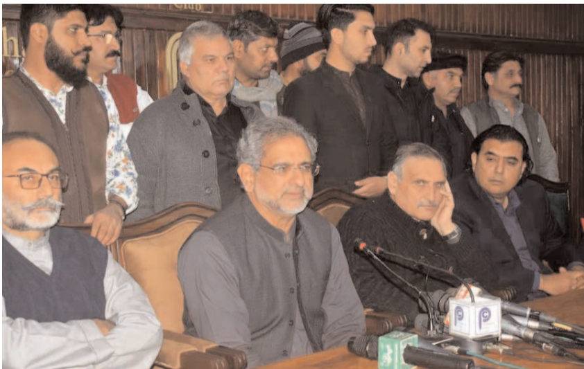
PESHAWAR: Former prime minister Shahid Khaqan Abbasi addressing a press conference.