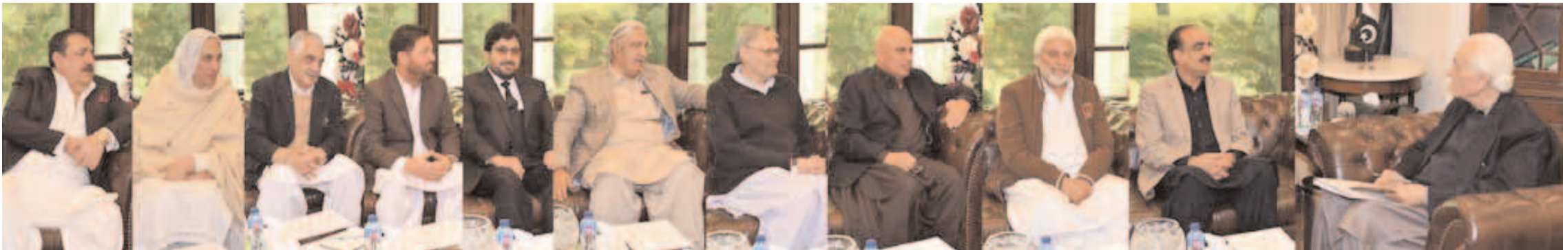
PESHAWAR: Provincial cabinet members meeting Caretaker Chief Minister Khyber Pakhtunkhwa Muhammad Azam Khan.