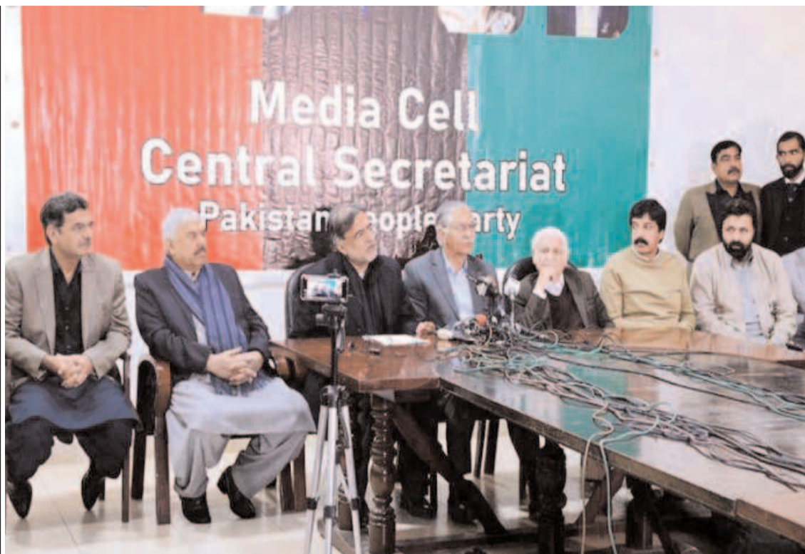
ISLAMABAD: Advisor to the Prime Minister on Kashmir Affairs and Gilgit Baltistan Qamar Zaman Kaira addressing a press conference.

100 cusecs, respectively. The release of water at Kalabagh, Taunsa, Guddu and Sukkur was recorded 35,700, 41,900, 23,900 and 8,300 cusecs respectively. Similarly, from River Kabul, a total of 11,900 cusecs of water released at Nowshera and 5,000 cusecs released from River Chenab at Marala.