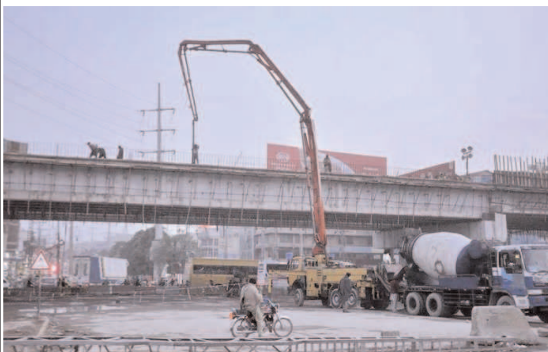
ISLAMABAD: A view of construction work of bridge at IJP Road during development work in the city.

The spokesman said that separate cases have been registered against the accused while further investigations were underway.