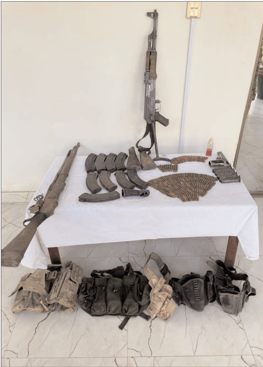
TANK: Security Forces conducted a search operation in Umar Adda area of Tank. During search operation, one SMG along with magazines, one 303 rifle, one pistol and a huge cache of ammunition was recovered.