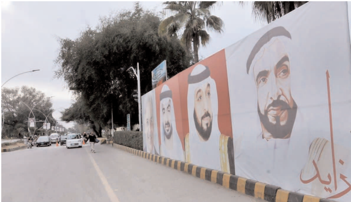
ISLAMABAD: Welcoming banners installed at Constitution Avenue during visit of President of the United Arab Emirates Sheikh Mohamed bin Zayed Al Nahyan at Federal Capital.