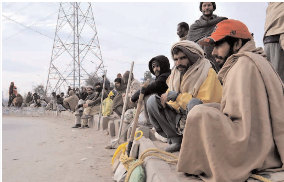
ISLAMABAD: Labourers along with their tools waiting for daily wages work while sitting along road at Khana Pull.