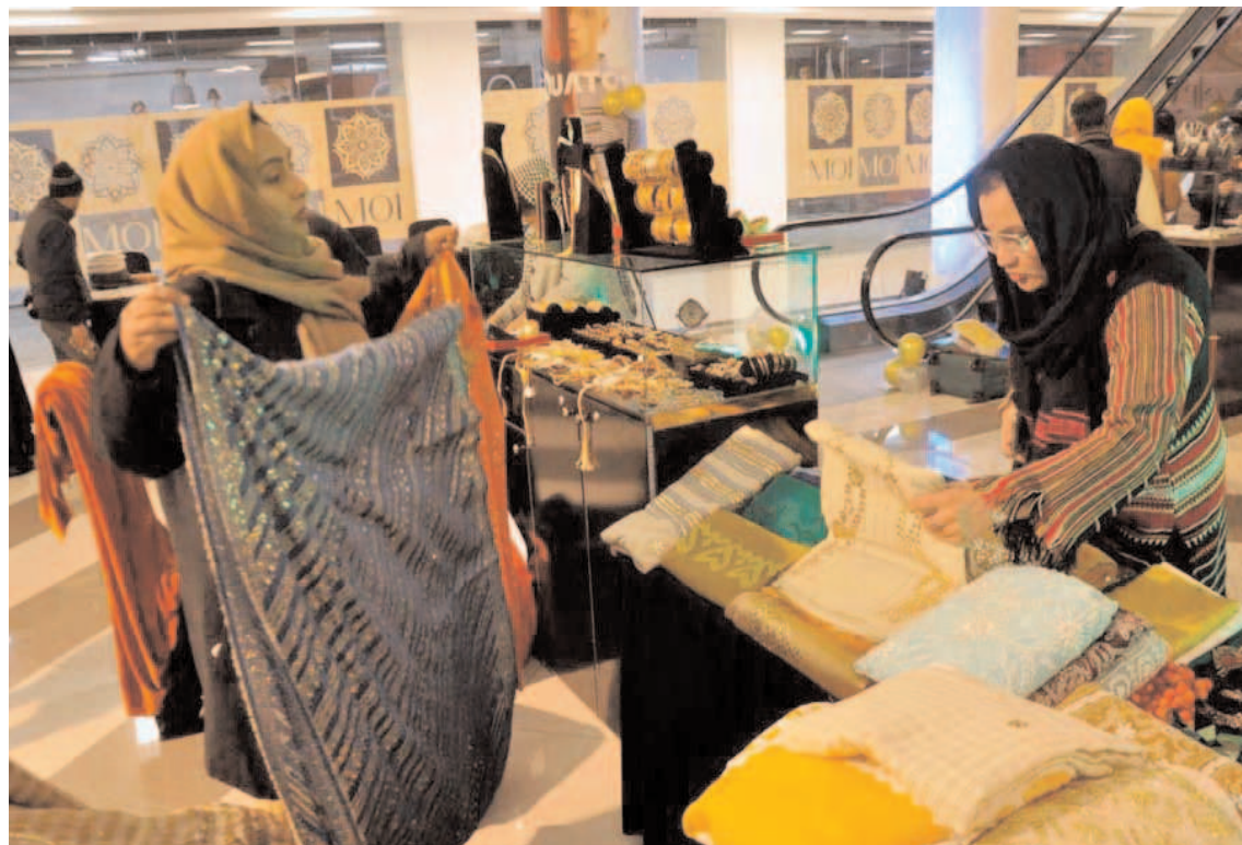
ISLAMABAD: A women displaying shawls and jewelry on his stall during Exhibition at local mall.

"The market will struggle to go above 270 in the short-term, correcting to 265 levels, if there is no negative news on the IMF or the political front. But traders will keep a close watch on depleting reserves which went below $10 billion for the first time in years," it added.