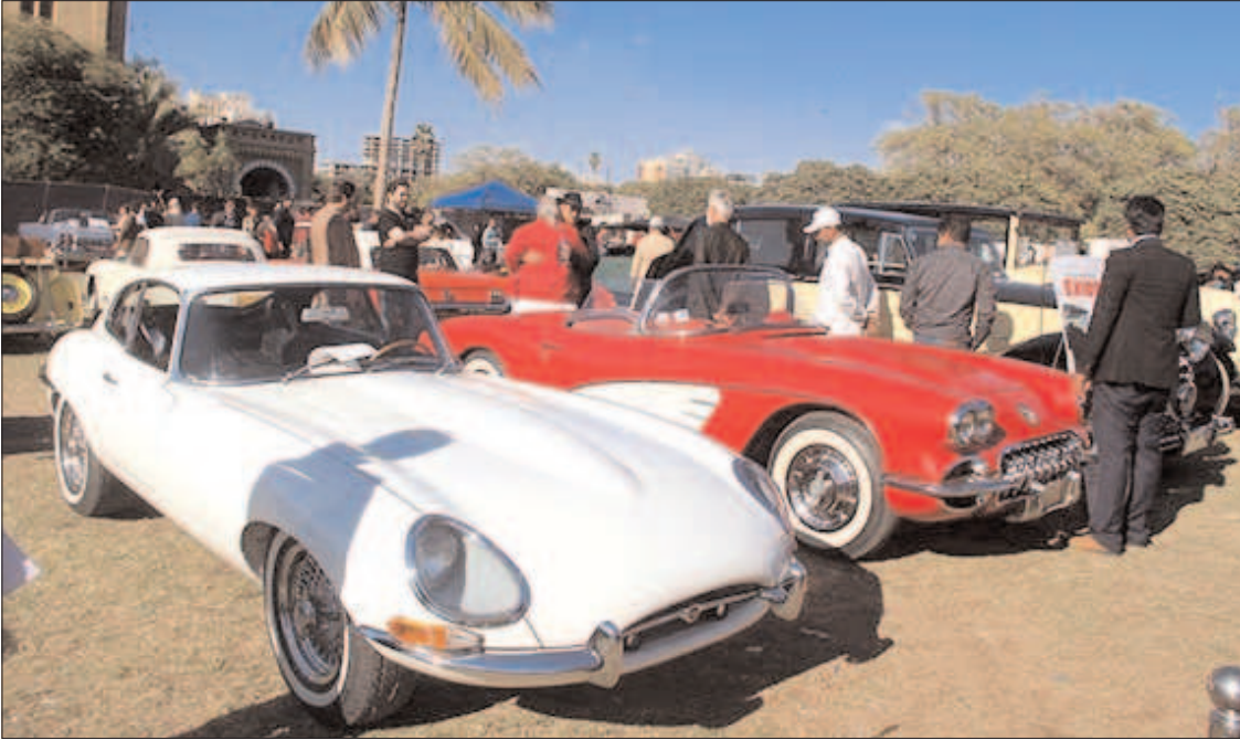
KARACHI: Vintage Care displaying during a car show organized by vintage and Classic Car Club of Pakistan.