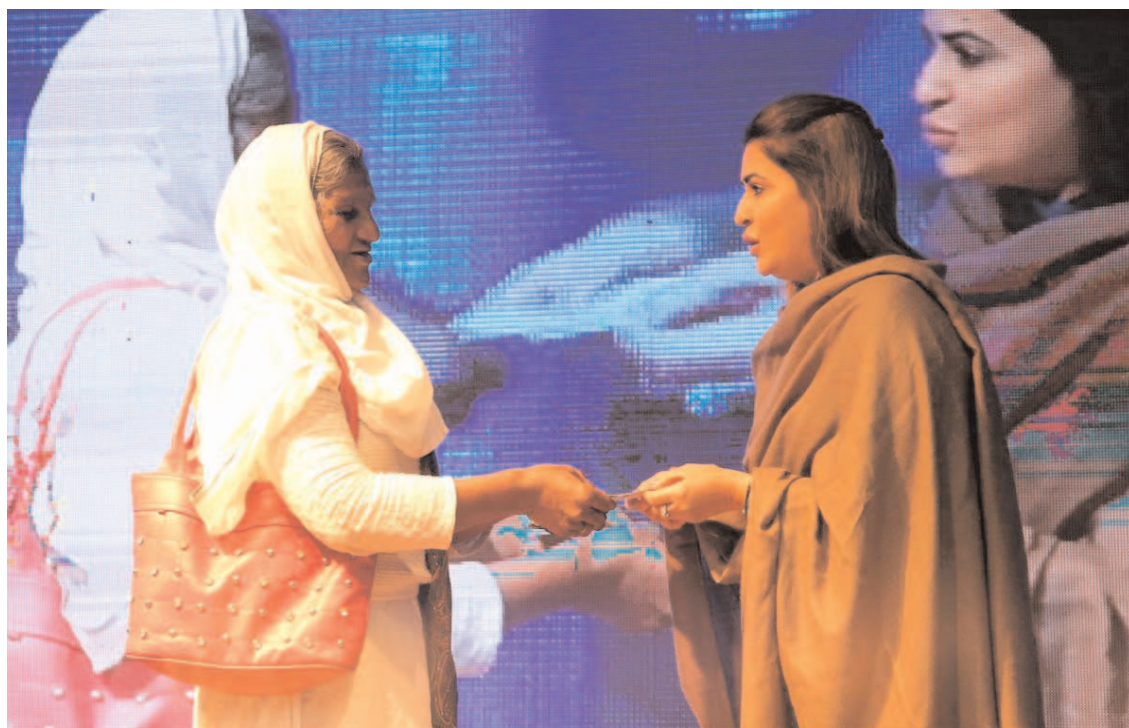
KARACHI: Federal Minister for Poverty Alleviation and Social Safety Shazia Marri handing over Rs7000 as a quarterly financial support to a transgender during a ceremony.

Later, she handed over Rs7000 financial assistance among three registered transgender.