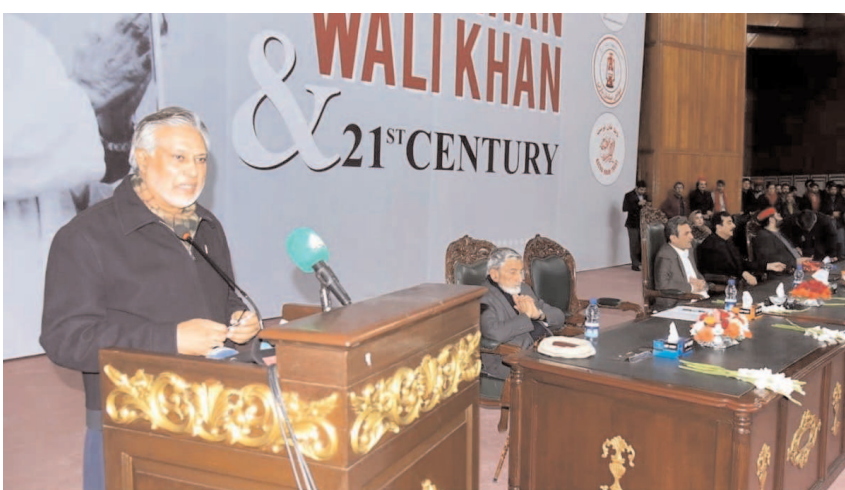
ISLAMABAD: Federal Minister for Finance and Revenue Mohammad Ishaq Dar addressing "Bacha Khan, Wali Khan & 21st Century" Conference.

On Saturday, Oil and Gas Regulatory Authority (OGRA) expressed serious concern over the circulation of speculative reports about an increase in prices of petrol and diesel.