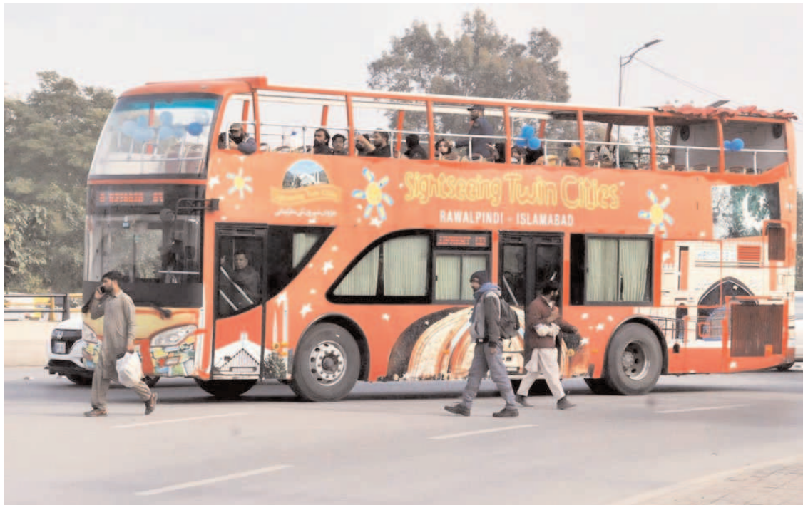
ISLAMABAD: A view of double-decker tour bus service which start from Rawalpindi towards Islamabad for people to visit Faisal Mosque, Daman-e-Koh, Saidpur Village, Parliament House, the Supreme Court, Lok Virsa and the National Museum and other tourist places of Federal Capital.