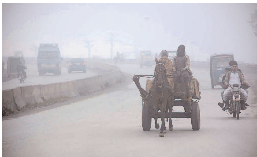
PESHAWAR: A view of thick fog at morning time that engulfs whole city.