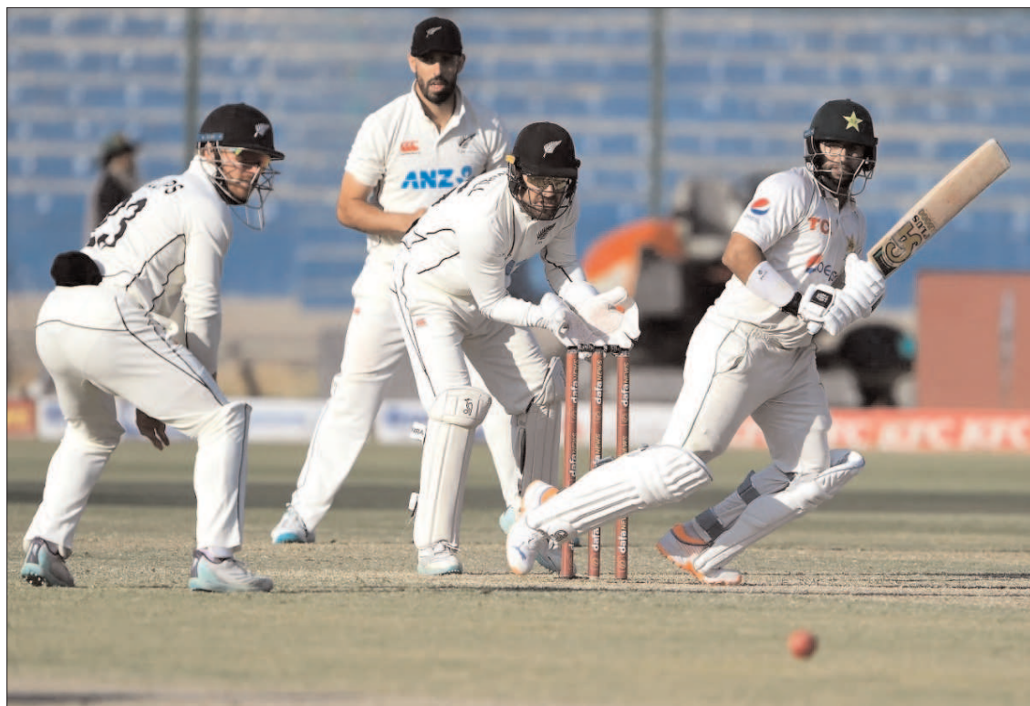
KARACHI: Imam-ul-Haq was unbeaten on 74 on second day.

Pakistan (1st innings) 154-3, 47 overs (Imam-ul-Haq 74 not out, Babar Azam 24, Shan Masood 20, Saud Shakeel 13 not out).