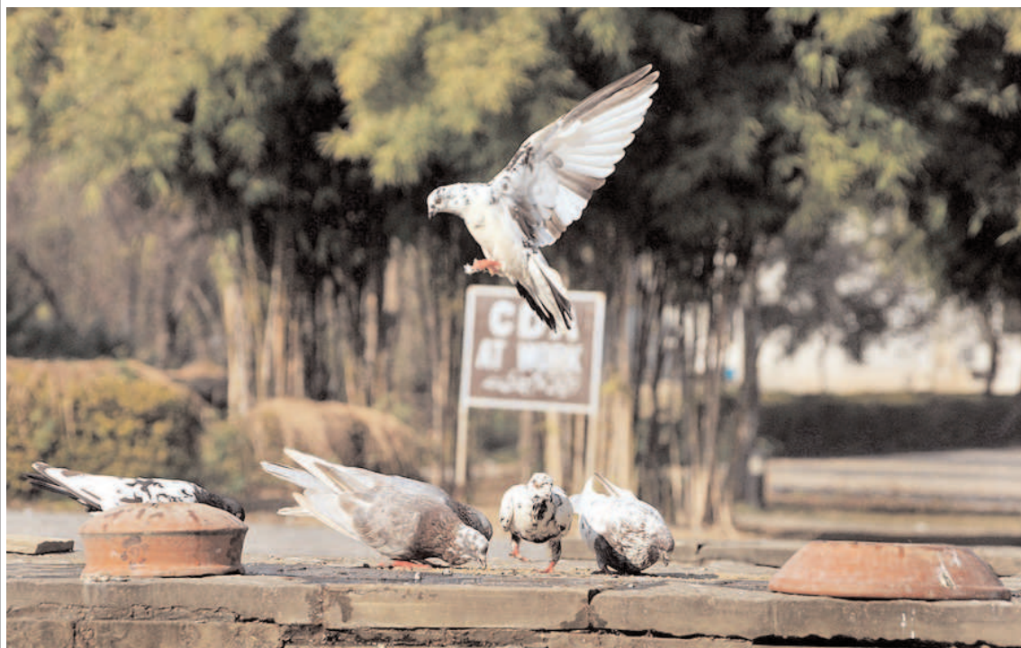
ISLAMABAD: Pigeons picking up food throwing by the people for mercy at F9 Park in the Federal Capital.

and Re-settlement), and Rs 5,000 each for Nai Gaj Dam Project Dadu (Sindh) and Kaachi Canal Project (Phase-I) Dera Bugti, Naseerabad, Bolan and Jhal Magsi. The major allocation for new schemes included Rs 500 million for the Chashma Right Bank Canal Left Cum Gravity Project and Rs 300 million each for the construction of five Small Dams Salari-2 Dam, Rai Jo Da Dam, Shalmani Dam, Garwari Dam and Amari Dam in Kohistan Dadu, for construction of six dams including Densi, Kcodal, Kambowah, Khirpura and others; for construction of six smalls dams in District Zhob and Sherani.