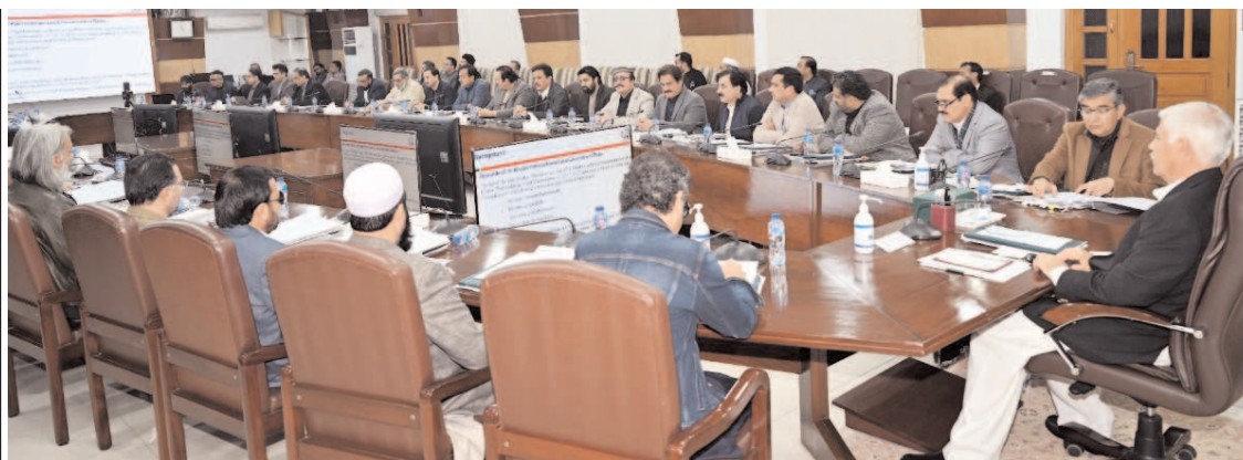
PESHAWAR: Chief Minister Khyber Pakhtunkhwa Mahmood Khan chairing 85th meeting of Provincial Cabinet.

It requested people to pray for early recovery of JUI-F central leader Maulana Fazl ur Rehman instead of visiting him or contacting him on telephone.