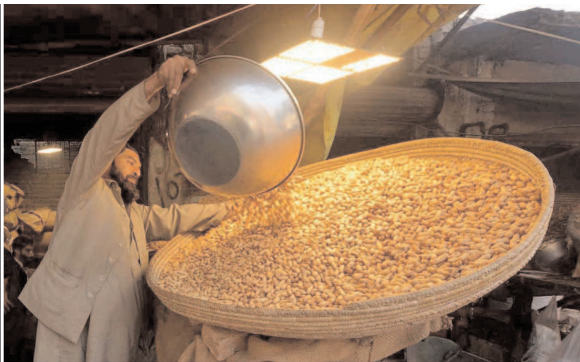
PESHAWAR: Vendor selling and displaying peanuts to attract customers.

The dollar rallied against the euro and pound, rebounding from losses in December following the festive break.