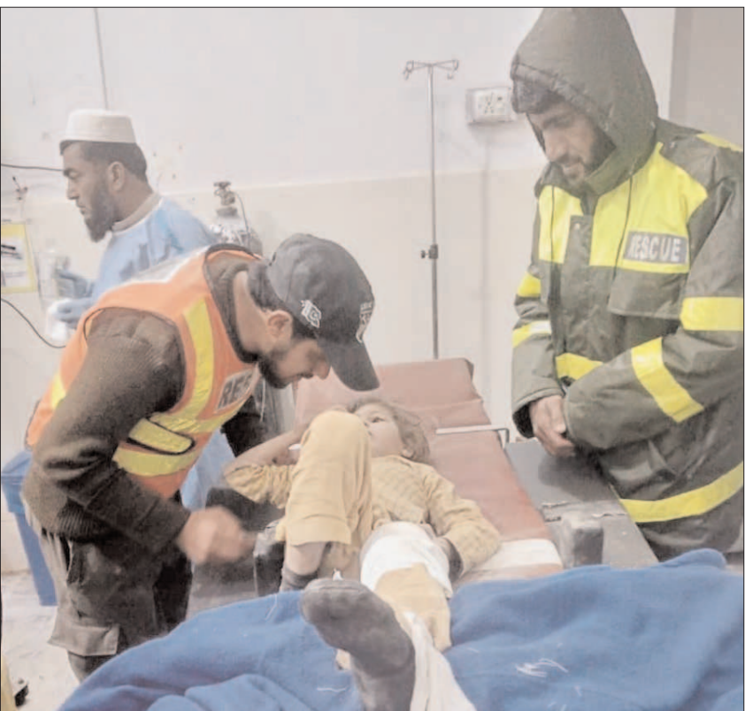
KHAR: Rescue 1122 officials giving treatment to an injured child after roof collapsed in Bajaur.