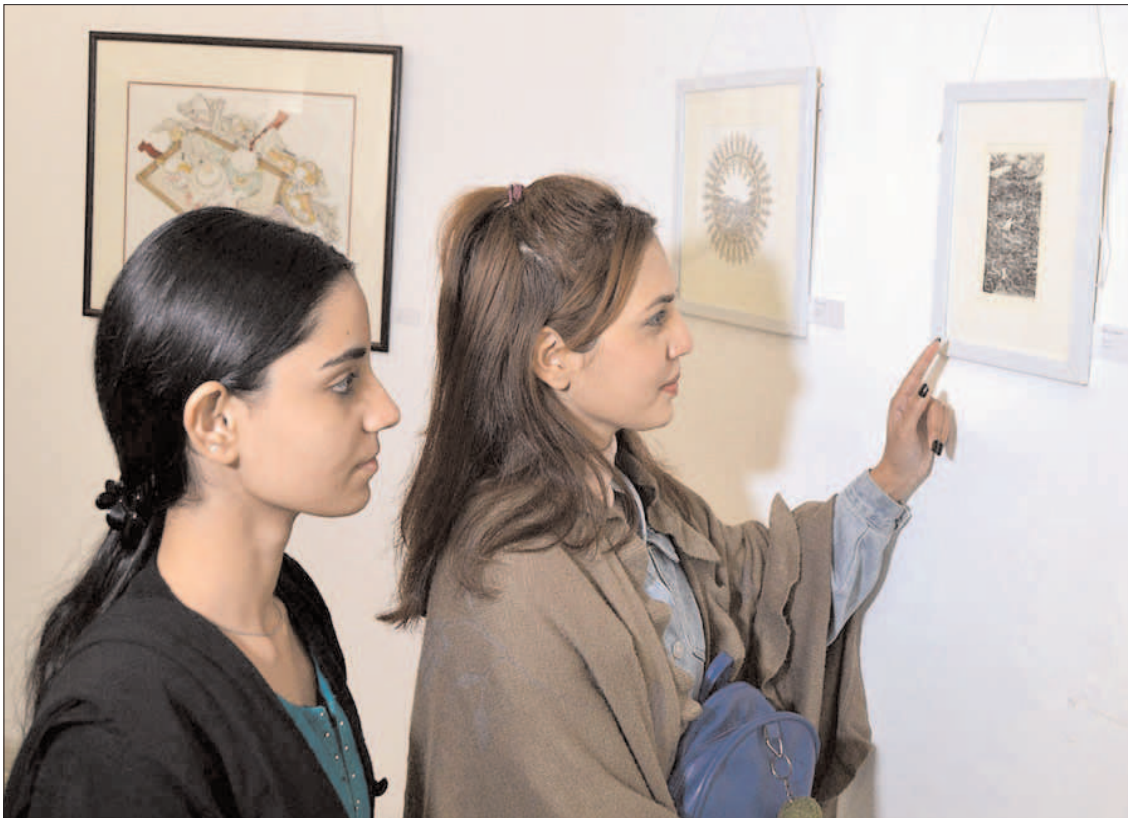
LAHORE: Students from different universities are coming to see the artworks of the students from Fatima Jinnah University Rawalpindi at Al Hamra Art Gallery.

Kohat University of Science & Technology, Kohat Ph #, (0922)52914790 (Ext-4790) Website: www.kust.edu.pk