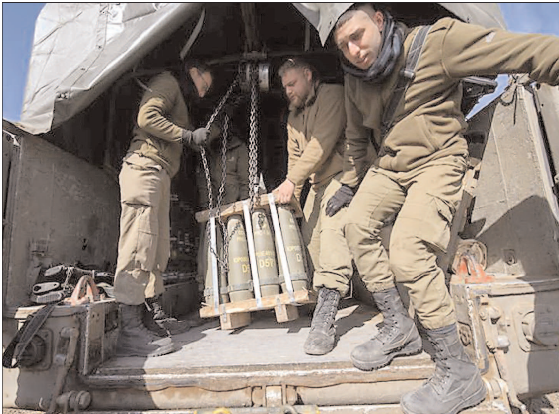
JERUSALEM: Israeli forces shifting heavy arms and ammunition in the mountains of Golan.

"The public office-holders including president, prime minister, chairman/deputy chairman senate, speaker/deputy speaker of an assembly, federal ministers, ministers of state, governors, chief ministers, provincial ministers, and advisers to the prime minister and the chief minister, mayor/ chairman/ Nazim, their deputies, cannot participate in the by-polls campaigns," according to ECP code of conduct.