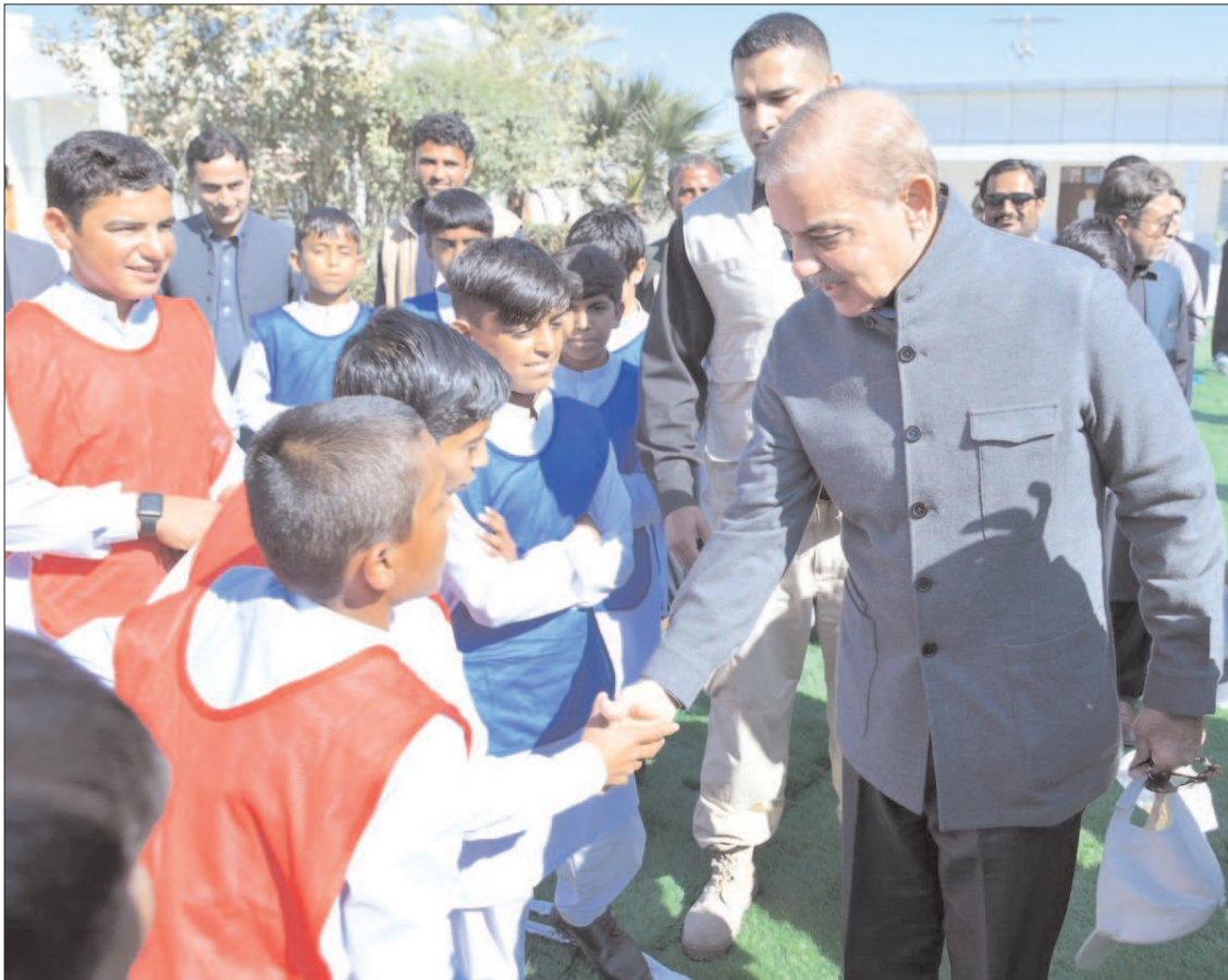
SOHBATPUR: Prime Minister Shahbaz Sharif interacting with students after inaugurating new building of Govt Boys Secondary School, Ghulam Rasool, Jia Khan Sohbatpur, Balochistan.