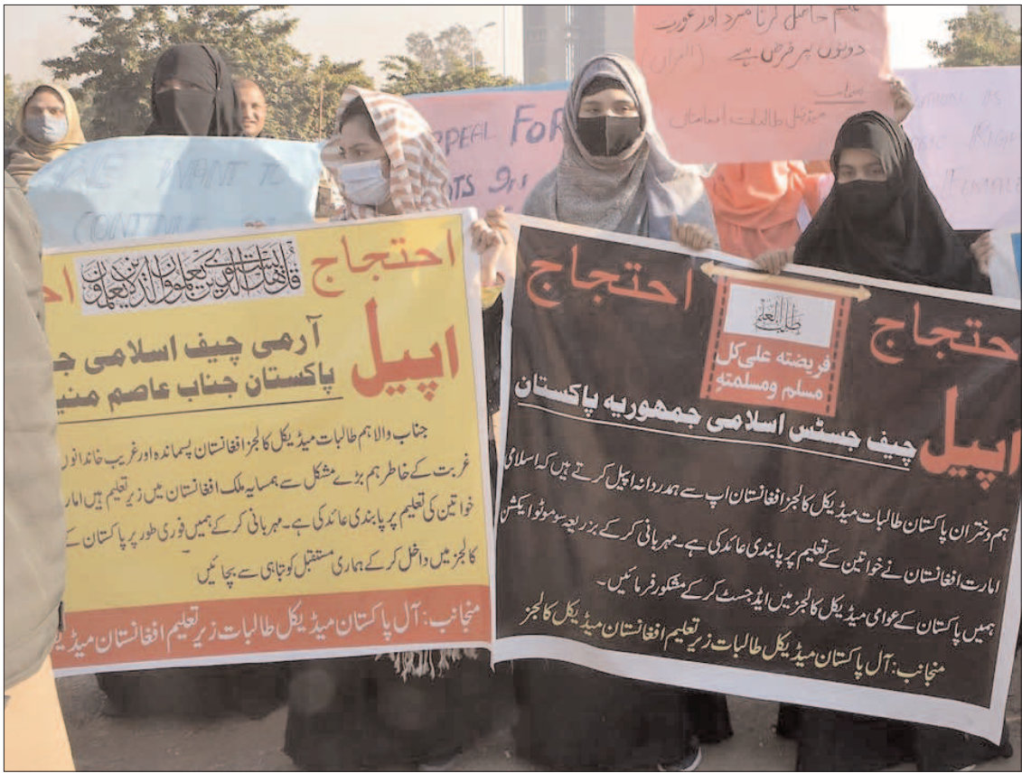
ISLAMABAD: Female Pakistani Medical studying in Afghanistan holding protest in favour of their demands after female education banned in Afghanistan.