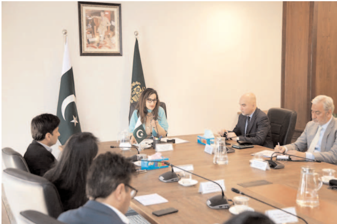
ISLAMABAD: Federal Minister for Climate Change, Senator Sherry Rehman meeting with Pakistan Humanitarian Forum (PHF), Secretariat Team and Members Executive Committee.

ISLAMABAD (APP): Islamabad Electric Supply Company (IESCO) on Wednesday issued a power suspension programme for Thursday for various areas of its region due to necessary maintenance and routine development work. According to an IESCO Spokesman, the power supply of different feeders and grid stations would remain suspended for the period from 09:00 AM to 02:00 PM, Islamabad Circle CDA Flats, Shaheed Millat, Pandorian, Athal, Ghori Garden, UC Road, F-10, G-10 Center, I-8/3, I-10/4, G-13/2, E-11/2, NIH, AQ Khan, Khadana, Beirut, Nimbal, Patriata, Upper Topa, Bri Imam, Sohtran Road Feeders, Rawalpindi City Circle City, F-Block, Abdul Rehman, Shaheed Mohammad Deen, Khanna II, Muslim Town, AFOHS, Tamasamabad, Liaquat Bagh, Gulshanabad, Sarafa Bazar, Jinnah Road, Iqbal Road, Quaidabad, Abubakar, Kayani Road, Captain Aamir, EME Complex, P&T Wini, Zeeshan Colony, MH-1&2, NLC, I-16/1, Ratta Feeders, Rawalpindi Cantt Circle, Hyder Road, Cantt, Dhok Farman Ali, Jail Park, Swan Garden, II, Lar View, Topi Pump, Lal Karti, 502 Workshop, Dharmial, Quaid-e-Azam Colony, RA Bazar, New GHQ, CMH.I, Army Flats, New Rawat, Kahota City, Khawaja, Ghazan Khan, Mandara, LTC, Hameed Jhanghi, Mandara.