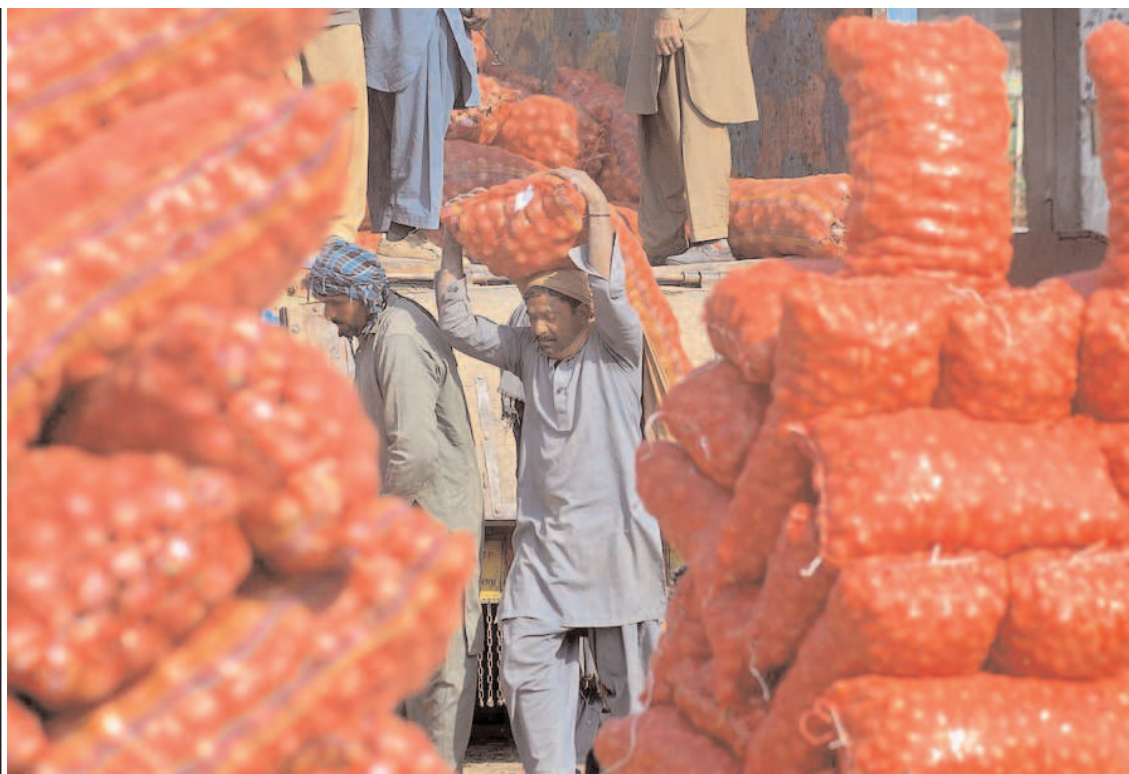
MULTAN: Daily wages workers unloading onion bags from delivery truck at vegetable market.

The price of gold in the international market increased by $29 and was sold at $1862 against its sale at $1833, the association reported.