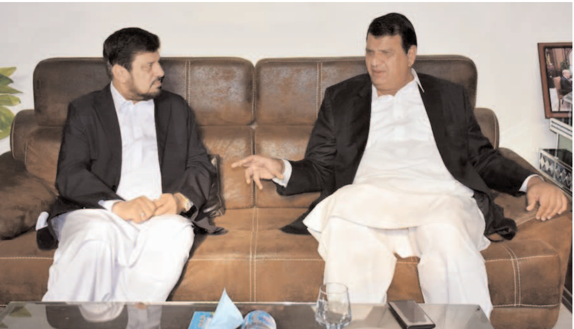
PESHAWAR: Advisor to Prime Minister Engr. Amir Muqam meeting with Governor Khyber Pakhtunkhwa Haji Ghulam Ali.

PESHAWAR (APP): Khyber Pakhtunkhwa Assembly noted that climate change has taken a dangerous form and a lot of effort is needed to deal with it. In the meeting, useful suggestions were made to promote the growth of wildlife and solve the problems of the employees. The committee members expressed resentment for not taking them into confidence about the recruitment of class-IV officials, workshops, seminars and plantation campaigns and other necessary events. In the meeting, suggestions were given to remove the complaints and concerns of the needy people by providing permits for