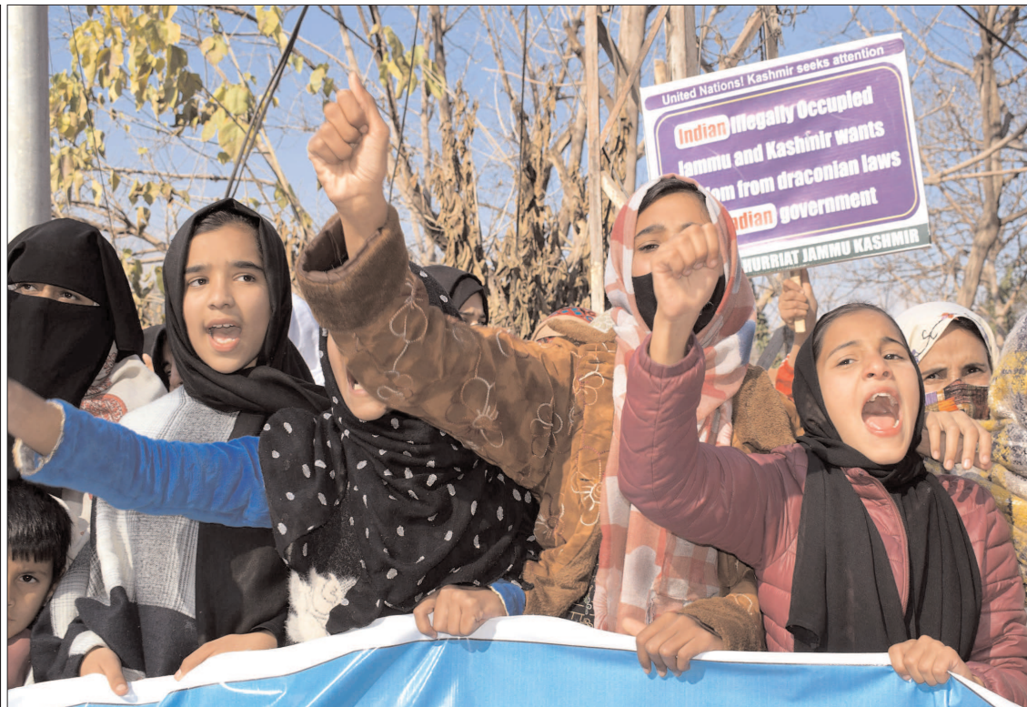
MUZAFFARABAD: Activists of Pasban-e-Hurriyat Jammu and Kashmir chanting slogans during a protest on the occasion of Right to Self-Determination Day.

A day earlier, the federal cabinet approved an energy conservation plan under which markets would be closed by 8:30pm and wedding halls at 10pm. "A message of elections has been conveyed and schedule is yet to be decided," he said while asking the public to start preparations for the general election.