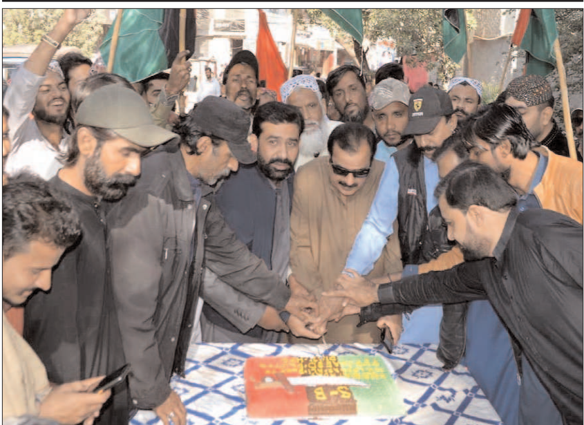
HYDERABAD: Workers of PPP (SB) cutting the cake during the 95th birthday anniversary of founding chairman of PPP and late Prime Minister Zulfikar Ali Bhutto.

The provincial government is taking timely measures while realizing the problems of the people of Gwadar. Due to the untiring efforts of the administration, business and other activities are fully restored. About trade activities at the port, she noted that Gwadar port is also fully functional.