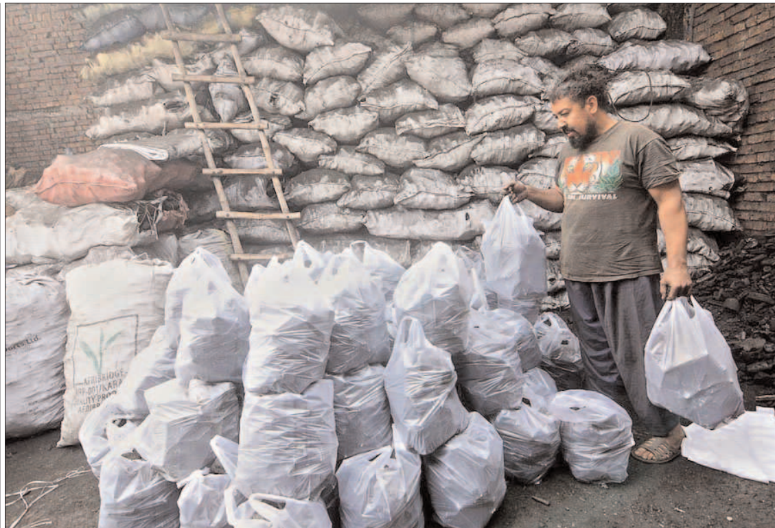
LAHORE: Coal vendors selling coal for domestic and commercial purpose at his roadside setup at.

Islamabad capital police is utilizing all available resources to facilitate the general public. He also appealed to the citizens to follow the traffic rules. The personnel of the force issue traffic violation tickets not as a punitive measure but as a safe road environment in the capital and secure lives of people, he maintained.