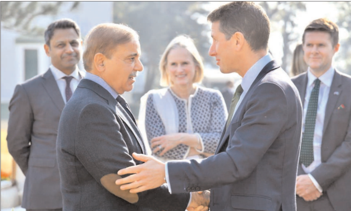
ISLAMABAD: Outgoing British High Commissioner, Christian Turner paying a farewell call on Prime Minister Shehbaz Sharif.

In their separate messages in connection with Kashmiris' right to self-determination day on Thursday, they regretted that the oppressed people of Indian Illegally Occupied Jammu and Kashmir have not been able to exercise their right for the last seventy-four years.