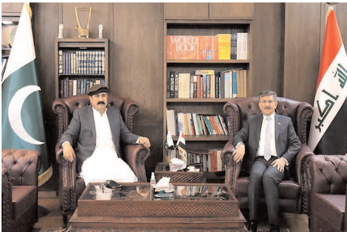
ISLAMABAD: Federal Minister for Overseas Pakistanis and Human Resource Development Sajid Hussain Turi met H.E. Hamid Abbas Lafta, Ambassador of the Republic of Iraq to Pakistan.

ISLAMABAD (APP): Mohsin Shah Nawaz Ranjha, a Pakistan Muslim League Nawaz (PML-N) leader said on Thursday that the government would complete its constitutional term and election amendments would be conducted before the election to maintain transparency. While talking to a private news channel, Mohsin Ranjha said the coalition government was ready to talk about early elections, but the Pakistan Tehreek-e-Insaf (PTI) should come to parliament and work out a framework for the transparency of elections. PML-N leader alleged PTI leaders of having "double standards," as they were receiving remuneration and using the facilities of parliament houses while also playing politics in the name of resignations.