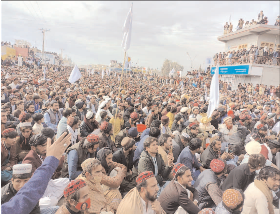
WANA: Thousands of people in South Waziristan's took to streets on Friday against the recent wave of terrorism and demanded the immediate restoration of peace in region.