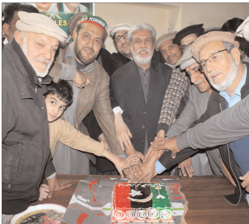
PESHAWAR: Workers of PPP cutting cake to celebrate the birthday of Zulfiqar Ali Bhutto.