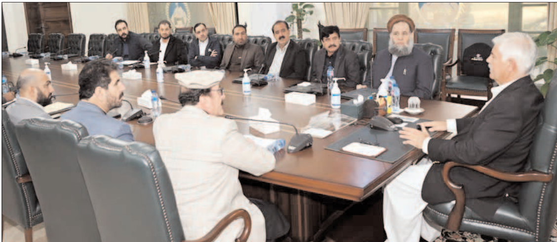
PESHAWAR: Chief Minister Khyber Pakhtunkhwa Mahmood Khan chairing a meeting of the elected public representatives from the newly merged areas.