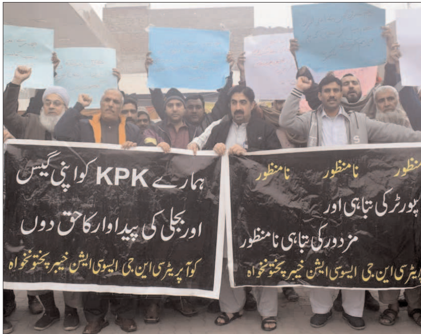
PESHAWAR: Activists of Cooperative CNG Association holding a protest for acceptance of their demands.