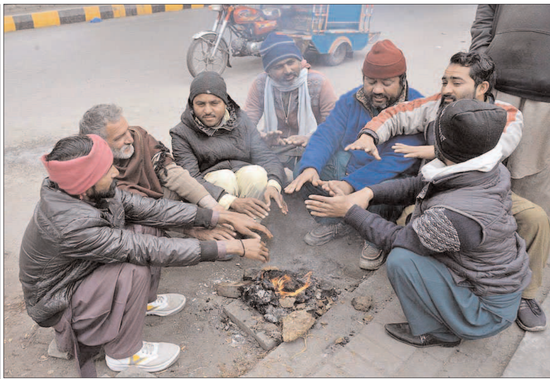
LAHORE: People are gathered around fire to keep themselves warm in cold weather near Railway Station.

over three years in the first phase, process of bio metric verification of vehicle owners would start through NADRA Sahulat Program. Under this agreement, vehicles operating on fake documents and vehicles operating without transfer or running on open letters will be discouraged.