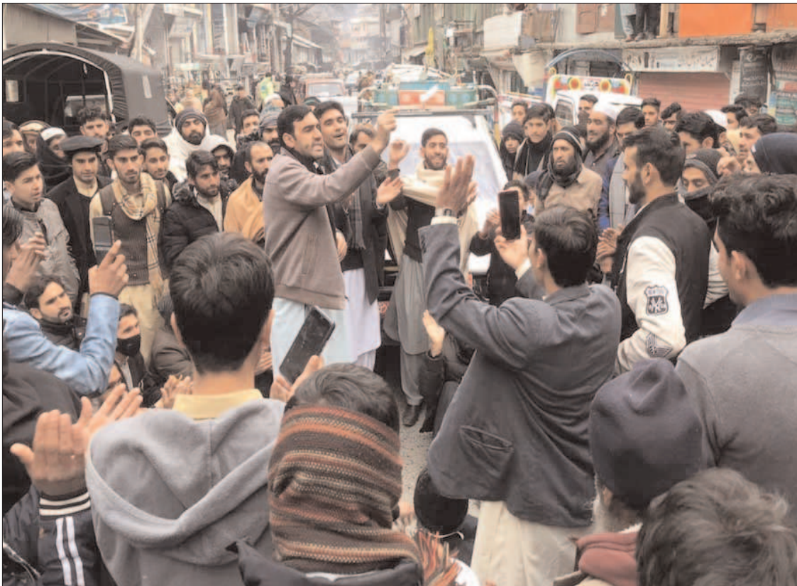
SHANGLA: Local residents holding a protest at Belay Baba Bazaar as they demand completion of Doulat Kalay Raod.