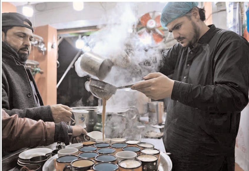
RAWALPINDI: Vendor making tea for the customers at Kohati Bazar.

In addition to subsidized items, hundreds of items of other standard brands are also available at affordable prices than market.