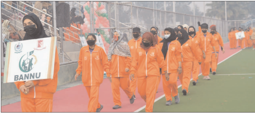
Shahid Khan Afridi