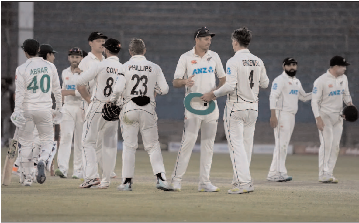
KARACHI: Players shake hands after a tantalising draw.