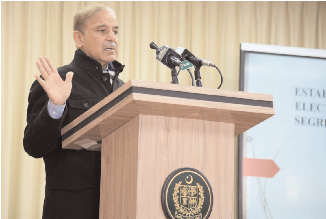
ISLAMABAD: Prime Minister Shehbaz Sharif addressing the establishment of Hazara Electric Supply Company ceremony.

Vol. XXXIX No. 350 Regd. No. 241 JAMADI-US-SANNI 14 1444 -- SATURDAY, JANUARY 07 2023 PESHAWAR EDITION 12 PAGES Price. 20