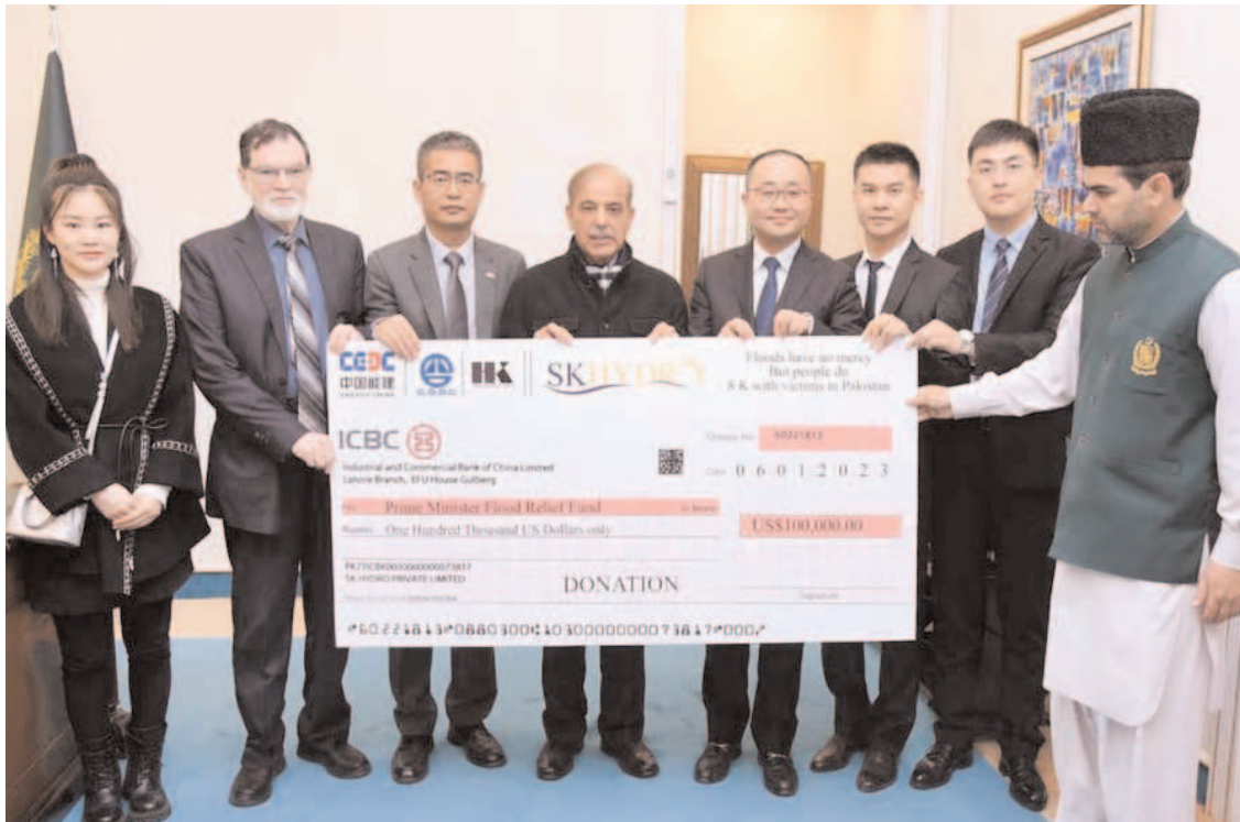
ISLAMABAD: CEO SK Hydro presenting a cheque of One Hundred Thousand US Dollars to Prime Minister Muhammad Shehbaz Sharif for the flood victims.