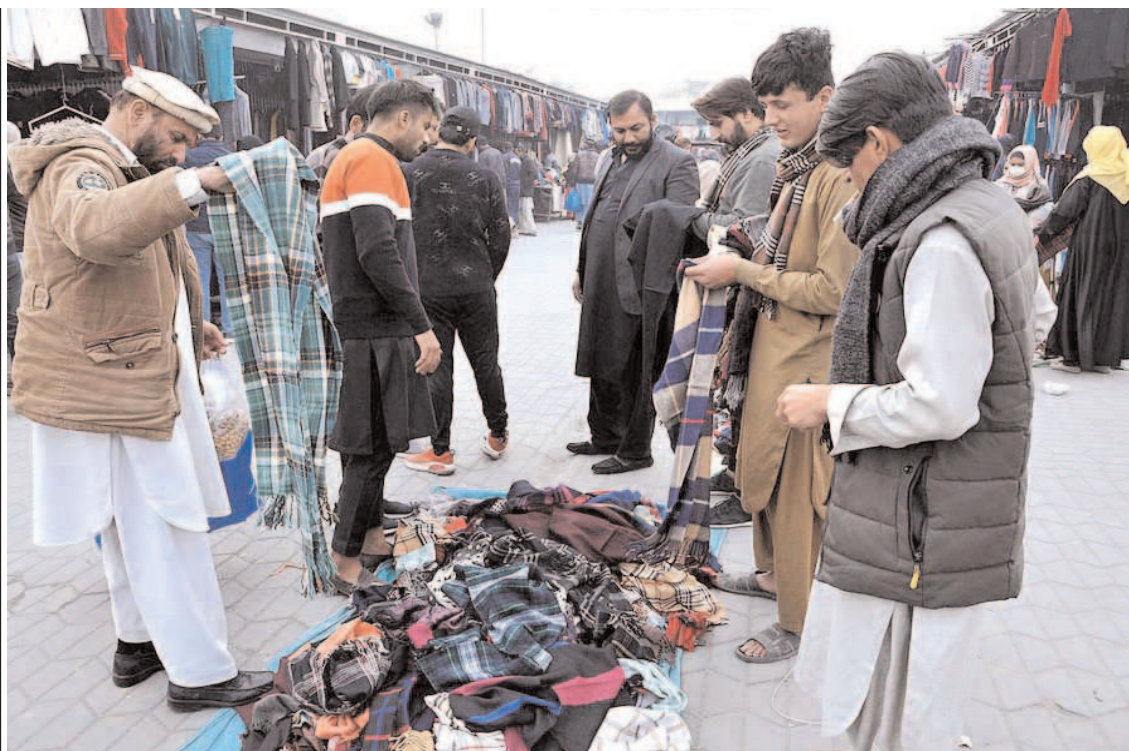
ISLAMABAD: Street vendor selling muffers to the customers at Weekly Juma Bazar Peshawar Morr.

Navios Constellation and Leni left the port on Friday morning and two more ships, Gion Trader and Elise are expected to sail on today in the afternoon.