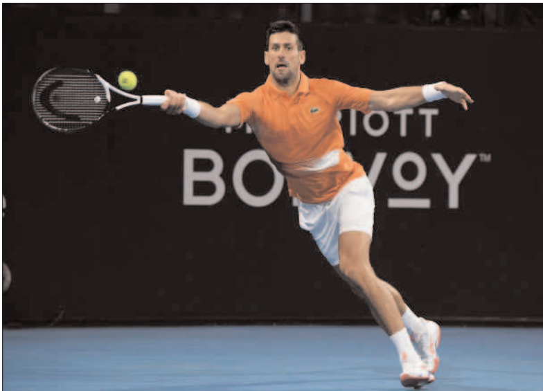
ADELAIDE: Novak Djokovic of Serbia hits a forehand against Denis Shapovalov of Canada during day six of the 2023 Adelaide International.

Sarfraz, who hit nine fours and a six in his first test century since making 112 against New Zealand in Dubai in 2014, said: "When 140 runs were left (in the final session), the management said that you need to keep trying to score when the ball is there to hit. If those two wickets didn't fall then the result could've been something else."