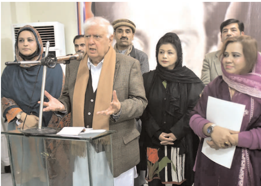
PESHAWAR: Chairman Qaumi Watan Party Aftab Ahmad Khan Sherpao addressing on oath taking of City District arranged by QWP.