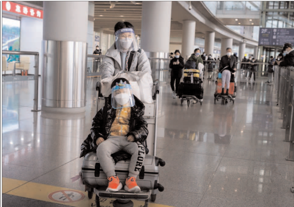
BEIJING: Passengers push their luggage through the international arrivals hall at Beijing Capital International Airport after China lifted the coronavirus disease (COVID-19) quarantine requirement for inbound travellers.

In a petition, the Jamaat-e-Islami called upon in Election Commission of Pakistan to fulfil its constitutional responsibility by holding local government elections in Karachi and Hyderabad on time. PPP-led Sindh government and MQM-Pakistan had moved ECP over delay in LG polls due to delimitations issue. It is pertinent to mention here that the new phase of the Sindh LG polls are scheduled for January 15 in Karachi Division after its postponement six times.