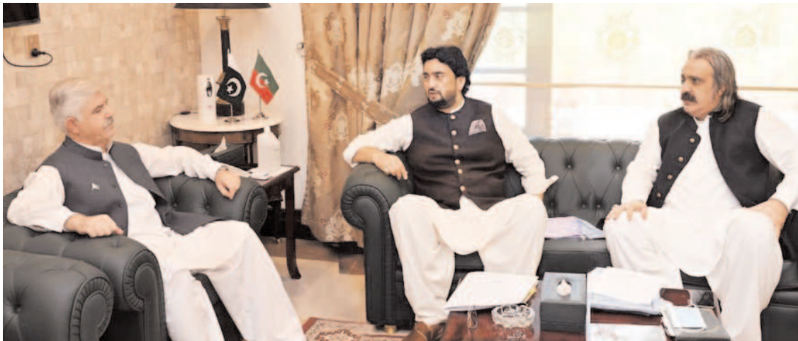
PESHAWAR: PTI leaders Ali Amin Gandapur and Sherharyar Afridi meeting with Chief Minister Khyber Pakhtunkhwa Mahmood Khan.

Later, the funeral of the boy was offered here in the Wensum College ground which was attended by a large number of people.