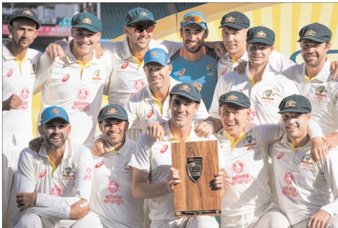
SYDNEY: Pat Cummins and players celebrate with the trophy after day five of the Third Test match.

However, Erwee battled alongside Heinrich Klaasen, who made 35 from 61 balls, while Temba Bavuma added an unbeaten 17 from 42 balls as Australia's bowlers struggled to break through on a slow pitch and South Africa recorded their first drawn Test in 47 matches.