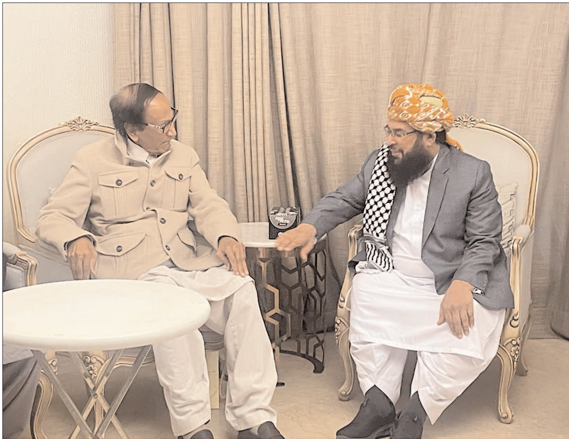
LAHORE: General Secretary of the Jamiat Ulama-e-Islam (F) Abdul Ghafoor Haideri calls on president of the Pakistan Muslim League (Q) Chaudhry Shujaat Hussain.

"Now Imran is attacking the Election Commission of Pakistan. He is talking against the state institutions. He has enraged Pakistan's friends and isolated the country in the comity of nations. He made Turkey, Malaysia, China and Europe angry," Kaira lamented. The PM advisor was of the view if the former premier stuck to power any longer, the country would have to endure more pain.