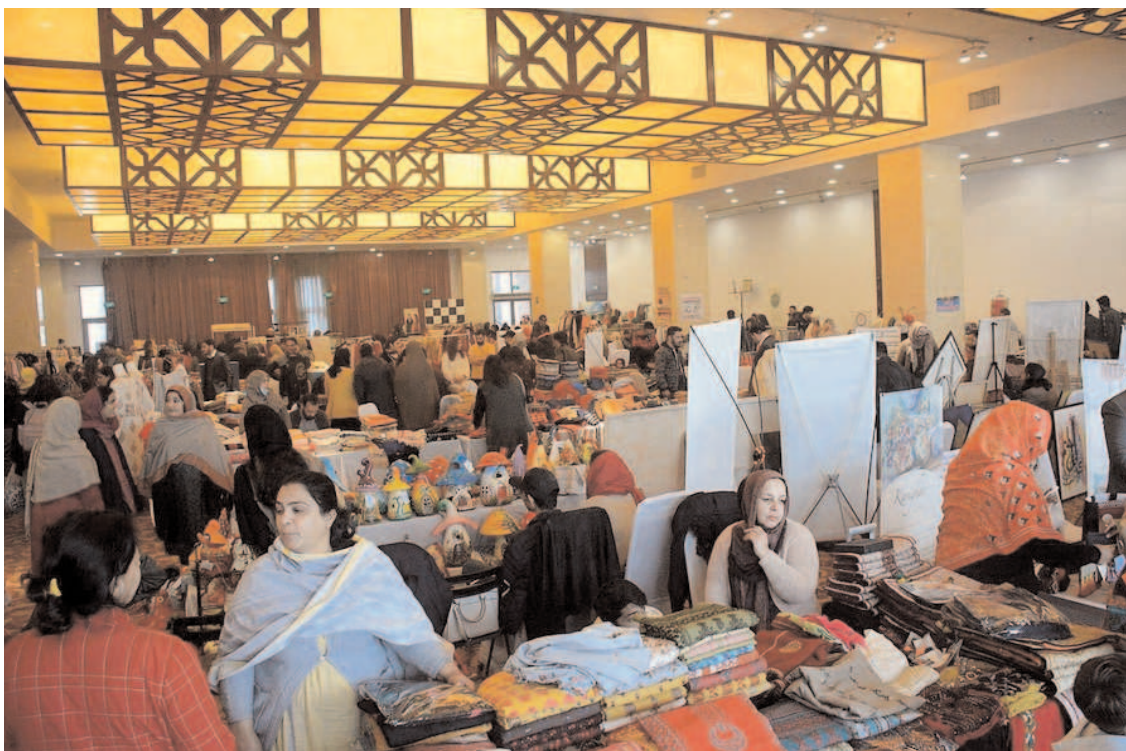
ISLAMABAD: Artisans displaying their products on their stalls during the “BEHBUD Art & Craft Bazaar” at Pak-China Friendship Center.

Pakistan's biggest agricultural machinery manufacturer, Millat Tractors, said that it would remain closed from January 6 till further notice, citing reduced demand and cash flow problems. A number of auto part vendors have suspended operations in recent months, citing reduced demand and import curbs imposed by the State Bank of Pakistan (SBP) — that were lifted last week — among other issues. Some textile companies have also partially suspended production recently due to demand destruction and market conditions.