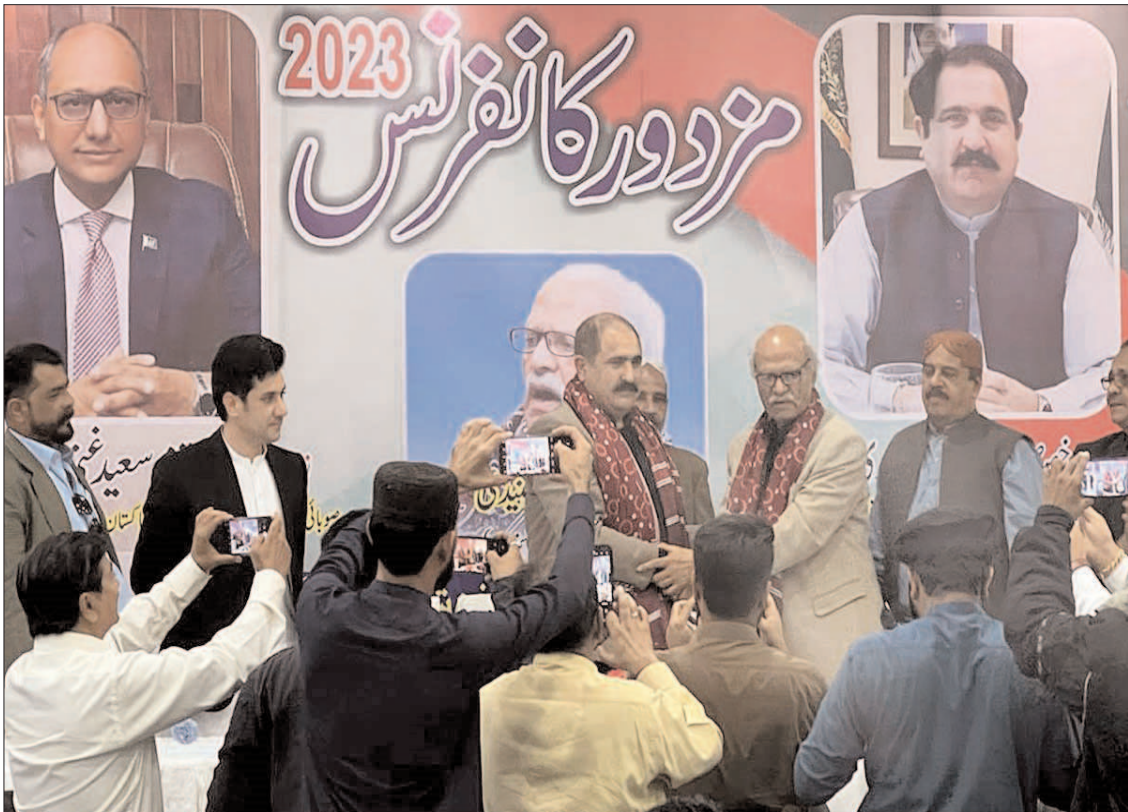
KARACHI: Federal Minister for Overseas Pakistanis and Human Resource Development Sajid Hussain Turi attended and addressed the Labour Conference 2023.

It is notified for the information that my original qualifying certificate of Bachelor of Science in Electrical Engineering of the year 2009-2013 and Roll Number 09-EE-86 issued by UET Taxila is lost. If found or seen by anyone please contact 0307-5273381