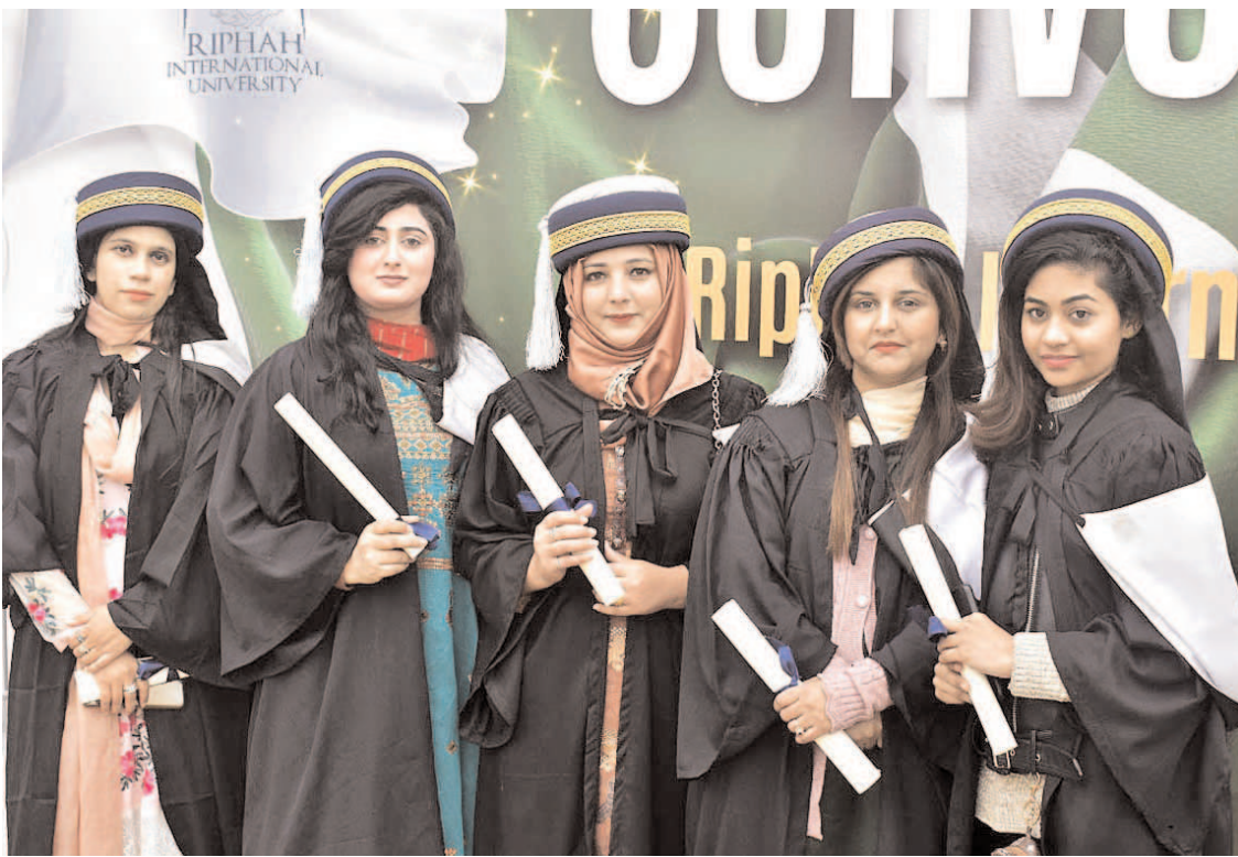
ISLAMABAD: Students during Riphah University 17th convocation at Convention Centre.

ISLAMABAD (APP): Indus River System Authority (IRSA) on Sunday released 24,400 cusecs water from various rim stations with inflow of 38,000 cusecs. According to the data released by Indus River System Authority (IRSA), water level in River Indus at Tarbela Dam was 1494.46 feet and was 96.46 feet higher than its dead level of 1,398 feet. Water inflow and outflow in the dam was recorded as 16,300 cusecs while outflow as 5,000 cusecs. The water level in River Jhelum at Mangla Dam was 1119.55 feet, which was 69.55 feet higher than its dead level of 1,050 feet. The inflow and outflow of water was recorded 6,300 cusecs and 4,000 cusecs respectively. The release of water at Kalabagh, Taunsa, Gadda and Sukkur was recorded 11,100, 15,200, 4,600 and 5,800 cusecs respectively. Similarly, from River Kabul, a total of 8,700 cusecs of water released at Nowshera and 6,700 cusecs released from River Chenab at Marala.