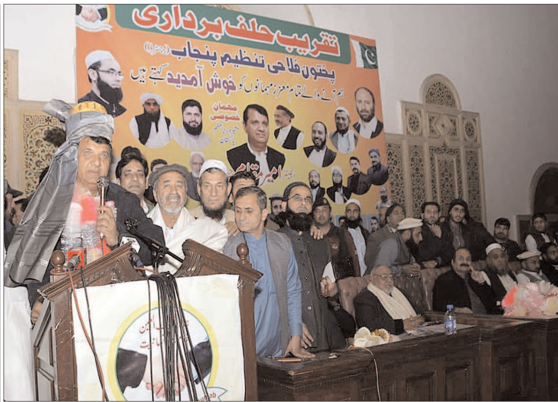
LAHORE: Adviser to Prime Minister for Political, Public Affairs, National Heritage and Culture Engr. Amir Muqam addressing at the event organized by the Pakhtun Welfare Trust at Aiwan e Iqbal.