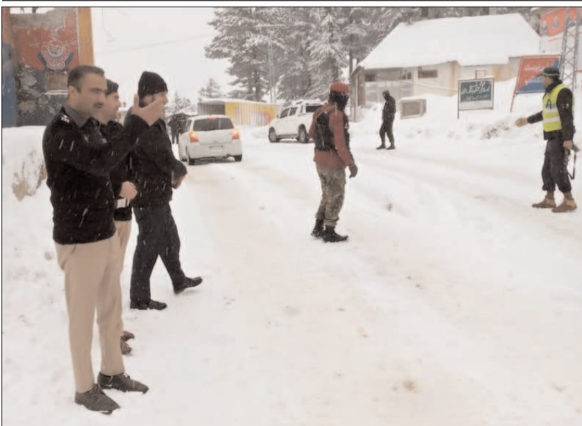
SHANGLA: Police officials inspecting Alipuri-Khwazakhela road after heavy snow.