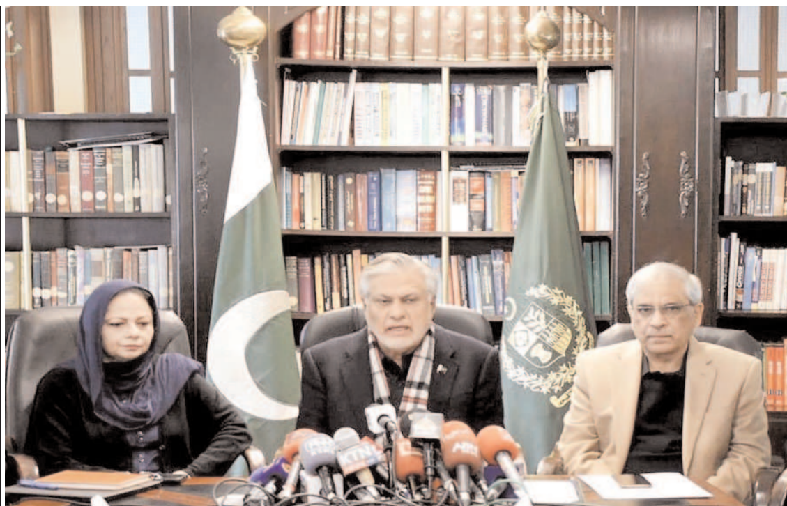
ISLAMABAD: Federal Minister for Finance and Revenue Senator Mohammad Ishaq Dar briefing the media on conclusion of talk with the IMF Mission at Finance Division.

The commodities that witnessed an increase in prices on a YoY basis included, onions (507.98%), chicken (93.21%), diesel (81.41%), eggs (79.19%), rice basmati broken (68.92%), petrol (68.77%), rice irri-6/9 (68.26%), pulse moong (66.30%), tea packet (63.92%), bananas (61.88%), pulse gram (56.80%), bread (50.66%), lpg (50.41%), pulse mash (50.25%) and salt powdered (46.46%).