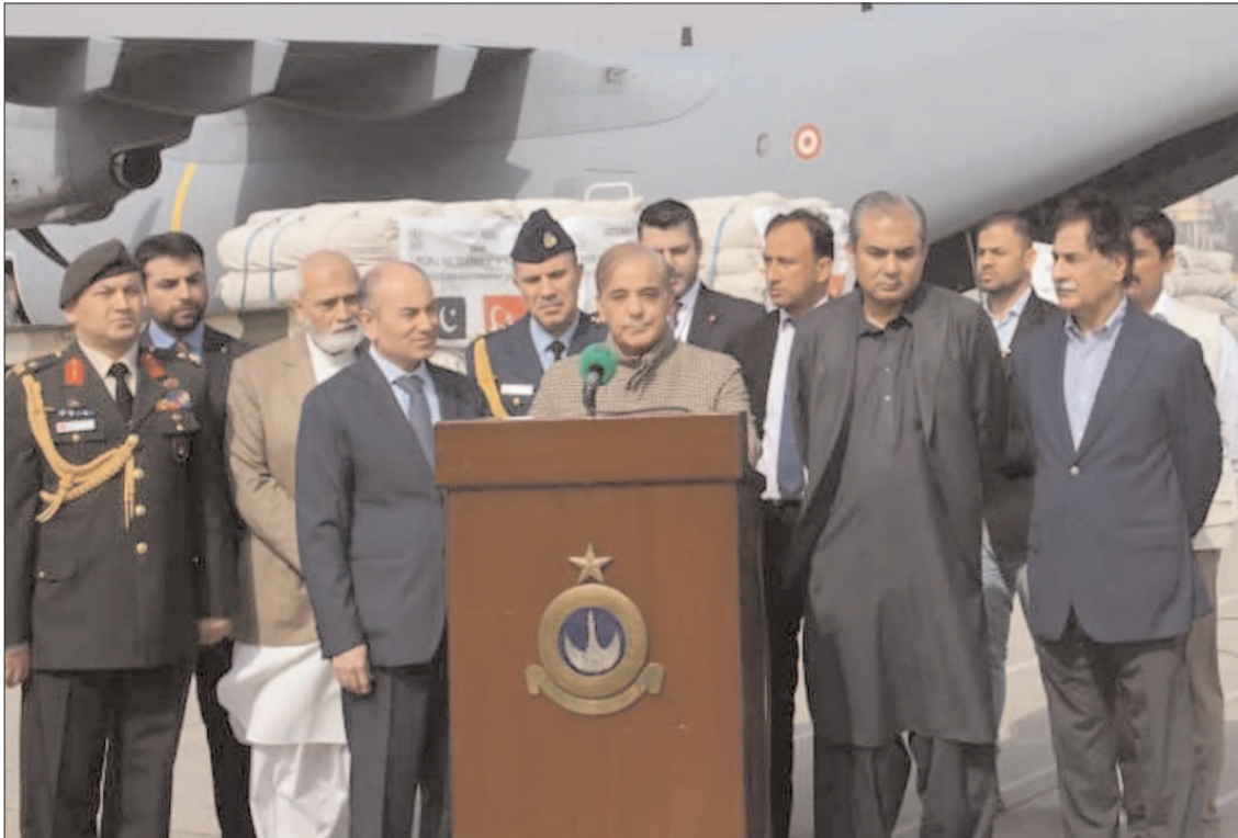
LAHORE: Prime Minister Shehbaz Sharif talking to media persons on the occasion of seeing off a plane carrying relief goods for the earthquake victims of Turkiye.