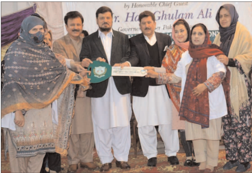
PESHAWAR: Governor KP Haji Ghulam Ali giving keys of vehicles to administration of nursing colleges during his visit to Provincial Health Services Academy.

Haji Ghulam Ali said that discussions would be held with the Federation for the release of required funds for the ongoing projects of the Department of Communications and Construction in the merged districts. He said, despite its bad financial position as the country is suffering from economic problems, the projects of public interest in the merged districts are among the main priorities to complete.