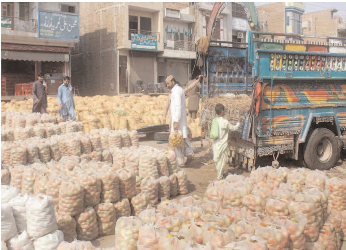
MULTAN: Labourers busy in unloading tomato bags from delivery truck at vegetable market.

The FPCCI President on behalf of the business community of Pakistan, assured full support and assistance in cash and relief items and said they stand with the people of Türkiye and Syria in this difficult time.