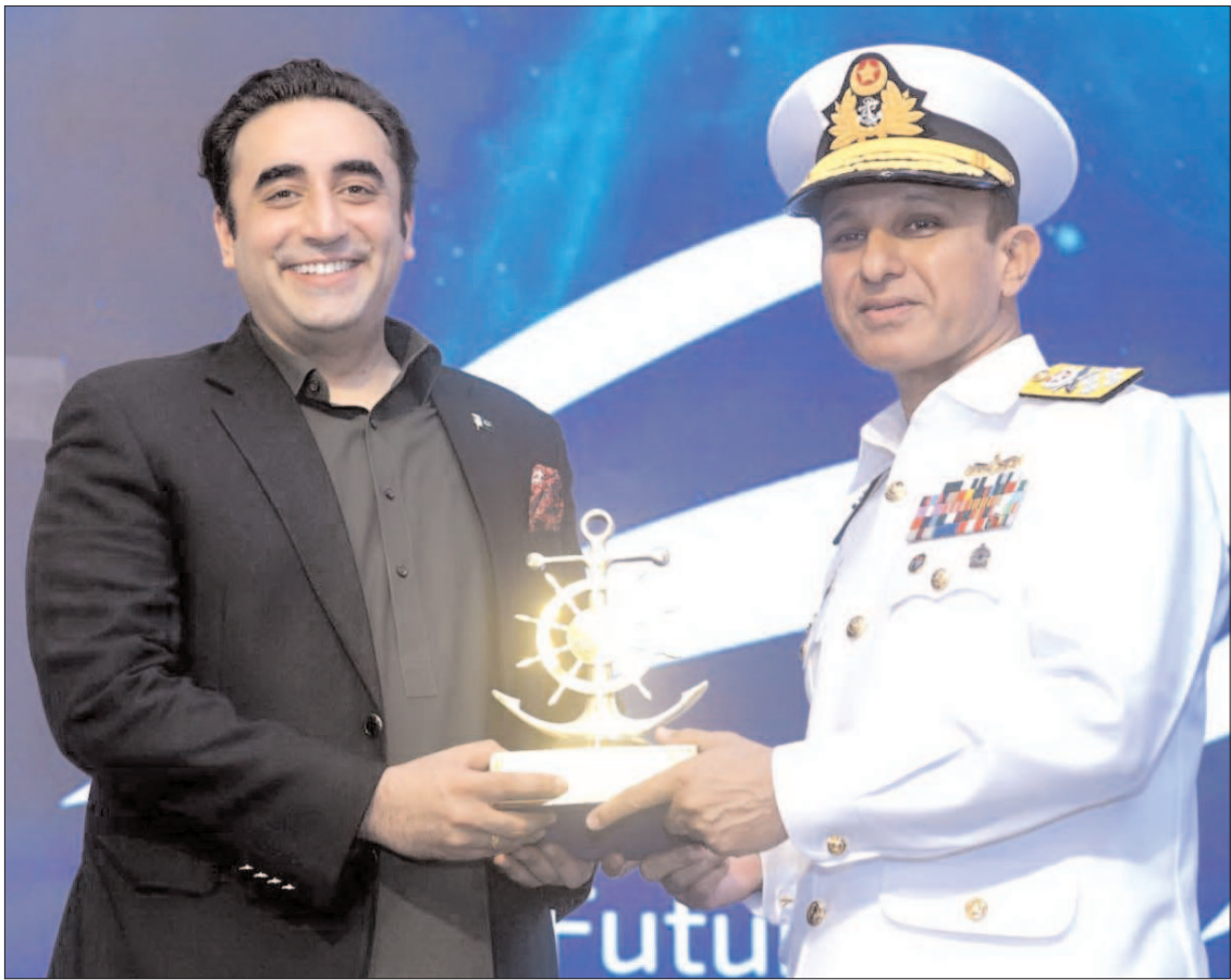
KARACHI: Federal Minister for Foreign Affairs, Bilawal Bhutto Zardari is being presented with memento during the inauguration ceremony of Pakistan International Maritime Expo and Conference (PIMEC 2023).