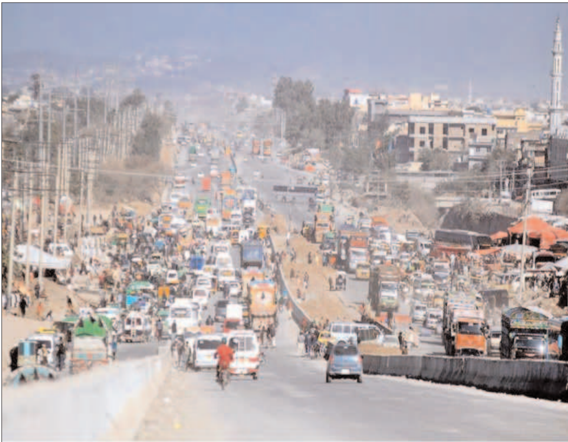
ISLAMABAD: Newly constructed flyover open for traffic at IJP road.