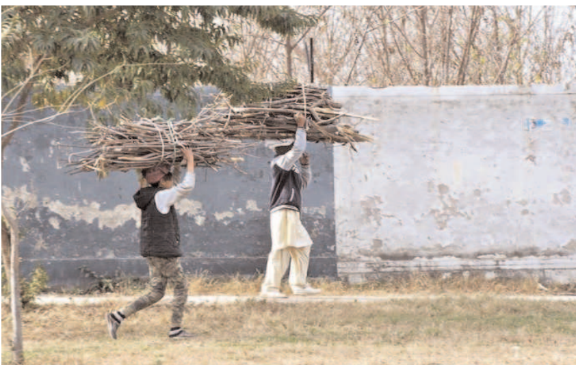
ISLAMABAD: Youngsters carrying a bundle of dry woods on his head for domestic use at Federal Capital.

He said that all the facilities were available to the patients in the Cantonment Hospital, the hospital fee was very less as compared to all the hospitals in Rawalpindi, as the Cantonment Board was giving a subsidy of Rs30 to 40 crore to the hospital from its own funds.