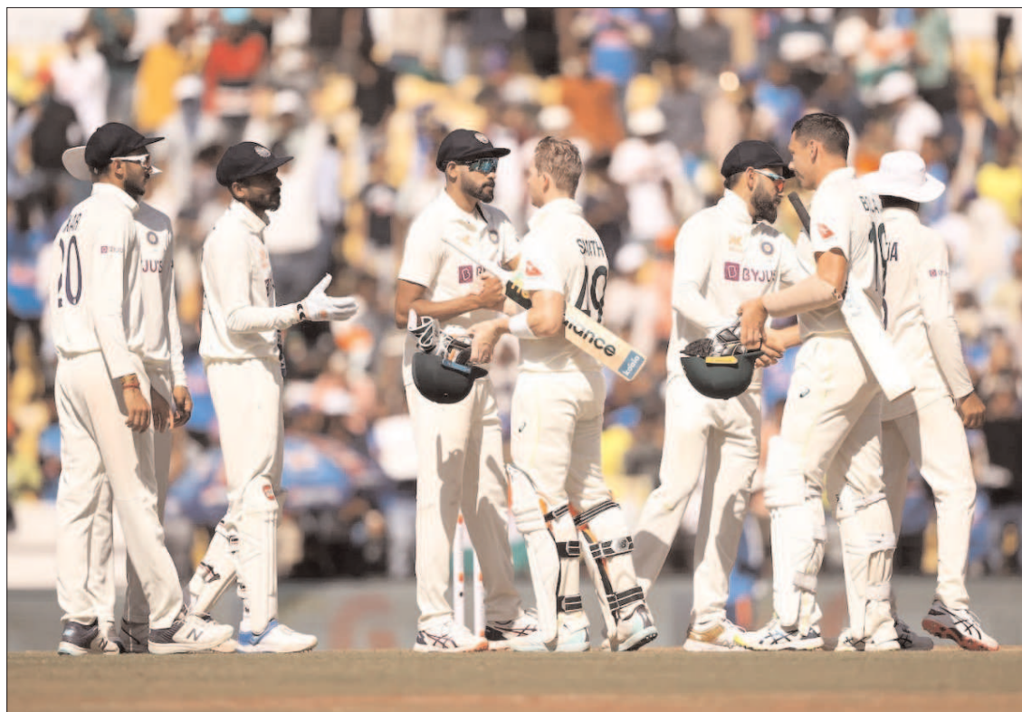
NAGPUR: The players greet each other after India's innings victory.