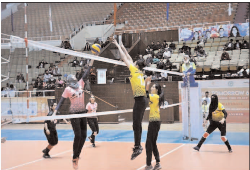
ISLAMABAD: Yellow and Pink women team in action during "Save Tomorrow 6 Volley Ball Show Match" at Liaquat Gymnasium Pakistan Sports Board.

PCB Management Committee Chairperson Najam Sethi said: "We're happy to have TikTok on board as our official Entertainment Partner for a second year running. Following the success of last year's collaboration, this year this partnership will help reach an even larger audience and engage more authentically with a very interactive and diverse online community that has backed the league from the onset, helping it become one of the most popular and sought after T20 leagues in the world." TikTok has redefined the sports and entertainment experience for fans all over the world.