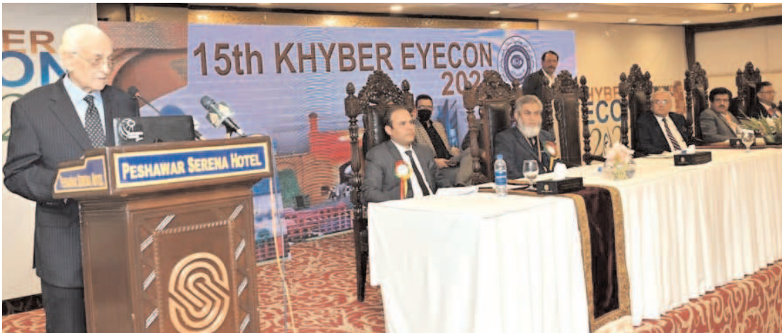
PESHAWAR: Caretaker Chief Minister Khyber Pakhtunkhwa Muhammad Azam Khan addressing inaugural session of Eye Conference organized by Ophthalmological Society of Pakistan.