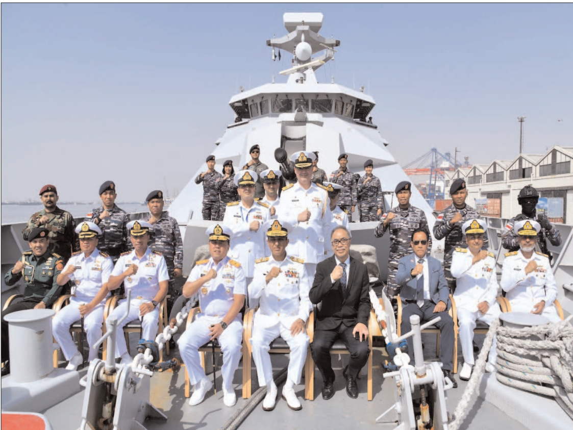
KARACHI: Chief of the Naval Staff Admiral Muhammad Amjad Khan Niazi along with Indonesian Ambassador and ship's crew onboard Indonesian Ship during ongoing Multinational Exercise Aman-2023.