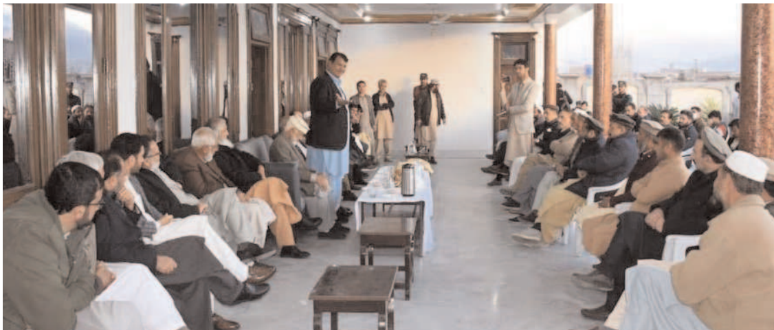
PESHAWAR: Advisor to Prime Minister Engr. Ameer Muqam addressing a public gathering.

opportunities in world markets. He said that government is also prioritizing promotion of contemporary fields of science and technology keeping in view their significance for uplift students.