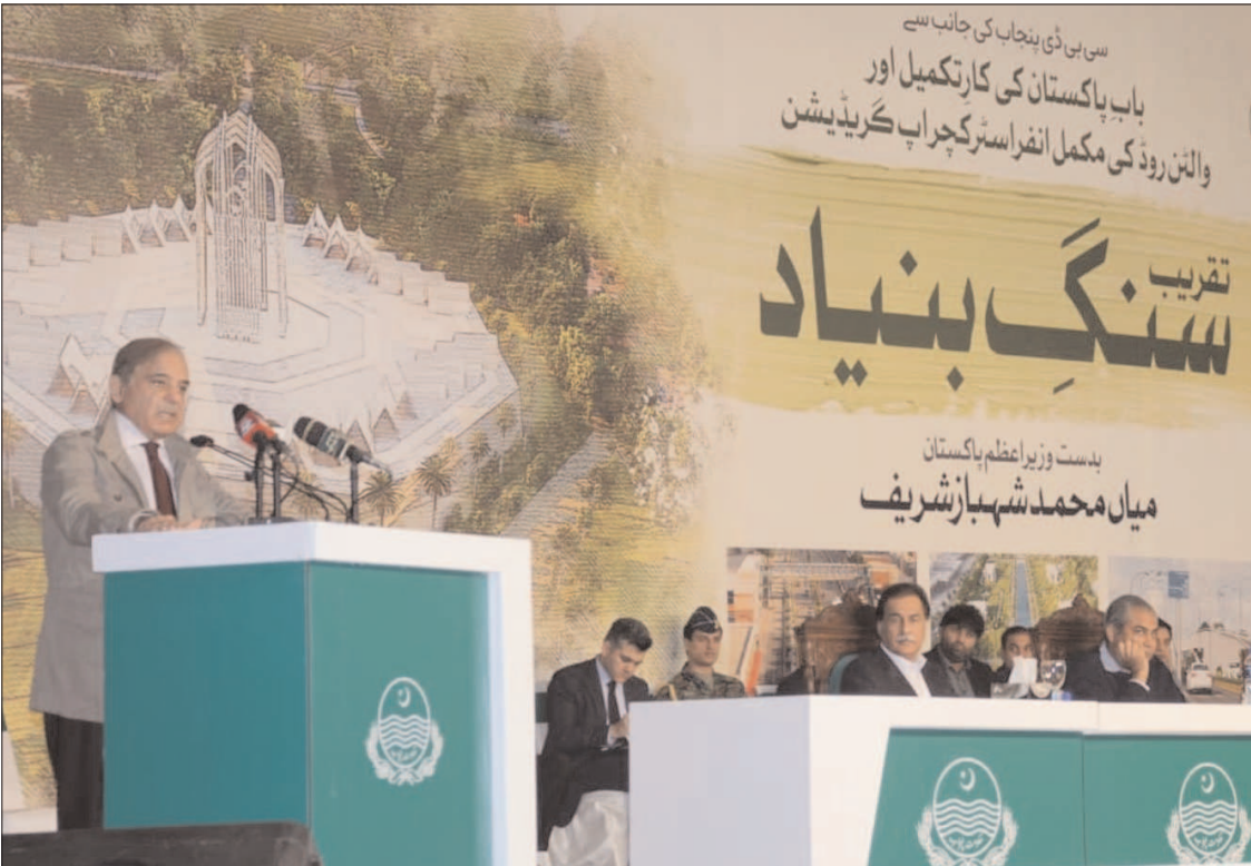
LAHORE: Prime Minister Shehbaz Sharif addressing the groundbreaking ceremony of Walton Road and inauguration of Baab-e-Pakistan.