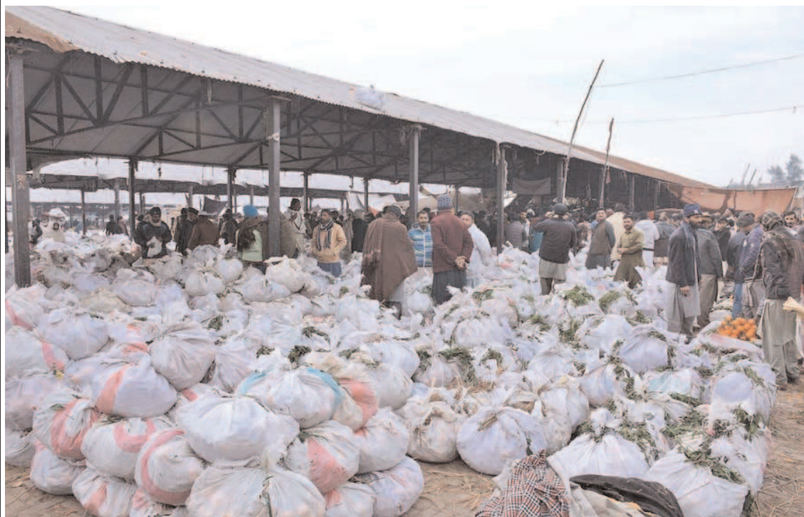
FAISALABAD: Vendors busy bidding of oranges bags at fruit market.