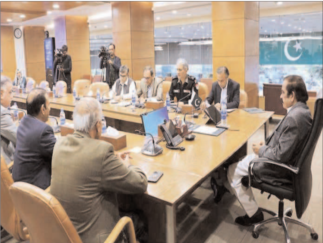
LAHORE: Federal Minister for Interior Rana Sanaullah Khan chairing a meeting regarding security of Foreign Nationals at Safe city headquarters.