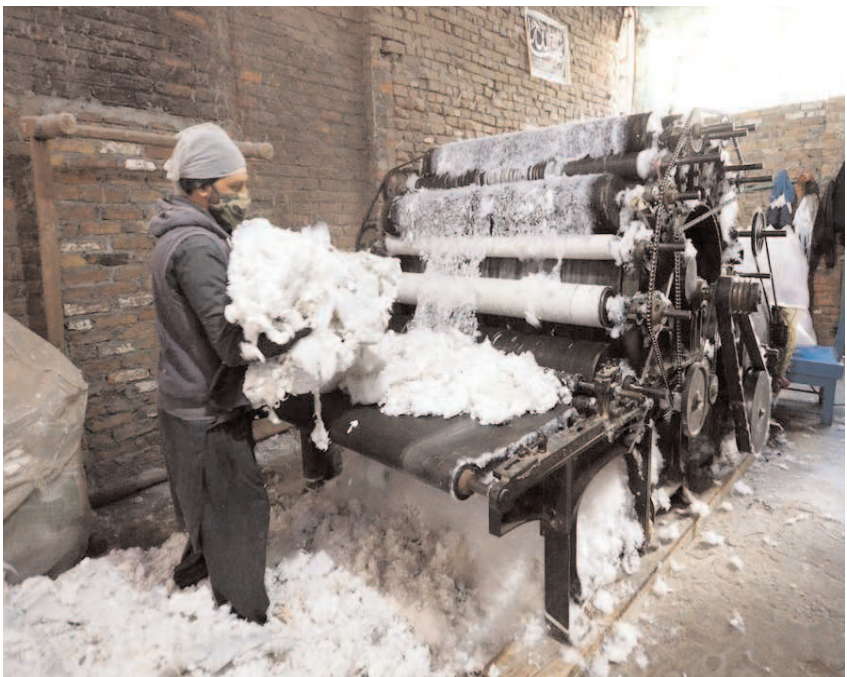
PESHAWAR: Worker preparing cotton from making quilts on his workplace.

The Charsadda City Police have vowed to continue their efforts in cracking down on illegal activities and maintaining the law and order in the city.