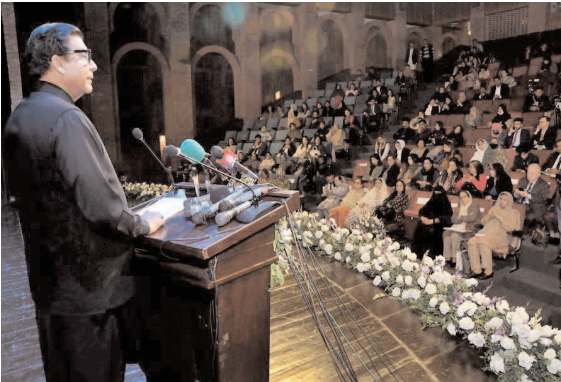
ISLAMABAD: Speaker National Assembly Raja Perviaz Ashraf, addressing at the National Convention of Women Parliamentarians for empowering women in leadership at Pakistan National Council of Arts, (PNCA).

ISLAMABAD (APP): Islamabad Electric Supply Company (IESCO) on Monday issued a power suspension programme for Tuesday for various areas of its region due to necessary maintenance and routine development work. According to IESCO Spokesman, the power supply of different feeders and grid stations would remain suspended for the period from 09:00 am to 02:00 pm, Islamabad Circle Melody, Shakraparian, Satara Market, Pandorian, Koral, Chhata Bakhtawar, Alipur, E-8 Navy, G-9 Markaz, I-8/3, Old United, G-11/2, Capital Residency, Shahpur, PHED, Dhala, Patriata, Upper Topa, Shahdara, Bhara Kaho, Bhara Kaho-II, NIH, T&T, Golf City, Tarith Feeders, Rawalpindi Cantt Circle Kalyal, Bank Road-1, Sir Syed Road, Makkah Chowk, NPF-II, Model Town, MSF, Humayun, Gulistan Fatima, Quaid-e-Azam Colony, Cantt, Sahala College, Sagri, DH Homes, Redco, Nar, Khawaja, Fazal Ahmad, New Chawah, Panjar, Mandra-II, PAECHS, Bengali, Raman, CB Khan-II Feeders, Rawalpindi City Circle Syedpur Road, T&T, Sadiqabad, Shakryal, Khanna Road, Tariq Shaheed, Asghar Mall, Dhok Hakmdad, Committee Chowk, Sarafa Bazar, Jinnah Road, Westridge, Ahsanabad, Major Masood.