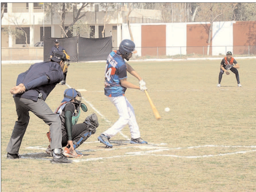
MULTAN: A view of baseball match between University of Lahore and University of Punjab teams during All Pakistan Intervarsity Baseball Championship.