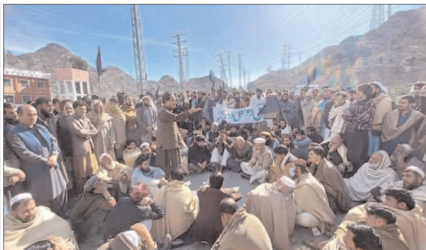
GHALANAI: Resident of Mohmand District holding a protest against electricity load shedding on Peshawar-Bajaur Highway.