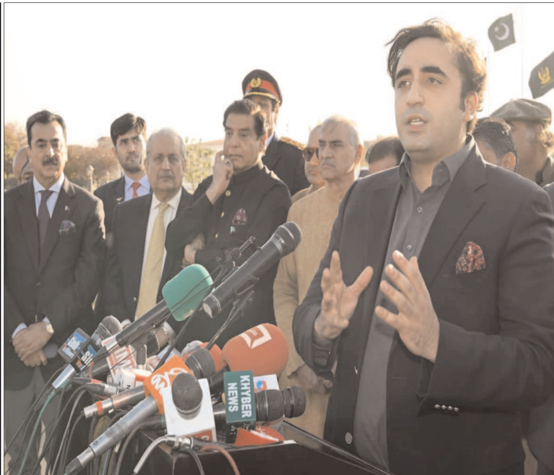
ISLAMABAD: Chairman Pakistan Peoples Party, Foreign Minister Bilawal Bhutto Zardari talking to media persons.

"If everybody performs his own duty, country's system will work in a better way." The Supreme Court was apprised of trial court order wherein lawyers' strike was mentioned thrice.