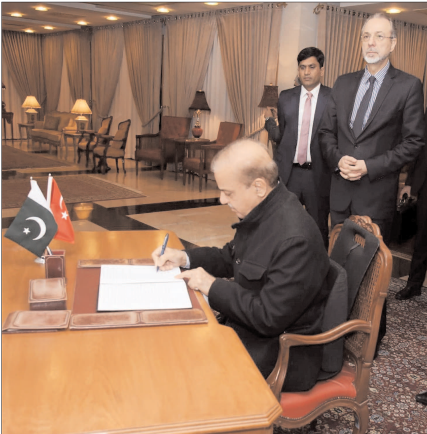
ISLAMABAD: Prime Minister Shehbaz Sharif recording his remarks in condolence book at Embassy of Turkiye.