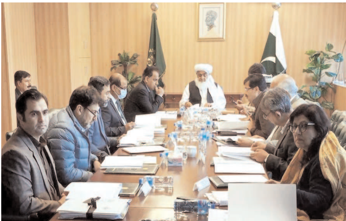
ISLAMABAD: Maulana Abdul Wasay, Federal Minister for Housing and Works chairing a meeting of Board of Directors of Pakistan Housing Authority Foundation (PHAF).

The other objectives include the promotion of renewable raw materials and development of analytical methodologies to reverse the toxic effects of such elements on human health and environment. It is the safest option for the prevention of chemical accidents, including releases, explosions, and fires.