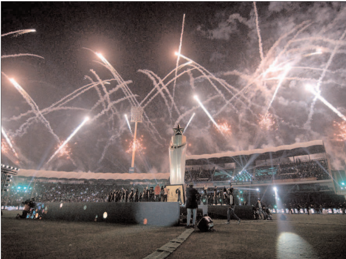
MULTAN: February 13- A beautiful view of fireworks during the opening ceremony of the Pakistan Super League season 8 (PSL 8) at Multan Cricket Stadium.