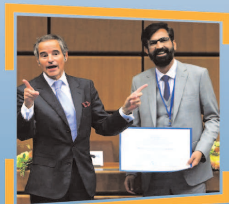
Young PAEC Agriculture Scientist Awardee with DG IAEA