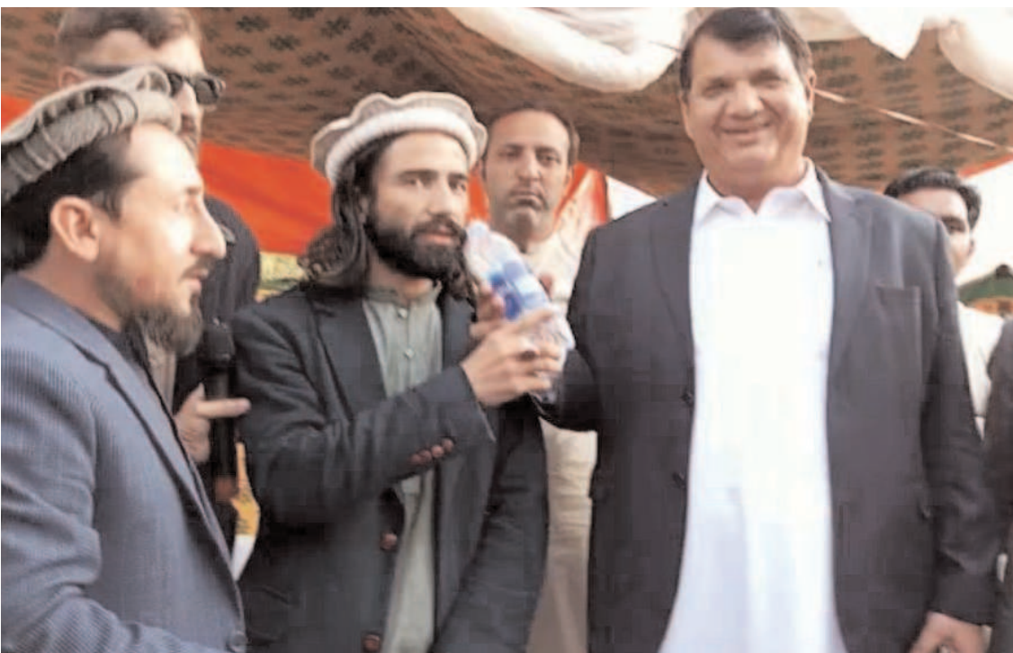
ISLAMABAD: On the assurance of Advisor to the Prime Minister on National Heritage and Culture Division, Engr. Amir Muqam, Chitral Tahafuz movement ended its 30-day sit-in & hunger strike camp.

It was worth mentioned here that earlier Federal Interior Minister Rana Sanaullah said that after completing the inquiry against Tarin, FIA had sought permission to arrest Tarin and the government has given permission to arrest him. On the other hand, Tehreek-e-Insaf leader (PTI) leaders are reacting strongly to the filing of a sedition case against Shaukat Tarin.