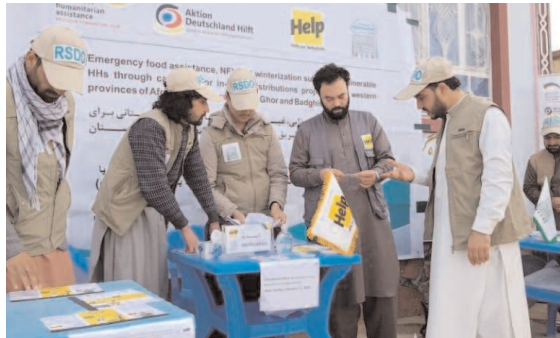
The organization provided cash assistance to 110 families in Moqar Badghis of the district.