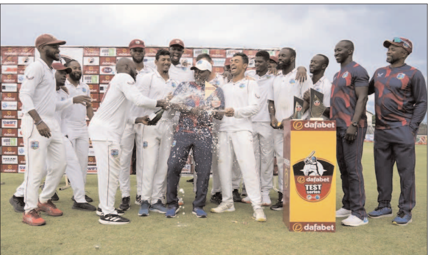
BULAWAYO: West Indies players celebrate after winning the trophy at the end of the second Test cricket match between Zimbabwe and West Indies.