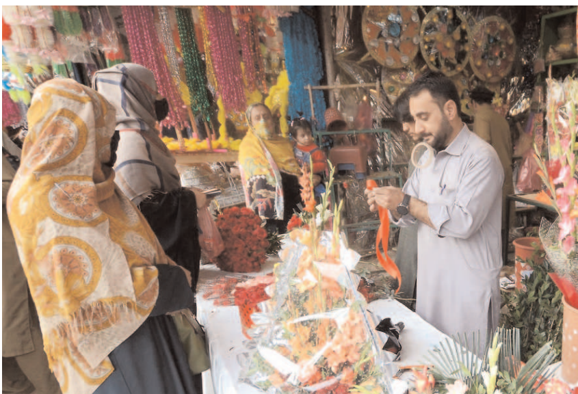
PESHAWAR: Women buying flower bouquet from a vendor at Sadar Bazaar.

The maximum and minimum temperatures recorded in centigrade at different stations of the Khyber Pakhtunkhwa were Peshawar City 23/05, Chitral 10/01, Timergara 18/04, Dir 16/-04, Mirkhani 13/-01, Kalam 09/-13, Drosh 11/-01, Saidu Sharif 18/-01, Pattan 16/09, Malam Jabba 07/-05.