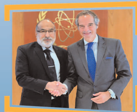
Chairman PAEC with DG IAEA