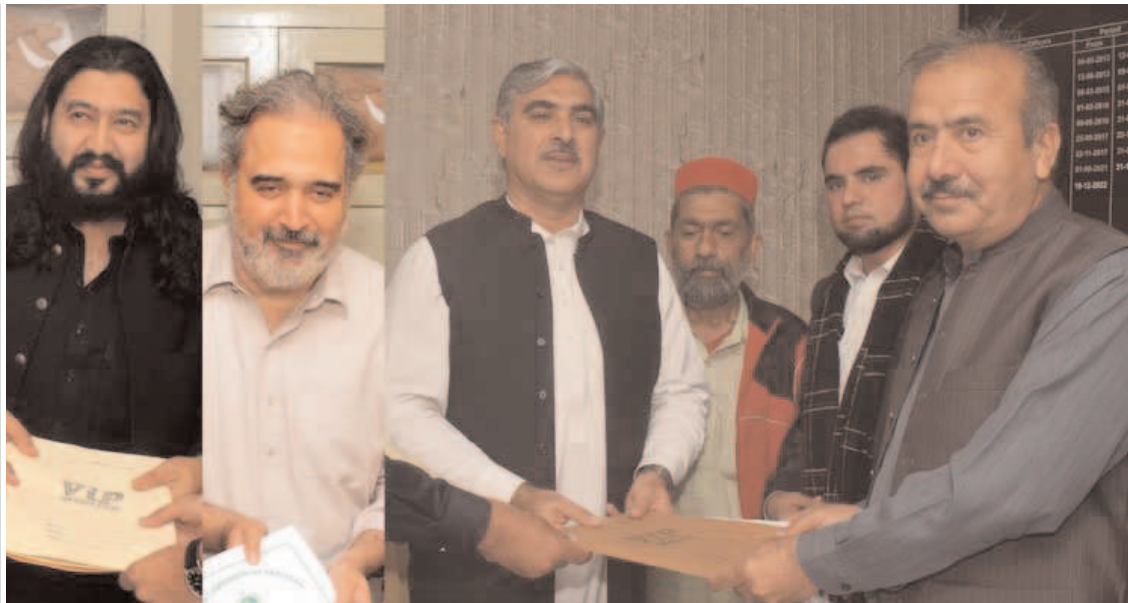
PESHAWAR: Candidates submitting nomination papers with Returning Officer for NA seat at District Election Commissioner office.

ing of local governments not only during the current and next financial years. Local bodies were established under Article 140-A of the Constitution, so their suspension amounted to suspension of the constitutional provision. It is beyond the mind that in any democracy around the world, elected institutions at one tier were suspended to ensure free and fair elections for the other, the petition added. The petitioner requested that on acceptance of this Writ Petition the Impugned Notification dated 03-02-2023 issued by the respondents may kindly be set aside. The petitioner may be allowed to put forward any other argument/document at the time of hearing of this writ petition. The divisional of PHC comprising of Justice Ishtiaq Ibrahim and Justice Syed Arshad Ali ordered ECP's lawyer Kamran Sadeeq to submit reply in this regard while adjourned further hearing.