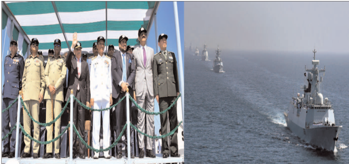
KARACHI: Prime Minister Muhammad Shehbaz Sharif witnessing Pak Navy's Multinational AMAN Exercise 2023 in the Arabian Sea.

The naval chief also highlighted that successful conduct of PIMEC 23 held in tandem with Multinational Exercise Aman-23 was a manifestation of Pakistan Navy's resolve to promote maritime potential of Pakistan. During the exhibition, around 20 MoUs, one joint venture and one sale/purchase agreement of export of iron ore were signed. During the Multinational Maritime Exercise AMAN 2023, 50 countries participated with their Naval warships, aircraft, Special Operation Forces and a large number of observers.