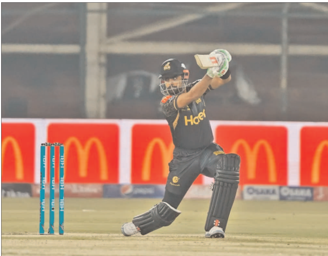
KARACHI: Babar Azam drives through the covers, Karachi Kings vs Peshawar Zalmi, PSL.