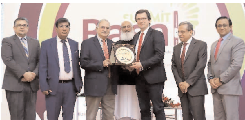
KARACHI: Sanofi Pakistan and Diabetic Association of Pakistan organized Basal Summit 2023.

Uniqlo operator Fast Retailing firmed 1.04 percent to 81,540 yen.