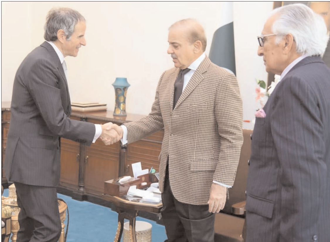
ISLAMABAD: Director General of International Atomic Energy Agency Rafael Mariano Grossi called on Prime Minister Shehbaz Sharif.

In a statement, she said that party's Senior Vice President and Chief Organizer Maryam Nawaz will preside over the meeting. The meeting would review the organizational structure of the youth wing and the social media section, she added. She said that problems faced by the youth would be discussed and suggestions from them will be taken. Officials of Youth Wings will give suggestions for the preparation of 'Youth Charter', the minister said adding that consultation on youth policy would also be in the meeting. She said that Maryam Nawaz will throw light on the PML-N priorities for youth development policy.