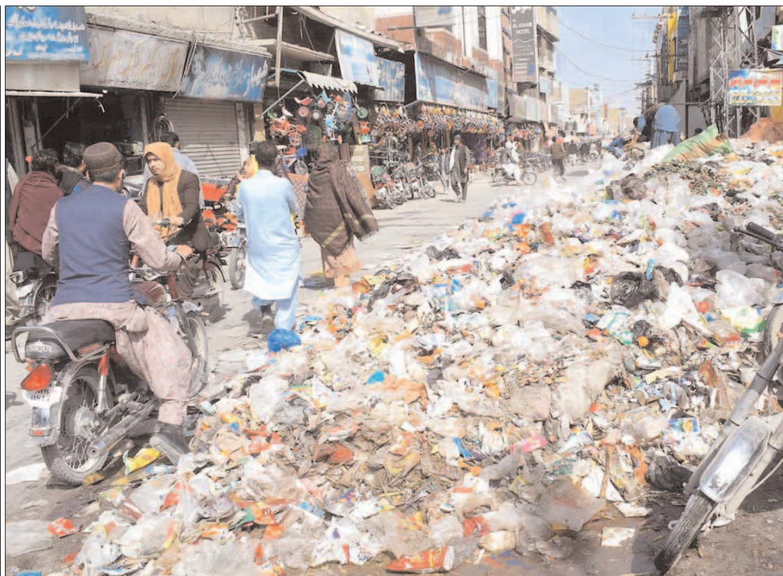
QUETTA: A view of garbage spread alongside Gordai Singh Road, needs attention of authorities concerned.

Talking on developmental initiatives, the ADC said that work on 14 mega projects including expansion in LMH Hospital, gigantic Kohat Sports Complex, establishment of KIMS and Women Business Center and free training to 600 IT related students on AMAZON to make young self-reliant under way at the cost of more than 100 million rupees.