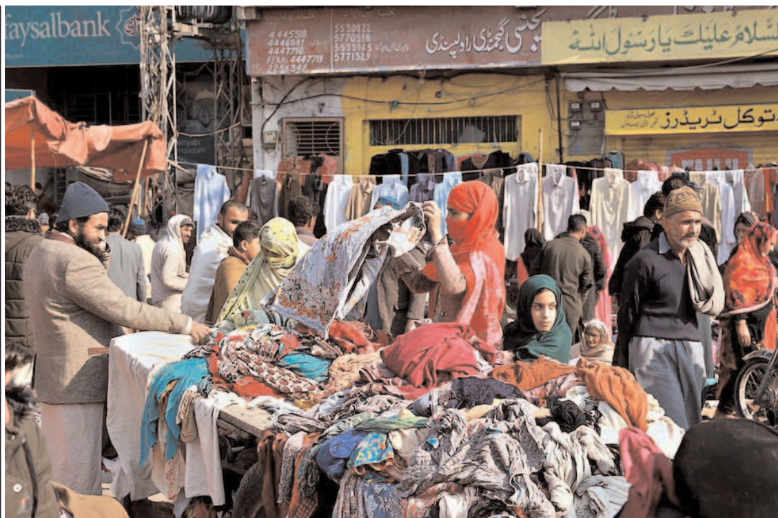
RAWALPINDI: People purchasing second hand clothes from vendor at Raja Bazaar.

The chamber president asked for prioritizing revival of industries, trade, businesses and export to bring economic stability and get rid of Pakistan from depending on foreign aid and make it an economical 'self-reliant' country.