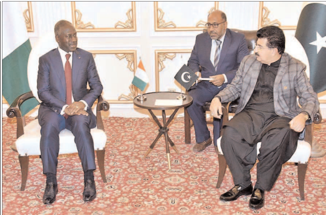
ISLAMABAD: Chairman Senate, Muhammad Sadiq Sanjrani exchanging views with Mr. Adama Bictogo, Speaker of the National Assembly of Ivory Coast.

meeting was held between the caretaker minister and the Ethiopian ambassador.