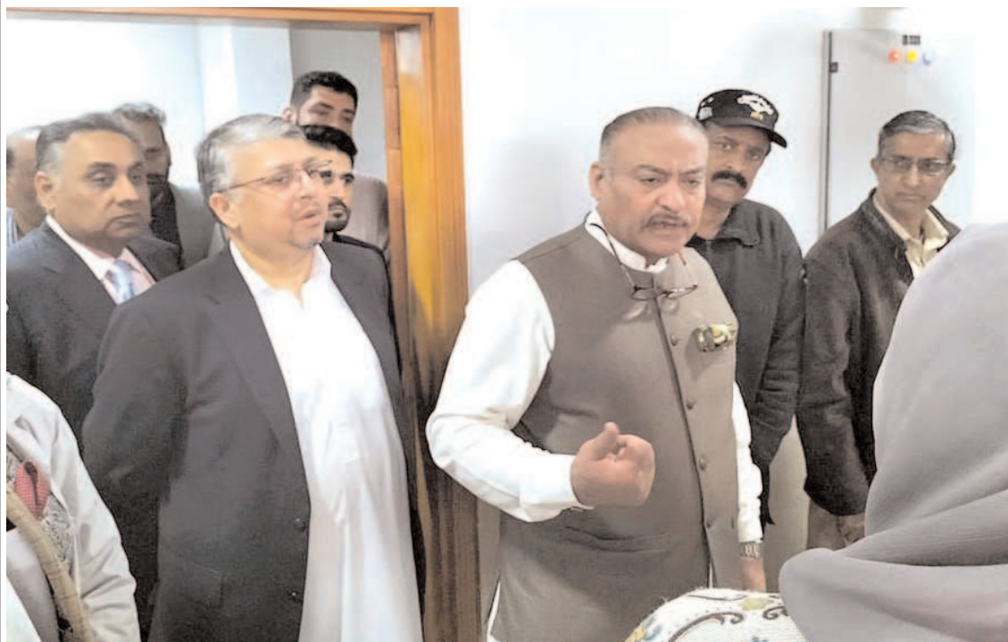
ISLAMABAD: Federal minister of national health services Abdul Qadir Patel visited at new model state of art BHU Golra Sharif in Federal Capital.