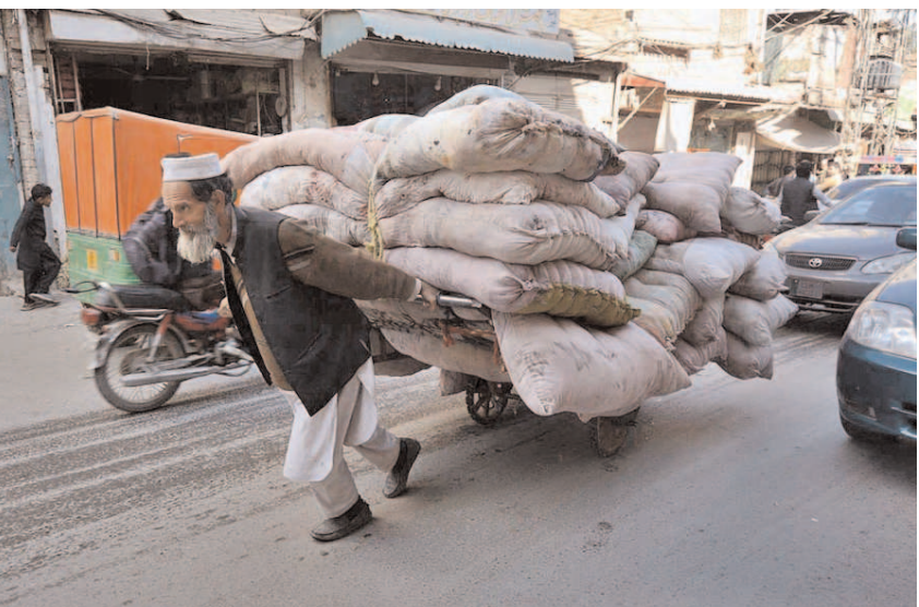
PESHAWAR: An old man struggling to push a handcart loaded with blankets in Dabgari area.