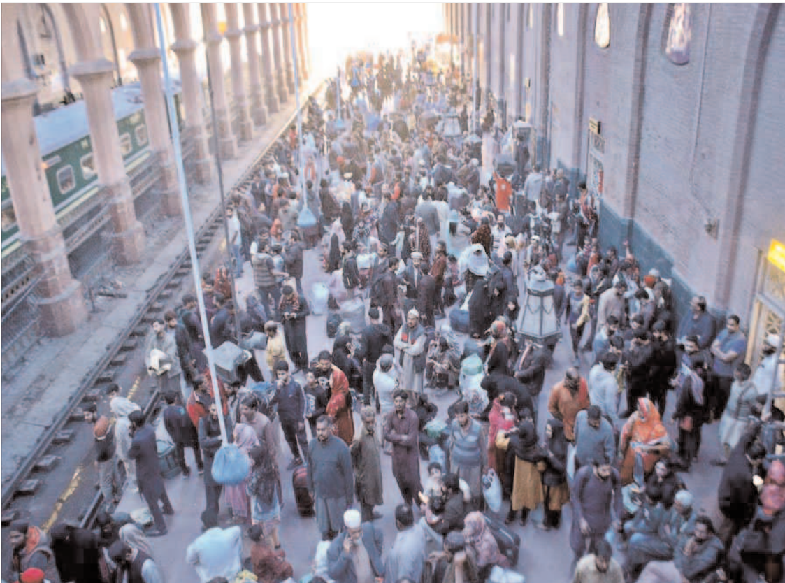
LAHORE: Passengers are waiting at the railway station due to the late arrival of the train.