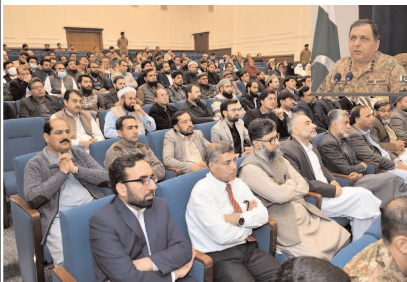
PESHAWAR: Faculty members of leading universities of Peshawar visited Corps Headquarters Peshawar and had an interactive session with Corps Commander on Thursday. Upon arrival, faculty members laid a floral wreath at the Yadgar-e-Shuhada monument and offered Fatiha.