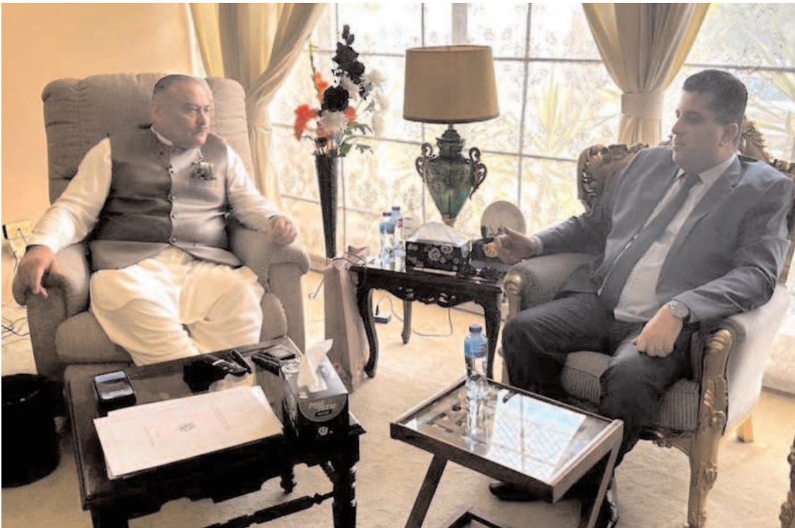
ISLAMABAD: Federal Minister for National Health Services Abdulqadir Patel called on Ramez Alraee, Ambassador of Syrian Arab Republic.

ISLAMABAD (APP): The three-day "Pakistan Mother Languages Literature Festival" will be held at the Pakistan National Council of the Arts (PNCA) from February 17 to 19. The event will have parallel sessions on all three days. The festival would be organized by Indus Cultural Forum (ICF) in collaboration with PNCA. Adviser to the Prime Minister for Political, Public Affairs, National Heritage and Culture Engr Amir Muqam will inaugurate the festival while well-known scholars and language experts would participate in the festival.