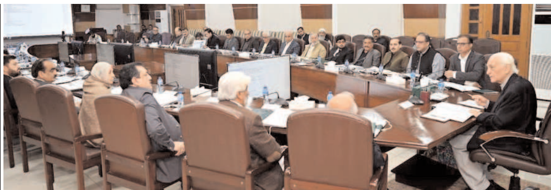
PESHAWAR: Caretaker Chief Minister Khyber Pakhtunkhwa Muhammad Azam Khan chairing 1st meeting of Provincial Caretaker Cabinet.

Management of Hamza Foundation has thanked VC, Director, entire teaching staff and Students of the INU Peshawar for extending their sincere help and support for saving the precious lives of the ailing humanity of KPK.