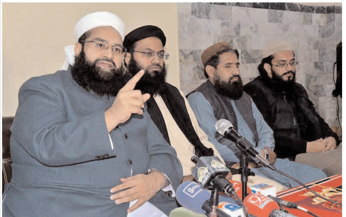
ISLAMABAD: Special Assistant to the Prime Minister on Religious Harmony Maulana Tahir Mahmood Ashrafi addressing a press conference at Jamia Masjid Maaz Bin Jabal.

The three-day event spanned across climate action policy simulation, youth activity, expert panel discussions, conference and exhibition, followed by the launch of Climate Action Plan and MoU signing.