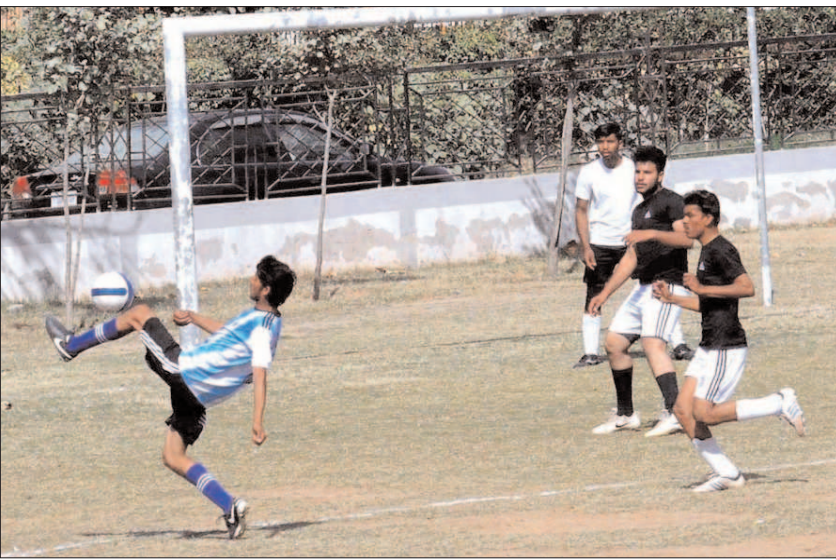
SARGODHA: A view of football match played between Punjab College Joharabad and Superior College Joharabad during Inter Collegiate Football Tournament .