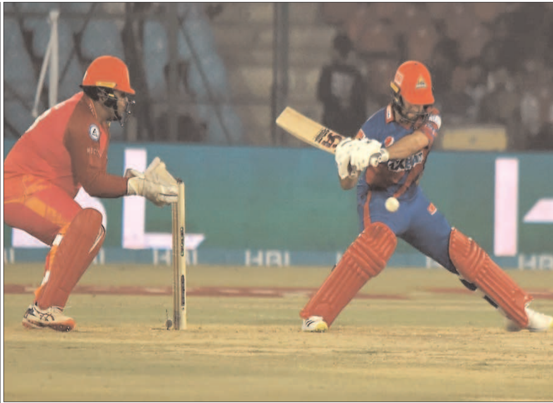
KARACHI: A view of PSL match between Karachi king and Islamabad United.

Southee, leading his country at home for the first time, asked England to bat with the hope of exploiting the pink ball's swing on a green-tinged pitch that had been covered for days because of Cyclone Gabrielle.