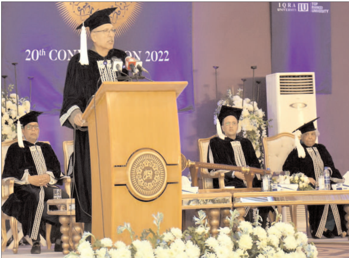
KARACHI: President Dr. Arif Alvi addressing the 20th convocation ceremony of Iqra University.