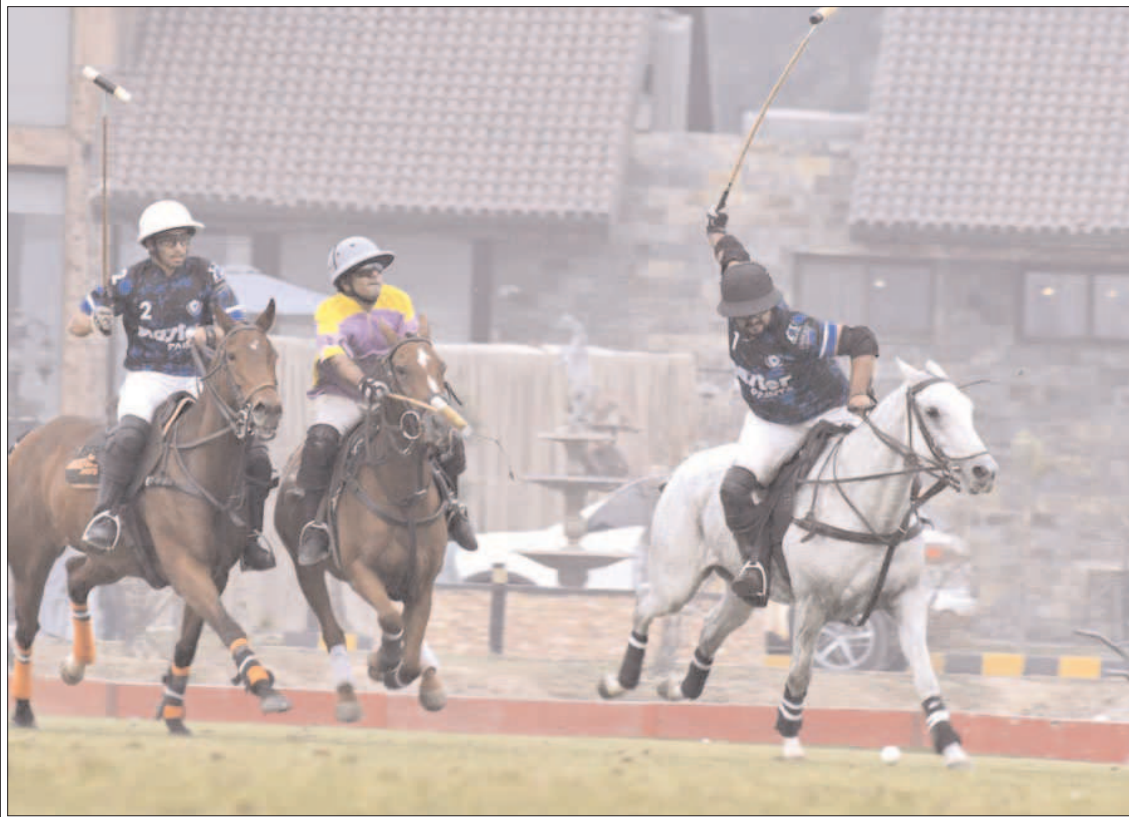
LAHORE: A view of match between Master Paints vs Ds Polo during AR Developers Jinnah Gold Cup 2023.