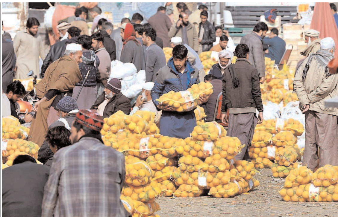
ISLAMABAD: Fruit dealers busy in purchasing seasonal fruit oranges from Islamabad Fruit and Vegetable Market.

He warned against taking aggressive steps if the government didn’t shun anti-business policies forthwith, saying that any responsibility will be rested upon the present government for commotion and unrest in the country.