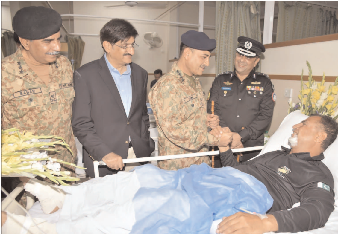
KARACHI: General Syed Asim Munir, Chief of Army Staff and Syed Murad Ali Shah, Chief Minister Sindh enquiring after the health of Police and Rangers officials, who got injured in Police Office terrorist attack.