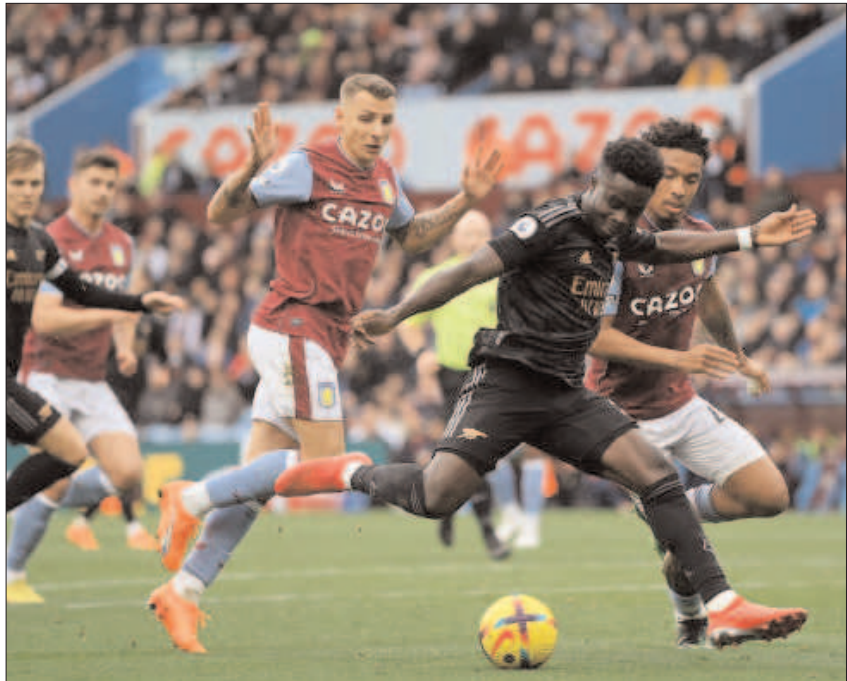
BIRMINGHAM: Bukayo Saka of Arsenal shoots past Boubacar Kamara of Aston Villa during the Premier League match between Aston Villa and Arsenal FC.

"The PCB remains committed to providing complete safety and security to all the participants and, as always, will continue to work very closely with the security experts and law enforcing agencies to ensure the players and officials are comfortable and being well looked after so that they can enjoy their stay in Pakistan and continue to entertain the fans and followers with their cricketing skills and talent."