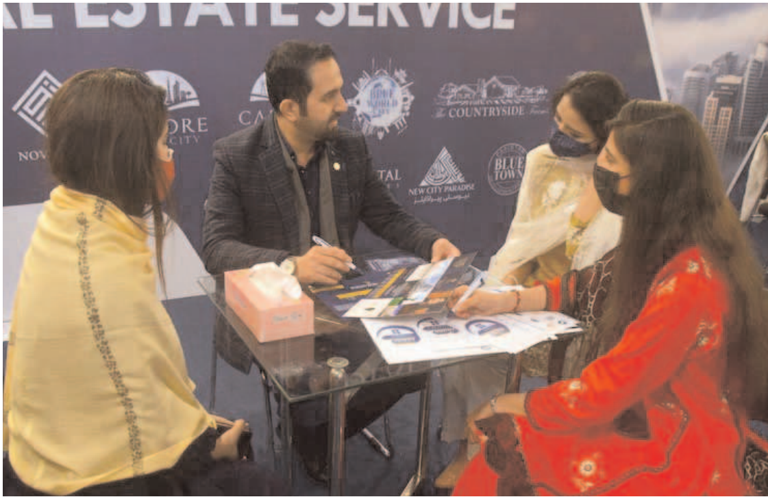
PESHAWAR: Women being briefed at stall during Property Expo organized by Pakistan Association of Exhibition.