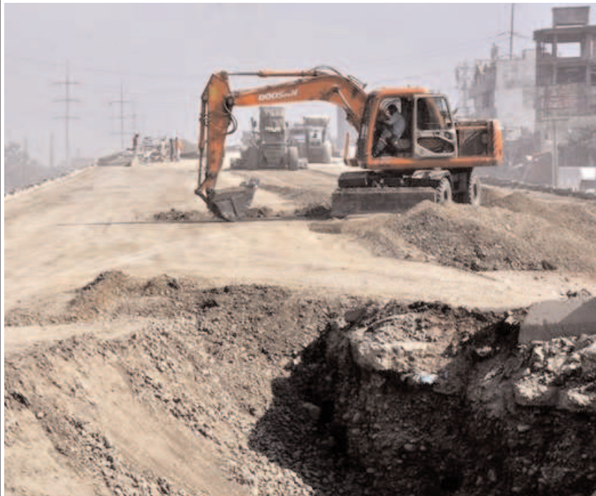
ISLAMABAD: A view of construction work on IJP Road during development work in the city.

Cash prizes, shields and certificates of appreciation were distributed among the participants who won positions in the competitions. More than 300 calligraphers from all over the country participated in the competitions. A large number of people from the cities participated in the exhibition.