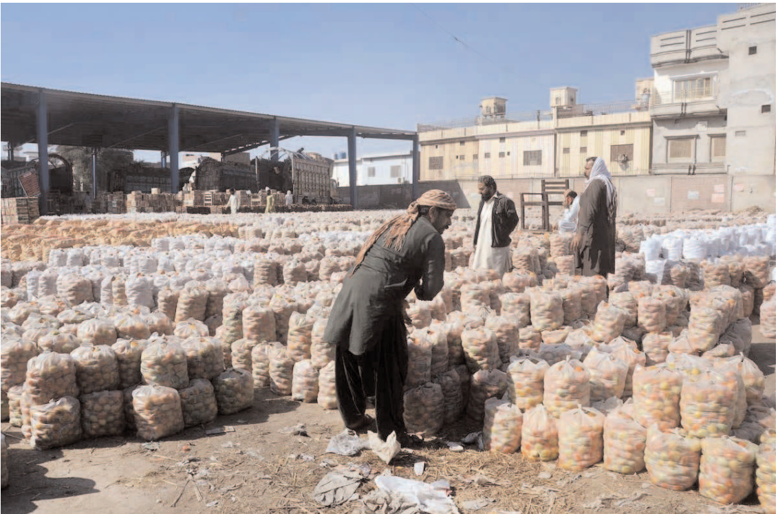
MULTAN: Traders displaying bags of tomatoes for trading at vegetable market.