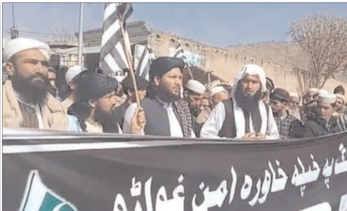
ORAKZAI: Activists of JUI holding a rally for peace in their area.