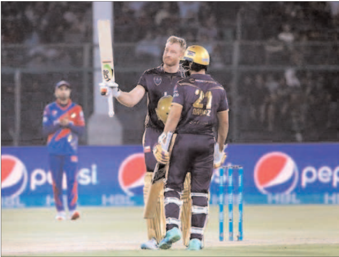
KARACHI: Quetta Gladiators' Martin Guptill celebrates after scoring century (100 runs) during the Pakistan Super League (PSL) T20 cricket match between Karachi Kings and Quetta Gladiators.