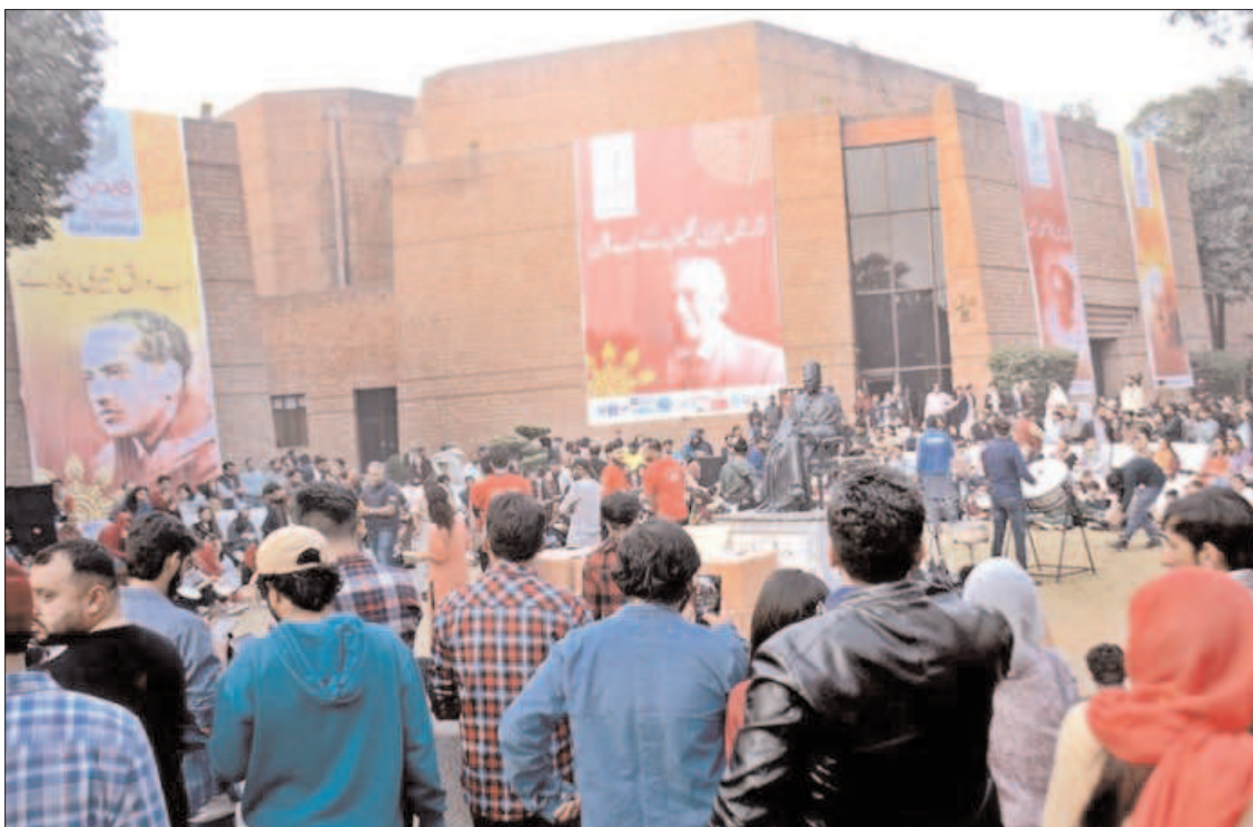
LAHORE: A large number of people attending the Faiz Int'l Festival 2023 at Alhambra.