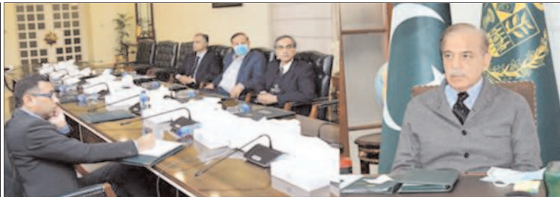
LAHORE: A delegation of Tents Manufacturers Association called on Prime Minister Shehbaz Sharif.

The report said that Samjhauta Express bombing was a false flag operation aimed at maligning Pakistan. It pointed out that the Indian secret agencies had staged several Samjhauta Express blasts like false flag operations to defame Pakistan. It added that the world must realize that the RSS-backed fascist BJP regime is a threat to global peace.