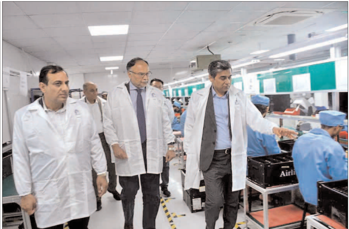
LAHORE: Minister for Planning and Development, Prof Ahsan Iqbal visits in different departments of Air Link Communication at Quaid-e-Azam Industrial Estate Kot Lakhpat in the city