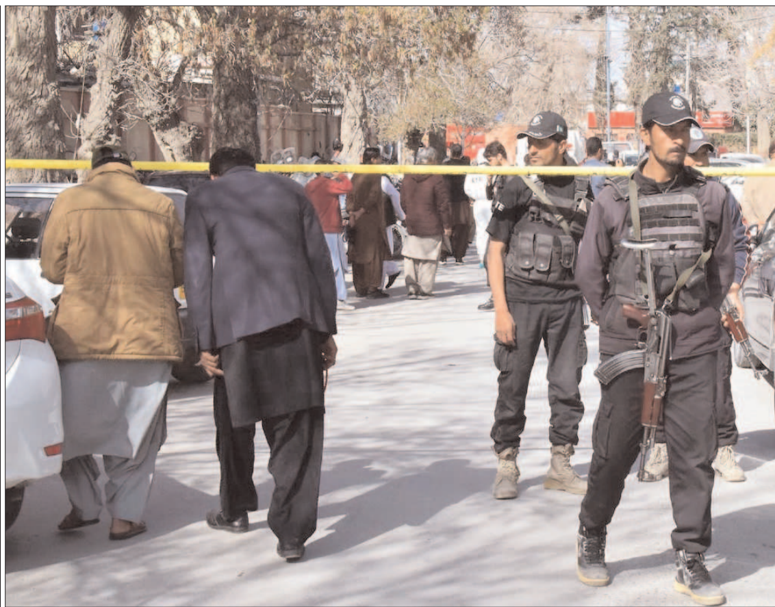
QUETTA: Security personnel standing alert near firing site outside Sessions Court.