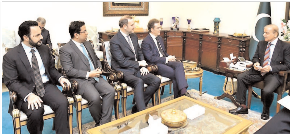
ISLAMABAD: A delegation of Rothschild and Co. called on Prime Minister Shehbaz Sharif.

The President stated that he had initiated a serious consultation process with the Election Commission of Pakistan (ECP) under Section 57 (1) of the Elections Act, 2017 to announce the date for the general elections of the aforementioned Assemblies, however, the ECP replied that the Commission could not participate in a meeting on the subject matter with the Office of the President. He said that in the exercise of powers conferred upon him under Section 57 (1) of the Elections Act, 2017, he was announcing the date of 9th April 2023 (Sunday) for holding of general elections of the Provincial Assemblies of Punjab and Khyber Pakhtunkhwa.