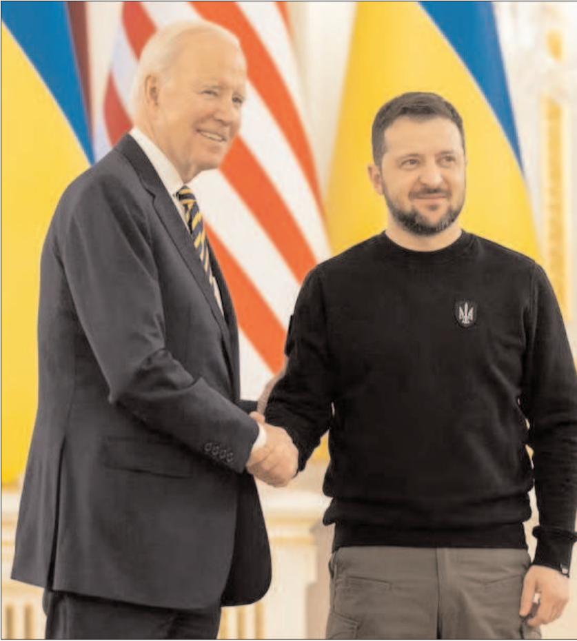
KYIV: Joe Biden shaking hands before a meeting, amid Russia's attack on Ukraine.