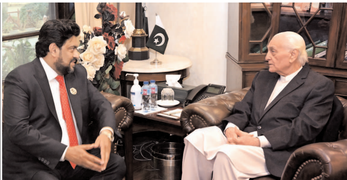
PESHAWAR: Governor Sindh Kamran Tessori meeting Caretaker Chief Minister Khyber Pakhtunkhwa Muhammad Azam Khan.

The maximum and minimum temperatures recorded in centigrade at different stations of KP were Peshawar City 26/13, Chitral 17/05, Timergara 22/08, Dir 20/04, Mirkhani 21/04, Kalam 14/03, Drosh 18/03, Saidu Sharif 21/09, Pattan 20/13, Malam Jabba 11/03, Takht Bhai 25/13, Kakul 21/10, Balakot 23/13, Parachinar 18/03, Bannu 30/10, Cherat 19/09, D.I. Khan 29/14.