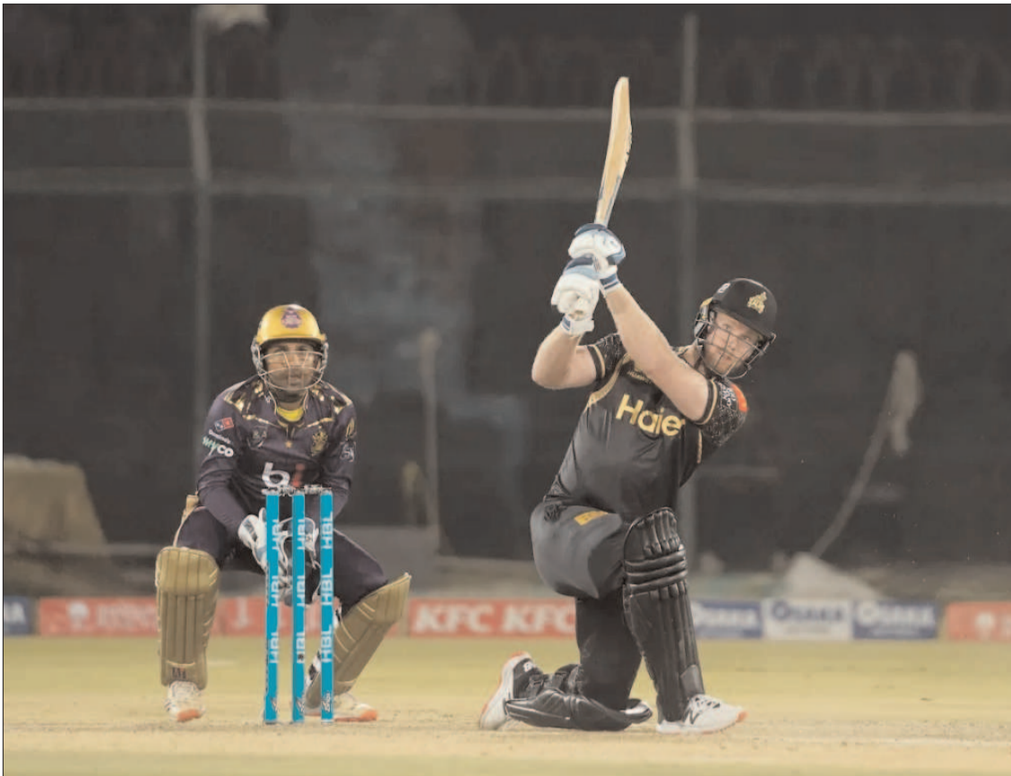
KARACHI: James Neesham's 23-ball 37 got Zalmi closer to the line, Peshawar Zalmi vs Quetta Gladiators, PSL.