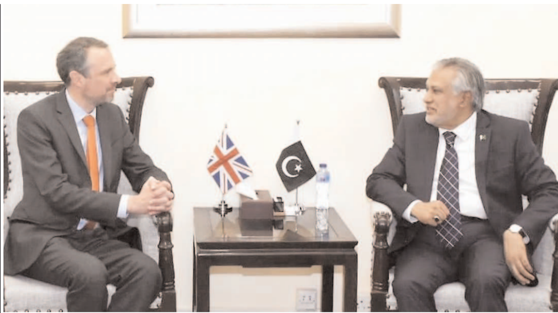
ISLAMABAD: British Acting High Commissioner Andrew Dalglish meeting with Federal Minister for Finance and Revenue Senator Mohammad Ishaq Dar at Finance Division.

The price of gold in the international market increased by $1 to $1,844 from US$1,843, the association reported.