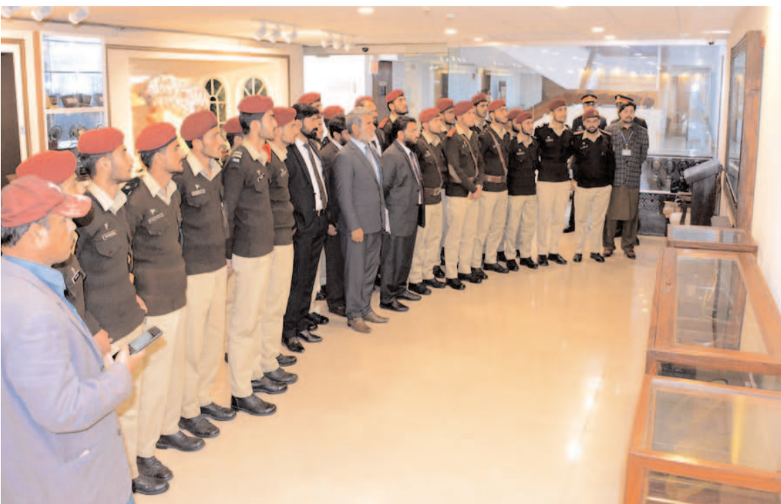
ISLAMABAD: Students from Cadet College Mastung (Balochistan), visiting Senate Museum at Parliament House.