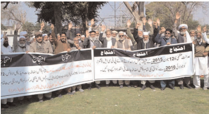
PESHAWAR: Activates of All Pakistan PTCL Pension Trust hold protest in favour of their demands.

nationally and can volunteer upon capacity building.