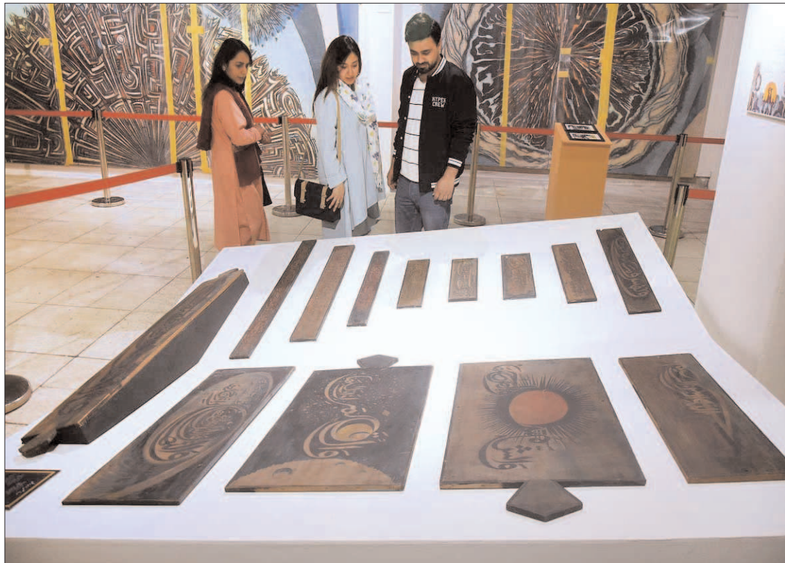
LAHORE: Visitors viewing the displayed stuff during exhibition related to Sufi Tabassum and Faiz Ahmed Faiz at Lahore Museum.