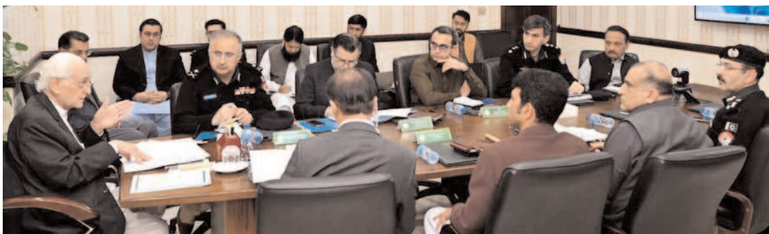
PESHAWAR: Caretaker Chief Minister Khyber Pakhtunkhwa Muhammad Azam Khan chairing a meeting to review law and order situation.

More than 250 journalists will be trained in these trainings. Pakistan Information Center has conducted about twenty two (22) training workshops since its inception, in which more than 850 journalists have been trained.