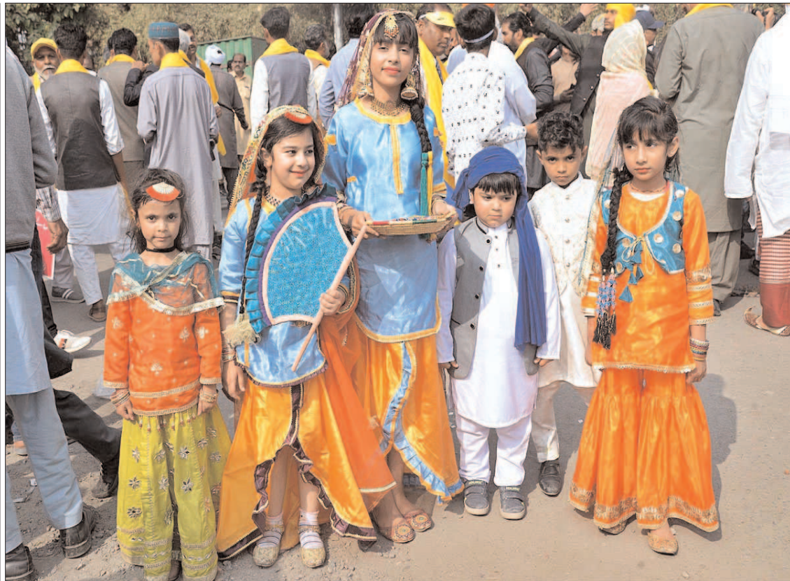
LAHORE: Children participates in a ceremony outside the Press Club on the occasion of Punjabi Day.