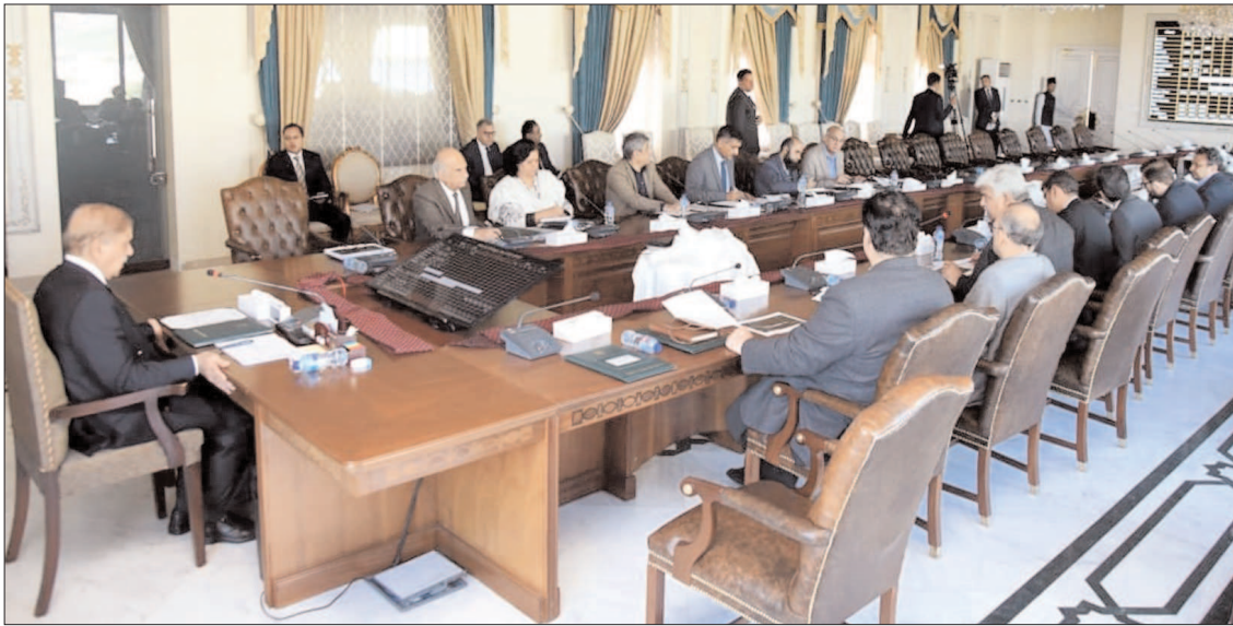
ISLAMABAD: Prime Minister Shehbaz Sharif chairing a meeting on Power Load Management.