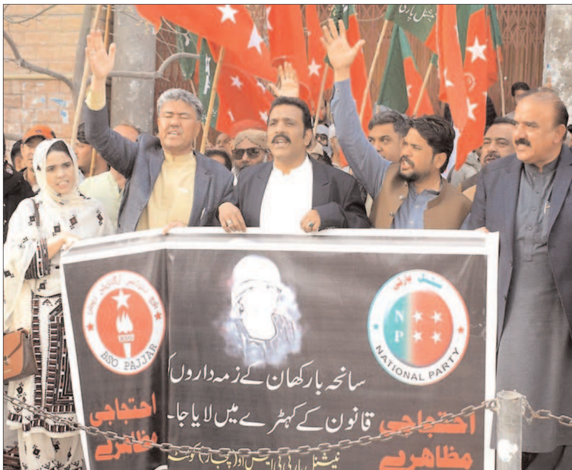
QUETTA: Activists of National Party holding a protest against killing of mother and daughter in Kohlu.