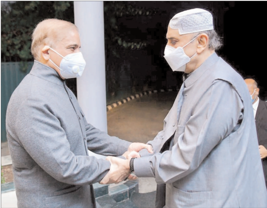
ISLAMABAD: Prime Minister Shehbaz Sharif receiving former president, Asif Ali Zardari in PM's House.