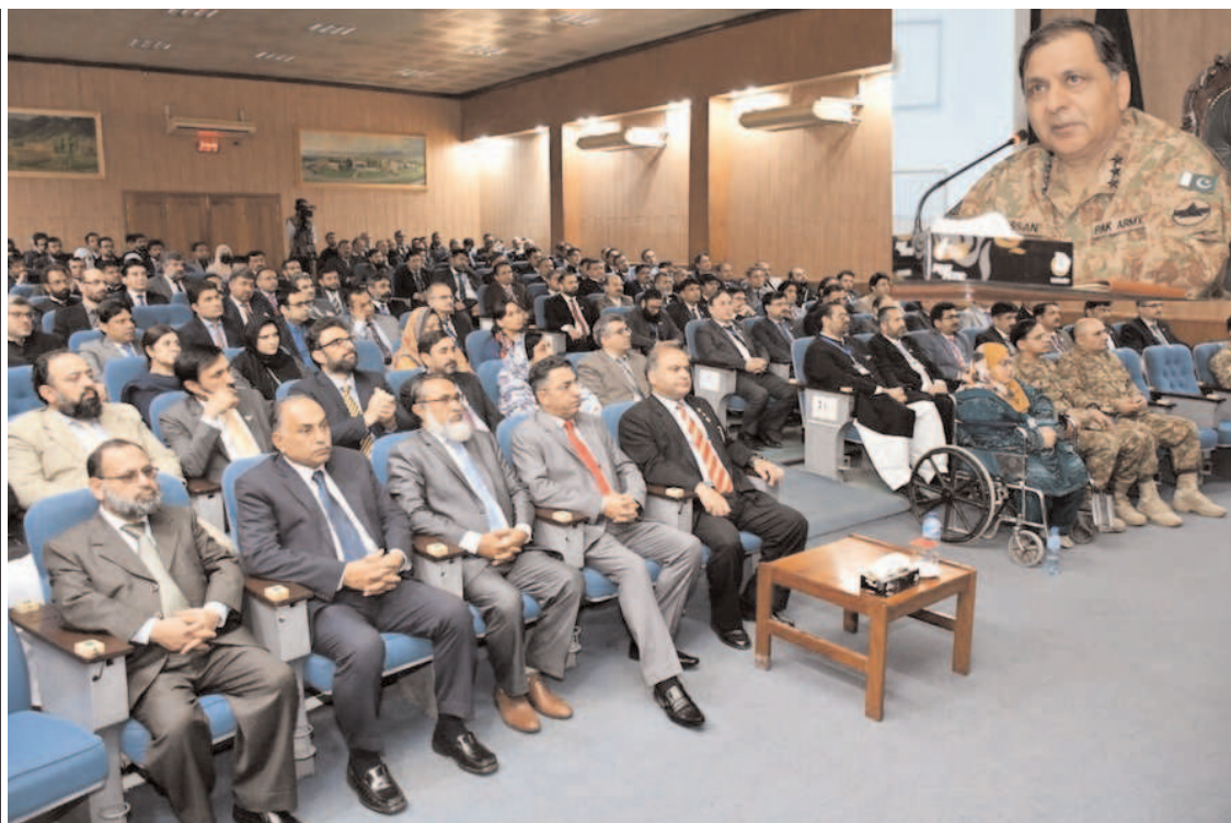
PESHAWAR: Corps Commander Peshawar Lieutenant General Hassan Azhar Hayat addressing officers from different cadres undergoing courses at National Institute of Management.

PRCSKP had so far aided more than 700,000 people during the recent flooding situation, which cost more than 770 million rupees. The emergency response operation has been completed. Now in these four affected districts, the rehabilitation process will be done on health and hygiene, rehabilitation of clean drinking water channels, reconstruction of the affected homes, and creating opportunities for livelihoods.