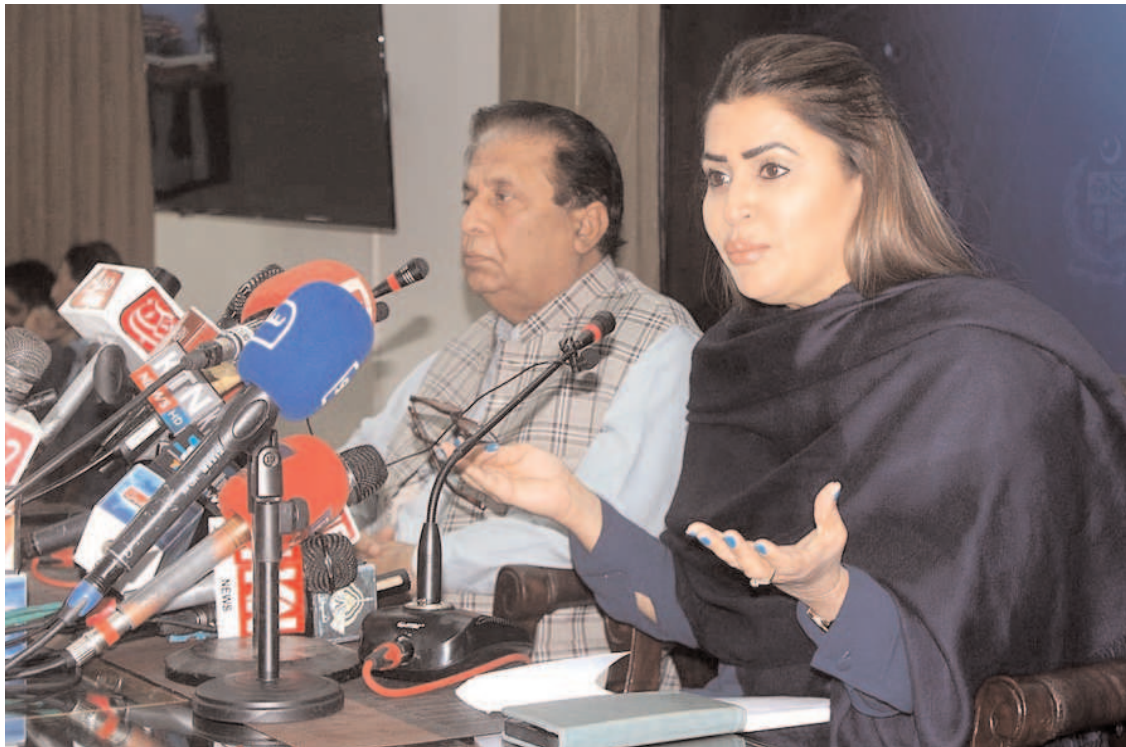
ISLAMABAD: Shazia Marri, Federal Minister for Poverty Alleviation & Social Safety and Chairperson Benazir Income Support Programme (BISP) addressing a Press Conference at PID.