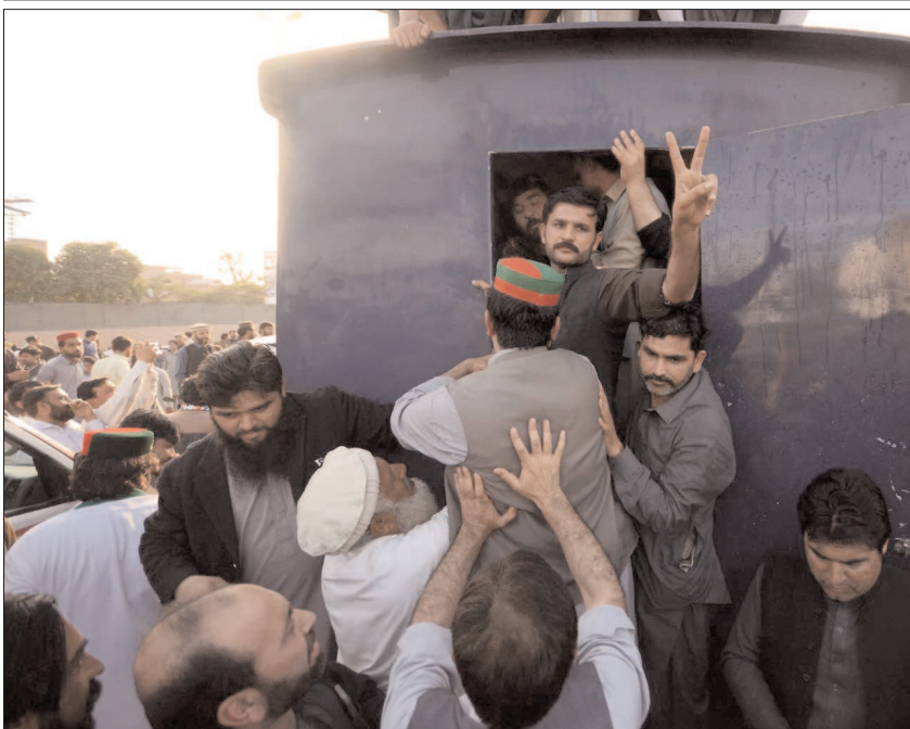
PESHAWAR: Police arrests activists of PTI during a rally in connection with Jail Bharu Tehreek.

Imran Khan-led party on Wednesday kicked off its court arrest drive in Lahore against the violation of fundamental rights and worsening economic situation. Police said around 90 people had courted their arrest while the PTI leaders claimed there were over 200 arrests. The leaders and workers of the party in Peshawar region will present themselves for court arrest today (Thursday) as the movement entered its second day.