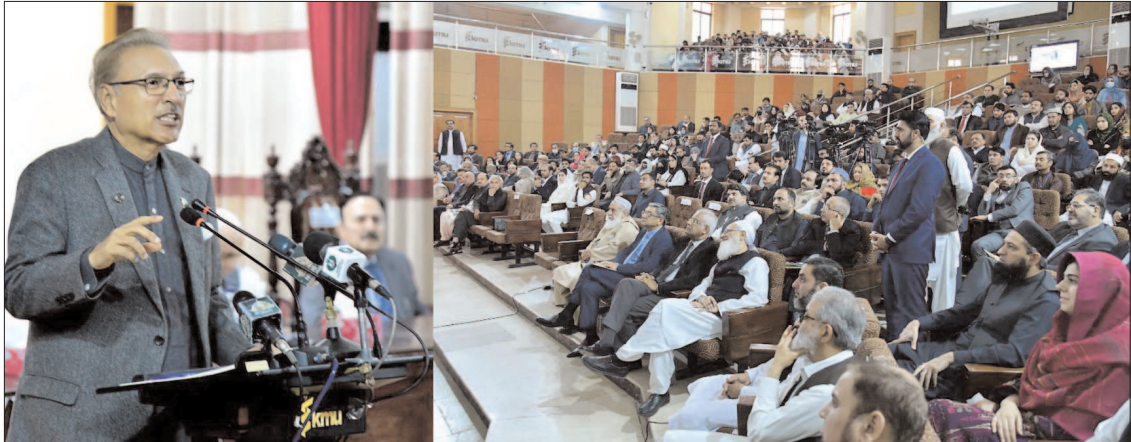
PESHAWAR: President Dr. Arif Alvi addressing the 3rd International Public Health conference, at Khyber Medical University.