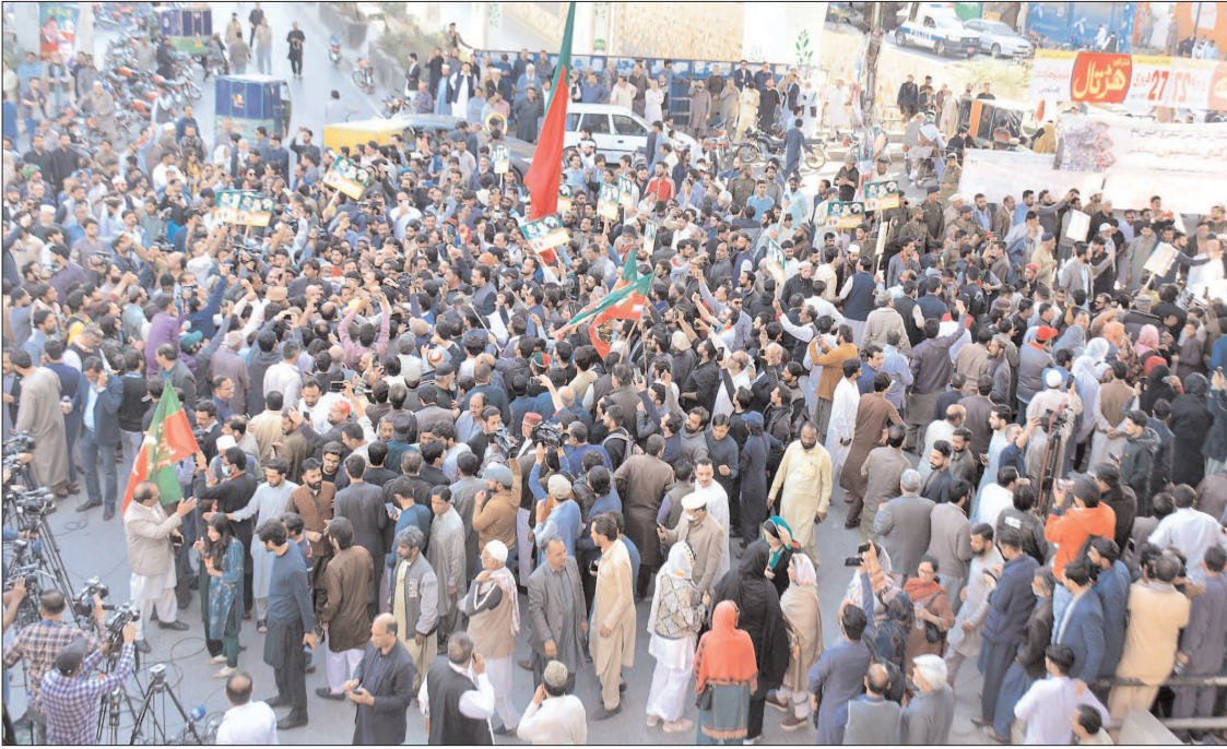
RAWALPINDI: Activist of PTI holding a protest during Jail Bharo Threek at Committee Chowk.

Defence Minister Khawaja Muhammad Asif while commenting on the recent visit of the Pakistani delegation to Afghanistan said some four ministers of the Cabinet were