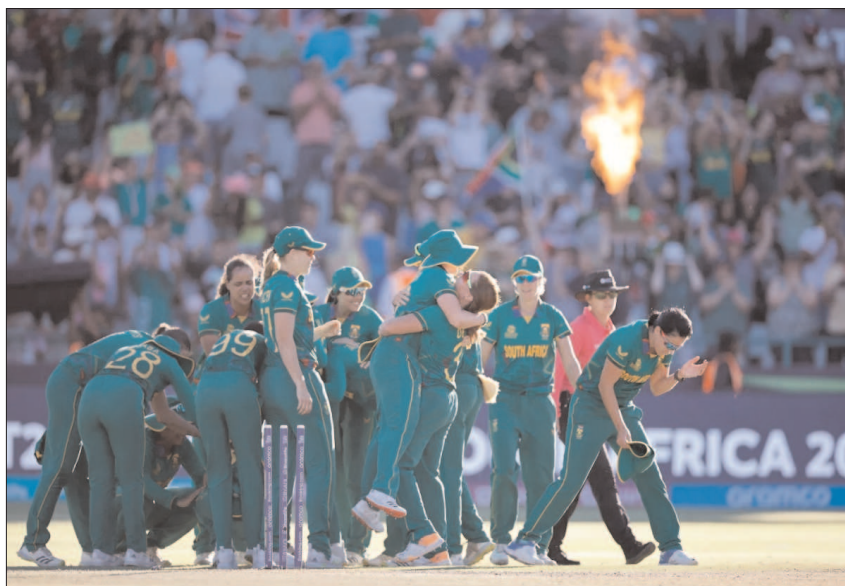
CAPE TOWN: South Africa players celebrate after reaching their maiden T20 World Cup final.

Two important matches will be played on Sunday (February 26) afternoon here at the Jinnah Polo Fields.