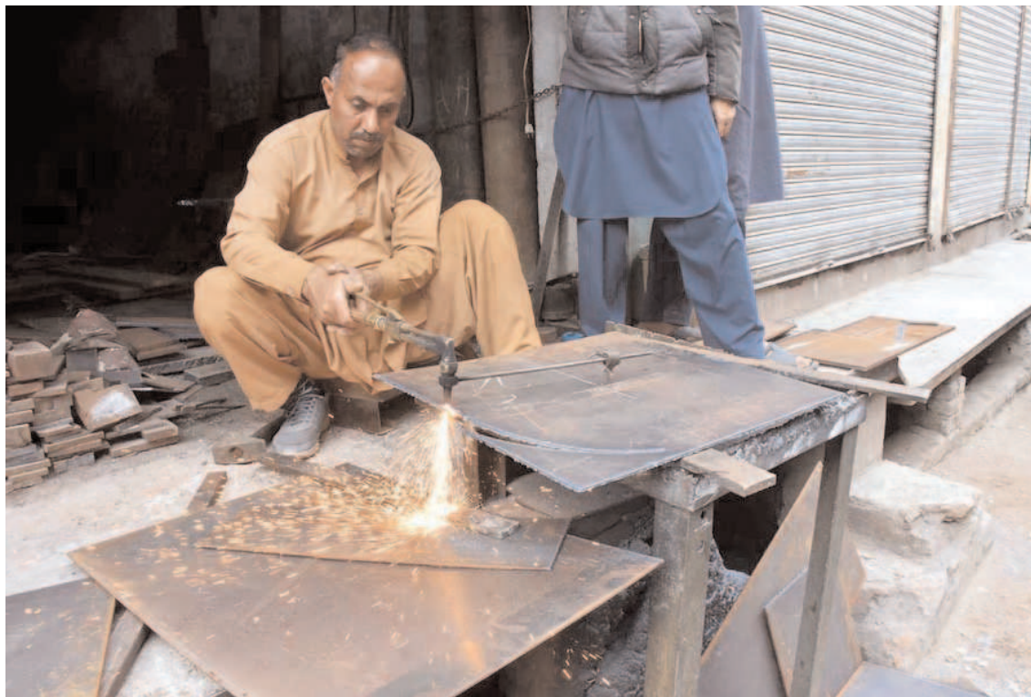
SIALKOT: A skilled worker is cutting thick iron sheet with the help of gas welding at his workplace.