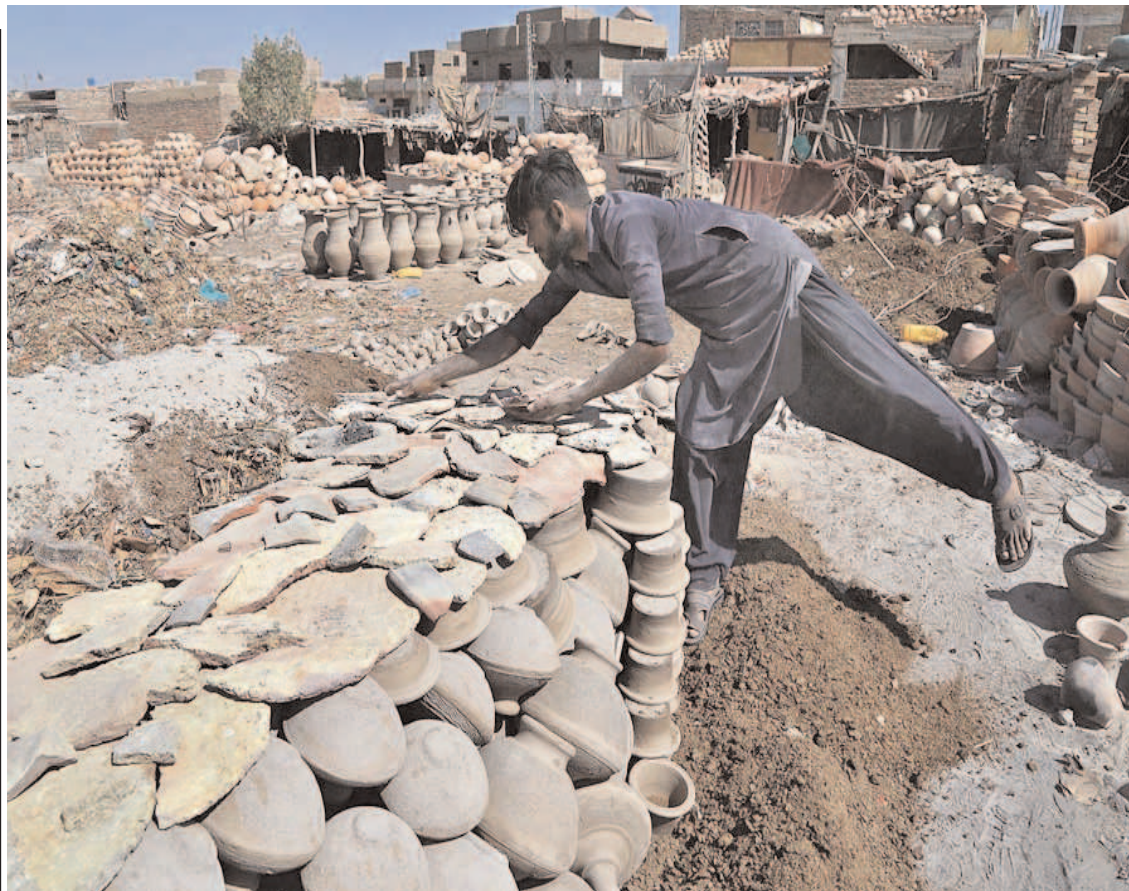
HYDERABAD: A worker drying clay-made items at his work palace.

There are 06 ships at Outer Anchorage of Port Qasim, out of them, 02 ships, Nordic Josephine and Alexis & another ship, Bea Schulte carrying Mogas, Wheat and Containers are expected to take berths at FOTCO, FAP and QICT on Friday, 24th February and two more containers ships, Olympia and Meratus Jayawijaya are due to arrive at Port Qasim on Saturday.