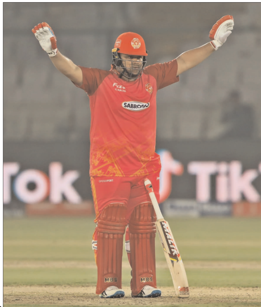
KARACHI: Azam Khan acknowledges the crowd after smashing 97 off 42 balls, Islamabad United, Quetta Gladiators PSL.

Mohammad Hasnain and Odean Smith bagged two wickets each for the Gladiators while Naseem and Aimal Khan struck out a batter each.