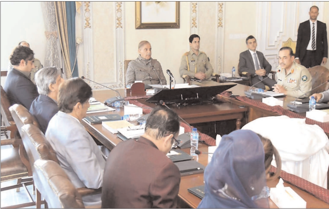
ISLAMABAD: Prime Minister Shehbaz Sharif chairing a meeting of central Apex Committee.