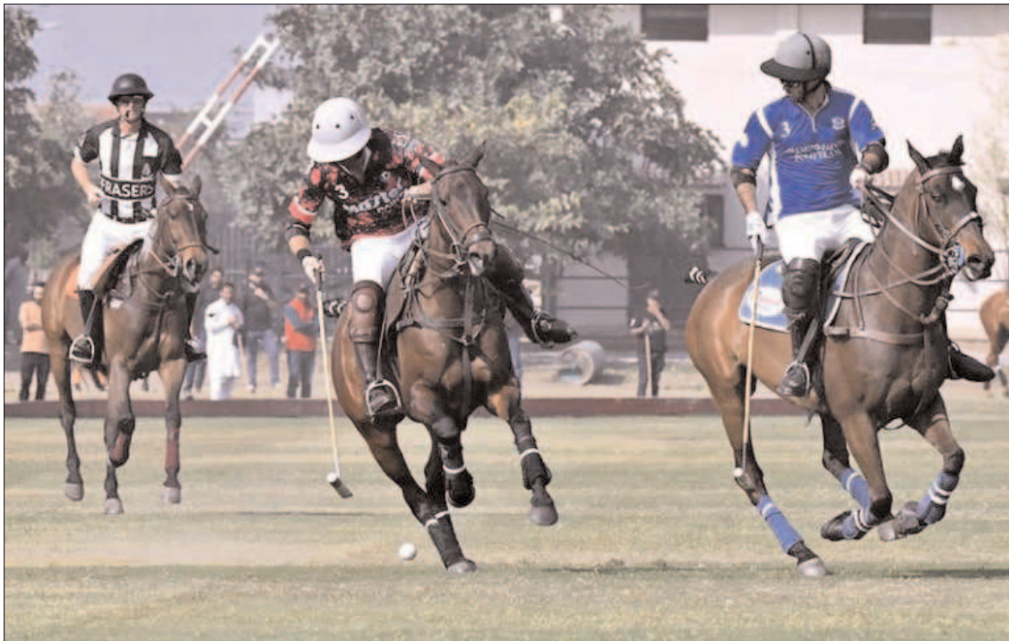
LAHORE: A view of match between Dimond Paints VS Master Paints in Takmeel Square 2nd President of Pakistan Polo Cup 2023 at Jinnah Polo Fields.

The sports events included in the Karachi Games are cricket, hockey, football, basketball, shooting ball, volleyball, softball, netball, dodgeball, karate, taekwondo, judo, vishu, badminton, table tennis, snooker, boxing, squash, chess, Rowing, Carrom, body building, swimming, roller skating, sepak takraw, futsal, tug of war, gymnastics, wrestling, shooting, scrabble, tennis, cycle race, donkey cart race, arm wrestling, mass wrestling, weight lifting, marathon race. Apart from field and track events, the traditional cultural sports of Sindh Malakhra Kabaddi and Khokhu are also included.