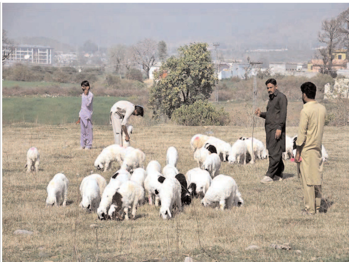
ISLAMABAD: Shepherd guarding herd of sheep grazing along Murree Road, BharaKhao.

The CTO said during the match, awareness banners regarding alternative routes and parking will be displayed on the main highways of Rawalpindi for the convenience of the citizens and to keep the traffic flowing on alternative routes so that the citizens remain updated.