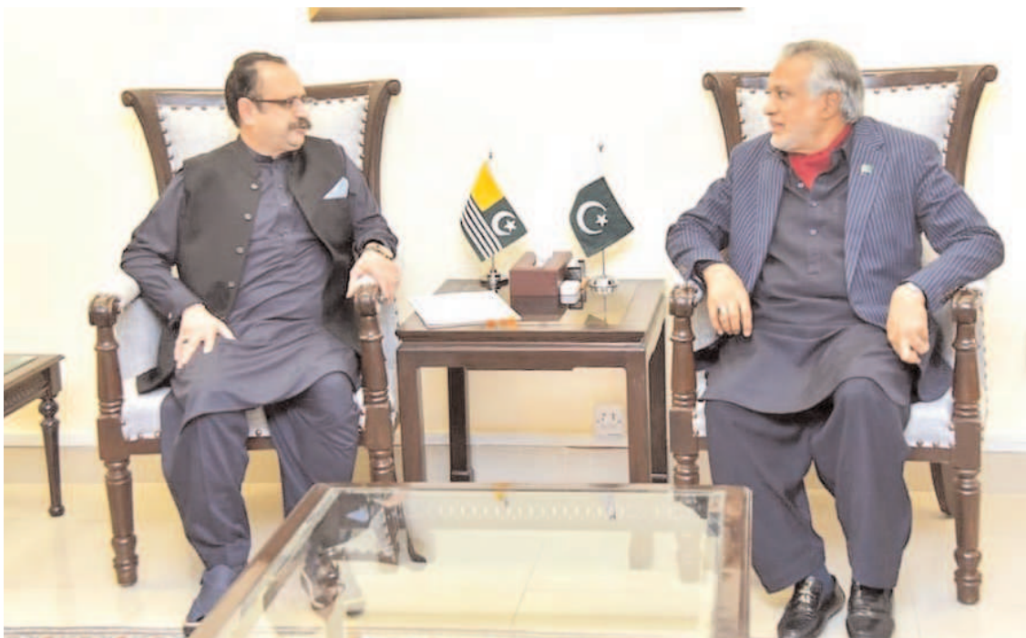
ISLAMABAD: Prime Minister of AJK Sardar Tanveer Ilyas meeting with Federal Minister for Finance and Revenue Senator Ishaq Dar.

This coincided with China’s commitment to building a green CPEC, which entails not building new coal-fired power plants overseas, and increasing support for low-carbon energy, he concluded.