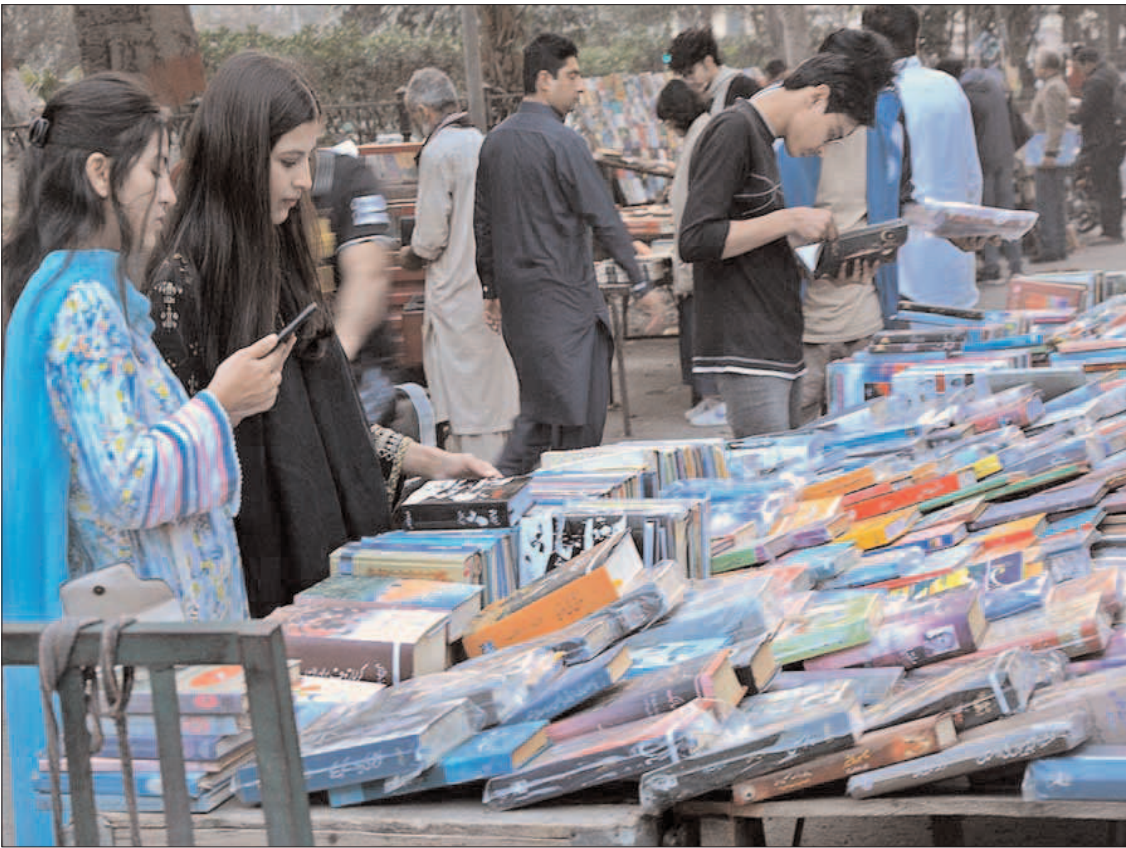
LAHORE: People selecting old books on a roadside stall at Provincial Capital.

The foreign participants in the conference were also provided with an opportunity to visit old historical places of Lahore City. After the tour, foreign doctors termed it the best part of their life to visit Lahore, meet its dwellers, enjoy their hospitality and experience classic traditions of love and respect for the guests.