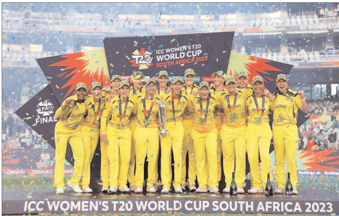
CAPE TOWN: Meg Lanning of Australia lifts the ICC Women's T20 World Cup following the ICC Women's T20 World Cup Final match.