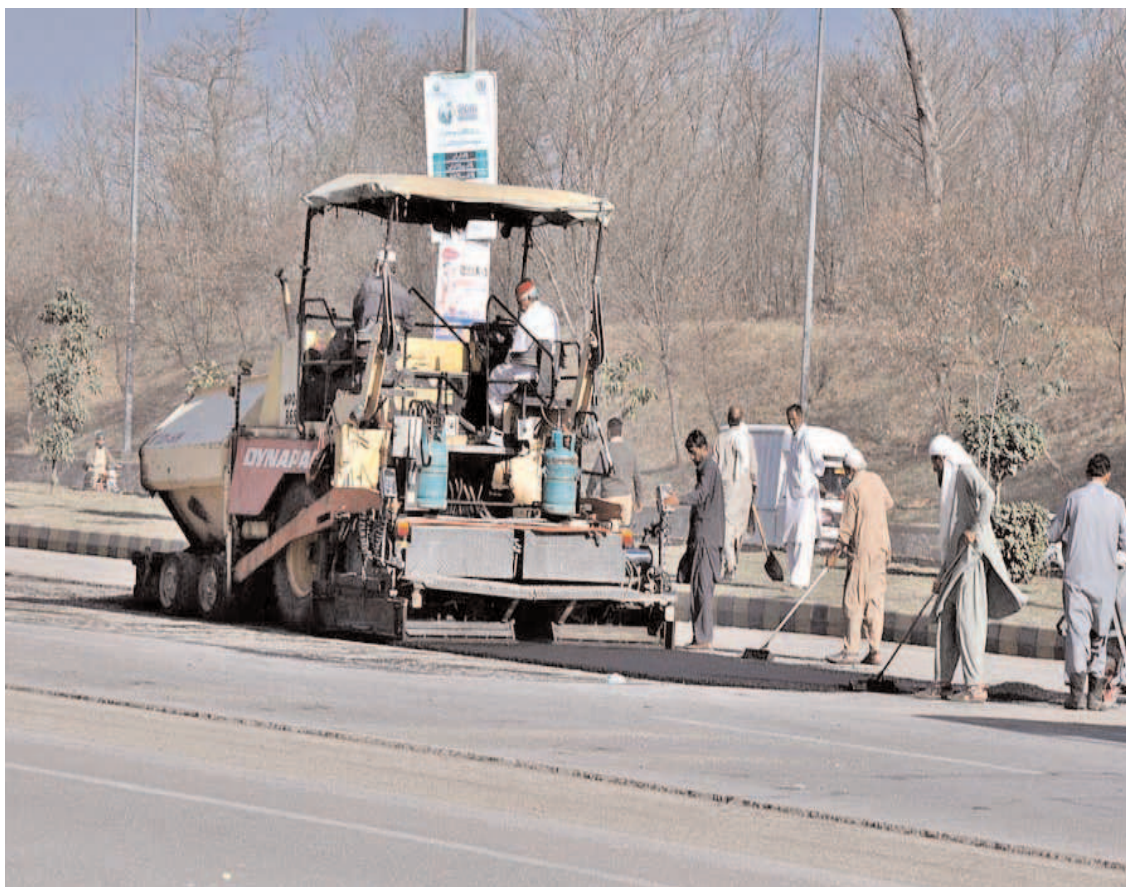
ISLAMABAD: Labourers busy in carpeting Srinagar Highway during maintenance work in Federal Capital.