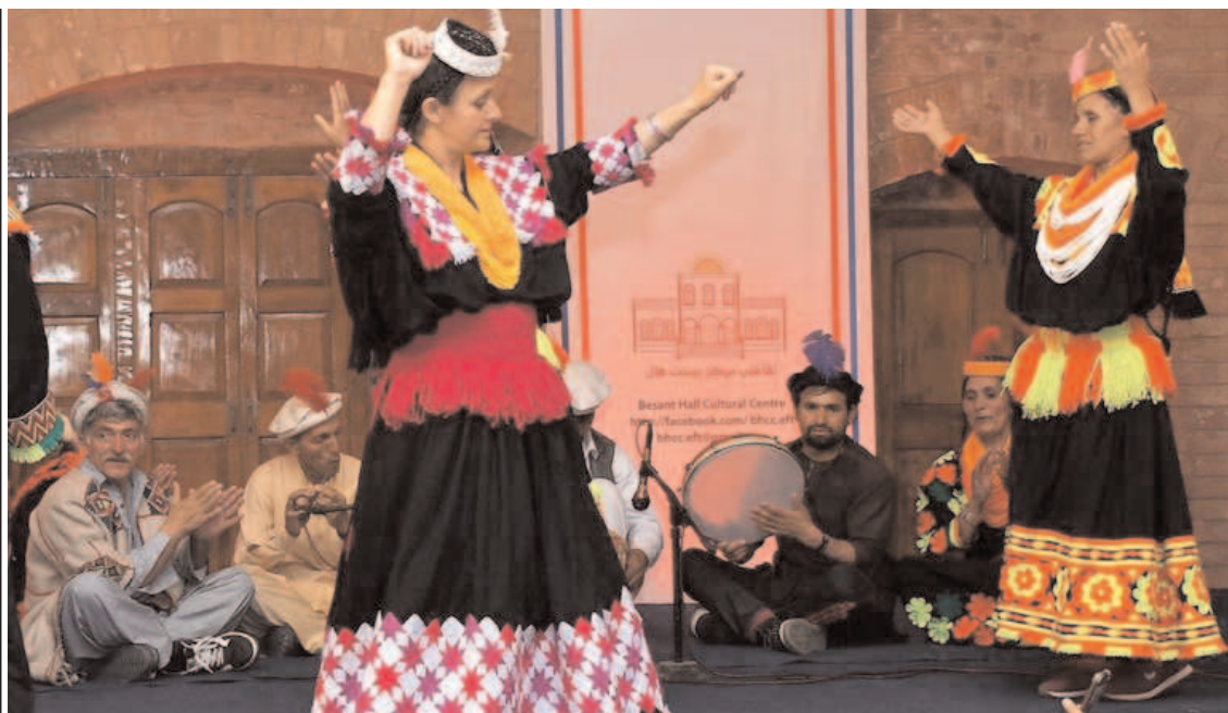
HYDERABAD: Kelashi girls dancing on stage during Kelash Festival.