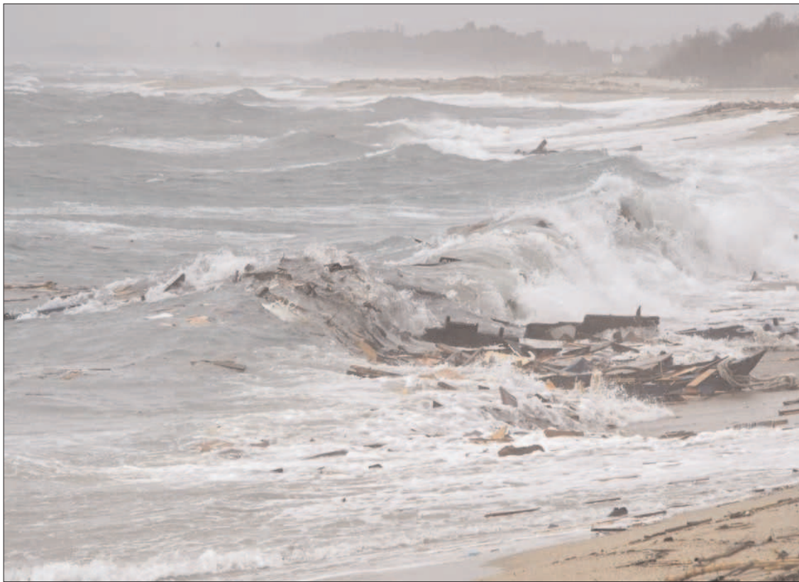
ITALY: Remains of a ship are seen along the beach where bodies of suspected believed to be refugees were found after a shipwreck, in Cutro, the eastern coast of Italy's Calabria region.

The West reacted with skepticism to China's proposal on Friday for a Ukraine ceasefire, with NATO Secretary-General Jens Stoltenberg saying Beijing did not have much credibility as a mediator because of its failure to condemn the invasion. Ukraine rejected the proposal unless it involves Russia withdrawing its troops.