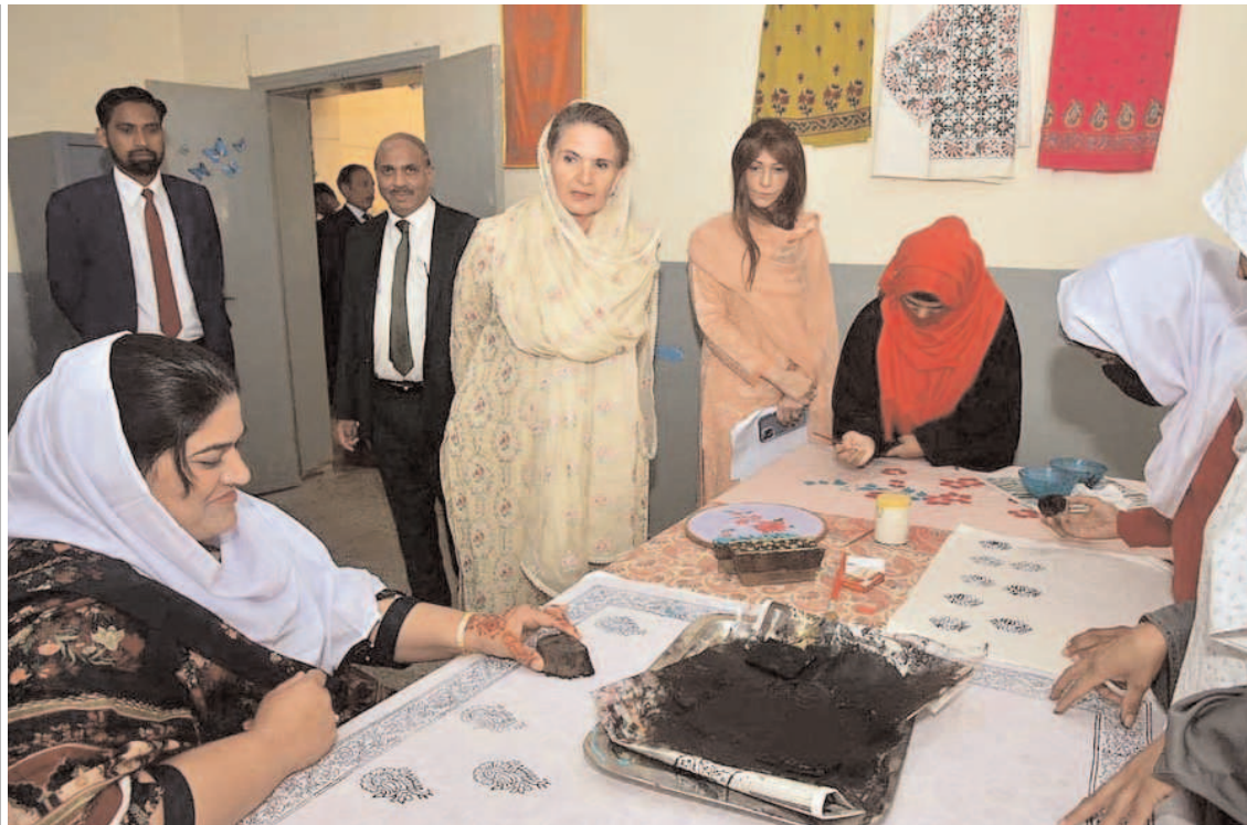
ISLAMABAD: First Lady Begum Samina Arif Alvi being briefed about training facilities for students with disabilities, at the National Training Center for Special Persons.

The public is now fed-up of listening to the conspiracy mantra of the PTI chief, she said, adding, without Mian Nawaz Sharif, the situation cannot improve. People must prepare, Nawaz Sharif will come to Pakistan very soon.