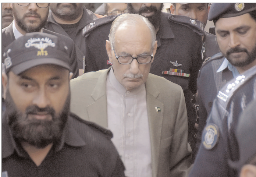
ISLAMABAD: Police officials escorting Lt Gen (retd) Amjad Shoaib to present him before court.

Earlier, the bail petition of the accused was also rejected by an additional district and sessions judge in Swat on Feb 9. The judge had ruled that the allegations being extremely brutal, degrading and inhuman in nature, tending to tear apart the very fabric of society, required more cautious dispensation.