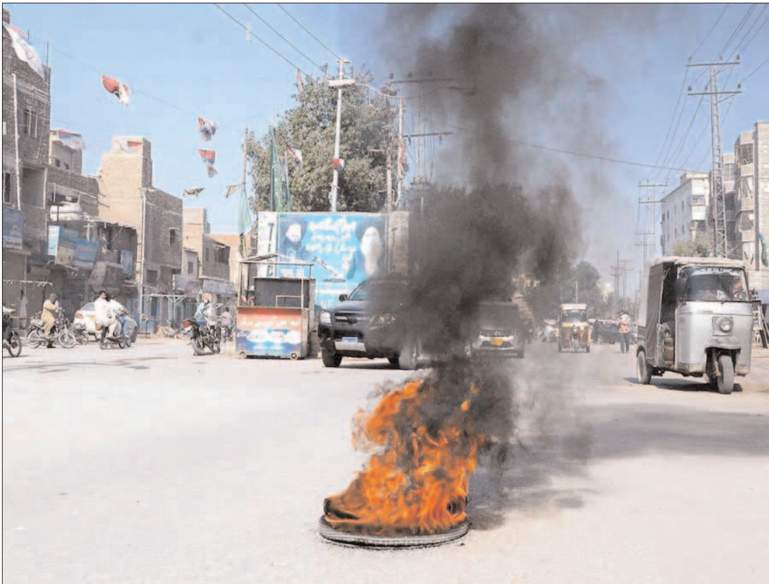
HYDERABAD: Workers of TLP burning tyres on road during a shutter down strike against skyrocketing inflation.