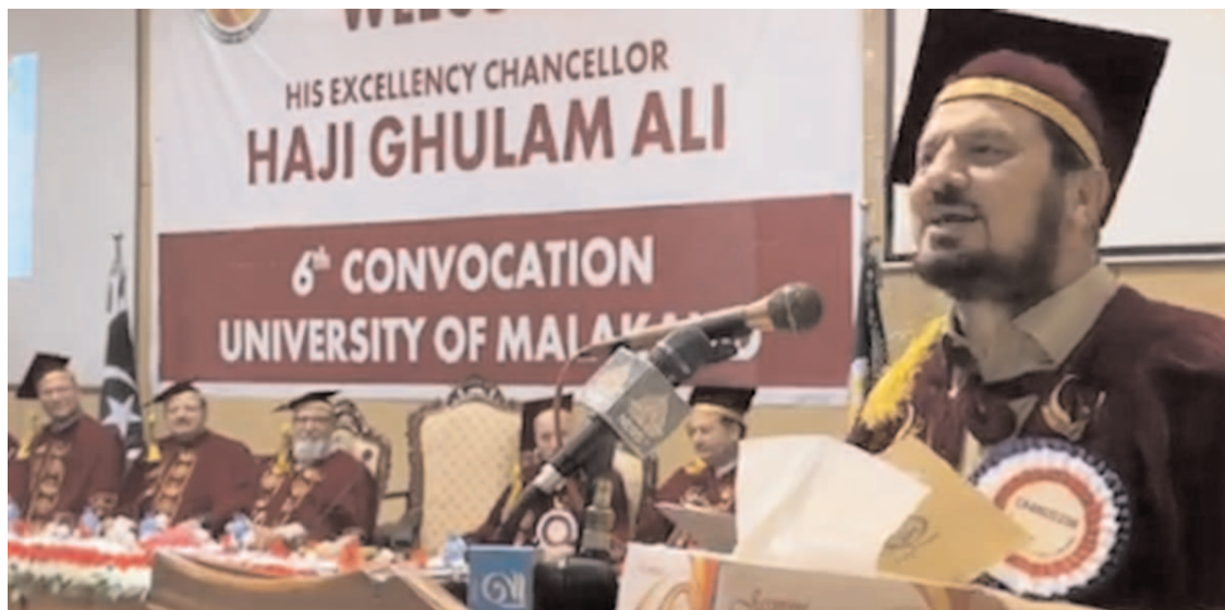
PESHAWAR: Governor Khyber Pakhtunkhwa Haji Ghulam Ali addressing 6th convocation at University of Malakand.