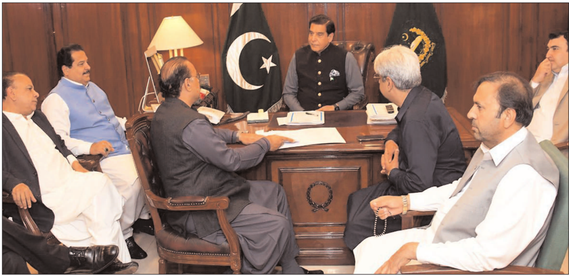
ISLAMABAD: Speaker National Assembly Raja Pervez Ashraf in a meeting with delegation of PTI members regarding resignation at Parliament House.