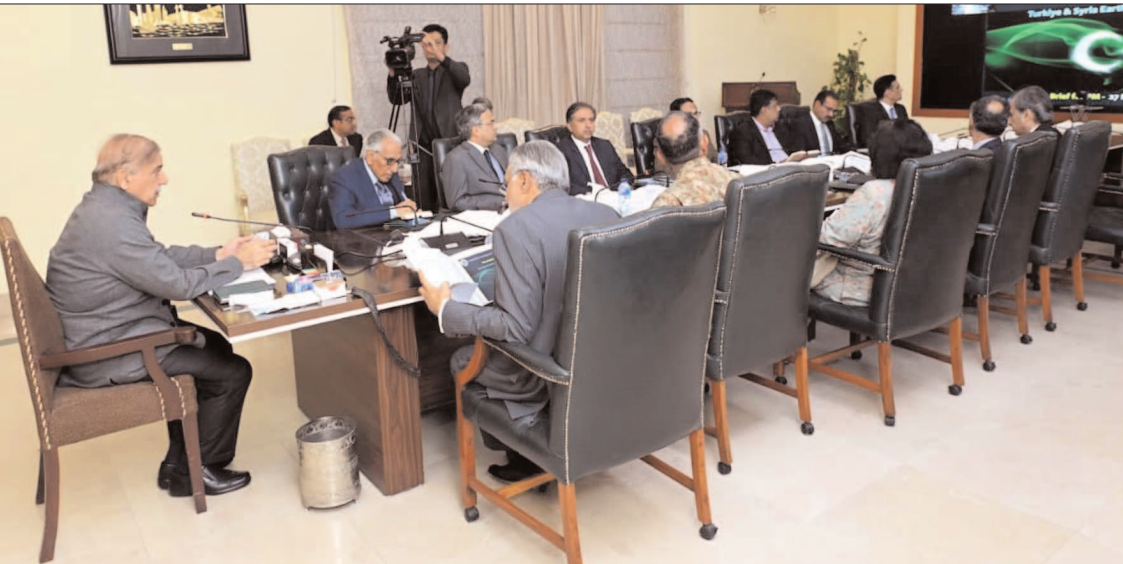
ISLAMABAD: Prime Minister Shehbaz Sharif chairing a meeting to review relief activities by Pakistan in earthquake hit areas of Türkiye and Syria.