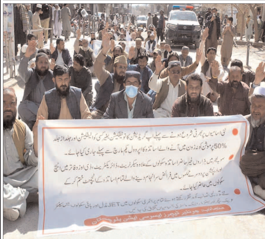
QUETTA: Members of Junior Teachers Association holding a protest in favour of their demands.