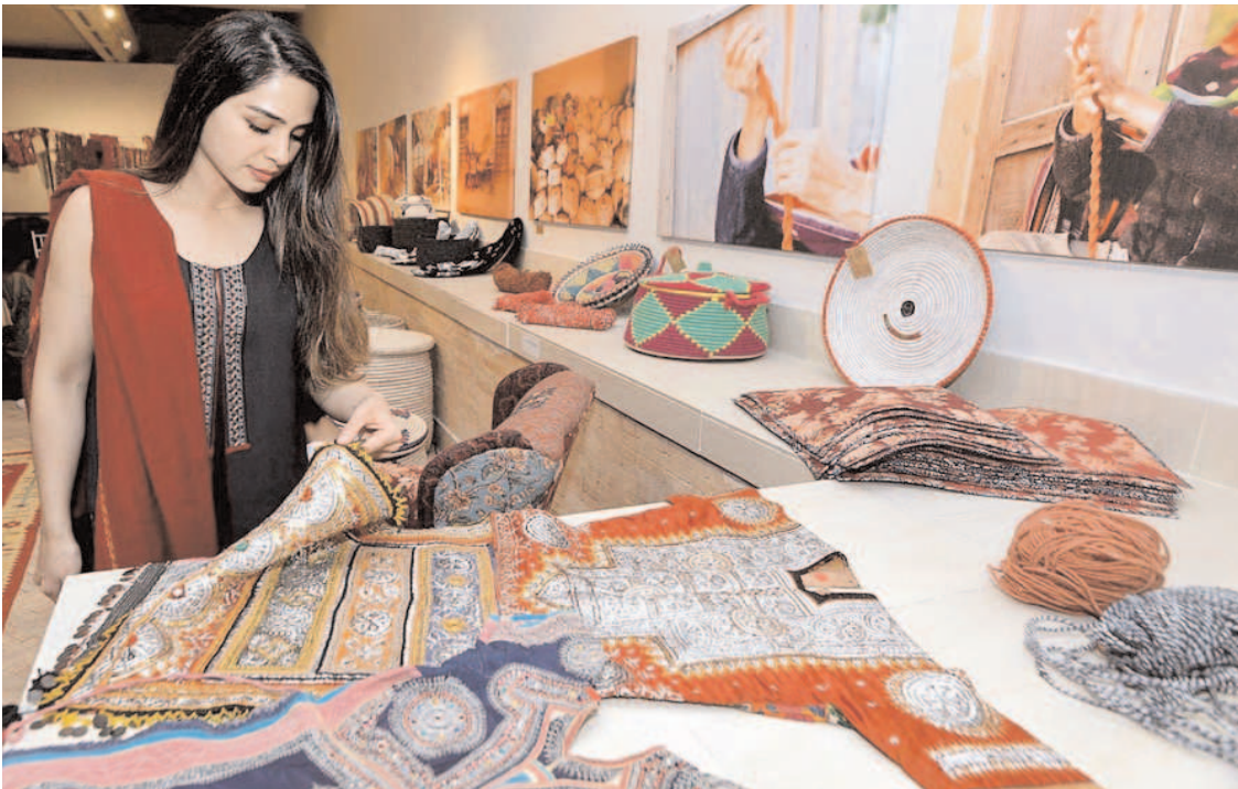
ISLAMABAD: A visitor is taking keen interest in a collage work on the cultural tradition of textile in Pakistan at an exhibition “PAIVAND-KAR” organized by AICS & SHEWORKS at Pakistan Nation Council of the Arts.

To control the deficit and earn more revenue, he said the department had introduced ‘Raabta’ - a platform for the improvement of its financial conditions. Raabta was essentially an attempt to enhance customer facilitation via artificial intelligence. Around 60 million passengers have used Pakistan Railways annually, for which 40 percent of the tickets were sold using an outdated process without any audit, he said. To resolve this problem, Raabta allows customers to plan trips with the help of different options. Single interface customers can check train statuses, choose and purchase seats, book hotels, and order car rentals, meals, and refreshments.