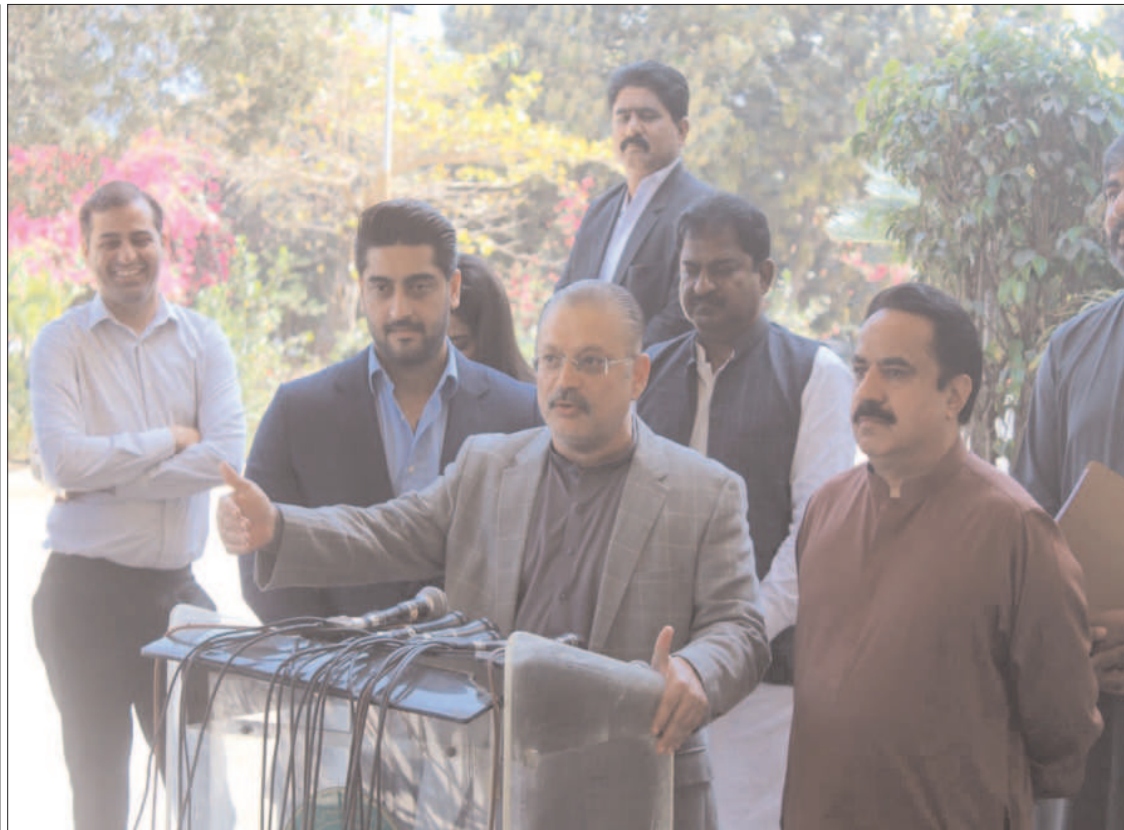
KARACHI: Provincial Minister for Information, Transport and Mass Transit Sharjeel Inam Memon talking to the media at the Sindh assembly media corner.

They said that students should play a positive role in the betterment of society and serve the country and people.