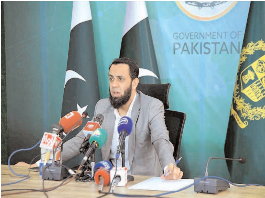
ISLAMABAD: Special Assistant to Prime Minister Atta Tarar addressing an important press conference.

The panellists unanimously agreed that by combining a structured learning process with extracurricular activities, schools can create a holistic environment that fosters growth, creativity, and innovation. The panellists also emphasised that apart from enabling students to learn knowledge and skills, the learning process should also enable students to discover their full potential and to unlock a world of possibilities! Highlighting the importance of such events, one participant noted, "By gathering at events like this, we have the opportunity to share our experiences and perspectives, and to learn from one another about how we can best prepare our students for success in the real world."