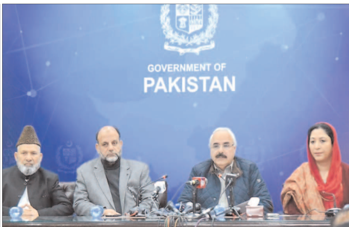
ISLAMABAD: Minister of State for Kashmir Affairs and Gilgit Baltistan Nawabzada Iftikhar Ahmed Khan Babar addressing a press conference regarding Kashmir Solidarity Day.

Note: IRS reserves the right to not to fill the position, without assigning any reason.