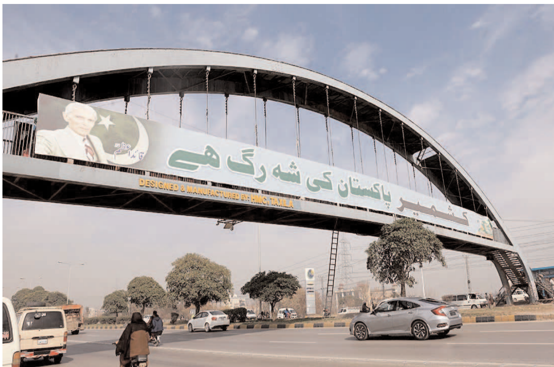
ISLAMABAD: A view of banners displayed at a pedestrian bridge ahead of Kashmir Solidarity Day at Faizabad.

ISLAMABAD (APP): Prime Minister's Special Representative for Interfaith Harmony and Middle East Hafiz Muhammad Tahir Mehmood Ashrafi Friday appealed all stakeholders to make All Parties Conference (APC) a success story keeping in view the current circumstance after the Peshawar tragedy in the country. He, in a video message, said all political and religious leadership should grab this opportunity offered by the Prime Minister Muhammad Shehbaz Sharif to cope with the current challenges including the scourge of terrorism being faced by the country. Ashrafi who is also the chairman of Pakistan Ulama Council urged Pakistan Tehreek-e-Insaf (PTI) Chairman Imran Khan to join this unique platform in larger interest of the country on behalf of his organization and the Ulama and Mashaykh of other schools of thought. He emphasized the need to be united like the Army Public Schools (APS) barbaric incident and devise a collective strategy in a bid to make National Action Plan more vibrant and result-oriented across the country. He expressed the hope that the political and religious leadership would play their constructive role with a unanimous stance of eliminating terrorism and uplifting the economic condition of the country.