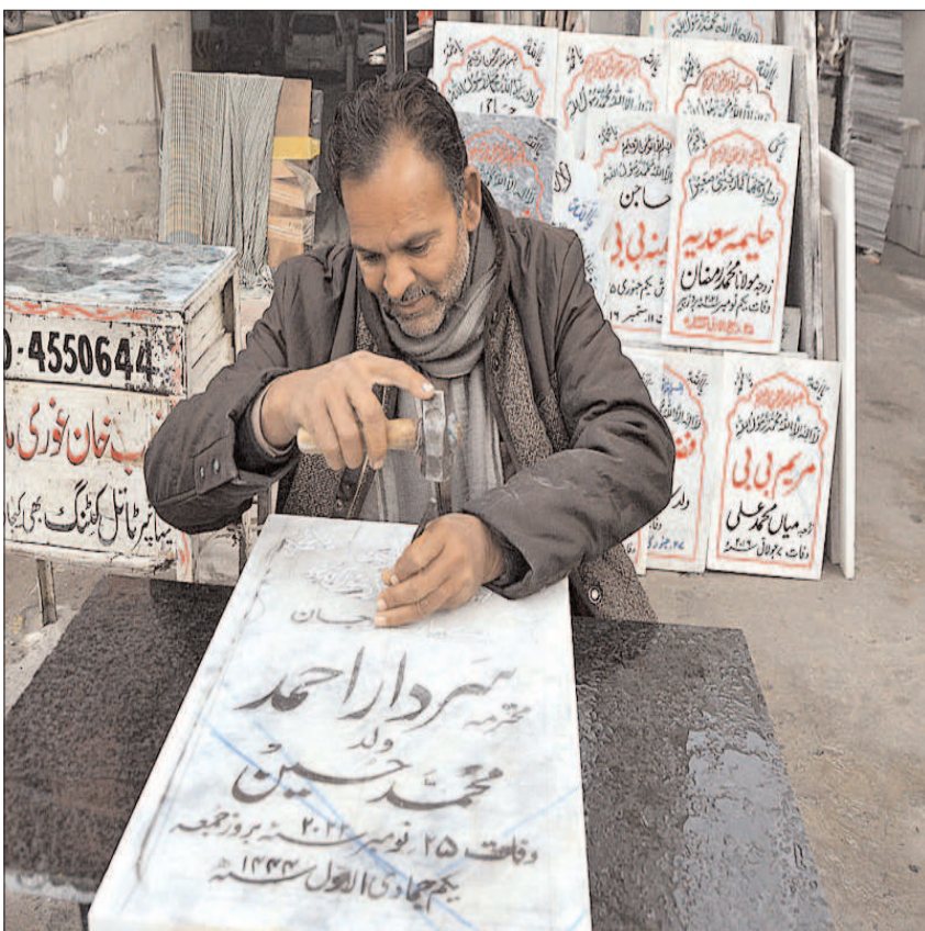
LAHORE: An artisan is carving words on a marble plate at his workplace.

Executive Engineer | Kohat Irrigation Division, Kohat INF(P) 504/23