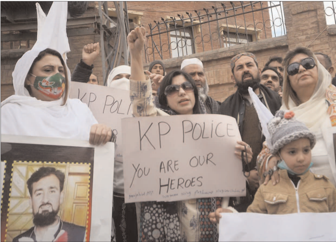
PESHAWAR: Family members of Police Lines mosque blast victims and social activists holding placards during a protest.

The list of all those who have filed nominations would be released on February 9, 2023 and scrutiny of nomination papers would be held till February 13, 2023. Appeals against the acceptance or rejection of nomination papers by the Returning Officers could be filed with the concerned Appellate Tribunal till February 16, 2023, which will decide them till February 20, 2023. The revised list of candidates would be issued on February 21, 2023 while nomination could be withdrawn till February 22, 2023 and final list would be issued on February 23, 2023, which would be followed by the allotment of electoral symbols to candidates. Polling would be held on March 16, 2023.