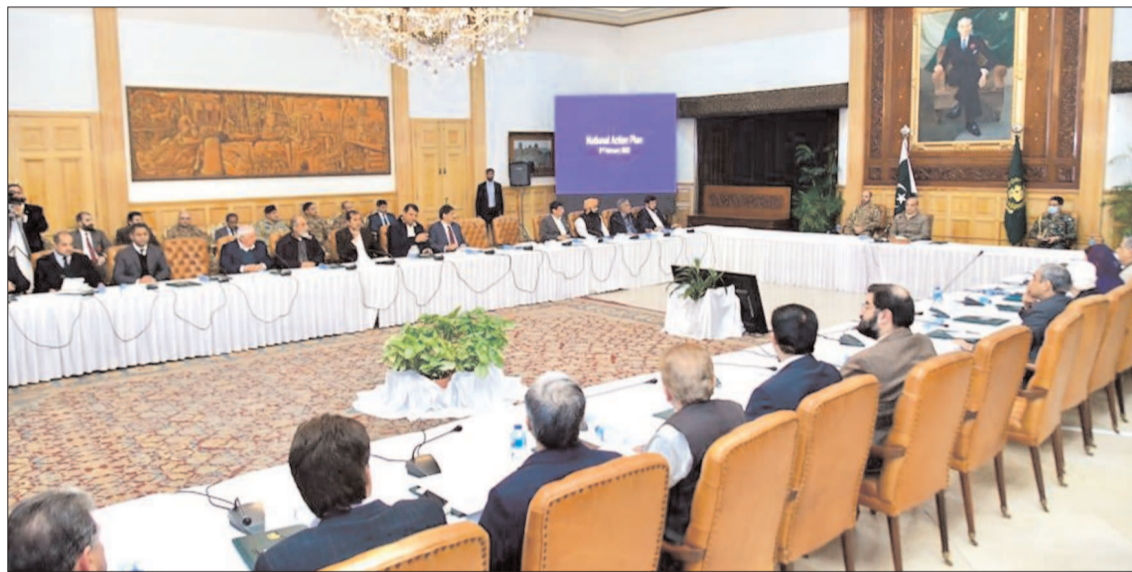
PESHAWAR: Prime Minister Shehbaz Sharif chairing a meeting of the Apex Committee.

The prime minister said the economic challenges being faced by the country were enormous and the IMF conditions that the country has to meet are beyond immigration, adding the government would take strict decisions to take the country out of the economic quagmire. Later, collective Fateha was offered for eternal peace of the departed souls and speedy recovery of the injured in the police lines blast. Earlier, the prime minister was received by KP Governor Ghulam Ali, Caretaker CM Azam Khan and officials of the KP government.