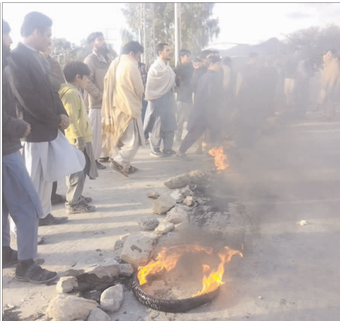
GHALANAI: Residents of Mohmand burning tyres during a protest against electricity load shedding their areas.

Three of the injured were referred to the District Headquarters Hospital Tamergara due to their critical condition. All the injured and dead belonged to the same family of Maidan Karbori village. The Lal Qila police station registered a case and started an investigation. Meanwhile one Ibrar Khan s/o Khan Badshah was killed when unknown person opened firing on him at Kitiari area in the jurisdiction of Ouch police station. The accused fled from the scene. The motive behind the incident is not known. The Ouch police registered a case and started investigation.