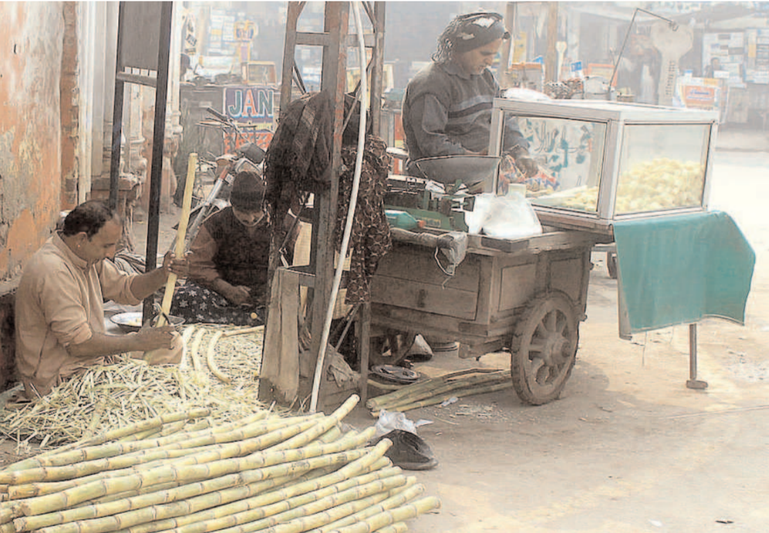
MULTAN: A vendor is cleaning sugar cane before making pieces at his roadside setup.

MUMBAI (AFP/APP): Beleaguered Indian tycoon Gautam Adani denied Friday that his rise to become Asia's richest man -- a title he has lost in a phenomenal stock rout -- was due to Prime Minister Narendra Modi, as shares in his conglomerate slumped again. His listed units' combined market capitalisation has collapsed by more than $100 billion since US short-seller Hindenburg Research -- which makes money by betting on shares falling -- released an explosive report last week. It accused Adani of accounting fraud and artificially boosted its share prices, calling it a "brazen stock manipulation and accounting fraud scheme" and "the largest con in corporate history". Critics say Adani's close relationship with Modi, who is also from Gujarat state, has helped him win business and avoid proper oversight. "These allegations are baseless," Adani told India Today television on Friday, adding that their shared origins made him an "easy target" for such claims. "The fact of the matter is that my professional success is not because of any individual leader," he insisted. His comments came as shares in his flagship firm Adani Enterprises were repeatedly suspended on the Bombay Stock Exchange, hitting multiple trading stops on the way to falling by 25 percent. Adani Power, Adani Green Energy, Adani Total Gas -- in which French giant TotalEnergies has a 37.4 percent stake -- and Adani Transmission were also suspended when they hit their limits.