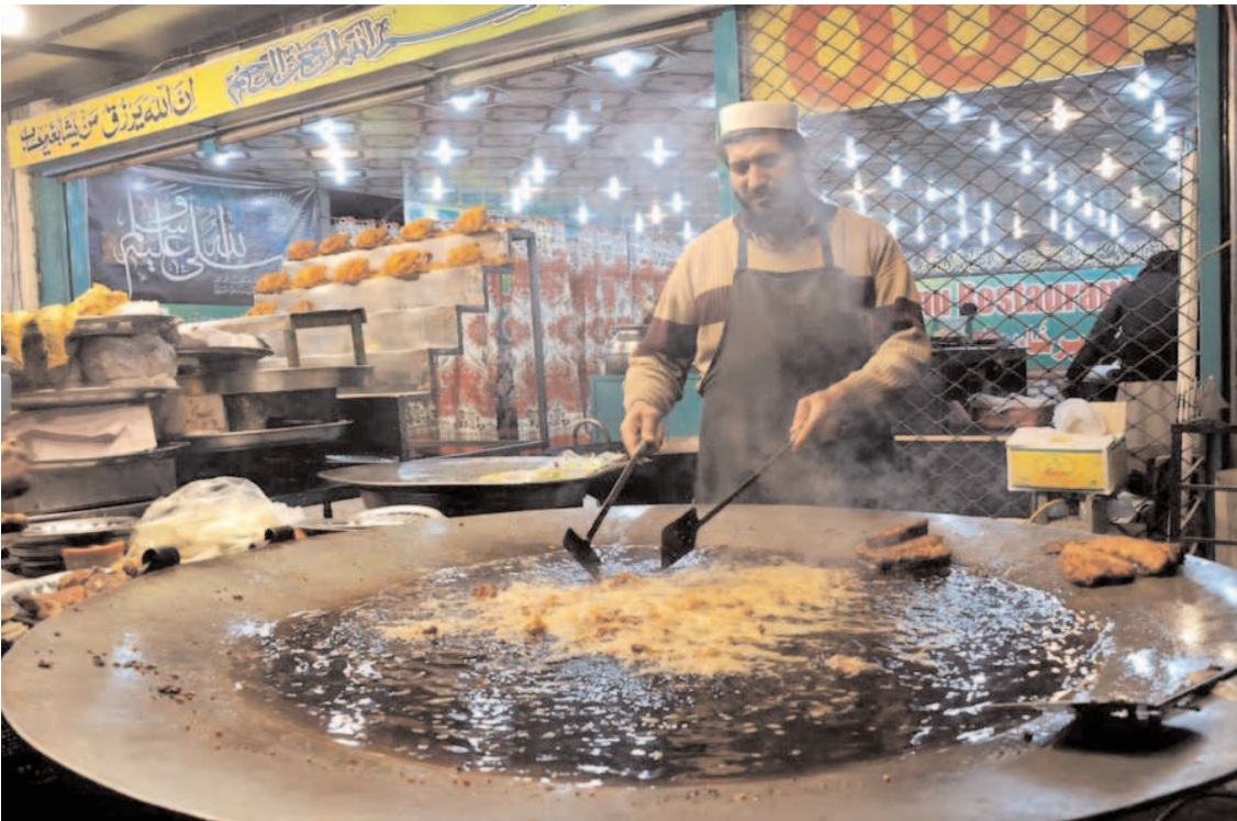
ISLAMABAD: A vendor frying and selling fish to attract the customers at Khanna Pul.

(IT) based skilled training besides providing an opportunity to another 100,000 young people to get technical and vocational training. On the eve of 75th year of independence of Pakistan, he said the government is also offering 75 scholarships to those who manage to secure admissions in the top 25 universities in the world. Likewise, the minister added that 100,000 university students would also be provided laptops to make them digitally empowered. "In our previous tenure, we provided one million laptops that resulted in the promotion of free-lancing culture among the youth", he added.