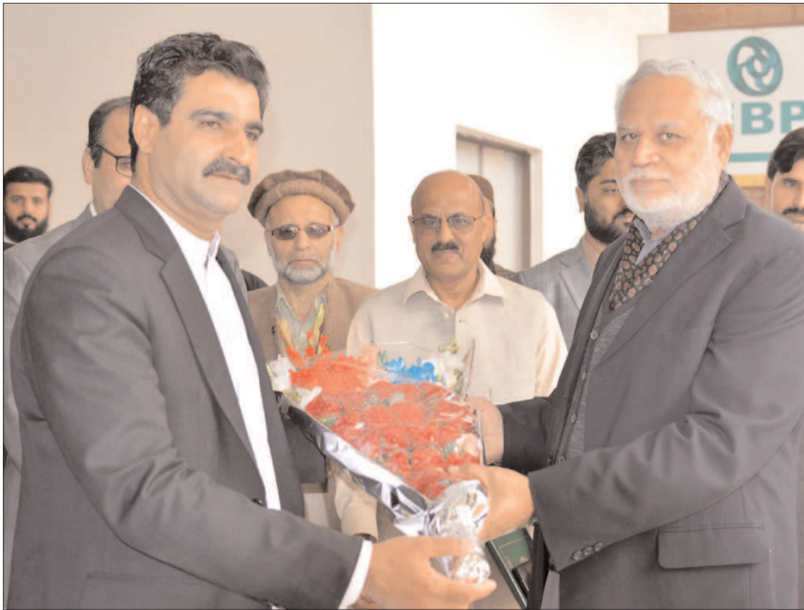
PESHAWAR: Caretaker Minister for Labour, Excise and Taxation Manzoor Afridi being warmly received by officials on arrival at Labour Department.

On the other hand, he noticed the verbal duels continue by putting the masses' issues into the backburner, which is deplorable.