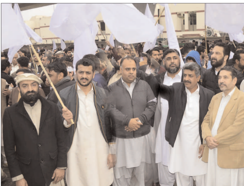
PESHAWAR: People holding a rally for peace in Khyber Pakhtunkhwa.

The lawyer community paid tribute to sacrifices of police personnel fighting against extremism and terrorism while added that peace is sustain in Khyber Pakhtunkhwa due to police force potential. The legal fraternity offered prayer for martyrs of suicide blast and early recovery of injured person while show their condolence to the bereaved families.