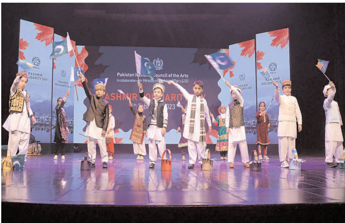
ISLAMABAD: Children performing tableau during Kashmir Solidarity Day Ceremony, organized by Pakistan National Council of the Arts in collaboration with Ministry of Kashmir Affairs & Gilgit-Baltistan.