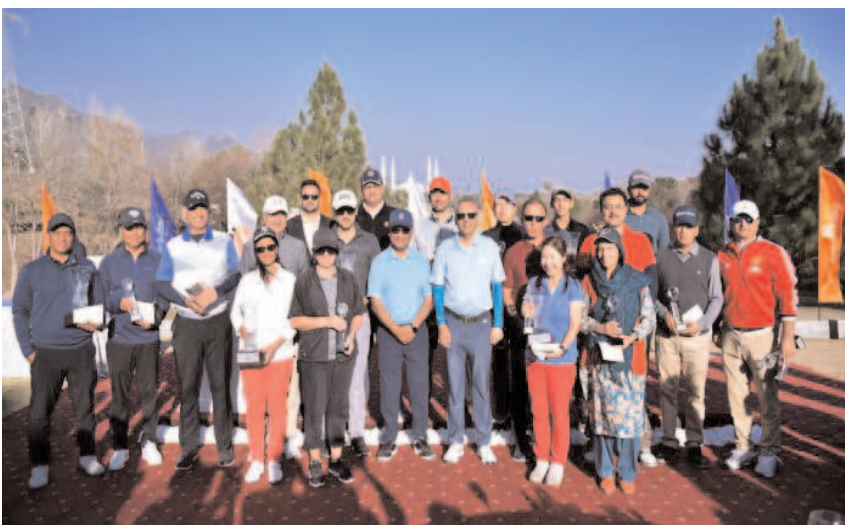
ISLAMABAD: President Dr Arif Alvi in a group photo with the winners and best players of the golf tournament, organized by a local hotel.