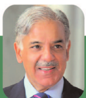
Muhammad Shehbaz Sharif

Prime Minister, Islamic Republic of Pakistan