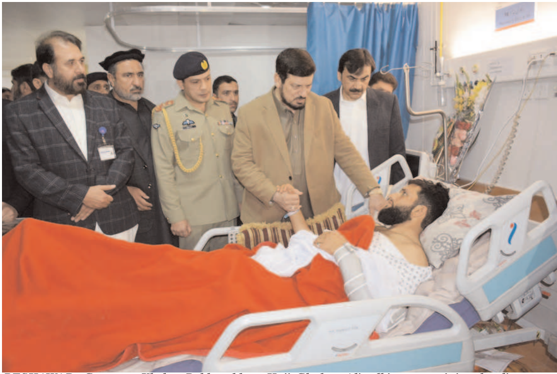
PESHAWAR: Governor Khyber Pakhtunkhwa Haji Ghulam Ali talking to an injured policeman of Police Line blast at LRH.