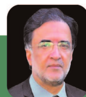
Qamar Zaman Kaira

Foreign Minister, Islamic Republic of Pakistan