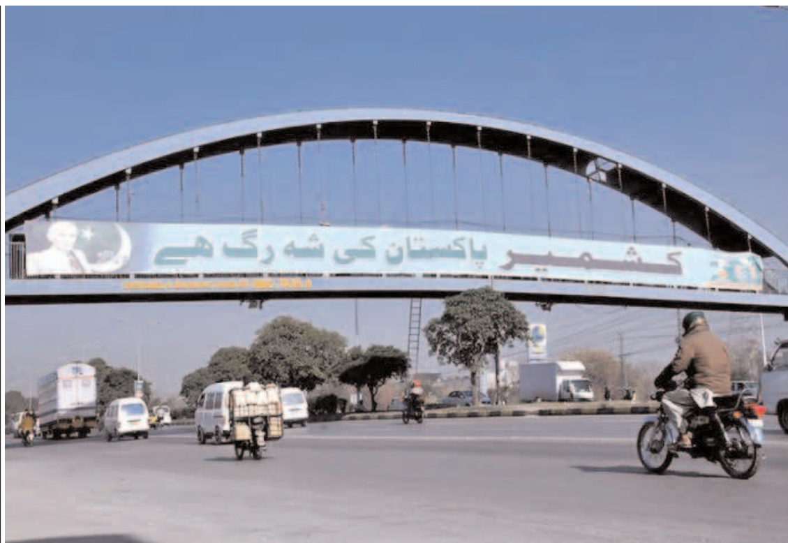
ISLAMABAD: A view of banners display on a pedestrian bridge ahead of Kashmir Solidarity Day at Faizabad.

He further said that there was a significant decline observed in the number of road mishaps and traffic violations in the federal capital after introducing this new challan system.