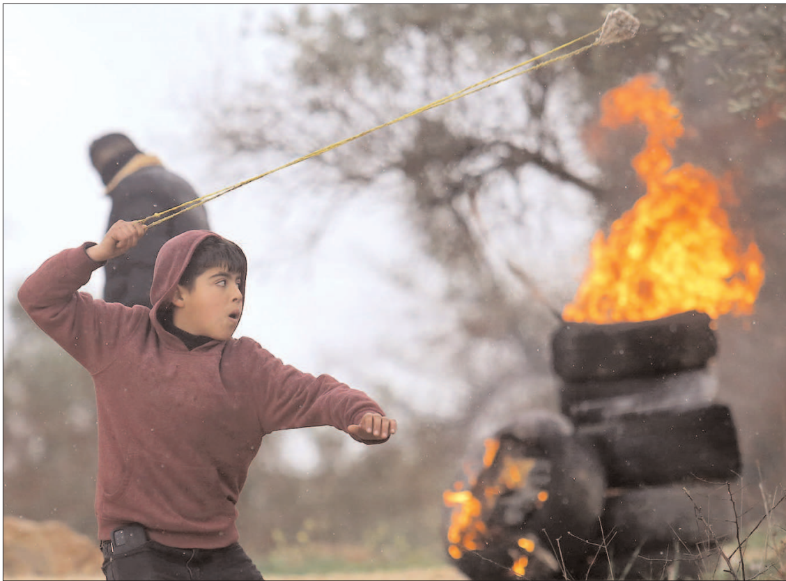
NABLUS: A Palestinian boy throwing stone towards Israeli forces during clashes.