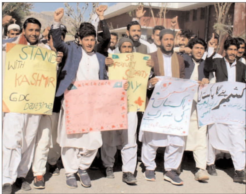
D I KHAN: Student holding a walk to support Kashmiri people on the occasion of Kashmir Solidarity Day.

They said that the nation stood by the police force in this hour of grief and sorrow and those elements who wanted to spread unrest, terrorism and chaos in the country. They demanded the government to deal the perpetrators with iron hands. The speakers said that no sacrifice would be spared to maintain peace and order in Lower Lower.