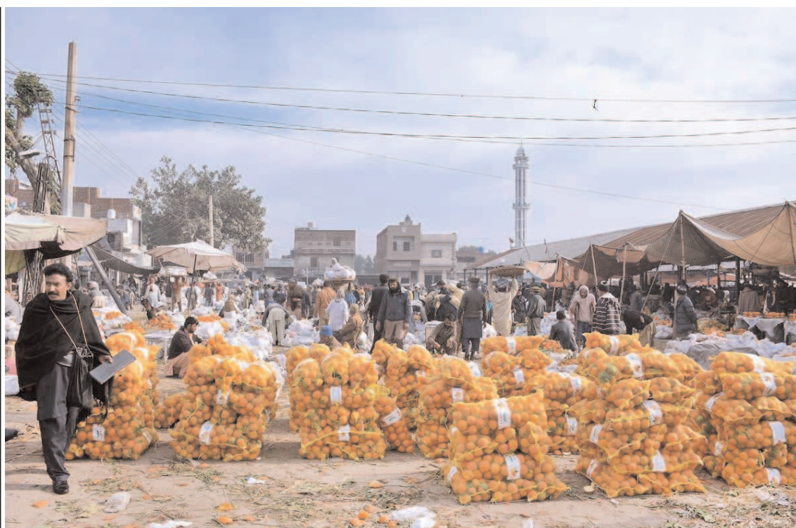
FAISALABAD: Vendors displaying seasonal fruit oranges bags to attract customers at fruit market.

Similarly, in order to increase private to private contacts and bilateral trade, the embassies and chambers should provide every possible assistance. He said that both countries should plan to organize exchange of trade delegations and also holding single country exhibitions on reciprocal basis.