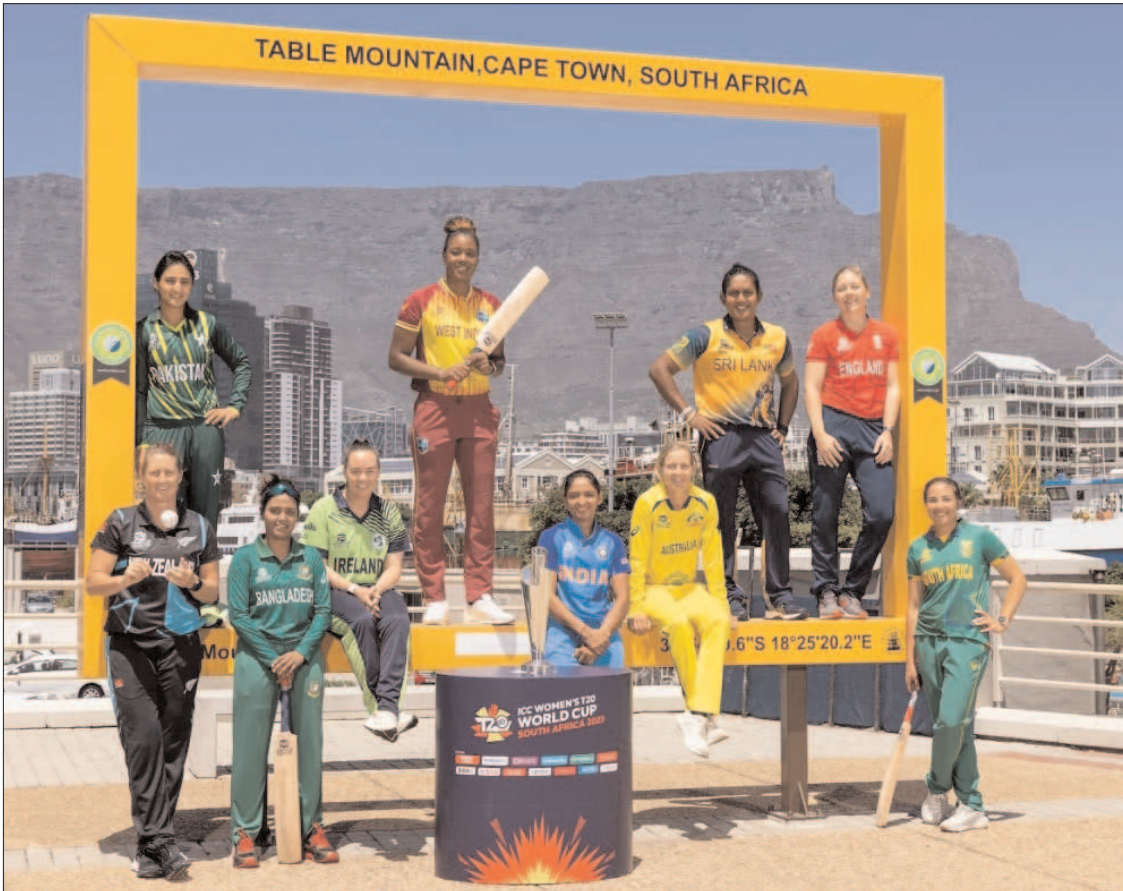
CAPW TOWN: The captains pose with the trophy with the Table Mountain at the back, Women's T20 World Cup.

BUENOS AIRES (INP): After hoisting his first World Cup trophy with Argentina in December, Lionel Messi said that tournament would be his last, but now it appears he's open to the possibility of playing in the 2026 event. "Because of age it'll be difficult to make 2026," Messi, 35, told Diario Ole in Argentina. "I love playing football and while I feel like I'm in good shape and enjoying this, I'm going to keep at it. It seems like a long time until the next World Cup, but it depends on how my career is going." Argentina coach Lionel Scaloni would love to see the superstar who is one of only six players to compete in five World Cups suit up for the next World Cup, which will be held in the United States, Canada and Mexico. "I think Messi can make it to the next World Cup," Scaloni told Spanish radio Calvia FM last month. "It will depend a lot on what he wants and what happens over time, that he feels good. The doors will always be open. He is happy on the pitch, and for us [it] would be good."