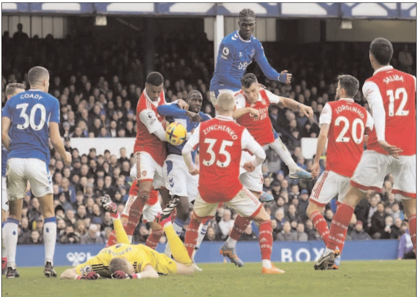
LIVERPOOL: Players in action during the English Premier League soccer match between Everton and Arsenal at Goodison Park.

LIVERPOOL (AP): Arsenal lost in the Premier League for just the second time this season as Everton pulled off a surprising 1-0 win over the leaders on Saturday in its first match under new manager Sean Dyche.