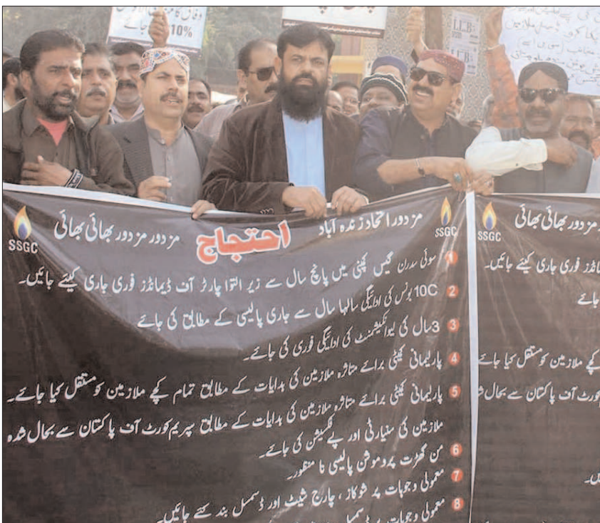
HYDERABAD: Workers of Sui Southern Insaaf Jafa Kush Union Sindh and Balochistan holding a protest rally in favour of their demands.