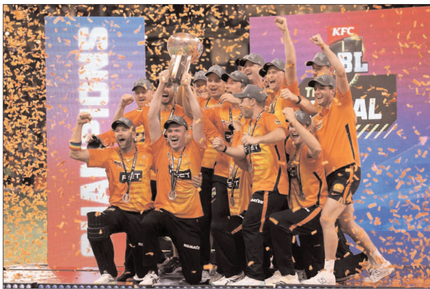
PERTH: Perth Scorchers celebrate their fifth BBL title in 12 seasons.