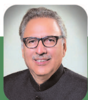
Dr Arif Alvi

#KashmirSolidarityDay #PakistanStandswithKashmir