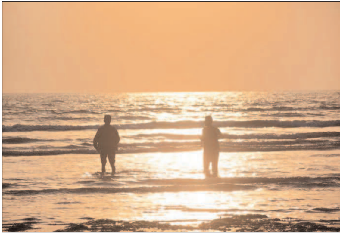
KARACHI: Youngsters enjoying at sea view during sunset.

They tore apart the policemen's uniforms, damaged the government vehicles and also hurled stones at the members of the raiding party. Police had also made seven arrests on the occasion. Police now have registered the case under terrorism clauses of 440, 342, 353, 186, 149, 216 and 506.