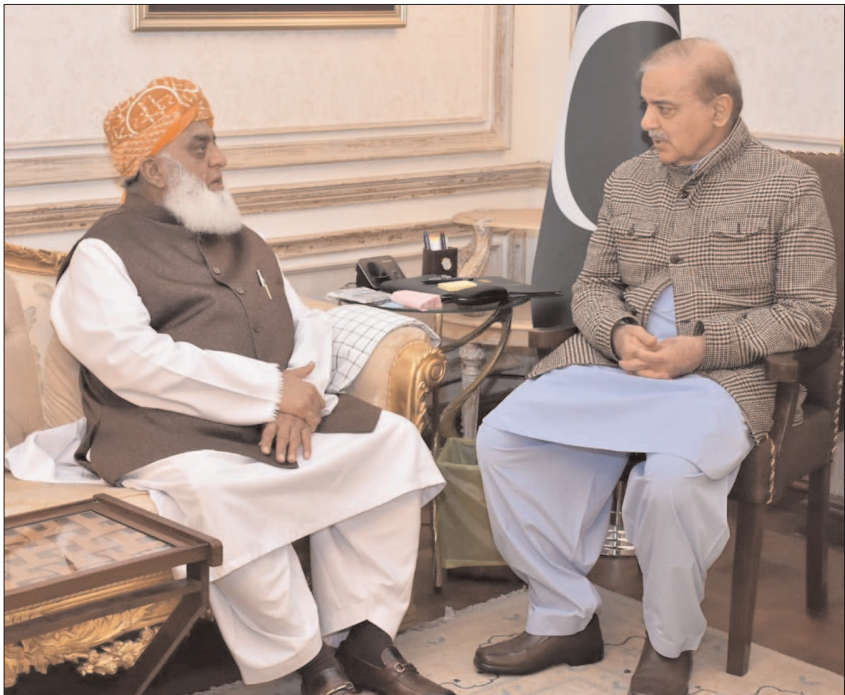
LAHORE: Chief of Jamiat Ulema-e-Islam Maulana Fazlur Rehman called on Prime Minister Shehbaz Sharif. They discussed the overall political situation of the country and other issues of mutual interest.