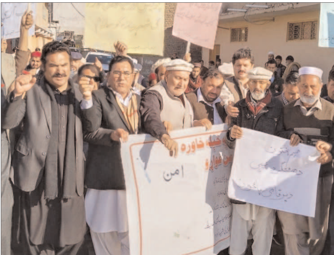
LOWER DIR: Activists of PDM holding a protest rally against Peshawar Police Lines mosque suicide attack.