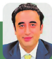
Bilawal Bhutto Zardari

Prime Minister, Islamic Republic of Pakistan