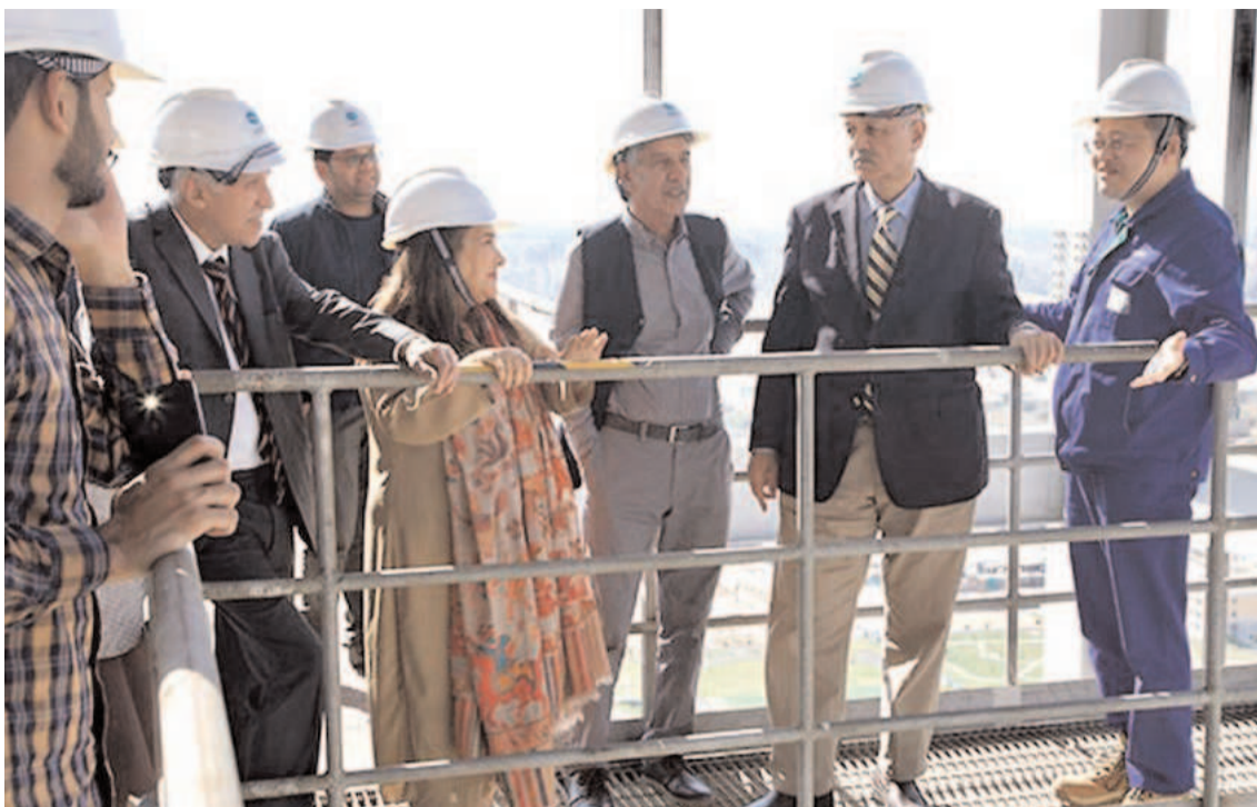
PORT QASIM: Parliamentarians visiting CPEC projects in Sindh organized by Pakistan-China Institute in cooperation with Power in Port Qasim and Shanghai Electric and SECNC.

ability of wheat flour at a fixed price in the province, said an official of the Balochistan government. The government would take stern action against vendors and hoarders’ self-imposed increase of prices of wheat flour and other essential commodities. The chief minister has directed the authorities concerned to ensure the provision of flour items at fixed price and the deputy commissioners should take action against those who were selling flour at high prices and impose fines on them. The district authorities conducted raids in various areas of the province and recovered thousands of flour bags. The raiding party sealed many godowns and arrested their owners for hoarding.