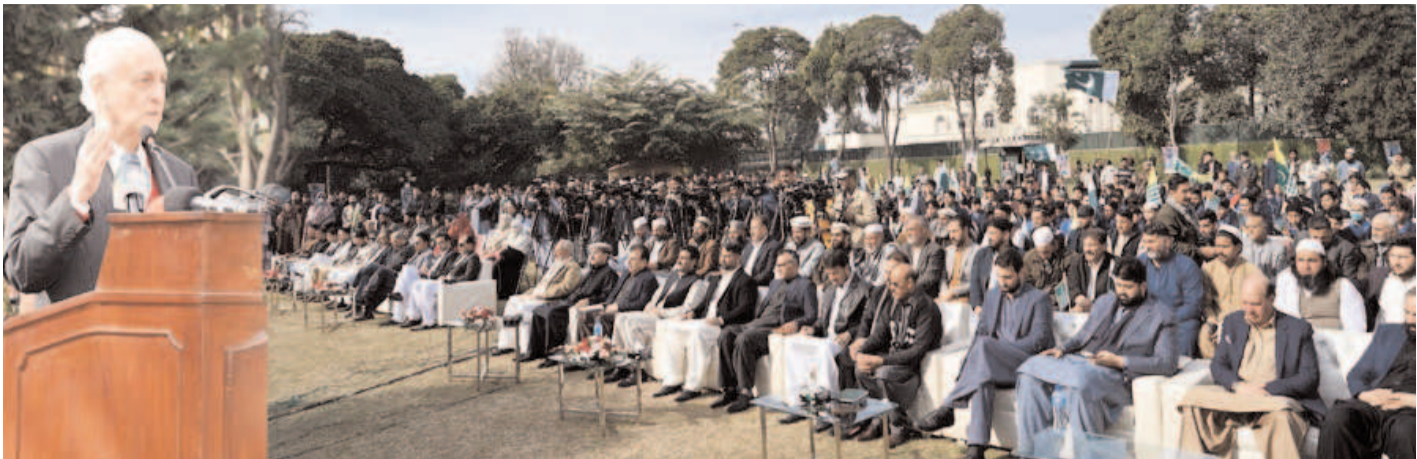
PESHAWAR: Care-taker Chief Minister Khyber Pakhtunkhwa Muhammad Azam Khan addressing an event organized to mark Kashmir Solidarity Day.