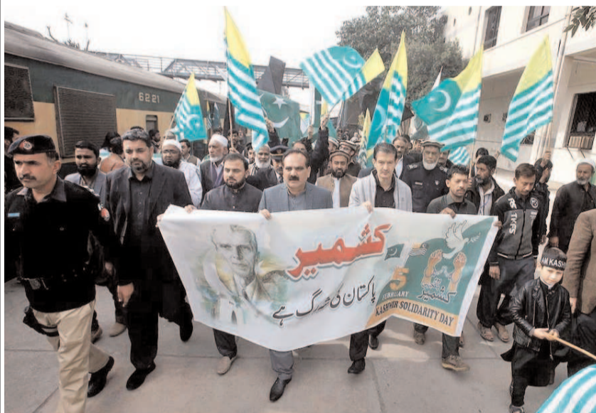
PESHAWAR: Pakistan Railway officials held a rally to show solidarity with people of Kashmir observing Kashmir Solidarity Day.

PESHAWAR (APP): Khyber Pakhtunkhwa Governor Haji Ghulam Ali, Caretaker Chief Minister Muhammad Azam Khan and Advisor to Prime Minister on Political Affairs Engr Ameer Muqam have expressed their heartfelt sorrow and grief over the death of former president General (Retd) Pervez Musharraf. In a separate condolence message, issued here on Sunday, they prayed to Allah Almighty to rest the departed soul in rest and to grant patience to the bereaved family to bear this irreparable loss with fortitude. They lauded the services of Musharraf and said that he was a brave leader.