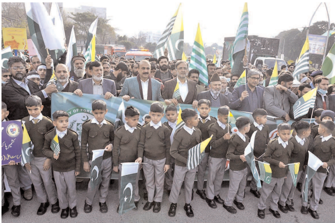
ISLAMABAD: Advisor to the Prime Minister on Kashmir Affairs and Gilgit-Baltistan, Qamar Zaman Kaira participating Walk on occasion of Kashmir Solidarity Day from Foreign Office to Constitution Avenue.

ISLAMABAD (APP): World Pulses Day will be marked on February 10 across the globe including Pakistan to recognize the significance and nutritional benefits of pulses (also known as "legumes") pulses are not only nutritional, they can also contribute to the development of sustainable food systems towards eradicating world hunger and poverty. According to the UN, this is an effective strategy for achieving its 2030 Agenda for Sustainable Development, which aims at strengthening global peace and enhancing food security. Pulses--also known as legumes--refer to the edible seeds of pod-bearing plants, such as dry peas, dry beans, lupins, lentils, and chickpeas. While pulses exist in various shapes, varieties, sizes, and colors and remain a large part of dishes from across the world, the most popular and widely-consumed types of pulses are dried beans, peas, and lentils. By definition, pulses strictly comprise dried seeds of leguminous plants cultivated for food and exclude vegetable crops harvested while still green. Their seeds are loaded with essential nutrients such as fiber, protein, vitamins, and minerals, making them important and healthy superfoods.