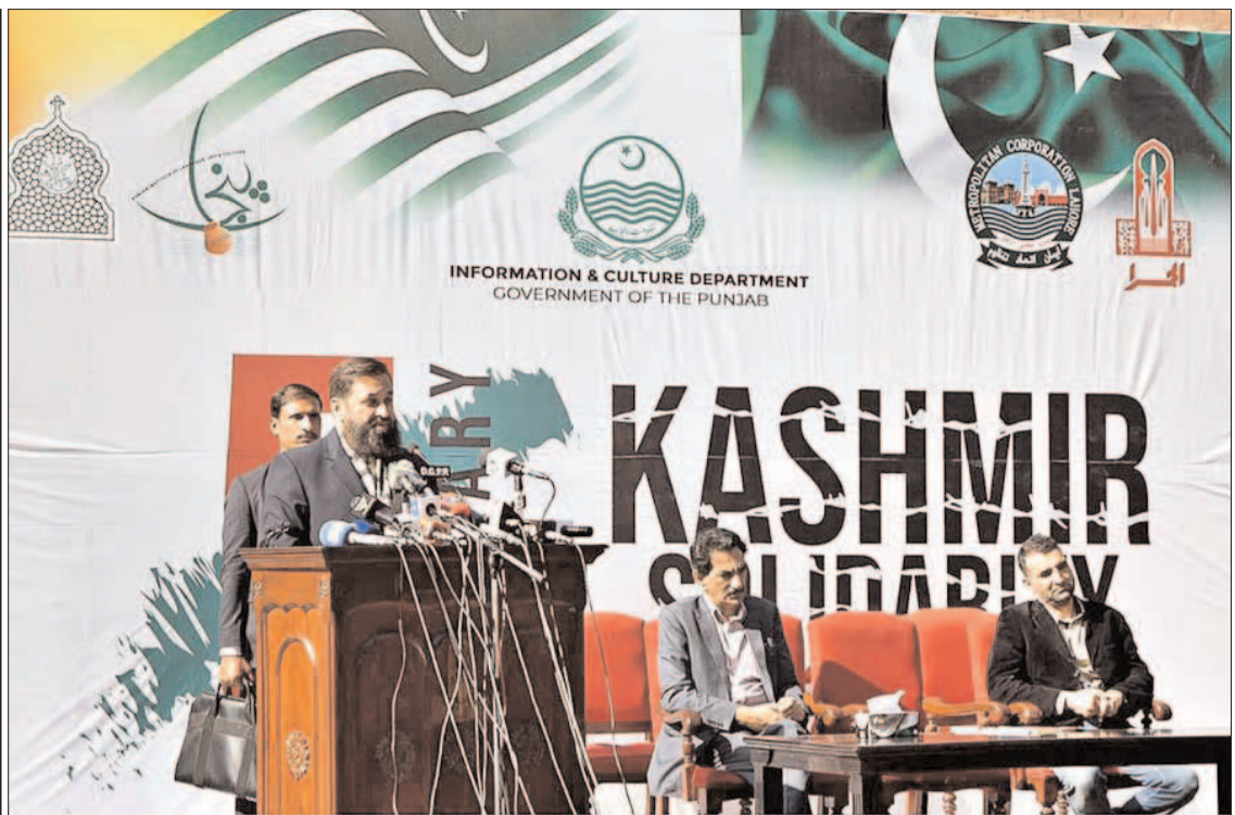
LAHORE: Governor Punjab Muhammad Baligh ur Rehman addressing the ceremony on the occasion of Kashmir Solidarity Day.