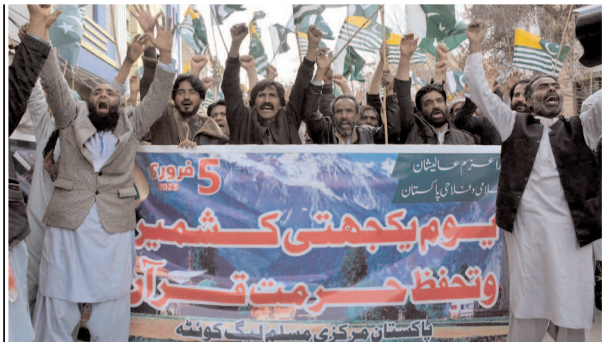
QUETTA: Workers of Pakistan Central Muslim League Quetta chanting slogans during a protest rally on occasion of Kashmir Solidarity Day.

According to the neighbours, the family belonged to Khyber Pakhtunkhwa and shifted Hazro a few days ago.