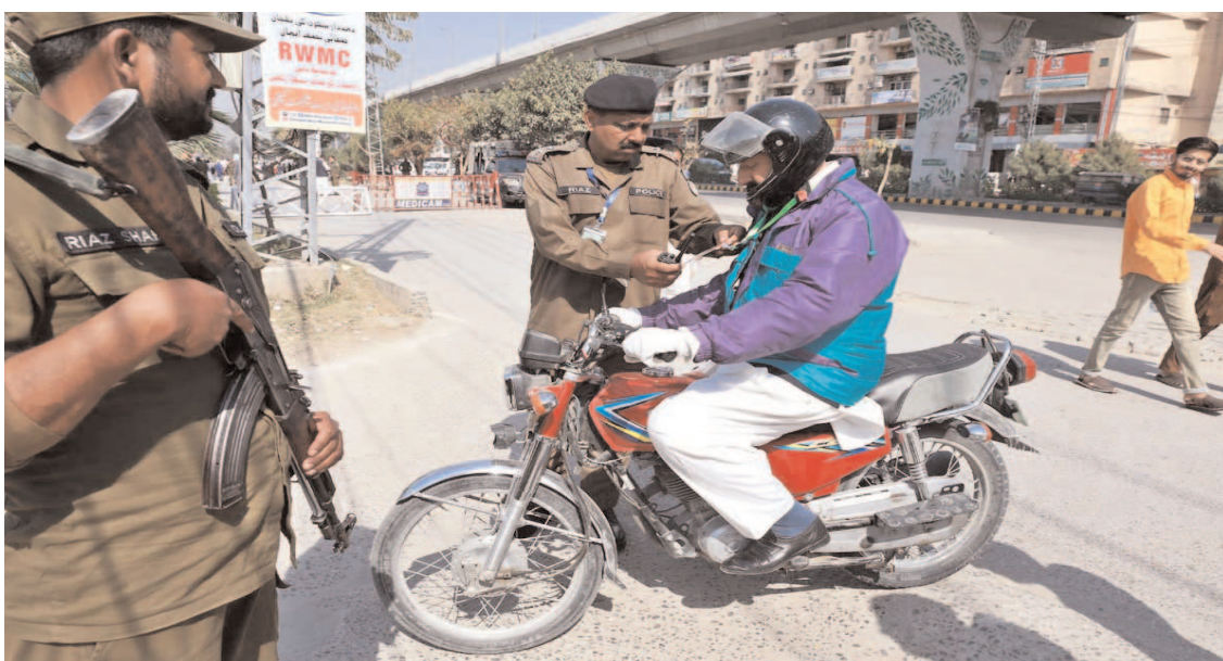
RAWALPIND: Security personnel stand high alert outside Rawalpindi Cricket Stadium during a cricket match of Pakistan Super League.

Besides, these symptoms there can be itching on the skin, he added.