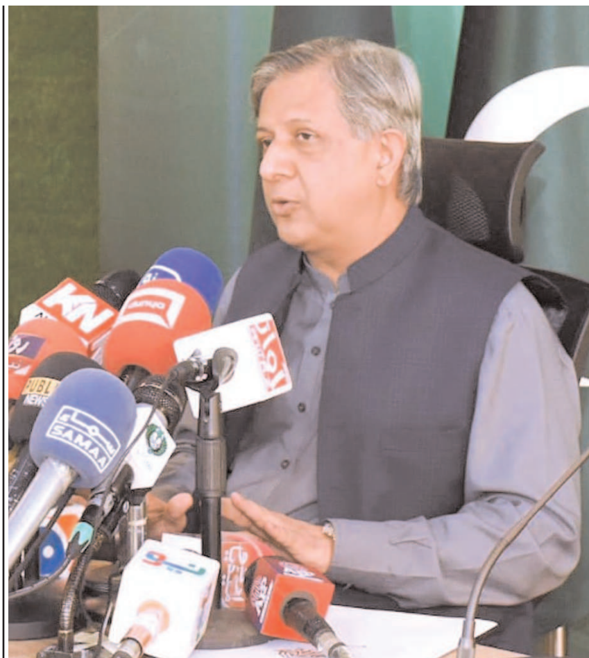
ISLAMABAD: Federal Minister for Law and Justice Senator Azam Nazeer Tarar addressing a press conference.

The successful implementation of the five priority interventions, she added, was expected to make a substantial contribution to improving air quality, reducing emissions by 81% in 2040 compared to the baseline scenario and by 70% compared to 2020 levels.