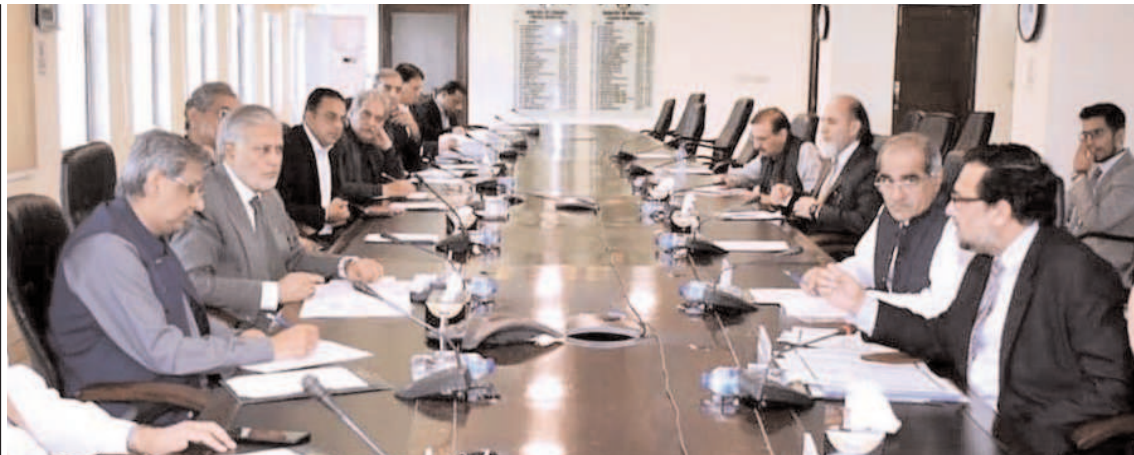
ISLAMABAD: Federal Minister for Finance and Revenue Senator Mohammad Ishaq Dar chairs a meeting on Civil Aviation Sector issues at Finance Division.

Gold prices decline by Rs 200 to Rs 197,500 per tola The per tola price of 24 karat gold decreased by Rs 200 and was sold at Rs195,400 on Friday against its sale at Rs 197,400 the previous day, All Sindh Sarafa Jewellers Association reported. The price of 10 grams of 24 karat gold also decreased by Rs.172 to Rs.169,324 from Rs.169,496, whereas the price of 10 grams 22 karat gold went down to Rs.155,214 from Rs. 155,371 respectively. The price of per tola and ten-gram silver remained unchanged at Rs2,120 and Rs.1,817.55 respectively. The price of gold in the international market increased by US$15 to $1,834 against its sale at $1,819, the association reported.