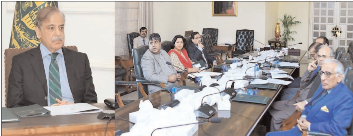
LAHORE: Prime Minister Shehbaz Sharif chairing a meeting to review relief activities for earthquake victims of Turkiye and Syria by Pakistan.

RAWALPINDI: Security forces killed five terrorists during separate intelligence-based operations (IBOs) in North and South Waziristan, the military's media wing said Friday. In a statement, Inter-Services Public Relations (ISPR) said that the terrorists were killed after an "intense fire exchange" between them and the security forces.