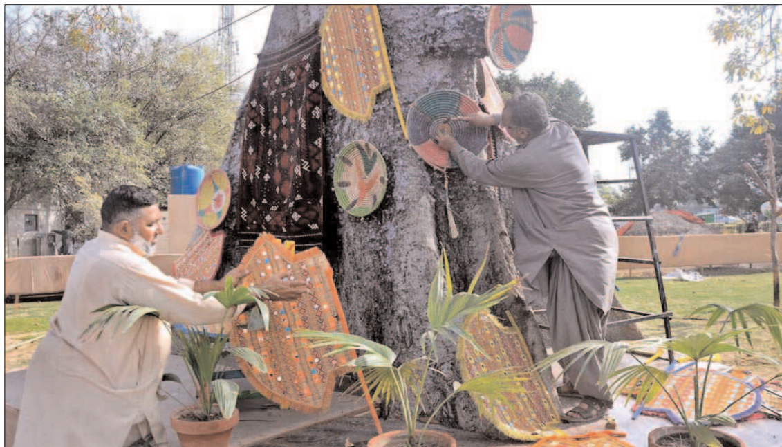
LAHORE: A person displays a stall at Jilani Park organized by PHA is preparing items to attract customers during Jashan Baharan Festival.