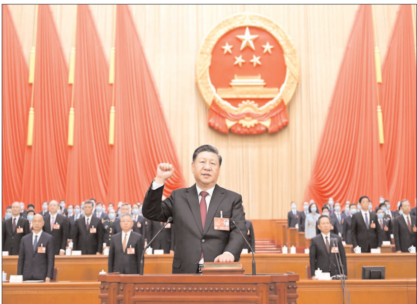
BEIJING: President and Chairman Central Military Commission Republic of China Xi Jinping took oath of loyalty with Constitution after re-election for the third time.