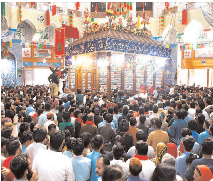
SEHWAN: A large number of devotees attending 771st Urs celebration at shrine of Hazrat Lal Shahbaz Qalandar.

To a question, the SAPM said that the PML-N was ready for the elections; however, it wanted level playing field for everyone by ensuring rule of law.