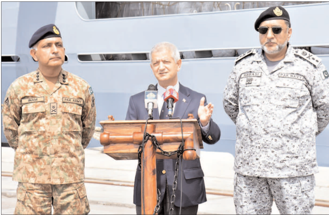
KARACHI: Consul General of Türkiye addressing the media at the sending off ceremony of NDMA relief consignment.