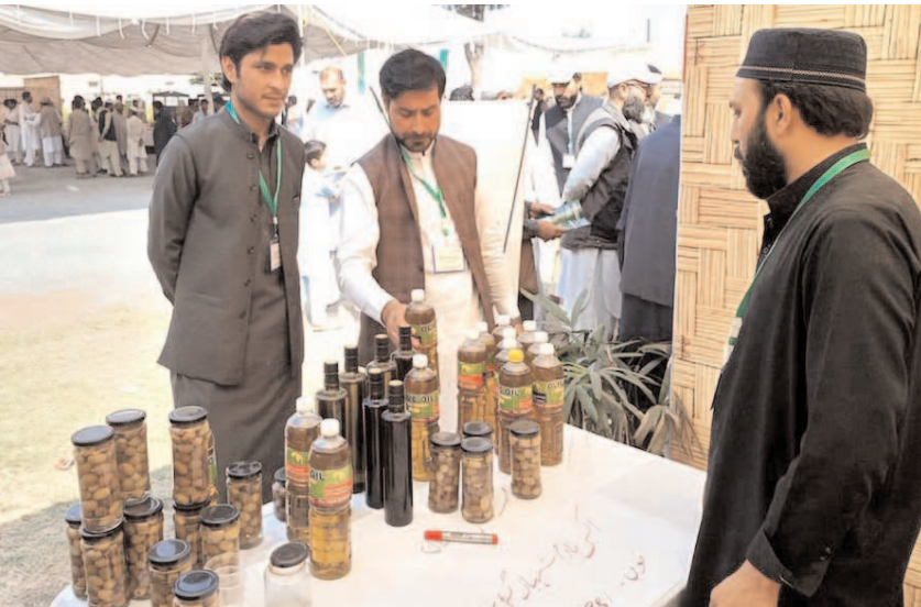
PESHAWAR: Visitors take interest in Olive Gala at Agriculture Research Institute.

The success of the event was a testament to the potential of the olive industry in Pakistan. Its continued growth promises to contribute significantly to the country's economy and promote socio-economic development, employment opportunities, and poverty reduction.