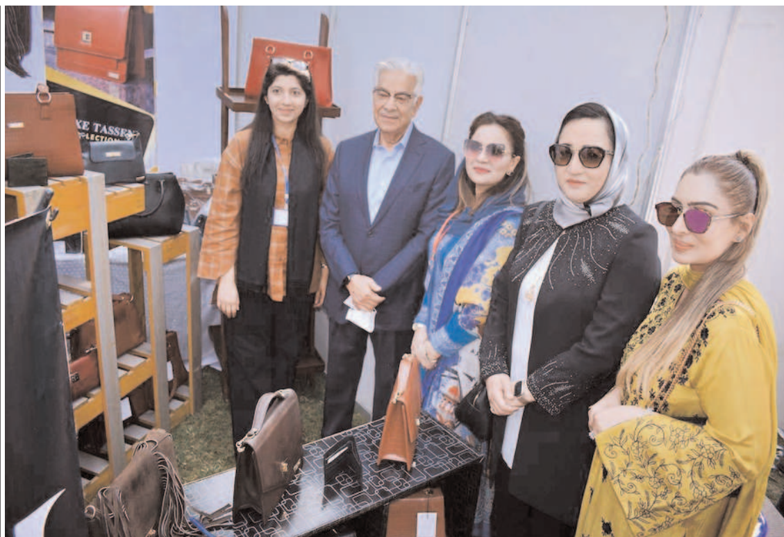
SIALKOT: Federal Minister for Defence Khawaja Muhammad Asif visiting different stalls at exhibition.

The Federal Minister also assured that Federal and Provincial governing bodies should be restructured and equal representation will be given to members recommended by business representative platforms.