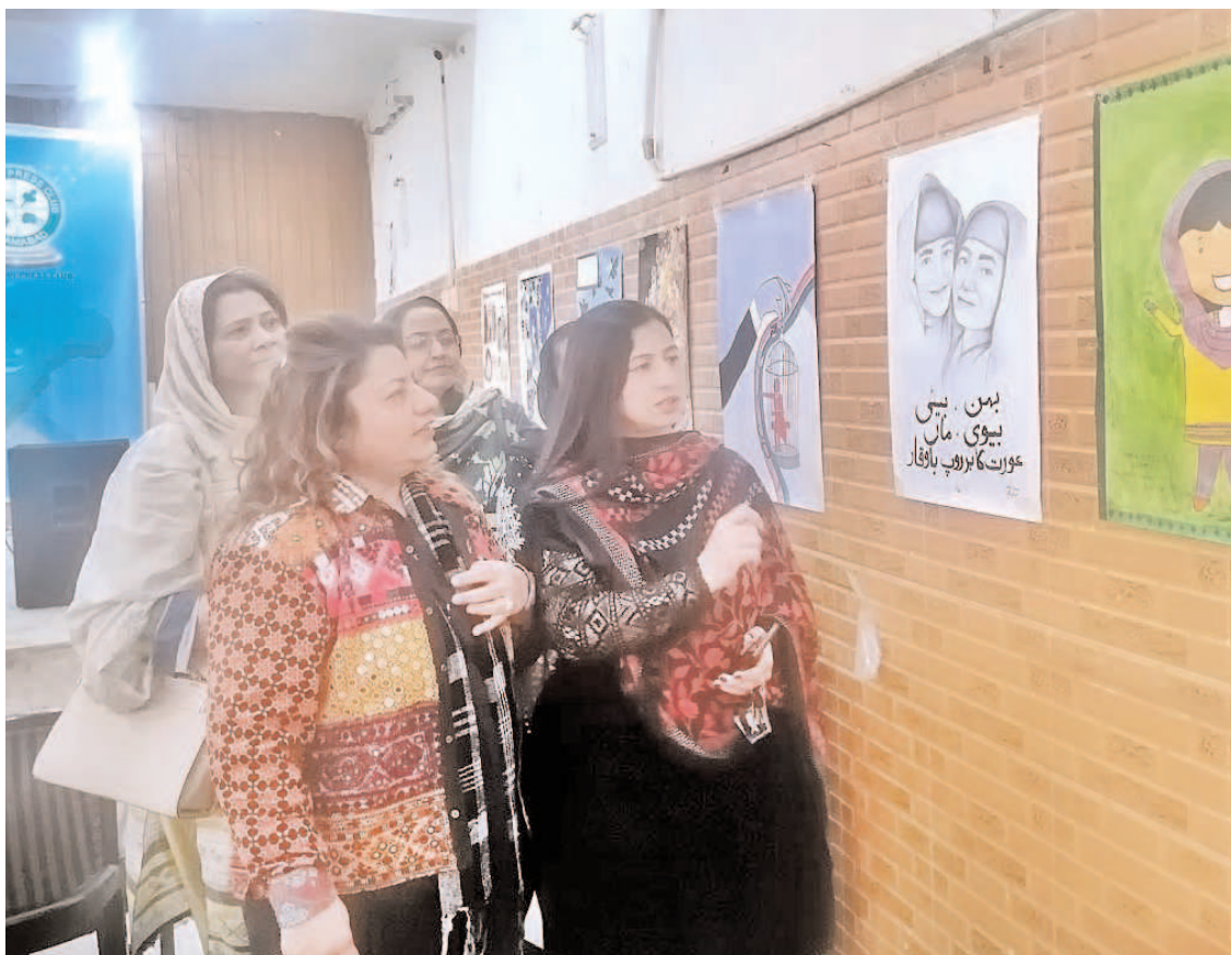
RAWALPINDI: Visitors having a look on the posters themed on Women's Struggle for Social Change, displayed at Rawalpindi Press Club by Devcom-Pakistan in connection with Int'l Women's Day.