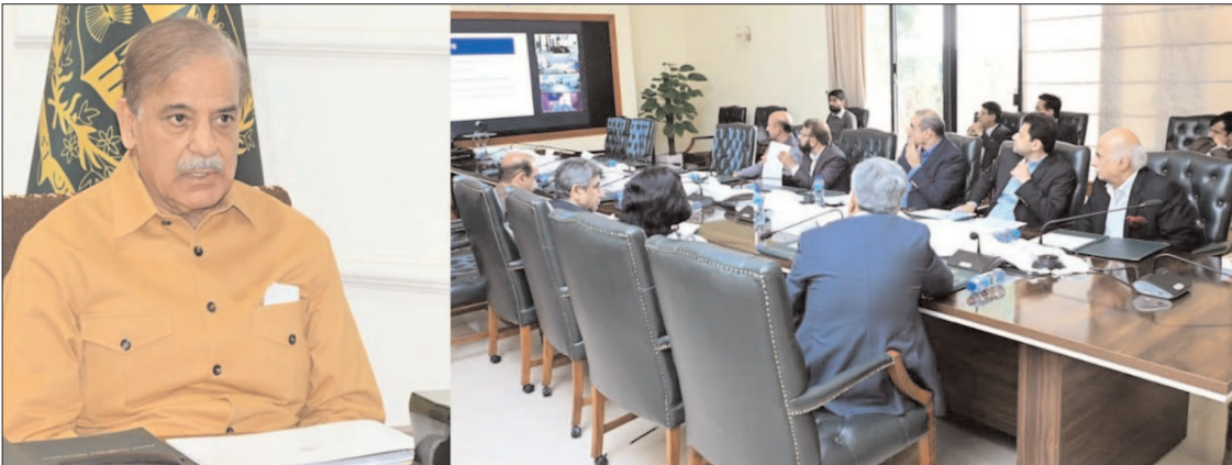
LAHORE: Prime Minister Shehbaz Sharif chairing a meeting on Agriculture Task Force.