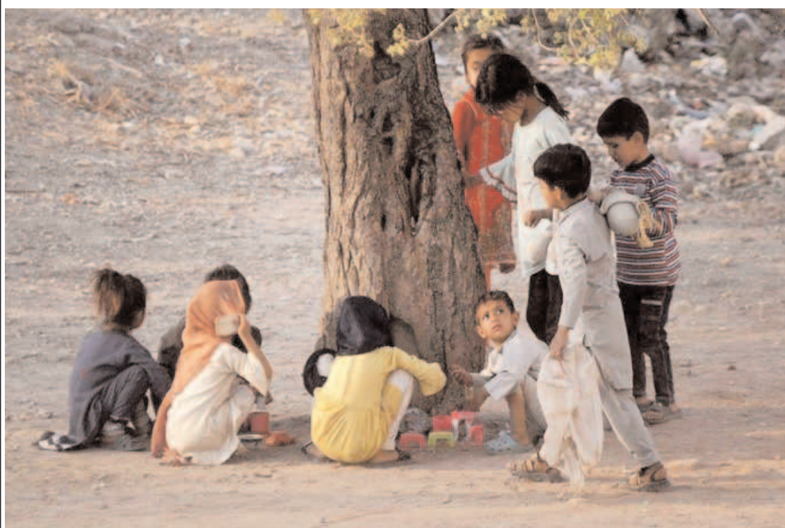
ISLAMABAD: Children playing under the tree at Federal Capital.

Unprecedented rains last year have played havoc across most of the country, resulting in loss of precious lives and massive destruction all around. Dealing with a calamity of such immense magnitude, through emergency relief operations is a challenge difficult to imagine; attending to post-flood damages, innumerable displaced families, prevention of related diseases and so on, is a gigantic task that will require huge resources as well as collective efforts by one and all, and a considerable amount of time.