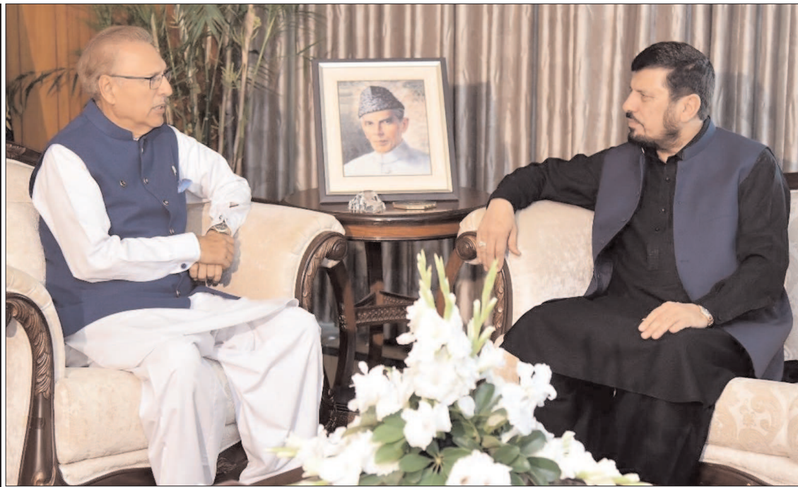
ISLAMABAD: Governor of Khyber Pakhtunkhwa, Haji Ghulam Ali, called on President Dr. Arif Alvi, at Aiwan-e-Sadr.