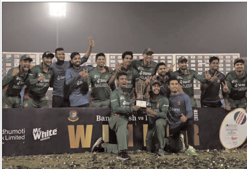
DHAKA: Bangladesh players celebrate with the winners trophy after the third and last T20 cricket match between Bangladesh and England.