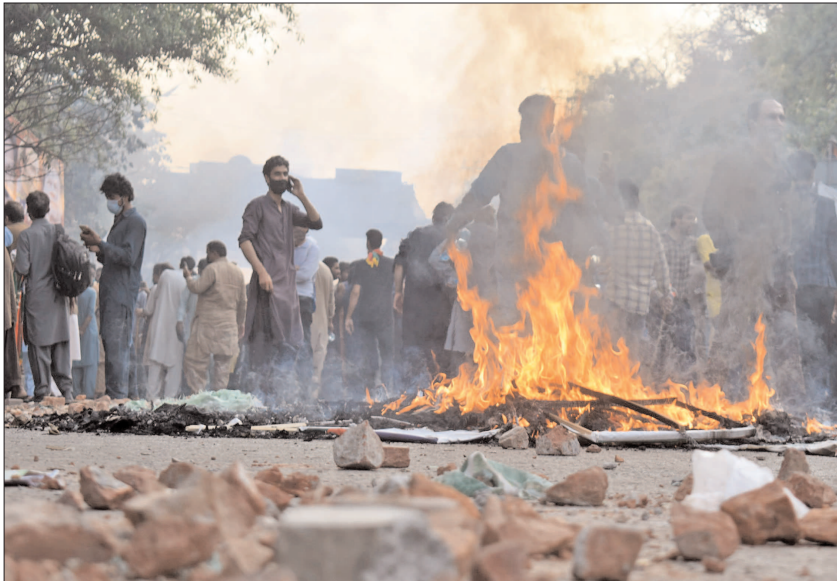
LAHORE: Workers of PTI burning various items as they blocked the road outside Imran Khan's residence to prevent police from arresting their leader.

LAHORE: Protests broke out in major cities on Tuesday at the call of PTI Chairman Imran Khan as police and party workers continued to clash outside his Zaman Park residence in Lahore.