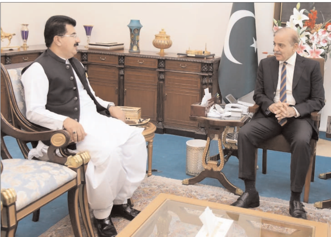
ISLAMABAD: Chairman Senate Sadiq Sanjrani called on Prime Minister Shehbaz Sharif.