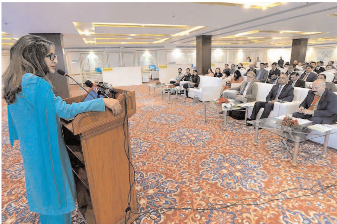
ISLAMABAD: Federal Minister for Climate Change Sherry Rehman addressing the National Level Simulation Exercise inaugural session.