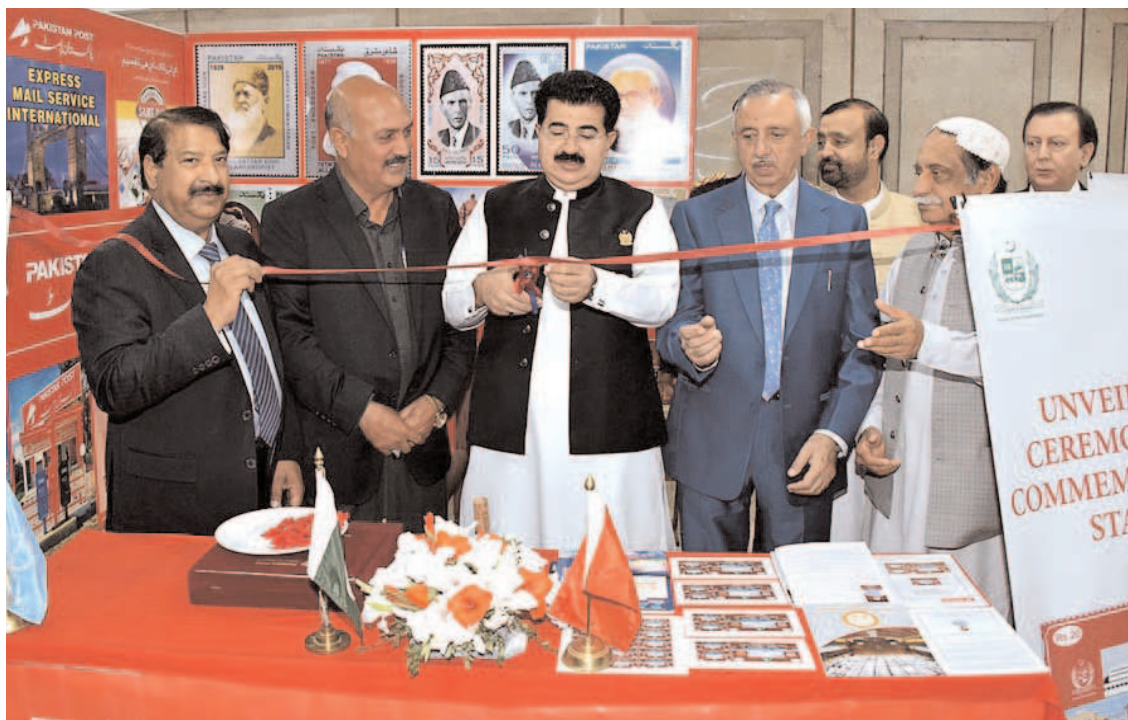
ISLAMABAD: Chairman Senate, Muhammad Sadiq Sanjrani inaugurating the unveiling ceremony of the Commemorative Stamp issued on the Golden Jubilee celebrations of the Senate of Pakistan at Parliament House.

ANF North recovered 141.677 kg drugs in 10 operations, arrested 13 persons including a woman in drugs smuggling and impounded four vehicles. The seized drugs comprised 63.6 kg Opium, 0.532 kg Heroin, 76.900 kg Hashish, 305 grams methamphetamine (Ice), eight grams cocaine, eight grams caffeine, 242 grams weed, 82 grams ecstasy tabs (140 tablets). All cases have been registered at respective ANF Police Stations under CNS Act and further investigations are under process.