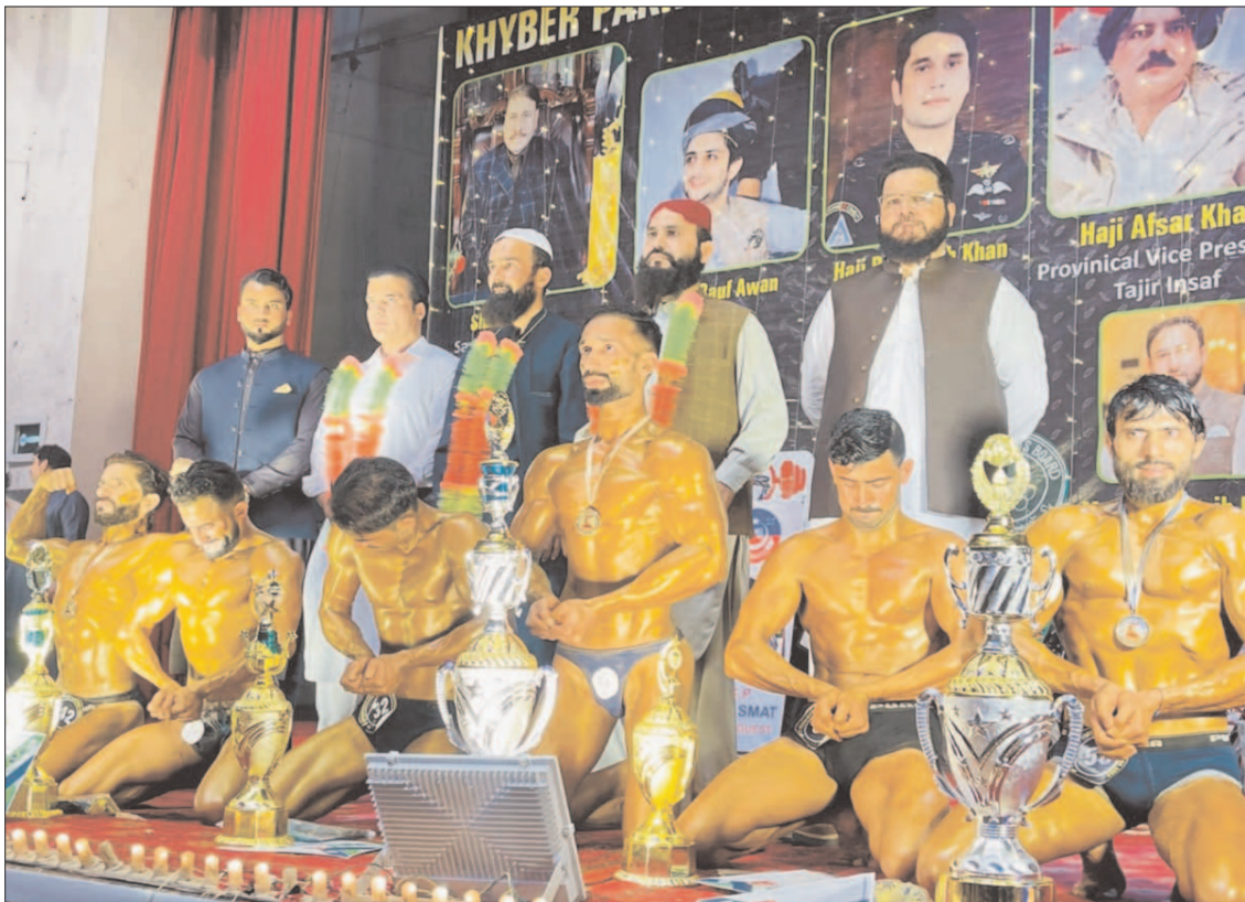
PESHAWAR: A group photo of Junior and Mr Peshawar 2023 winners of class and position holders with guests.

The 'Rawalpindi Express' is hard to derail, despite several injuries over the last few years, it has not stopped him from charging at full speed towards the batter. "Unfortunately I injured myself while diving yesterday and twisted my knee. If I was not injured, I would have definitely bowled my four overs and try to add value to the team. But last year I made sure that I play every game and bowl four overs. It's about how much can I participate and make it big for this league. I am just a little contributor to make this league better and enhance the value of my team." Shoaib etched his name in cricketing history by becoming the first player to shatter the elusive 100-mile barrier.