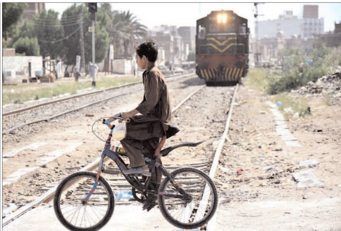
HYDERABAD: A cyclist crossing rail track as train approaching on the same track may cause any mishap, needs attention of authorities concerned.