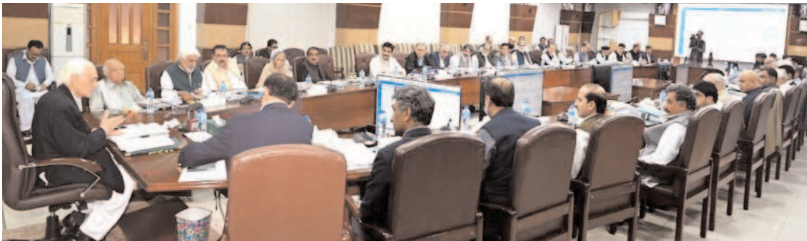
PESHAWAR: Caretaker Chief Minister Khyber Pakhtunkhwa Muhammad Azam Khan chairing 2nd meeting of Provincial Caretaker Cabinet.