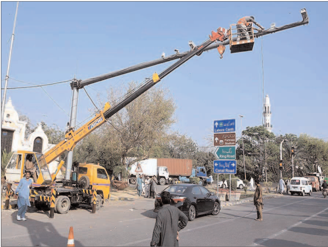
LAHORE: Punjab Safe Cities Authority (PSCA) staffer busy in repairing the security cameras at Mall Road.