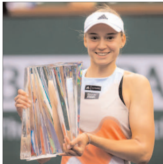
Rybakina poses with the champions trophy after defeating Sabalenka in the womens singles final

Rybakina, who beat defending champion and world number one Iga Swiatek in the semi-finals, needed six set points - four of which were on her