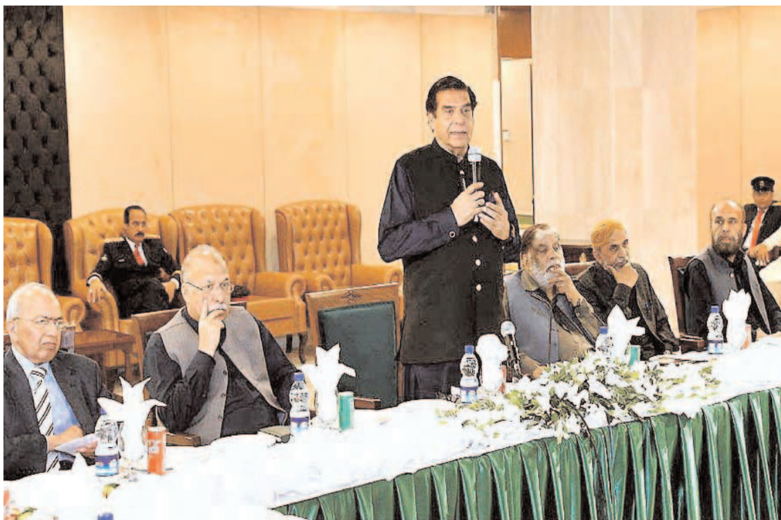
ISLAMABAD: Speaker National Assembly Raja Pervaiz Ashraf addressing the Senior Journalists & Anchorpersons of Pakistan Federal Union of Journalists at Parliament House.

ISLAMABAD (APP): Islamabad Electric Supply Company (IESCO) on Monday issued a power suspension programme for Tuesday for various areas of its region due to necessary maintenance and routine development work. According to IESCO Spokesman, the power supply of different feeders and grid stations would remain suspended for the period from 09:00 AM to 02:00 PM, Islamabad Circle, Navy-I, Navy-II, Anguri, Shahpur, Shahdara, Mengyal, NIH, Athal, Punjab House, Bri Imam, Q u a i d - e - A z a m University, Khayaban Iqbal, Peer Suhawah, SCP, Mandala Feeders, Rawalpindi City Circle, BB Shaheed Hospital, Khanna Road, Gulazar Quaid, Airport, Gangal Feeder, Rawalpindi Cantt Circle, Islamabad Feed Mill, Jhata Hatial, Pind Jatla, Lab-II, Lab-I, Reliance Weaving Mill, Bhal, Jarrar Camp, Swan Garden-I, Swan Garden-II, River Garden, FECHS, SPD-II, PAF, RIC, Gracy Line, Rahmatabad-I, Jehangir Road Feeders, Attock Circle, Taxila-II, Taxila-I, Sher Shah Suri Feeders, Jhelum Circle, Shah Safer Feeder, Chakwal Circle, Sagarpur, Abdullahpur, CWO, Jalalpur, Sharif, Basharat, CS Shah.