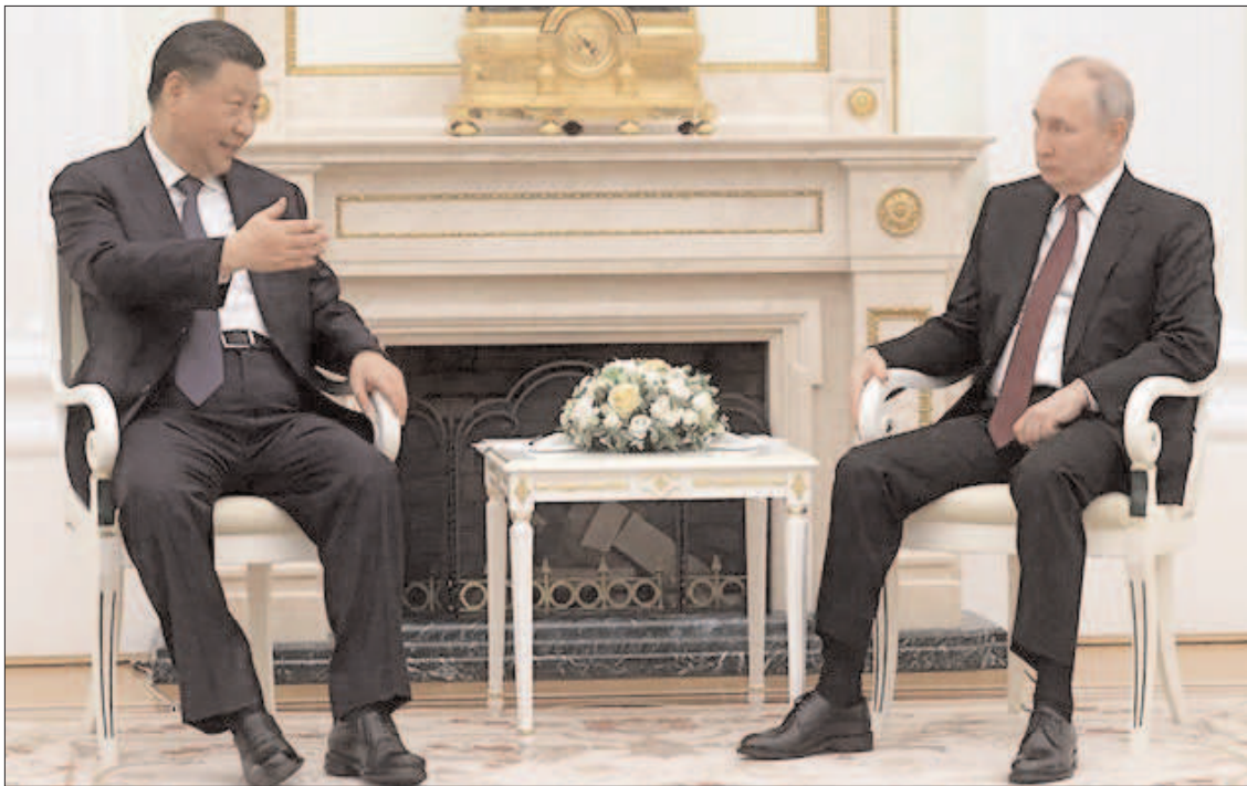
MOSCOW: Chinese President Xi Jinping meeting with Russian President Vladimir Putin at Kremlin.