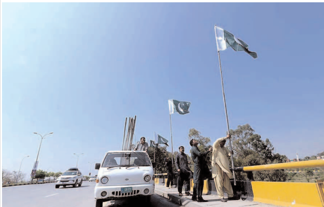
ISLAMABAD: CDA workers fixing national flags on flyover at Srinagar Highway in connection with National Day of Pakistan.

About the concentration on core activities, he said that Pakistan Railways has prepared a business plan in January 2023 to increase its revenue and reduce expenditure through improved governance. The plan is being implemented in letter and spirit. The recent initiatives towards digitization in form of Enterprise Resource Planning (ERP) and Railway Automated Booking and Travel Assistance (RABTA) also aim to increase efficiency and reduced the revenue expenditure gap.