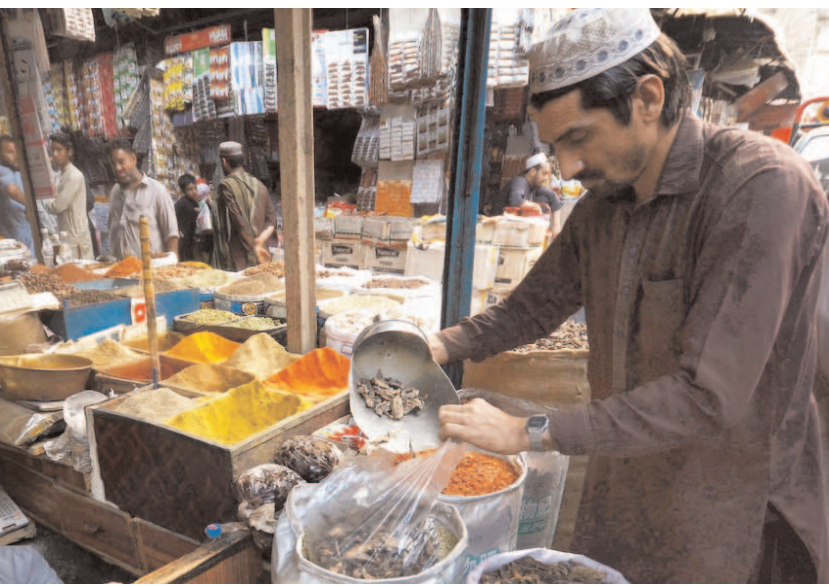
PESHAWAR: People buying spices in Peepal Mandi for upcoming month of Ramazan.