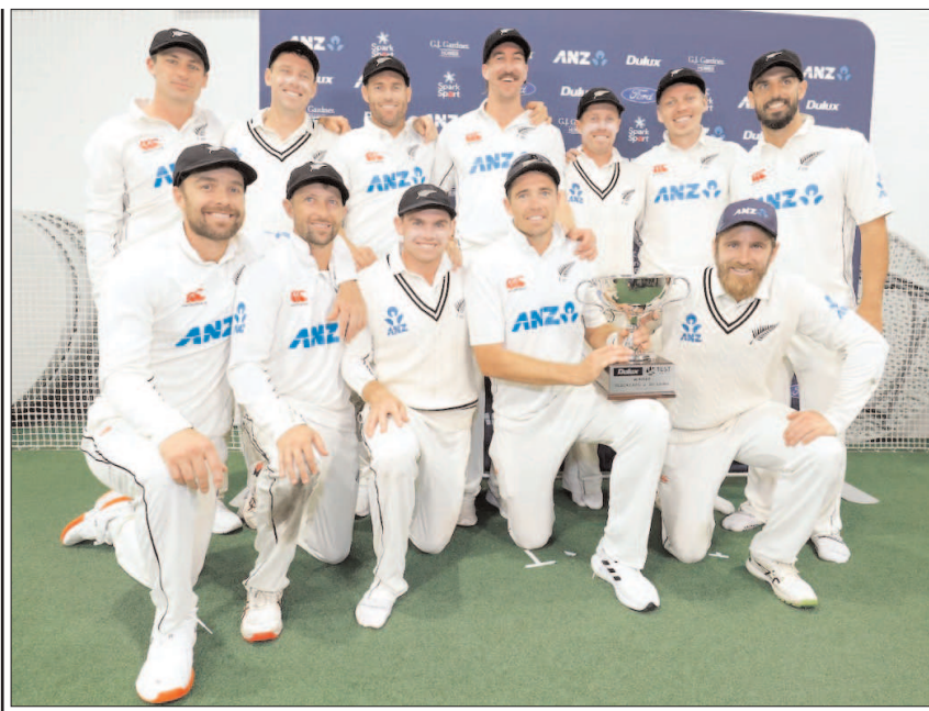
WELLINGTON: New Zealand's players pose with the trophy after completing the series win.