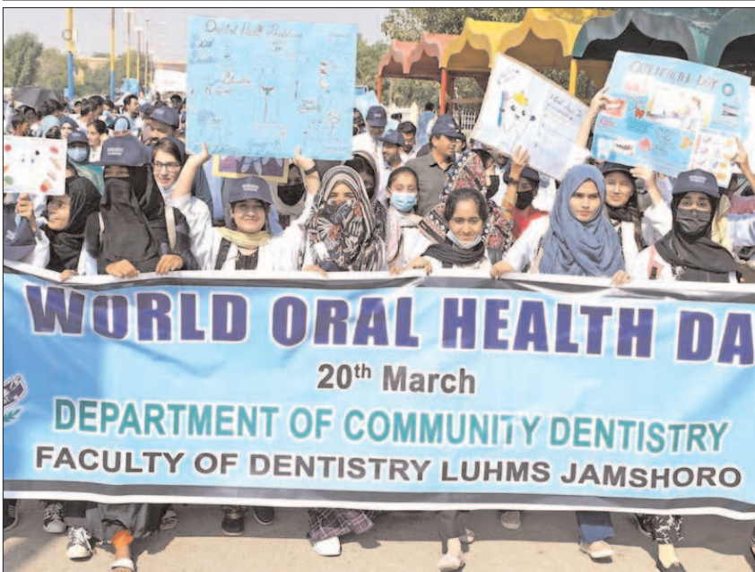
JAMSHORO: Participants are holding awareness walk in connection with World Oral Health Day.