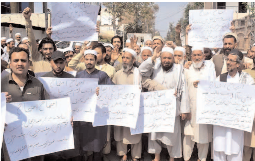
PESHAWAR: Elders of Mohmand district holds placards during a protest rally.

He reiterated this on behalf of all the business community and the Chamber of Commerce across the province and said that all the business community of the province is standing with the Caretaker Minister.